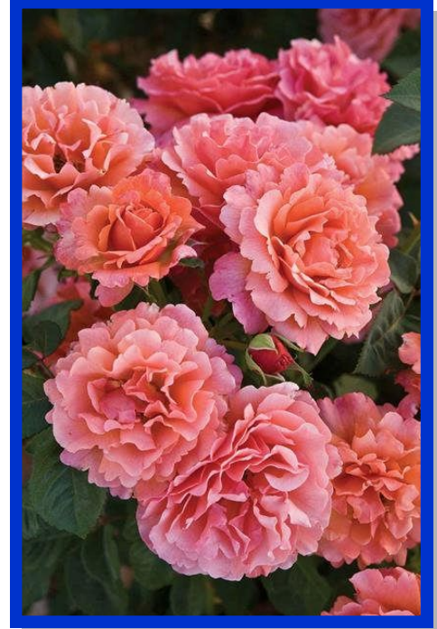
'Easy Does It'

In addition to the ARS 2013 Member's Choice Award, 'Easy Does It' has won many past awards in various rose trials throughout the world and in 2010 was selected as the AARS (All American Rose Selection) winner. You can find more information on 'Easy Does It' at "Help Me Find" Roses: ( http://www.helpmefind.com/gardening/l.php?l=2.58853 ).