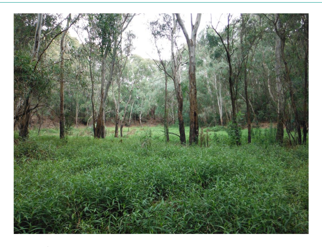
Plate 12 Cover of largely native plants in the billabong during a dry period, Burke Road Billabong Reserve, Kew, January 2018