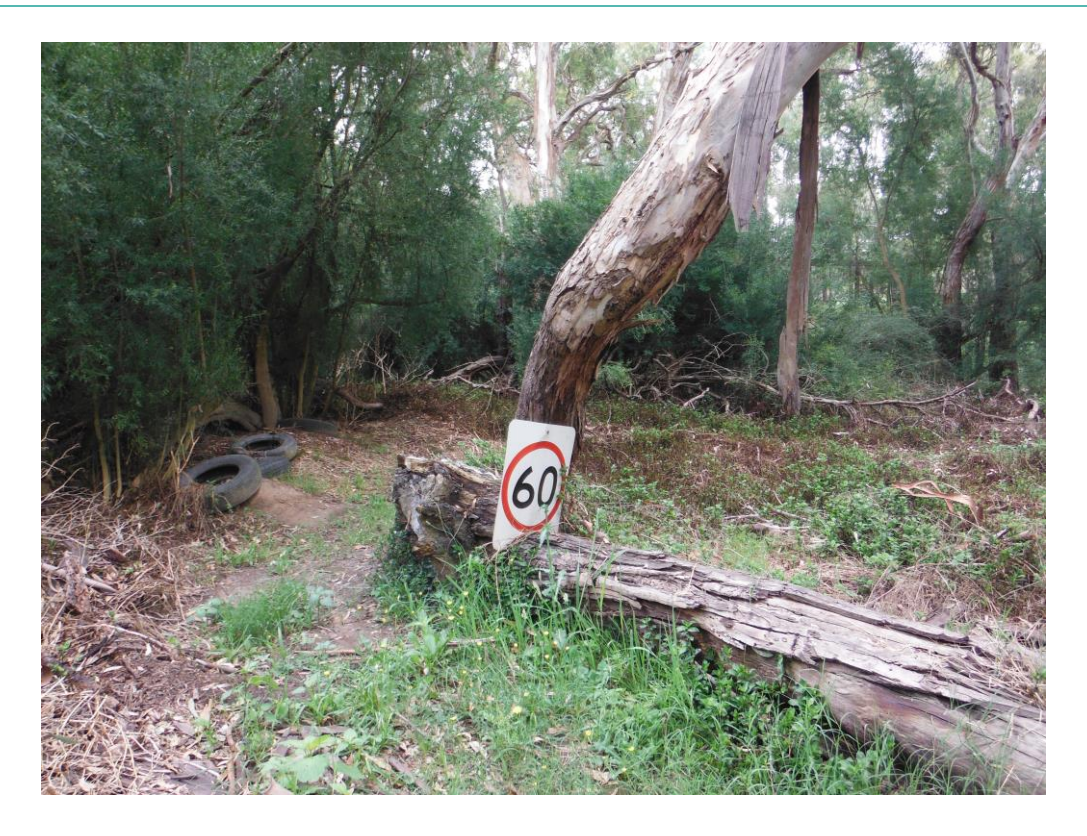
Plate 7 Rubbish dumping, Burke Road Billabong Reserve, Kew, 2018