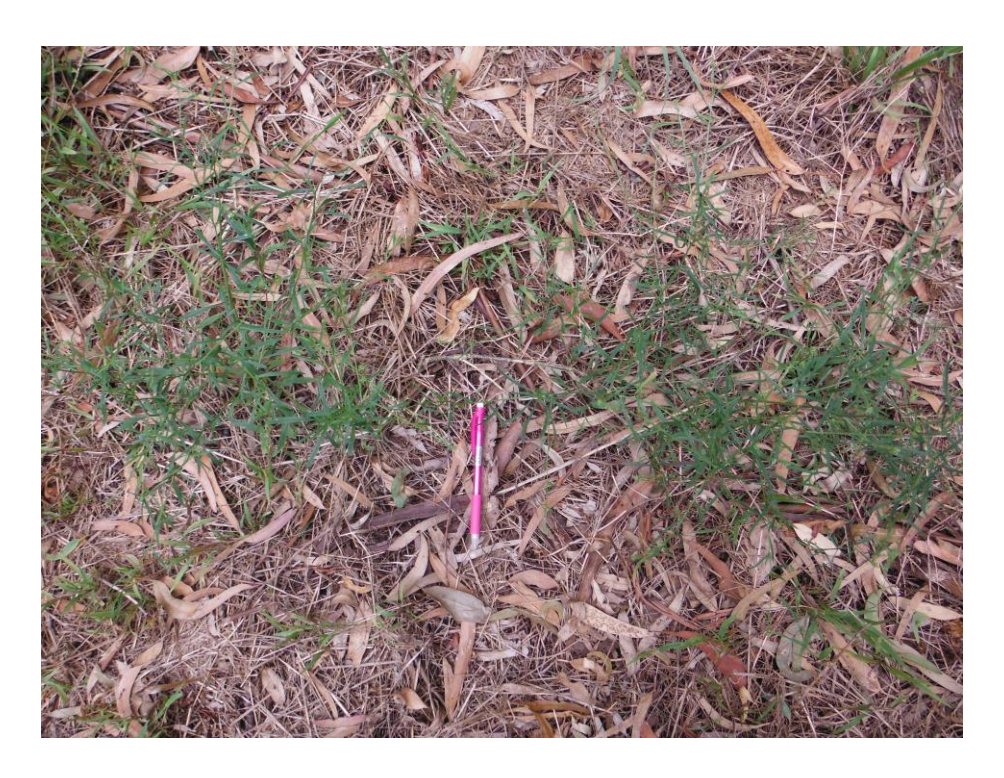
Plate 3 Native Peppercress ( Lepidium pseudohyssopifolium ), classified as 'k' (poorly known) in Victoria (DEPI 2014), Burke Road Billabong Reserve, Kew, January 2018.

Swamp Flax-lily ( Dianella callicarpa ), classified as 'rare' in Victoria (DEPI 2014) was also recorded but is naturalised from plantings and does not occur any further east beyond the west Otways (G. Carr pers. comm.).