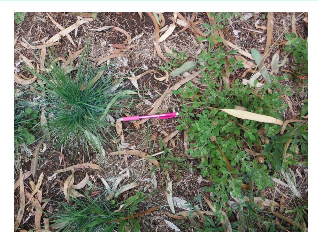
Plate 9 Off target weed spraying of Rytidosperma species sprayed on the left with Galenia (* Galenia pubescens var. pubescens ) not sprayed on the right, Burke Road Billabong Reserve, Kew, 2018