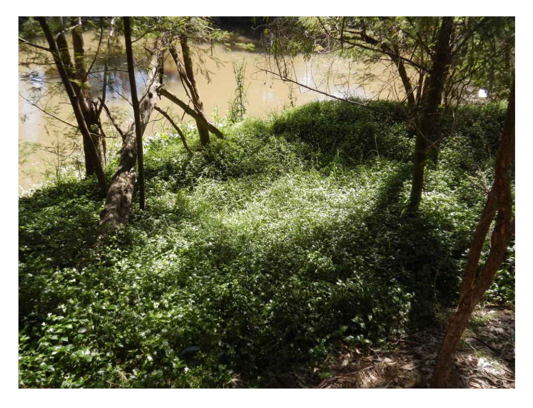
Plate 8 Infestation of Wandering Jew (*Tradescantia fluminensis) on land adjoining Burke Road Billabong Reserve, Kew, 2018