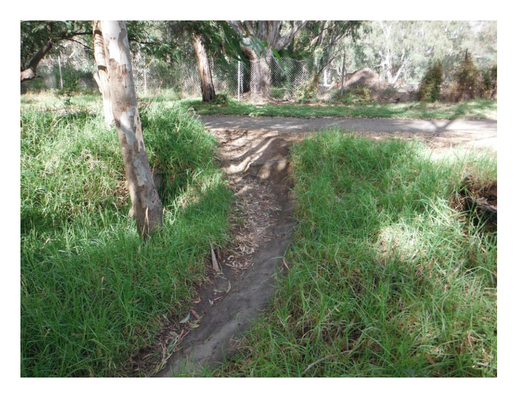
Plate 6 Soil disturbance and vegetation damage from informal bike tracks, Burke Road Billabong Reserve, Kew, 2018