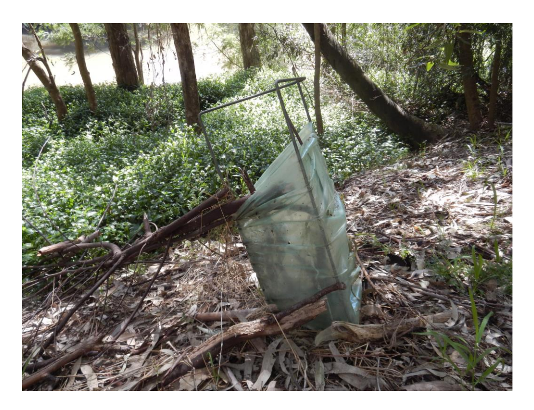
Plate 10 Disused plant guards from revegetation works, Burke Road Billabong Reserve, Kew, 2018