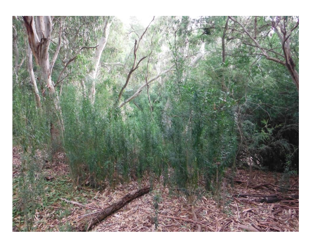
Plate 1 Very high cover and strong recruitment of Tree Violet ( Melicytus dentatus ), Burke Road Billabong Reserve, Kew, January 2018

The vegetation in the study area is characterised by an open woodland/open forest dominated by a canopy of River Red-gums typical of this EVC. The understory is dominated by a very high cover and strong recruitment of Tree Violet ( Melicytus dentatus ) (Plate 1).