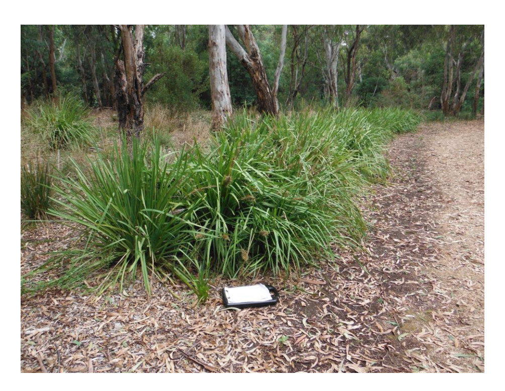
Plate 2 Spiny-headed Mat-rush ( Lomandra longifolia subsp. longifolia ), from New South Wales provenance, planted in Burke Road Billabong Reserve Kew, 2018.

Fifty five planted species were recorded in the revegetation areas, 53 were indigenous and of local provenance (Appendix 1). Some species, although indigenous to Victoria, are not of local provenance (Appendix 1, Plate 2).