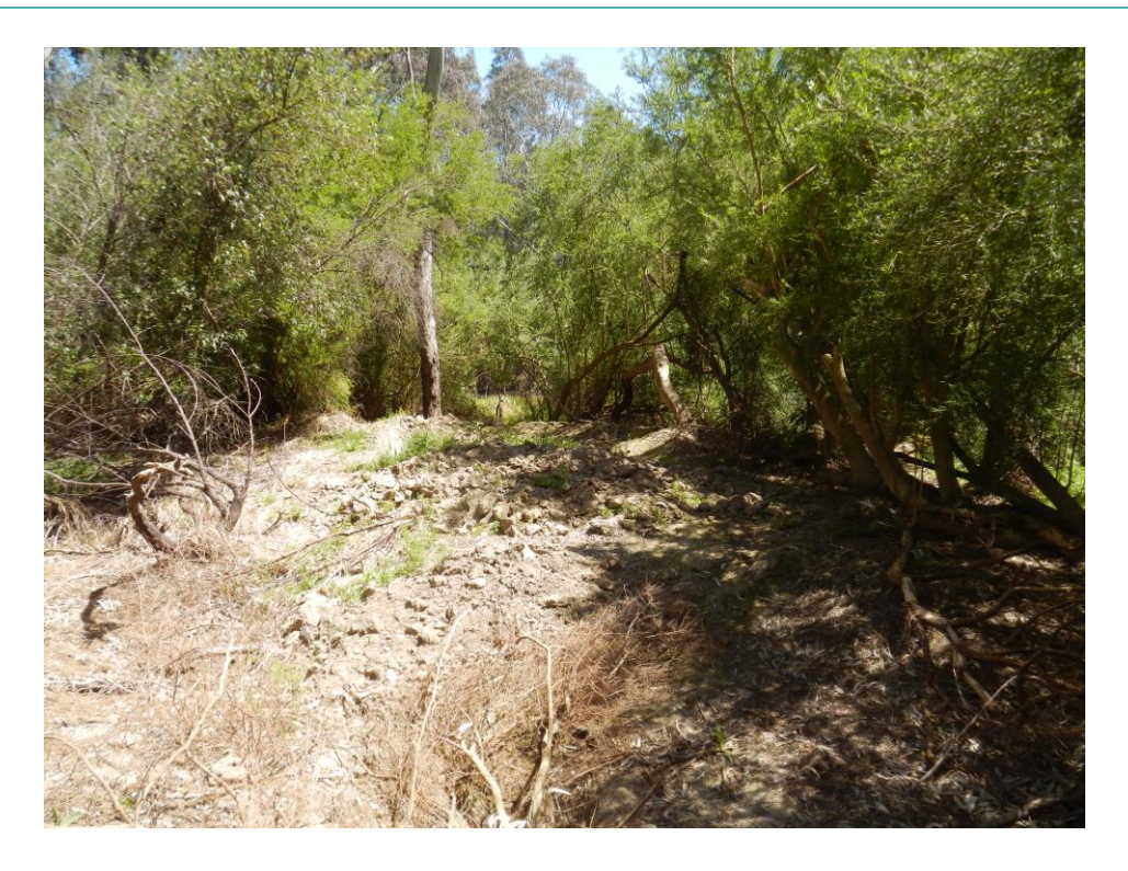
Plate 5 Soil disturbance and vegetation damage from informal bike tracks, Burke Road Billabong Reserve Kew, 2018