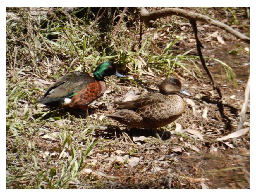
Plate 14 Chestnut Teal (Anas castanea) at Burke Road Billabong Reserve Kew, October 2018

The increase in invertebrate biota may support ecosystem processes by providing food sources for fauna such as birds (Plate 14), reptiles, amphibians. The timing of pumping is likely to be spring when river levels are high enough for pumping (Figure 2). This would match the timing of most of the natural filling episodes (Figure 2) and match and so provide a refuge and food resource for fauna during the breeding season.