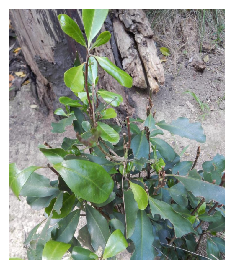
Plate 4 Evidence of deer browsing on Mutton-wood ( Myrsine howittian ), Burke Road Billabong Reserve, Kew, 2018

Off-lead domestic dogs were observed running through the reserve during the survey and dog faeces were seen in native vegetation.