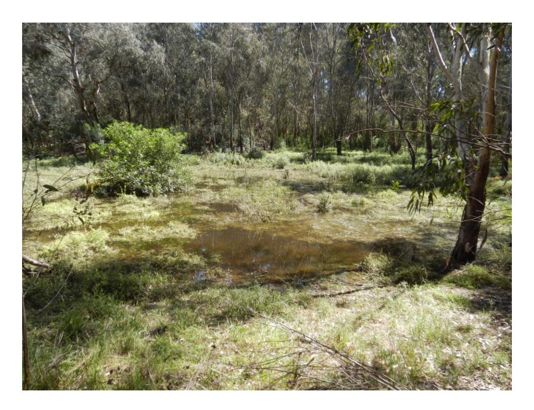
Plate 13 Cover of largely native plants in the billabong when containing water, Burke Road Billabong Reserve, Kew, January 2018