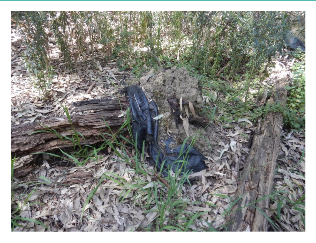
Plate 11 Disused weed matting from revegetation works, Burke Road Billabong Reserve, Kew, 2018