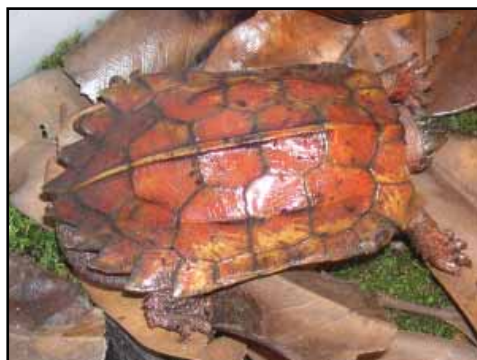
Carapace's colours can change, depending of the geographic range.