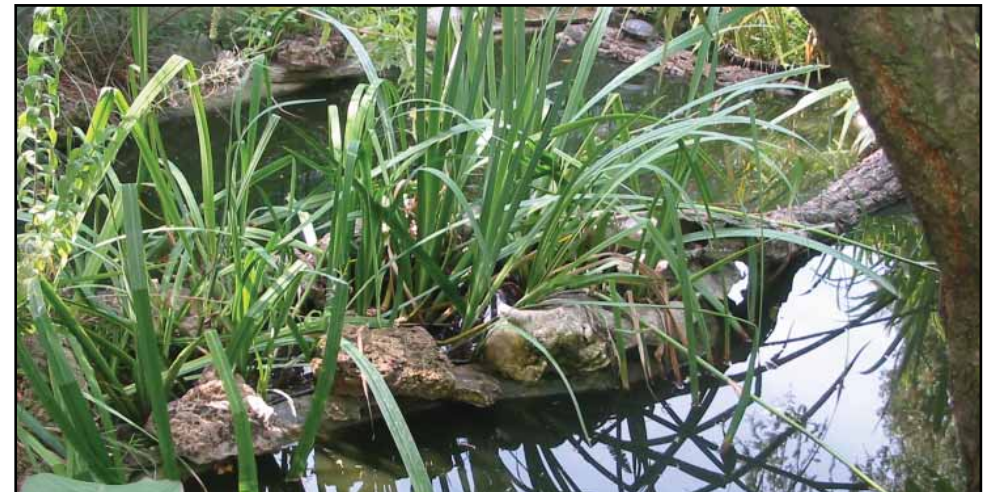
Plants must be plentiful: help to oxygenate and filter the water.

Turtles may coexist with fish and water snails, in order to create a natural habitat and supply them with fresh food.