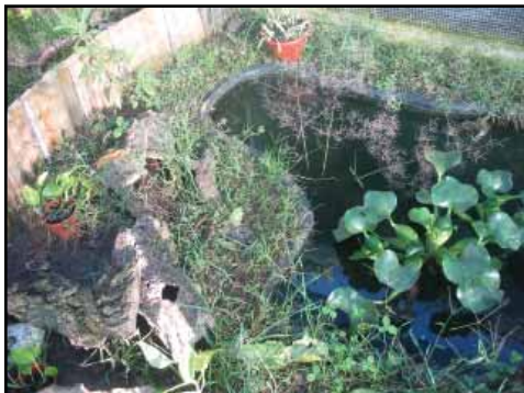
Plastic pond is a cheap solution.

A peaceful and sunny zone with many shadowy parts for our outdoor pond accommodation is suitable. For its construction you can use preformed PVC pools, cement and nylon sheets of various size. Every material represents positive and negative aspects. Cement has no limits of shape and size, and allows you to easily attach a plastic pipe for drainage in the direction you wish. At the same time it's very expensive. During excavation you must consider a 10 cm of cement gravel waterproof with specific products. You can also plan shelves, bends for aquatic and pond plants and gradual banks. When the bottom becomes hard