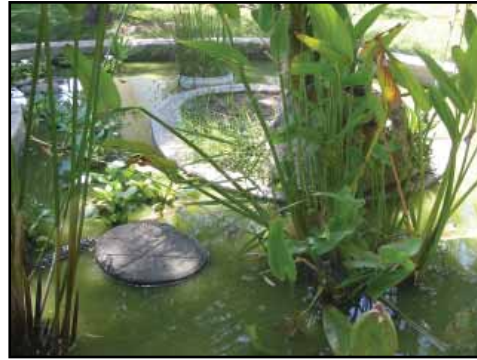
Turtles can easily lay eggs in a sandy zone.

Many aquatic species, especially coming from mild climates, can be kept in an outdoor pond. Depending on the species, specimens can even live in the pond the whole year, or from springtime until the end of summer.