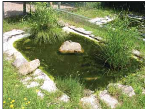
Concrete allows to create different shapes.

you can use a metal grating to fix cement. Nylon sheets and preformed pools are cheaper but the pond will be limited to a conventional shape.