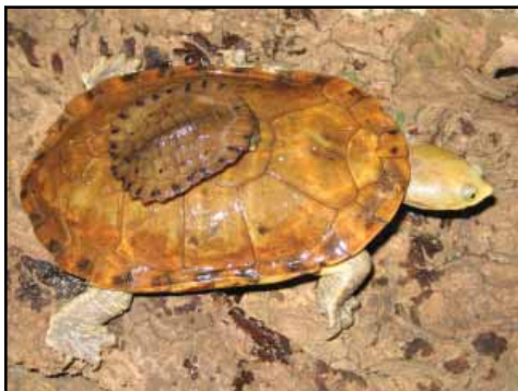
Difference between adult and some month juvenile.

It's mainly aquatic but not a good swimmer, only during egg-laying it prefers the land. It never basks in the sun but prefers to hide of the river bottoms. It enjoys mild temperatures.