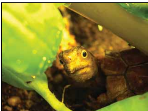
Studies have shown that they can see live prey up to 20cm.

Semiterrestrial turtle, it spends most of the day firm and hidden. It's very intelligent and a good predator. It enters water for drinking. It doesn't tolerate bright light and high temperatures over 28°C for long periods; it suffers temperature changes.