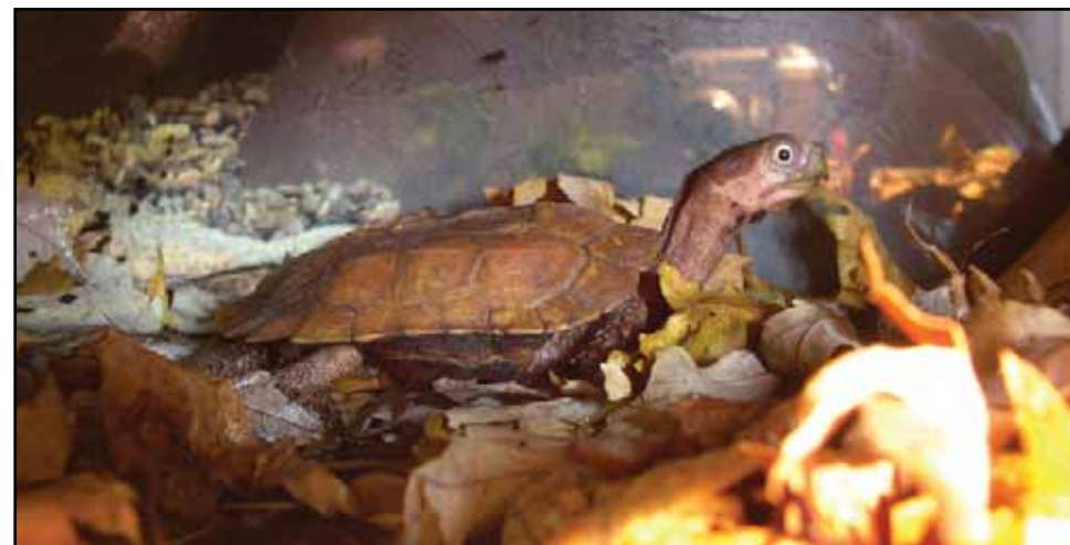
Typical position of healthy Geoemyda spengleri : watchful and corious eyes and extended neck are sign of good health.

Specimens come from capture in Vietnam, are hard to maintain in our climates. It's one of the species that protect its nest. Its mimetic colours and shape give it the name of Black-breasted Leaf Turtle. Not listed in CITES but considered as an endangered animal.