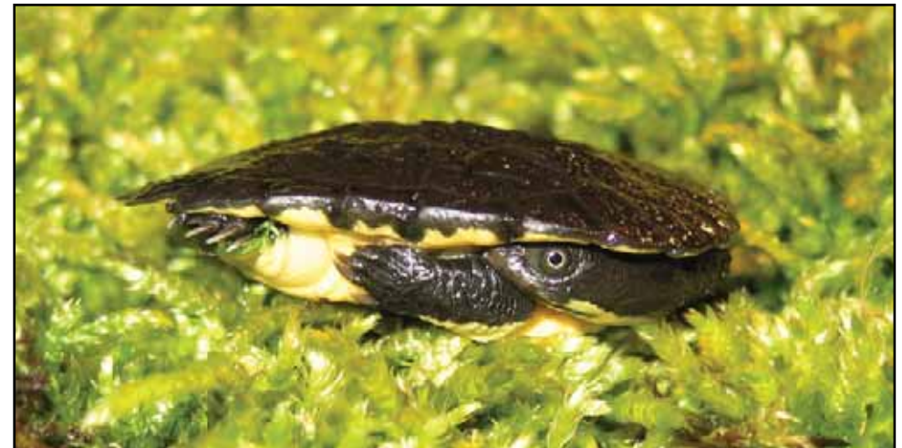
Close up of hatchling. The black colour of the carapace will be lost during the growth

It's the rarest South American turtle both in nature and in captivity. Biological and morphological differences with Hydromedusa tectifera lead a brand new classification. Free sale is permitted but it's very expensive; in great demand among breeders for it's attractive apperance.