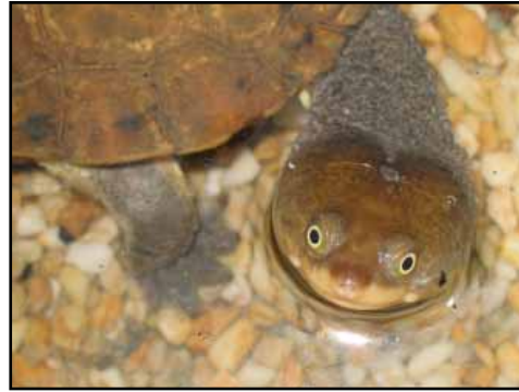
The neck, unlike other Hydromedusa specimens, is quite short.