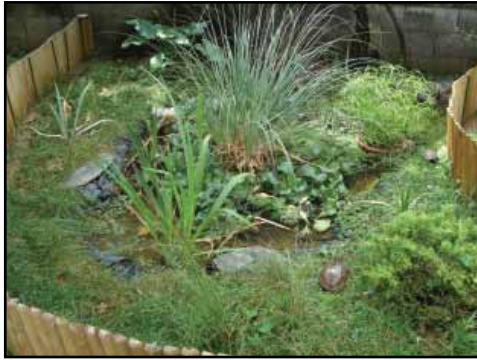
It's better to fence the pond to avoid escapes.