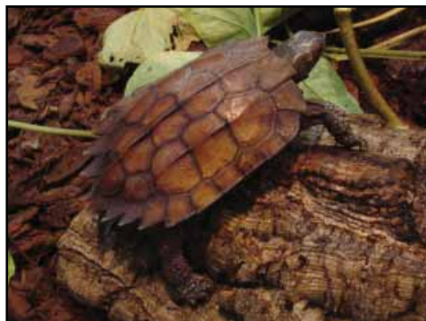
Geoemyda spengleri is a good climber.