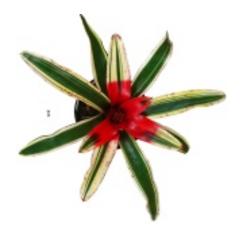
Neoregelia 'Heat Wave'