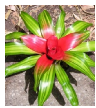
Neoregelia 'Skotak's Orange Crush' as 'Freddie' Derek Butcher

Many of you may be growing this as 'Orange Crush' which is a variegated plant with the looks of Neoregelia carolinae. But then you might be growing the same plant as 'Freddie'! The story begins in 2003 when I noticed that Deroose were selling 'Orange Crush' from their website. I captured the name and photograph for the BCR (Bromeliad Cultivar Register). I am not sure when and if it got exported to Australia but it was wide spread in Florida. One year later we obtained a plant called 'Freddie' from Garden World in Melbourne. They had imported it from the Philippines but had no detail as to parentage or origin. It was impressive so I took its photo and it was recorded in the BCR. These days, I would