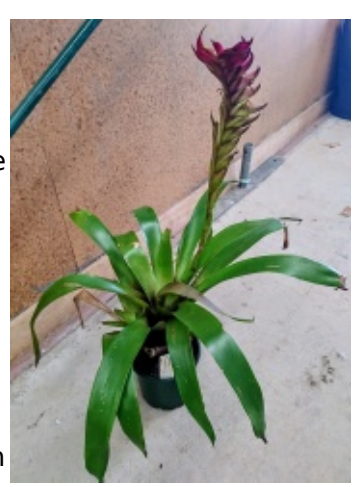
Vriesea 'Black Hawaiian'

Carefully read the full story on bromeliad.org.au under Vriesea 'Black Hawaiian' and if your plant has similar names, looks, NO glyph markings on leaves, spent inflorescence turns quite black, stamen of finished flowers become 'dangly', then consider changing the label. It has also made it's way to WA.