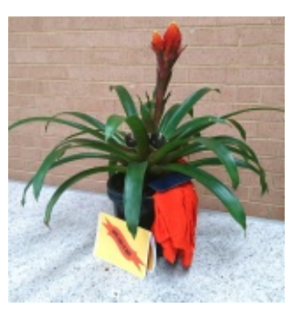
"Some Like It Hot"