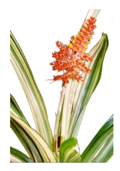
Aechmea 'Forget Me Not' was Aechmea caudata var. variegata