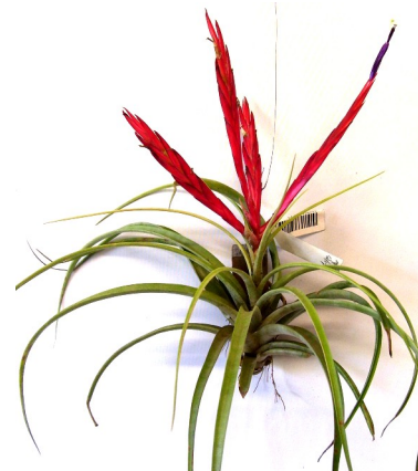
Tillandsia flabellata shown by Dave Boudier