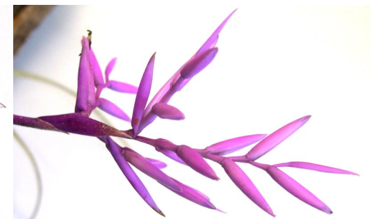
Tillandsia straminea grown by Keryn Simpson