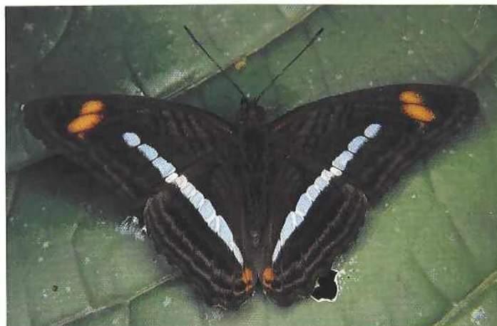
Fig. 11. Male of Adelpha iphicles estrecha n. ssp. imbibing sweat from a leaf, near Lita, northwestern Ecuador.

Description. — MALE: forewing length 26mm; hindwing distal margin straight and dentate. Dorsal surface: Forewing: ground color dark brown; basal area of cell 1A+2A and discal cell with some sparse orange-brown scaling; four black lines in discal cell and black postcellular line; white postdiscal band extending from anal margin to vein M_3 , tapering very slightly anteriorly, distal edge slightly concave, spot in cell Cu_1 ovoid and pointing at base of vein Cu_1 ; large orange subapical marking in shape of an irregular pentagon in cells M_3 , M_2 , M_1 , R_4 and R_3 , spot in