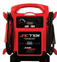
Solar 1700 Peak Amp Premium 12 Volt Jump Starter SLR JNC770R