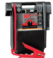
Solar Truck PAC - 3000/1500 Peak Amp 12/24 Volt Jump Starter w/AWS SLR ES1224