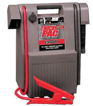
Solar Truck PAC - 3000 Peak Amp 12 Volt Jump Starter SLR ES6000