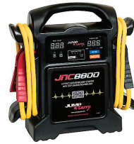
Solar 800 Start Assist Amp 12V Capacitor Jump Starter SLR JNC8800