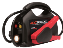
Solar 900 Peak Amp 12V Jump Starter SLR JNC300XL