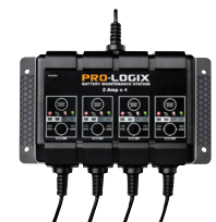
Solar 12V 4x2A SOLAR PRO-LOGIX 4-Bank Battery Maintenance Station SLR PL4020