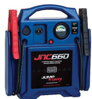
Solar 1700 Peak Amp 12 Volt Jump Starter SLR JNC660