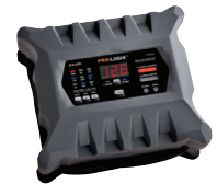
Solar 10A 6/12V PRO-LOGIX Battery Charger SLR PL2310