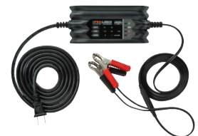
Solar 6/12V 4.0A SOLAR PRO-LOGIX Battery Maintainer SLR PL2140