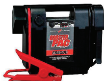
Solar 1500 Peak Amp 12 Volt Jump Starter SLR ES5000