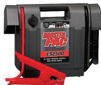
Solar 1100 Peak Amp 12 Volt Jump Starter SLR ES2500