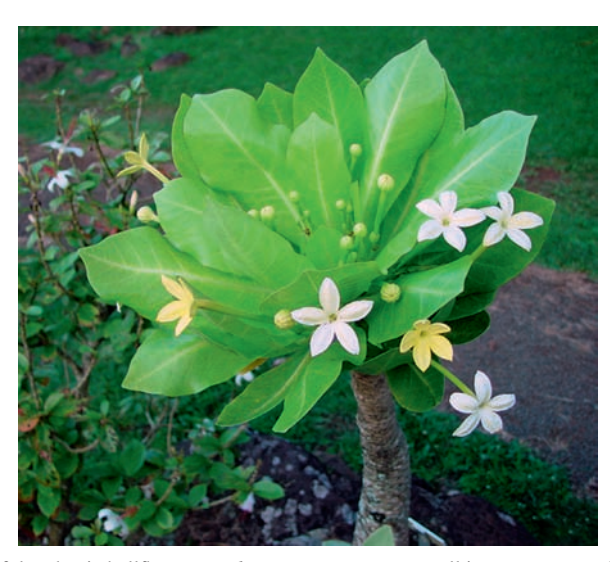
Fig. 2 The beautiful endemic bellflower Brighamia insignis grows well in our ex situ and inter situ projects. On the last in situ check only one live plant was found, clinging tenaciously to a vertical cliff.

pristine site. This is no picnic, with over 100 helicopter sling-loads of fence material, $600,000 US in construction and materials, over three years of paperwork before the first fence post went in, and constant worries that the fence itself can be a threat. There is the possibility that the fence provides a corridor for weeds to invade and could be a strike hazard for Hawaiian Petrels and Newell's Shearwaters, two of Hawaii's most endangered seabirds which nest on the ground nearby. Fences are important, but we cannot fence in, or out, everything that needs our attention to save this flora. To think so is indeed naïve.