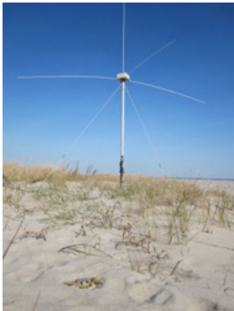
Long Range Receive Antenna