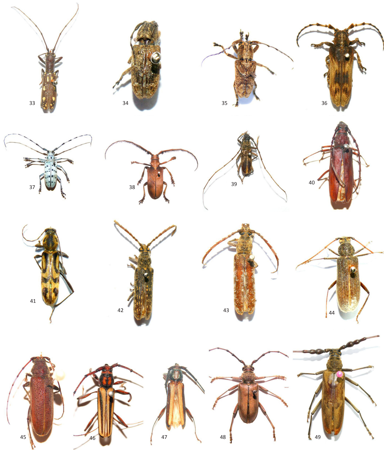
Images 33–49. 33 - Olenecamptus indianus ; 34 - Pterolophia (Hylobrotus) tuberculatrix ; 35 - Pterolophia occidentalis ; 36 - Thylactus simulans ; 37 - Pseudonemophas versteegii ; 38 - Sarothrodera lowii ; 39 - Aeolesthes sarta ; 40 - Hoplocerambyx spinicornis ; 41 - Chlorophorus annularis ; 42 - Rhytidodera bowringii ; 43 - Rhytidodera griseofasciata ; 44 - Stromatium barbatum ; 45 - Gnatholea simplex ; 46 - Xystrocera globosa ; 47 - Xystrocera festiva ; 48 - Neoplocaederus obesus ; 49 - Neocerambyx grandis .