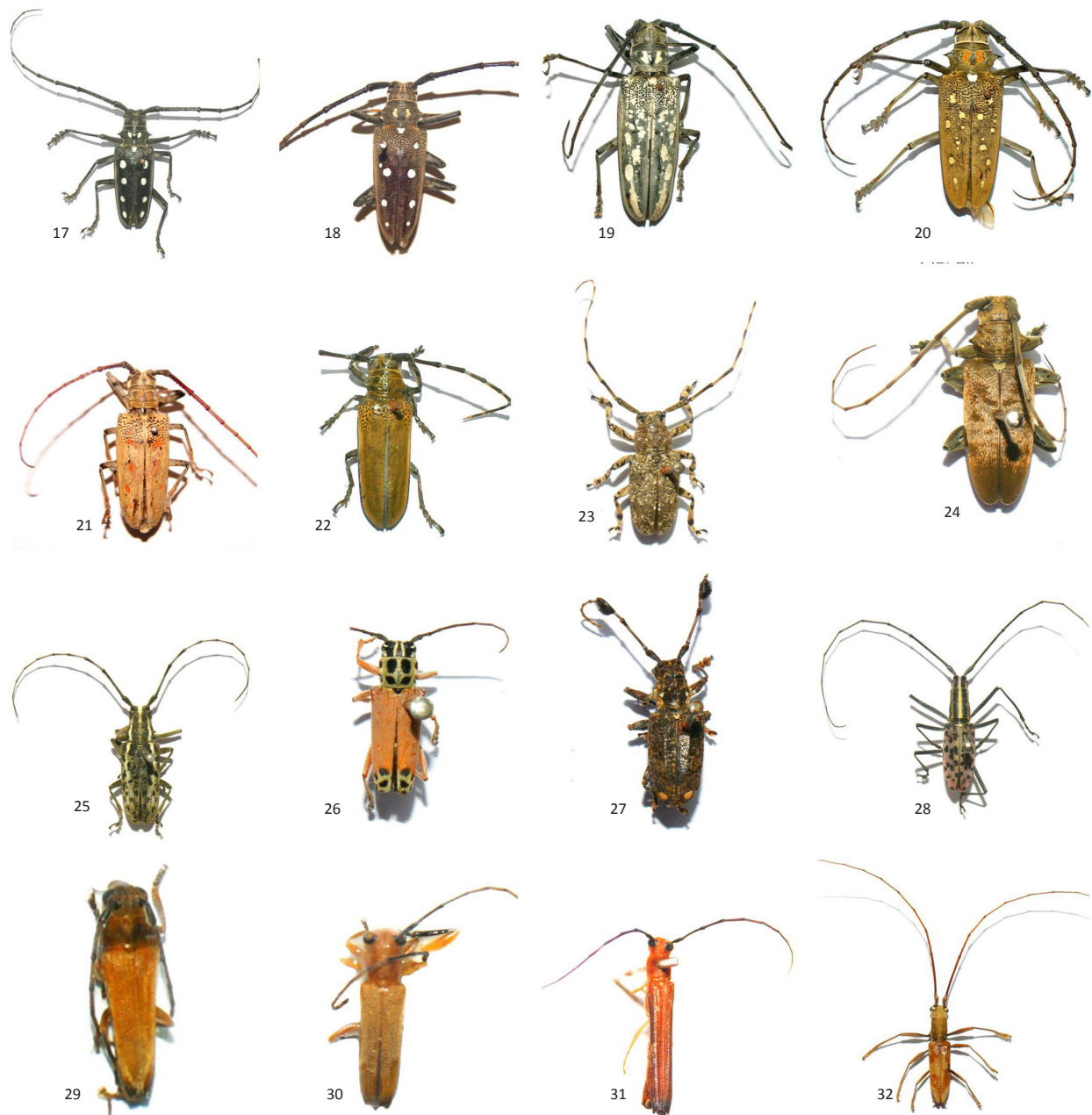
Images 17–32. 17 - Batocera parryi ; 18 - Batocera rubus rubu ; 19 - Batocera horsfieldi ; 20 - Batocera rufomaculata rufomaculata ; 21 - Batocera numitor ; 22 - Apriona germarii germarii ; 23 - Coptops aedificator ; 24 - Acalolepta cervina ; 25 - Epepeotes uncinatus ; 26 - Glenea (Stirolene) spilota ; 27 - Imantocera penicillata ; 28 - Macrochenus guerinii ; 29 - Nupserha nigriceps ; 30 - Nupserha bicolor ; 31 - Obereopsis obscura obscura ; 32 - Olenecamptus bilobus bilobus .