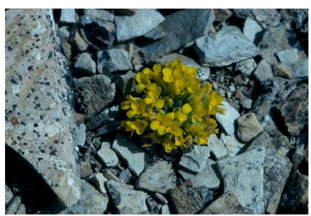
Dudley Bluffs bladderpod