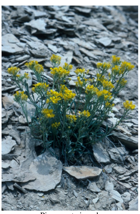
Piceance twinpod