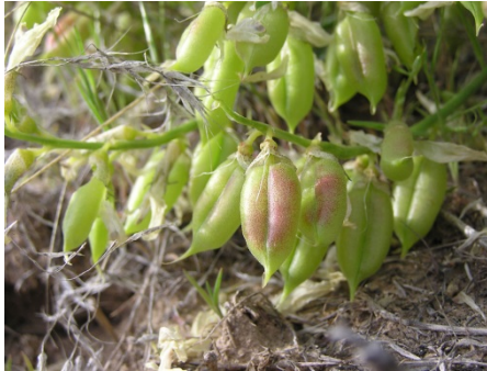
Close up of Astragalus debequaeus fruit by Georgia Doyle