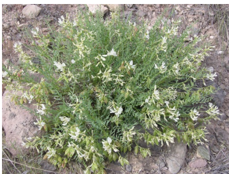
Close up of Astragalus debequaeus by Georgia Doyle