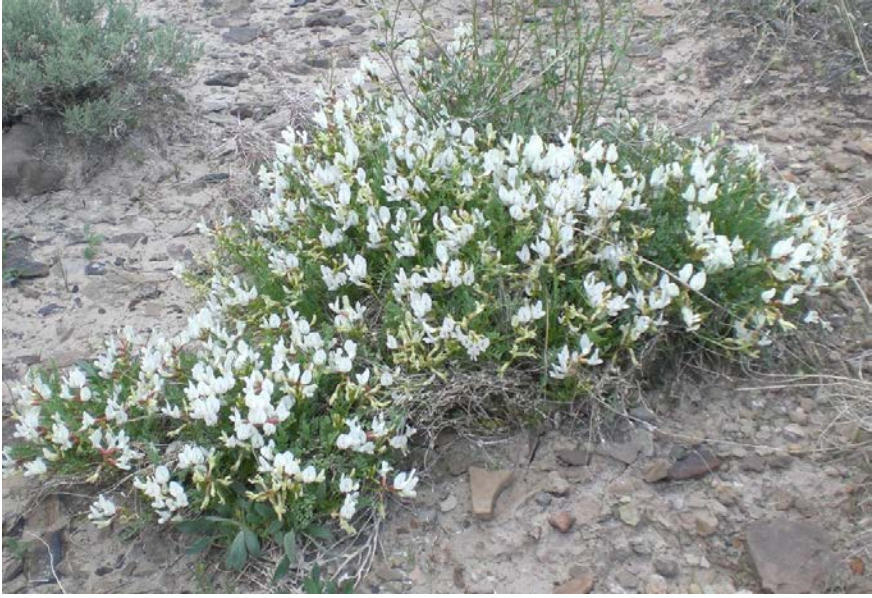
Close up of Astragalus debequaeus by Peggy Lyon