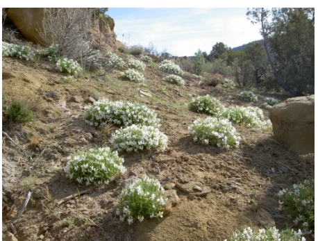
Habitat of Astragalus debequaeus by Terry Bridgman