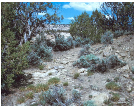
Habitat of Astragalus debequaeus by Susan Spackman Panjabi

Astragalus debequaeus is found in varicolored, fine-textured, seleniferous, saline soils of the Atwell Gulch Member of the Wasatch Formation, in areas surrounded by pinyon-juniper woodlands and desert shrub. Plants are mostly clustered on toe slopes and along drainages, but many occur on steep sideslopes. Soils are clayey but littered with sandstone fragments. Associated taxa include Astragalus flavus, Greyia, Bahia, Artemisia, Phacelia submutica, Aster, Cryptantha, Eroigonum, Grindelia , and Sitanion (Welsh 1985, O'Kane 1986, Spackman et al. 1997).