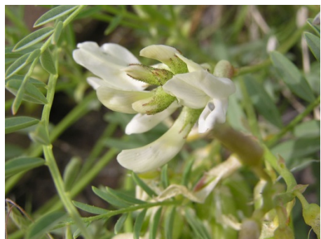
Close up of Astragalus debequaeus flowers by Georgia Doyle