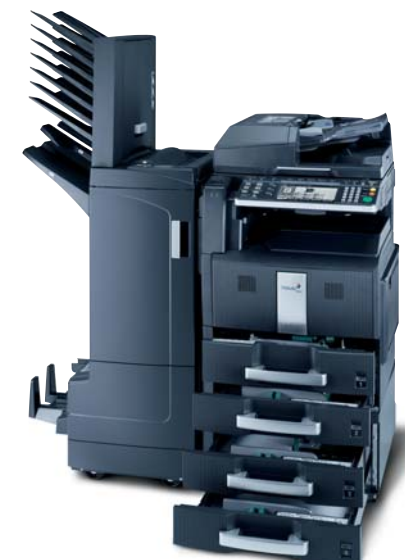
Product depicted includes optional extras.