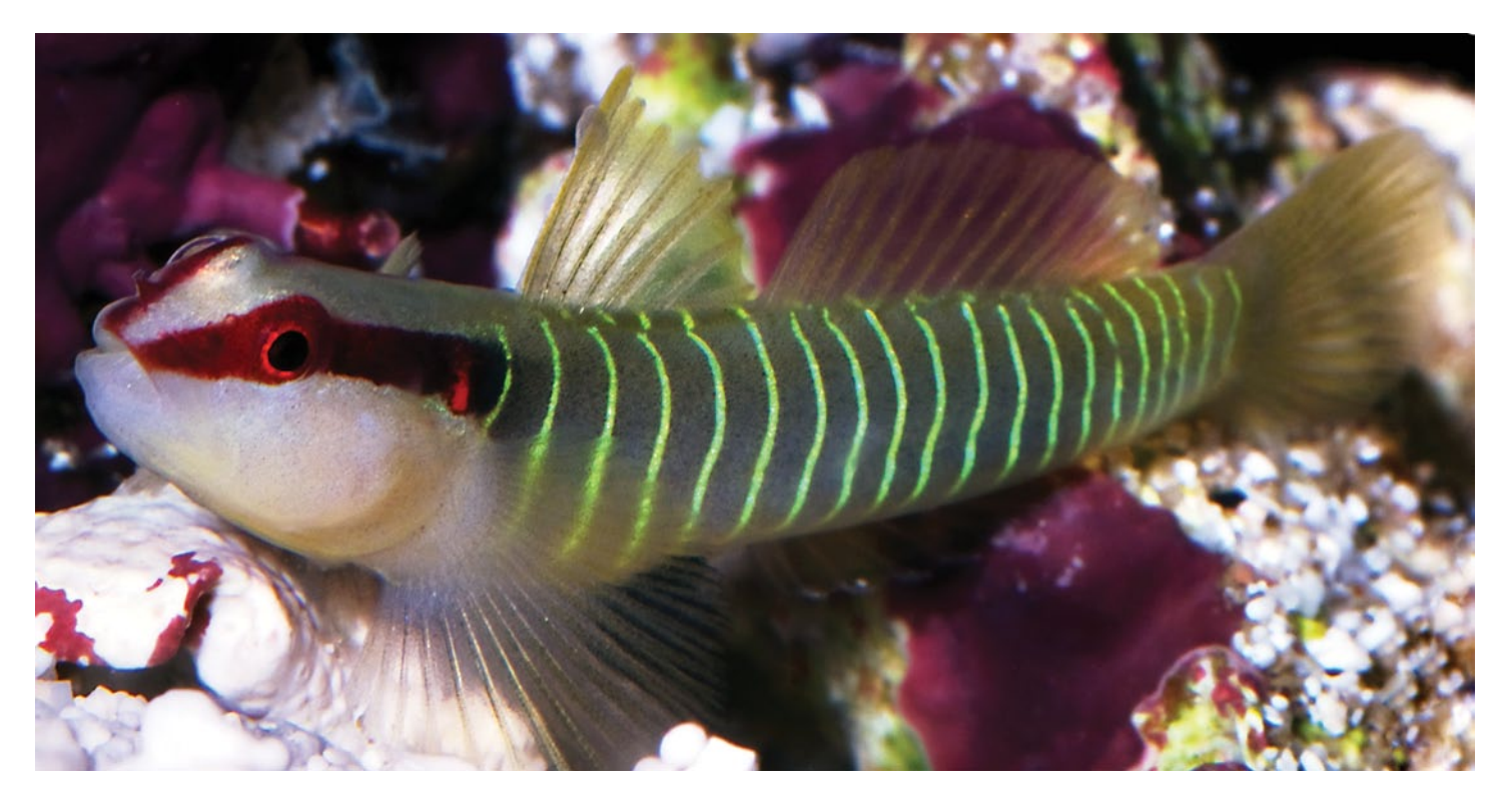
Figure 4. The Greenbanded Goby, Elacatinus multifasciatus . aquarium specimen.

Measurements (types over 15 mm SL) are percent of SL, with range (holotype). Body elongate, depth at dorsal-fin origin 19.5–26.3 (22.6); width at pectoral-fin base (side-to-side) 17.6–20.9 (20.9); head length 26.7–31.2 (29.1); snout length 5.3–7.3 (6.1); orbit diameter 6.8–8.1 (7.0). Mouth terminal and large, the maxilla ending below the posterior 1/3 of pupil, the upper-jaw length 10.8–14.1 (12.2). Predorsal distance 35.7–39.5 (37.4). Spines of fins slender and flexible, first dorsal spine elongated in males (often in females as well), length 19.4–30.4 (30.4); pelvic fins short 14.3–17.9 (14.3); caudal peduncle length 14.1–16.9 (15.2), caudal peduncle maximum depth 12.7–14.6 (13.0).