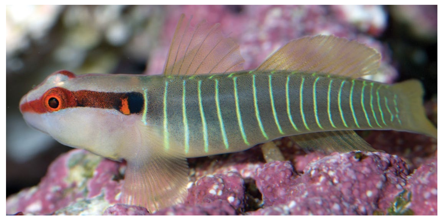
Figure 2. The Greenbanded Goby, Elacatinus multifasciatus . aquarium specimen.

CCTTTACCTAGTCTTCGGTGCATGAGCTGGCATAGTCGGCACAGCACTCAGCCTTCTTATCCGGGCC-GAGCTAAGTCAGCCAGGAGCCCTGCTGGGAGACGACCAGATGTACAATGTAATTGTAACGGCT-