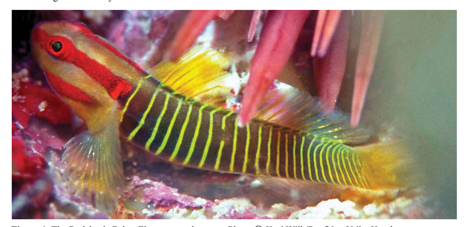
Figure 1. The Redcheek Goby, Elacatinus rubrigenis . Photo © Keri Wilk/ReefNet, Utila, Honduras.

Diagnosis. A species of Elacatinus with dorsal-fin elements VII, 11 (rare 10); anal-fin elements 10 (uncommon 9); pectoral-fin rays 20 (20–22); pelvic fins fully-joined, short cup-like disk complete; no scales; a pale head with a prominent red stripe from the tip of the snout across the eye ending abruptly above the pectoral-fin base with a short orange segment, followed by a short black segment; notably with an additional red stripe across the cheek from the corner of the jaw to the mid-pectoral-fin base; a dark green body with 23–26 thin light green bars along the full length of the body.