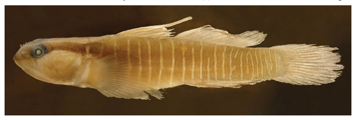
Figure 3. Holotype of Elacatinus panamensis , 23 mm SL male from San Blas, Panama (SIO-9-304).

Paratypes. SIO-09-305, (5) 15.7–22.4 mm SL, Panama, San Blas Islands, Smithsonian Tropical Research Institute facility adjacent to Wichubhuala, Kuna Yala (9.550, -78.953), B. Victor, January 23, 1983; SIO-09-306, (5) 12–20.5 mm SL. Panama, Colon District, Los Farallones (9.644, -79.627), D.R. Robertson, J. Van Tassell, B. Victor, L. Tornabene, and E. Pena, May 27, 2007; SIO-09-307, (1) 8.8 mm SL. Panama, Colon District, Mogote