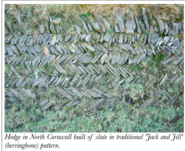
Hedge in North Cornwall built of slate in traditional 'Jack and Jill' (herringbone) pattern.

The parallel cleavage planes of these give flat pieces, often quite thin, which demand a radically different pattern of Cornish hedging. Easier to handle than the chunky lumps of granite or metamorphic rock, they yet require skill because they are so thin. They are sometimes soft, breaking easily under the weight of those above, and often slithery, so the hedge sides more easily develop a bulge; a badly-built slate hedge soon falls down. To counteract these tendencies, different ways of building with shale and slate evolved, notably the herringbone pattern, a favourite with affectionate local names: 'Jack and Jill', 'Darby and Joan' or 'Kersey (or Kensey) way'.