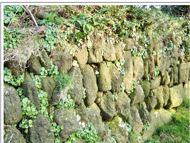
Typical Cornish hedge in granite country built of weathered lumps of moor-stone.

The naturally-occurring granite moor-stone produces the widest variation of hedge-building styles within the one type of stone. This is because the stone is used as found, varying