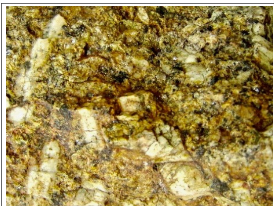
Close-up of this gatepost granite shows it has cooled slowly, giving a fairly large crystal size and coarse texture.

These are the rocks altered by the stresses of movement and volcanic action, especially around the central once-molten intrusions where the heat was greatest. Most are extremely hard - literally baked hard - and they contain many manifestations of the turmoil, such as crystals, ores and fantastically veined, layered or crushed and reconstituted rocks. With the heating and its chemical changes added to the effects of movement and pressure, a wide variety of stone is produced. Cleavage varies from the flat easily-separated layers of the altered sedimentary rocks to the obdurate iron-hard lumps of greenstone, locally known as 'blue elvan', which, when it does break, randomly shatters, or just reduces to powder at the point of impact.