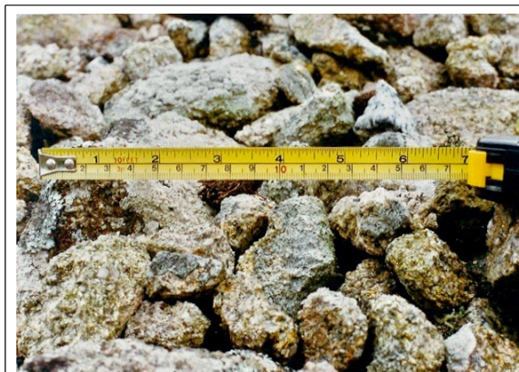
Inch-rule laid on top of this stone hedge in West Cornwall shows how small are the fragments of moor-stone, cleared from the fields, that were used to fill it.

The hedges, therefore, even more than the houses, tell what stone lies beneath them. Seldom would anyone go to the trouble and expense of carting heavy stone any distance to build hedges.