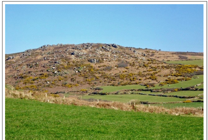
This view shows how the weathered moor-stone scattered on the hilltop was first cleared to build hedges round Bronze Age fields (middle distance right), with later clearance forming the larger field in foreground.

Far more stone went into building the hedges to enclose the fields of a smallholding or farm than into the walls of the cottage or buildings. Even the garden hedge takes as much as the house; the stone from a small cottage would build less than 100 metres of hedge. In granite country, while better stone for the house might be quarried at a little distance, the hedges were built of the naturally-occurring broken and weathered lumps of stone known as 'moor-stone' found on the surface and in the soil while clearing the land for farming. In the years of mining activity hedges were built, as were the miners' cottages, from the stone spoil brought up from the nearby mine. In more eastern parts of Cornwall where neither mines nor surface stone might be in evidence, stone from the nearest quarry was used, or else turf hedges were built, their core of 'rab' showing the local subsoil content of clay and broken 'killas'.