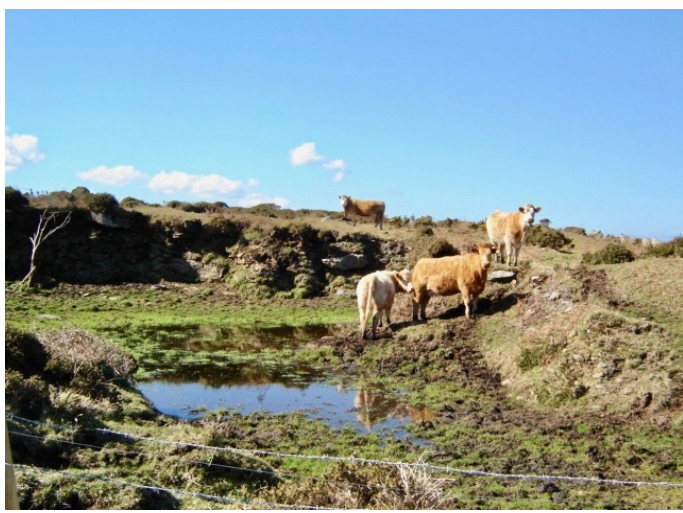
Old rab pits make attractive minor features in the landscape and provide wildlife opportunities.

In a future more aware of the value of heritage and of the natural local materials, re-use of local stone must be as much a priority as retaining original hedges where they stand. Where development plans require unavoidable removal of a hedge, a condition of permission for removal must be for rebuilding it elsewhere on the site, using its original materials of stone, earth and vegetation. Locally-stockpiled or buried hedge stone must be recovered for re-use, rather than importing alien stone from another part of the county. Refugee stockpiles or dumps clearly out of their ancestral