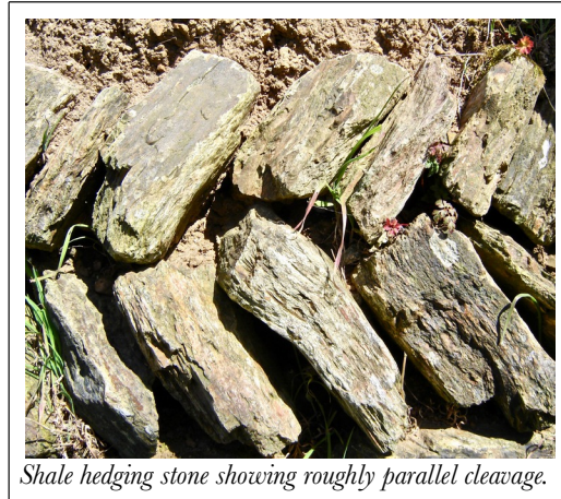
Shale hedging stone showing roughly parallel cleavage.

Formed by sediments such as sand, mud, and gravel, washed and laid down usually by water and solidified as their weight builds up, compressing the lower layers into stone. Sedimentary rocks formed this way include shale, sandstone, mudstone and gritstone. In Cornwall they appear as the tattered skirts around large holes in the once-enveloping bedspread, the higher parts having been worn away until the underground granite peaks were laid bare. The sedimentary rocks still remaining, altered to varying degrees by the pressure and heat of earth movement and volcanic action, are locally known by the name of 'killas'. Their cleavage (the way the rock breaks) is usually in flattish planes, the extreme being the thin layers of slate like the pages of a book, separable by a knife blade, formed by pressure-alteration of shale.