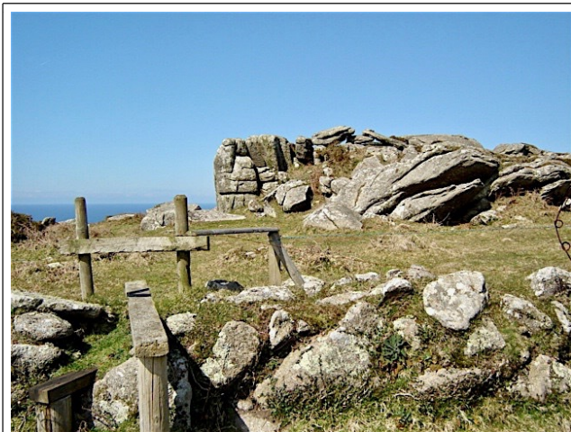
Granite intrusion, exposed by weathering, forms rugged hilltop in West Penwith. Wooden stile is non-traditional in Cornwall and looks wrong in this granite landscape. Cornish hedges like this one should have stiles of the same local stone.

This mountain range, which ultimately became Cornwall, is known to geologists as the Cornubian massif; estimates suggest that the 'bedspread' was a mile thick. Then 250 million