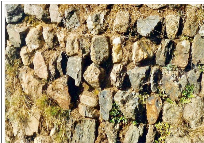
Cornish hedge near Camborne built of mine spoil showing variations in type and colour of stone, with red mineral staining.

Metamorphic rock extracted during mining operations required great skill in building. Detached from the bedrock by blasting, then broken into smaller pieces by sledge-hammer, it emerged in chunks varying in size from a couple of inches to a couple of feet across. It varied in composition through a spectrum of rock and mineral types including such idiosyncratic forms as greenstone and quartz, was usually extremely hard, and was broken into jagged, difficult shapes.