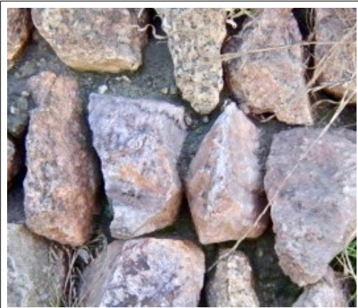
Broken quartz (centre) from mine spoil used in hedging - of no value to the mineral-collector.

underground meet earlier enclosures that were hedged with surface moor-stone.