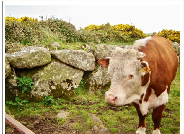
Granite hedge using the big moor-stone boulders unbroken, as cleared from the field.

Moor-stone 'rises' perpetually towards the surface, and on farmland traditionally the pieces were removed by hand about once in every generation, clearing the soil to a depth of about 9 inches (23cm). On two farms, one in Pembrokeshire and one in Cornwall, the farmers each described to the author's husband, independently, large coffin-sized granite boulders as having risen during their long lifetimes by an average of about a quarter of an inch (6 mm) a year.