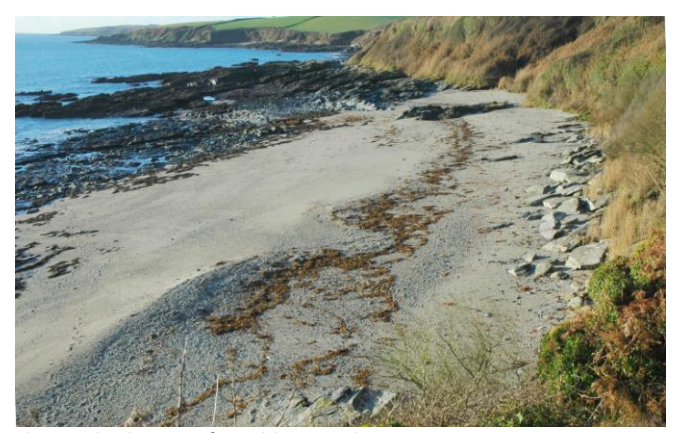
The northerly part of Porthbean at low water

Porthbean comprises of two easterly facing beaches that are sheltered from the prevailing winds and represent the true quality of the coastline of 'The Roseland'. Creek Stephen is just north of Porthbean. A short section of the Coast Path actually crosses part of Portbean Beach and is therefore frequented by those walking the Path but otherwise it is never crowded; the northerly part of Porthbean is very secluded as is Creek Stephen which can only be reached by clambering across the rocks by the old fisherman's slipway at the end of Porthbean.