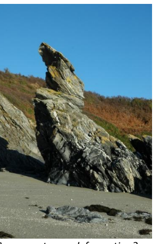
Cormorant or rock formation?

There are numerous rock pools, even when the tide is relatively high. The rock formations are particularly good for trapping water and so forming pools of a variety of sizes.