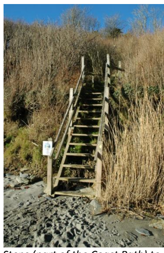
Steps (part of the Coast Path) to the southerly end of Porthbean