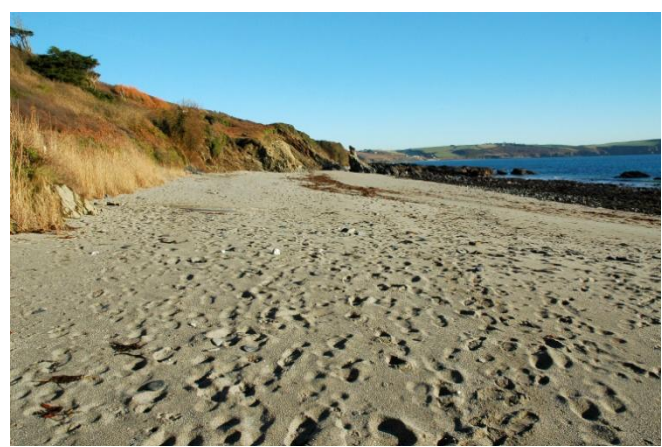
Southerly part of Porthbean in winter

There are no toilets or other facilities at all. The nearest are at Portscatho (2.5kms), or at Porthcurnick (1km), but then only in the summer holiday period.