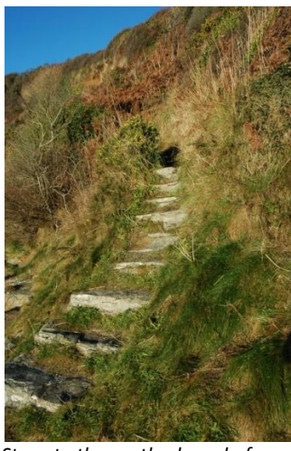
Steps to the northerly end of Porthbean Beach

TR2 5EW - From Truro to St.Mawes on the A3078, at Trewithian, (6kms from St.Mawes) a narrow road is signposted to Rosevine. After 300m there is a T junction – turn right and immediately look for a suitable place to park alongside the road in the vicinity