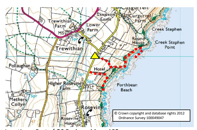
Location – Part of OS Explorer Map 105

The quality of the sea water is excellent although the quality of the water in the stream that crosses the smaller of the Porthbean Beaches is unknown. All three beaches are remarkably free of water borne litter.