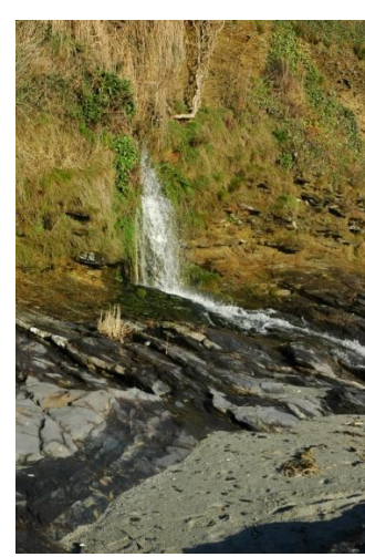
Waterfall at Porthbean

At high tide, or over two hours either side of high water, the rocky areas between the beaches, particularly at Creek Stephen Point, offer some excellent snorkelling and diving conditions.