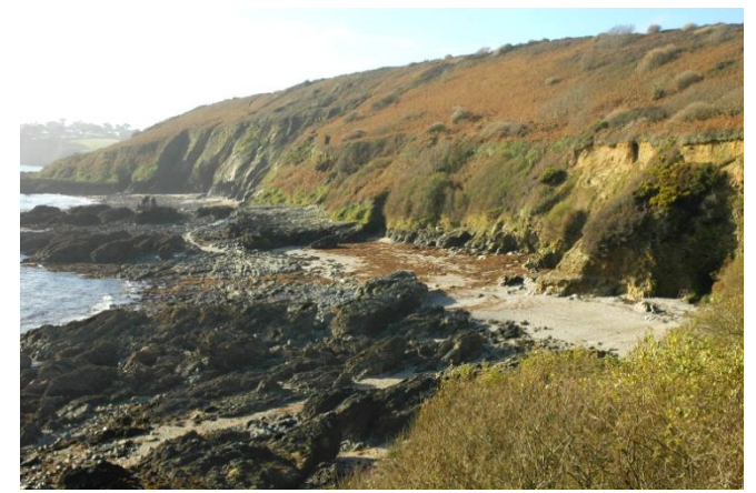
View from the access path in autumnal sunshine at low water

A south facing beach midway between Swanpool Beach, Falmouth and Maenporth Beach whose aspect very much lives up to its name. It involves a walk along the Coast Path from either direction. It is a naturist beach and known as 'Arthur's Beach' with a sign on the access path informing everyone that 'costumes are optional'.