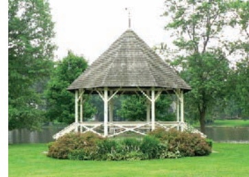
Cranbury Bicentennial Gazebo in Village Park

Cranbury is one of the oldest towns in New Jersey. It is believed that there were settlers here as early as 1680, when the town was known as Cranberry and Cranberry Town. A deed dated 1698 for land "with all improvements" indicates buildings on the land and earlier settlement. Cranbury celebrated its 300th anniversary in 1997.