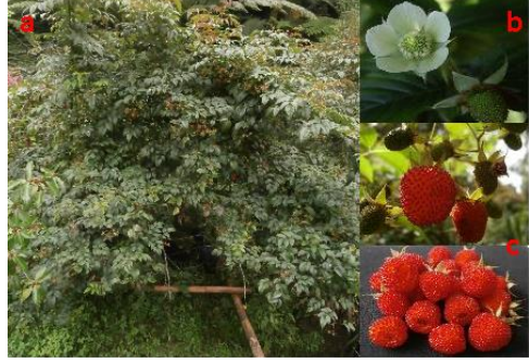
Fig 1. Rubus fraxinifolius (a) plant, (b) flower and (c) fruits.

effect of initiation medium was significant to callus height on 8 and 12 weeks after subculture, callus diameter on 8 weeks after subculture, and number of roots on 4 weeks after subculture. Moreover, the effect of growth medium was significant to callus height on 12 weeks after subculture, number of leaves on 12 weeks after subculture, plant height on 12 weeks after subculture, and number of roots on 4, 8 and 12 weeks after subculture. Furthermore, a significant interaction between initiation and growth medium showed on three parameters i.e. callus height on 12 weeks after subculture, callus diameter on 8 weeks after subculture, and number of roots on 4 weeks after subculture. In the other hands, our experiment have not given the best formulation for medium with combination of plant growth regulators and the concentration to produce the number of buds.