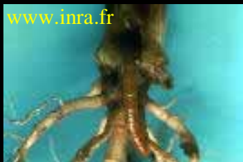
The larva and its damage, which should be averted

Pheromone traps should be placed at the soil. Usual beginning of trapping in Hungary is middle of April