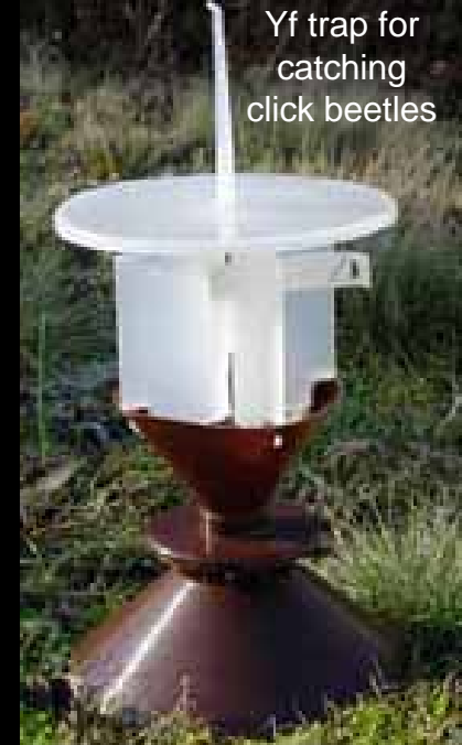
Yf trap for catching click beetles

(According to experience in Italy on the closely related A. ustulatus , if the average catch per trap does not exceed 150-200 specimens per year, damage is highly improbable on the given field[1]. In case of higher captures, it is advisable to perform larval sampling (soil cores) for more accurate estimation of population levels. This may be performed through agrotechnical means, crop rotation or in more severe cases by soil insecticides[2]. More accurate establishment of correlations between trap captures and larval density in different cultures are underway (Lorenzo Furlan, pers. comm.)