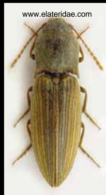
The beetle, which is captured in the trap

Host plants of the larva include maize, cereals, sunflower, sugar-beet, potatoes, other grasses and also many other plants, i.e. tomatoes. The larvae feed on the roots. The adult beetle feeds on leaves of grasses and on flowers by pollen; it can frequently be seen for example on Umbelliferae flowers. The main damage is caused by the larvae, the wireworms, which eats up hatching seeds and roots inside the soil. Damages are variable depending on the plant species attacked and the type of soil. Indicators can be of imperfect hatching of seedlings (maize), damaged hatchlings and roots, yellow colouring of the plant parts above ground.