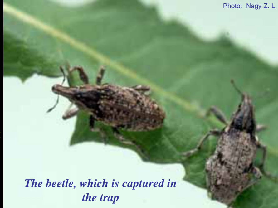
The beetle, which is captured in the trap

The damage: the beetle feeds on the foliage and can destroy the whole crop, especially the young plants or seedlings. It often destroys the stalk of the leaf, which makes the plant to fall on the ground. The larva causes damage by feeding on