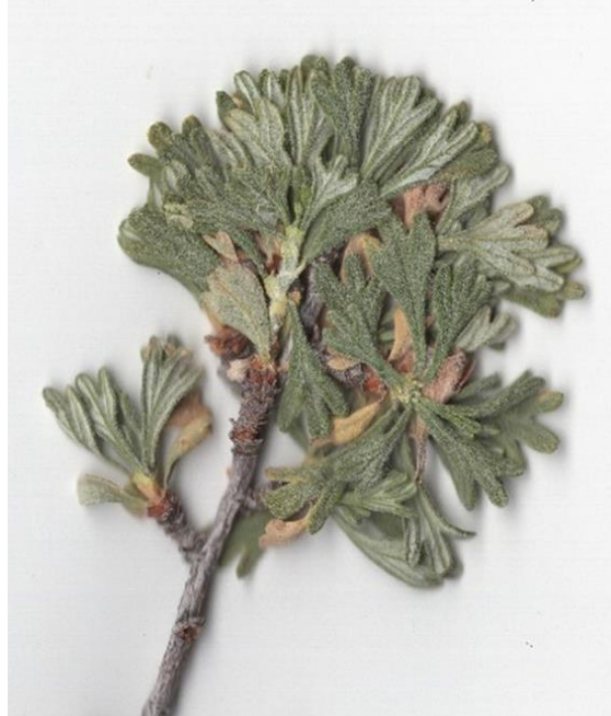
Figure 1. Purshia tridentata var. tridentata from southern Idaho.

The purpose of this present study was to collect P. tridentata var. tridentata from several locations in southern Idaho, obtain the essential oils by hydrodistillation and characterize the essential oils using gas chromatographic techniques. As far as we are aware, this is the first report on the essential oil composition of P. tridentata .