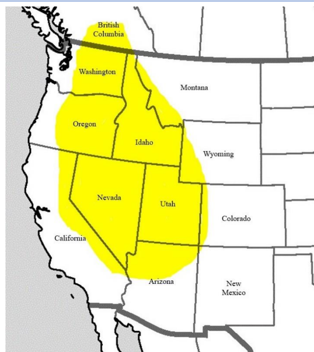
Figure 2. Distribution of Purshia tridentata var. tridentata (antelope bitterbrush) in western North America. Adapted from McArthur et al. [3].

The aerial parts of P. tridentata var. tridentata were