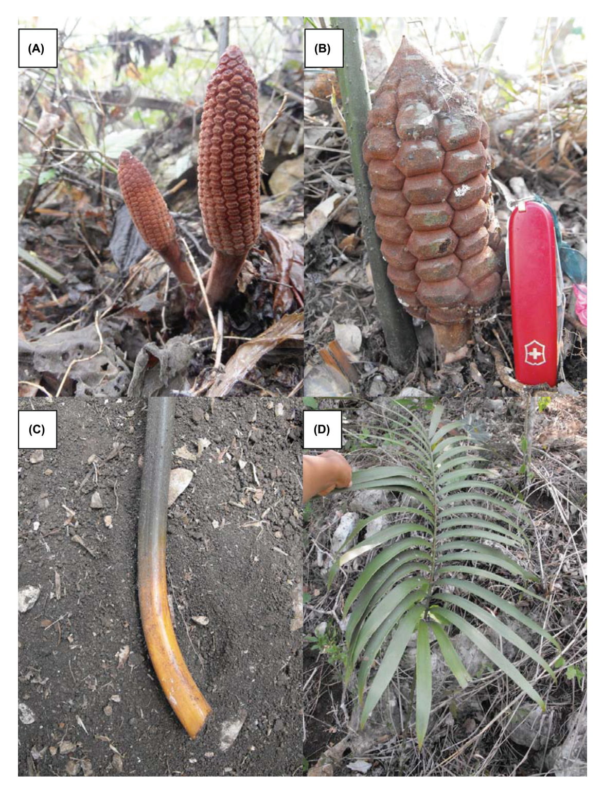
Figure 1. (A) Conical male cone of Zamia grijalvensis . Note thick tomentose peduncle, (B) cylindrical female cone of Z. grijavensis , (C) base of petiole, (D) habit of leaf.

Holotype: Mexico, Chiapas, Montañas del Norte. Jul 2010 M. A. Pérez-Farrera 2620a (HEM). Isotypes: MEXU, MO, XAL.