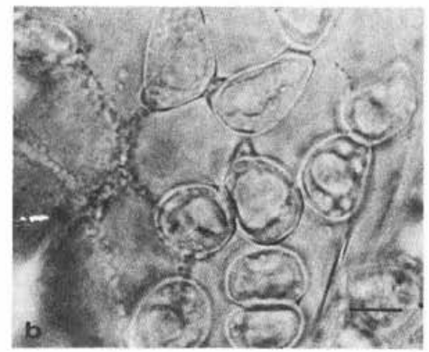
Fig. 2b The fibrous subcuticular hyphae connect ascogenous cells, 10 \mu m

The vegetative phase of the fungus is characterized by yeast-like cells, which form chain-like colonies beneath the leaf cuticle (Fig. 2a). The mycelium has an irregular form. The mycelium cells are elongated, divided or partitioned by layered septa which appear to be composed of several bands of wall material. The cytoplasm of the young cells is dense, but becomes granulated and vacuolated as the cells develop into ascogenous cells. Occasionally the cells of mycelium branch, but do not form such extensive mycelium as formed by some of the other Taphrina species. The size of the cells vary depending on intercellular spaces of the host parenchyma. In the