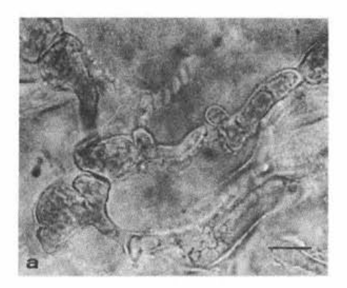
Fig. 2a Various stages of mycelium cells in the subcuticular leaf layer (yeast-like cells, cells of fine fibrous mycelium, early stages of developing ascogenous cells), 10 \mu m