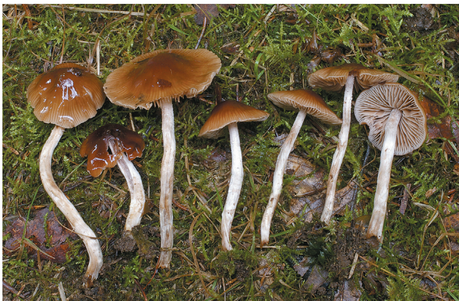
Fig. 3. Naucoria bohemica (isotype, LIP: BORE2008-1): fresh basidiomata in situ.