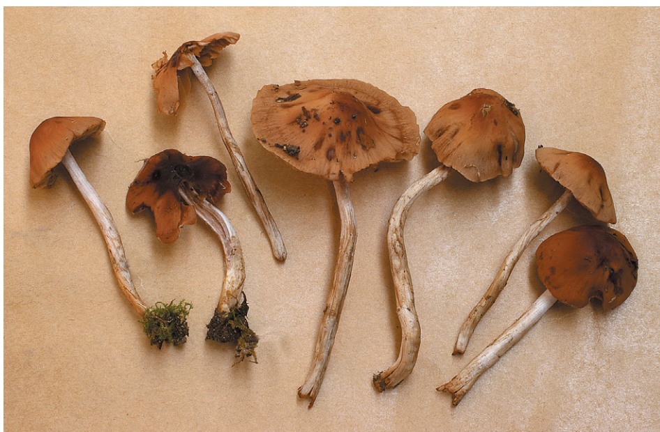
Fig. 4. Naucoria bohemica (isotype, LIP: BORE2008-1): drying basidiomata.