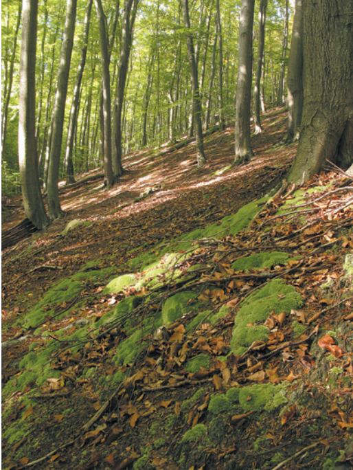
Fig. 5. Acidophilous beech forest ( Luzulo-Fagion ) – typical habitat of Lactarius rostratus , Czech Republic, Chřiby hills, Smutný žleb Nature Reserve.

Comments on distribution and ecology. According to my field observations in the Czech Republic, L. rostratus has very specific ecological requirements, which agree well with Nespiak (1968), who considers L. rostratus a characteristic species of acidophilous beech forests ( Luzulo-Fagion association). Almost all recent Czech collections come from well-preserved, near-natural or extensively managed acidophilous beech forest reserves on steep slopes at middle altitudes on substrates with a high tendency of desiccation. It has rarely been collected at higher altitudes in beech-fir forests. Two historical collections from the Czech Republic come from an oak forest and a mixed forest without the presence of beech.