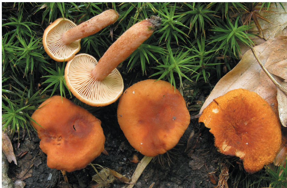
Fig. 2. Lactarius rostratus , Czech Republic, Kokořínsko, Osinalické bučiny Nature Monument, 19 Aug. 2010 (JB10/938). (JB 10/938).