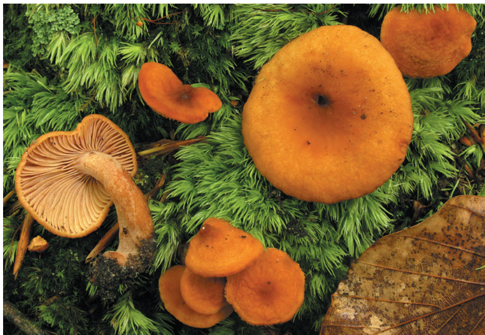
Fig. 1. Lactarius rostratus , Czech Republic, Chřiby hills, Smutný žleb Nature Reserve, 3 Aug. 2010 (JB10/771).