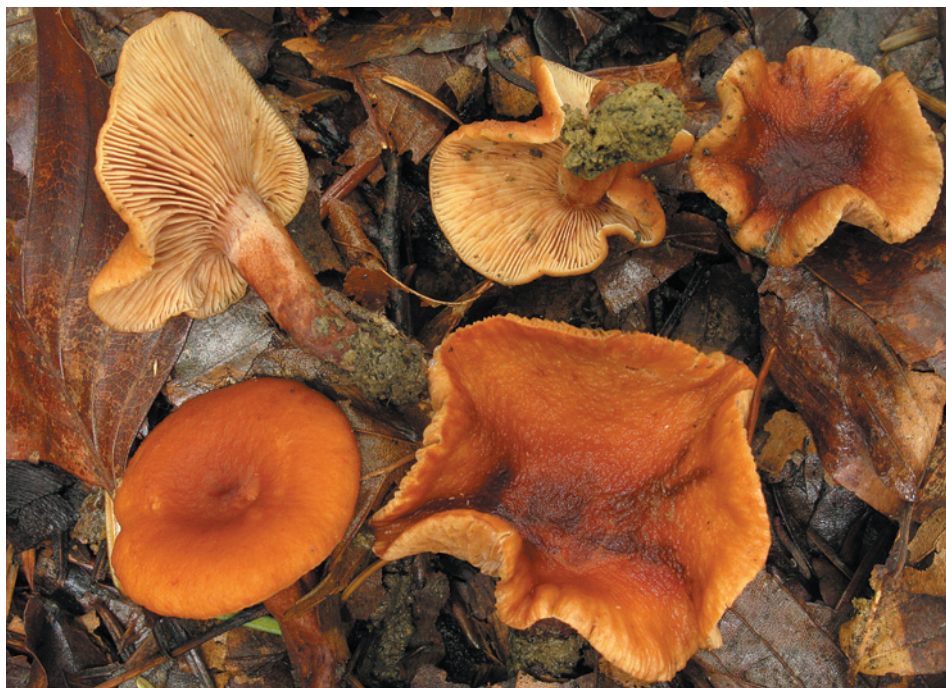
Fig. 3. Lactarius rostratus , unusually large fruitbodies, Slovakia, Poloniny National Park, Udava National Nature Reserve, 16 Aug. 2011 (JB11/388).