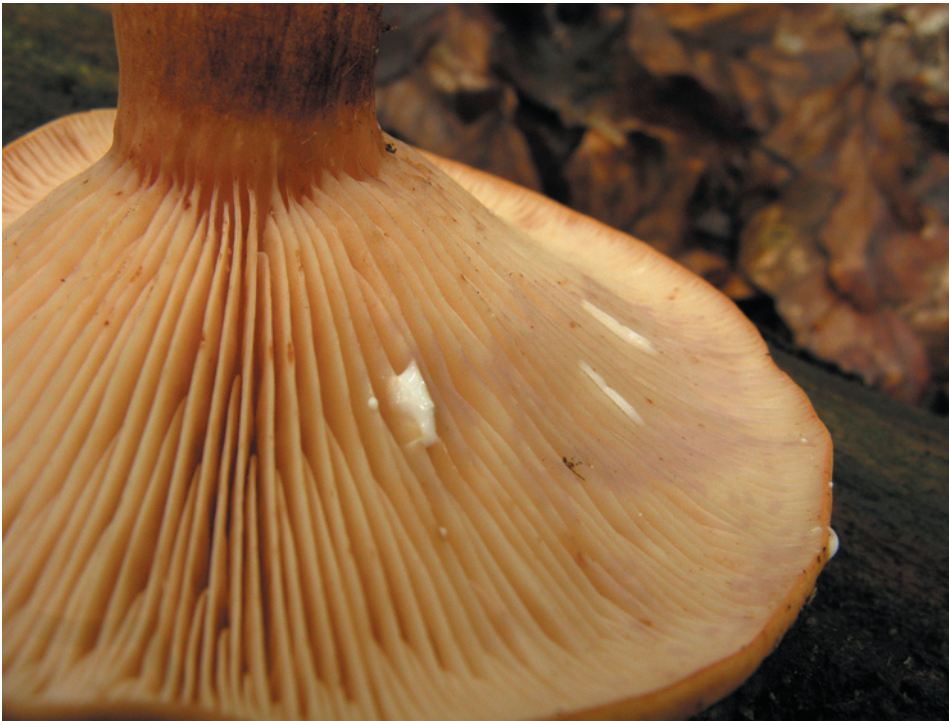
Fig. 7. Lactarius rubrocinctus , weak violaceous reaction of gently rubbed gills and well-developed dark zone at the stem top of young fruitbody, Czech Republic, Chřiby hills, Holý kopec Nature Reserve, 27 Jul. 2011 (JB11/250).