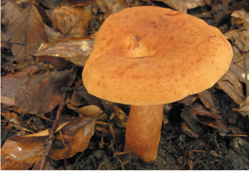
Fig. 6. Lactarius rubrocinctus , young fruitbody without typically radially venose cap surface, Czech Republic, Chřiby hills, Holý kopec Nature Reserve, 27 Jul. 2011 (JB11/250).