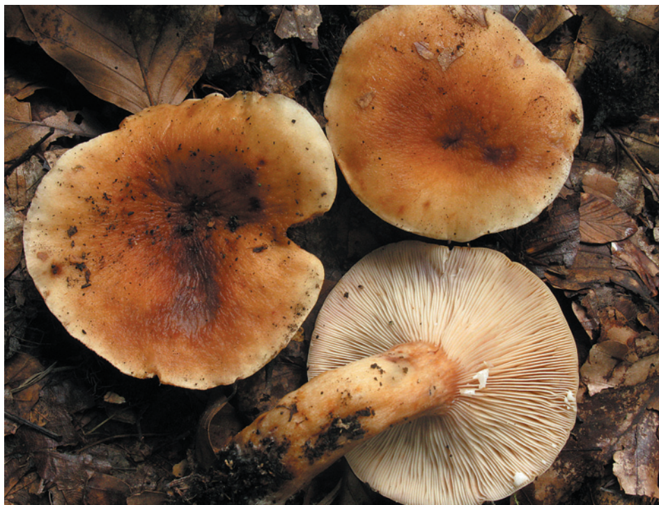
Fig. 8. Lactarius rubrocinctus , typical collection, Czech Republic, Kokořínsko, Břehyně-Pecopala National Nature Reserve, 18 Aug. 2010 (JB10/926).