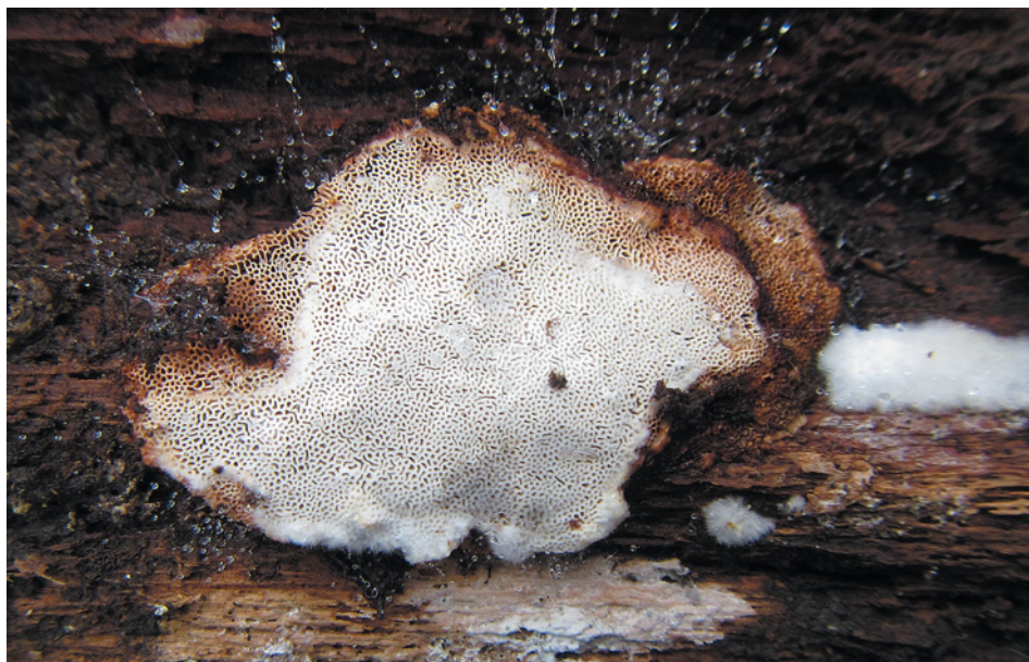
Fig. 2. Antrodia albobrunnea on dead Scots pine ( Pinus sylvestris ) in Eckerö, 31 Aug 2014 (PK 8379).