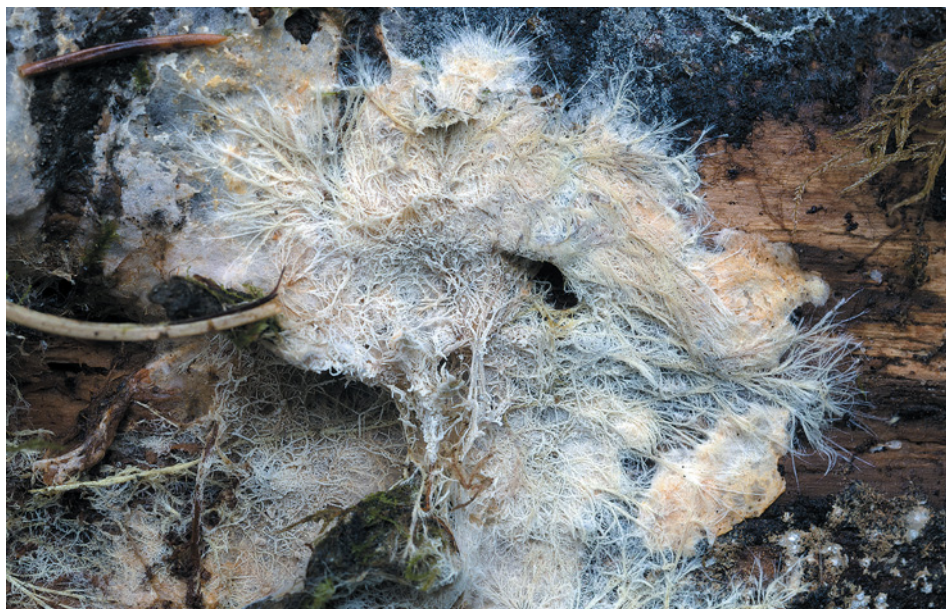
Fig. 4. Phlebiella christiansenii on Norway spruce ( Picea abies ) in Rovaniemi, 6 Oct 2014 (MK 55/14).