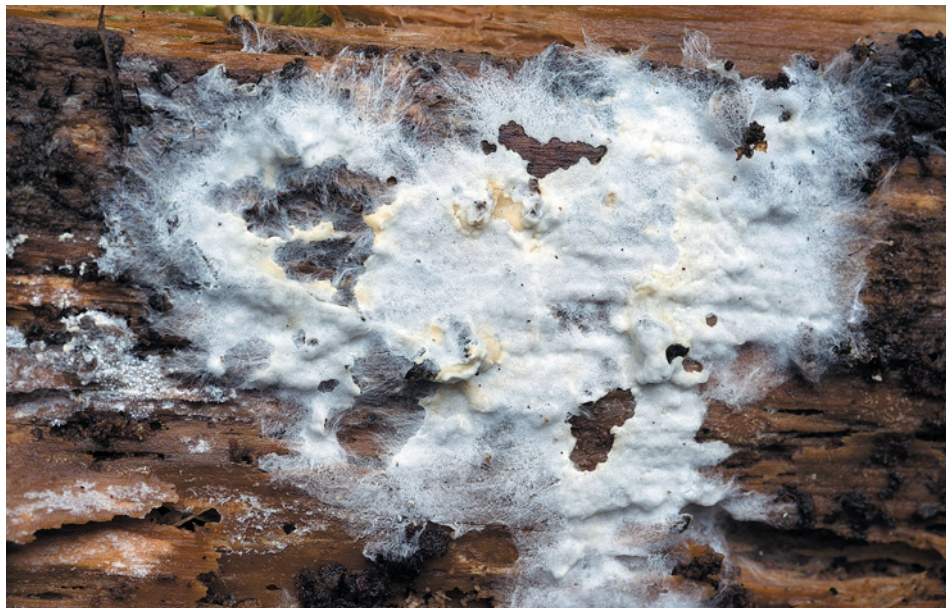
Fig. 3. Ceraceomyces borealis on dead Norway spruce ( Picea abies ) in Rovaniemi, 6 Oct 2014 (MK 70/14).