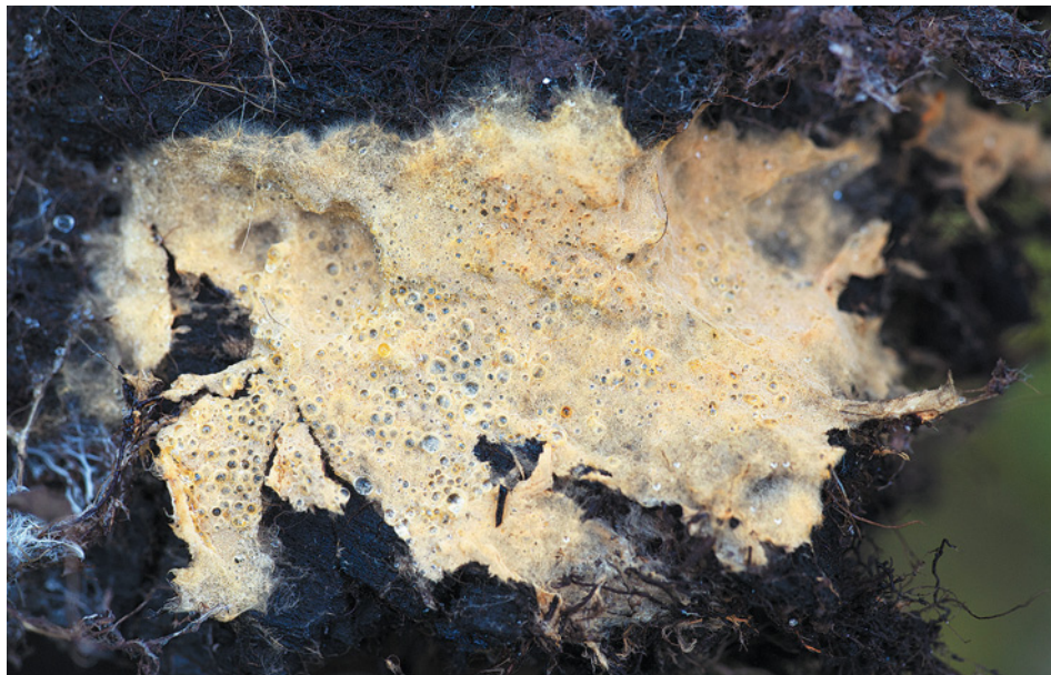
Fig. 5. Tretomyces microsporus on dead Scots pine ( Pinus sylvestris ) in Paltamo, 2 Sep 2012 (P. Helo 2306).