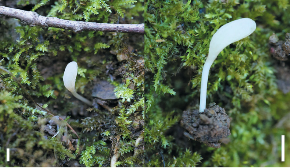
Fig. 1. Typhula spathulata , fresh basidiomata on natural substrate (OKA 1825). Scale bars = approx. 2 mm.

Medulla of the clavula comprised of parallel arranged hyphae, 8–12 \mu\text{m} wide, clampless, thin-walled. Hymenium non-gelatinised. Basidiospores 8–10 \times 3.0–4.5 \mu\text{m} , amyloid, smooth, elliptical to cylindrical, bean-shaped and depressed on one side, with short apiculus. Basidia 30–35 \times 5–8 \mu\text{m} , claviform, with usually four, rarely two sterigmata, without basal clamp.