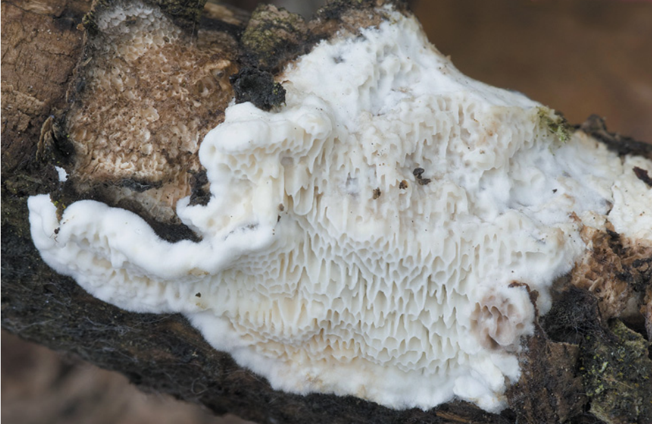
Fig. 1. Fresh basidiocarp of Cartilosoma rene-hentic , reclaimed mine spoil Antonín near Sokolov, Czech Republic (HR B000001, PRM 951454).