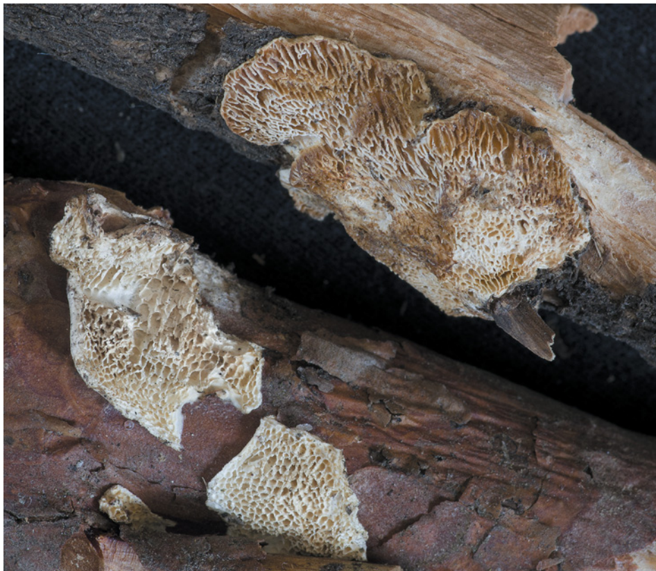
Fig. 3. Dried basidiocarp of Cartilosoma rene-hentic (above, HR B000001) and C. ramentaceum (below, herb. L. Zíbarová no. 6568).