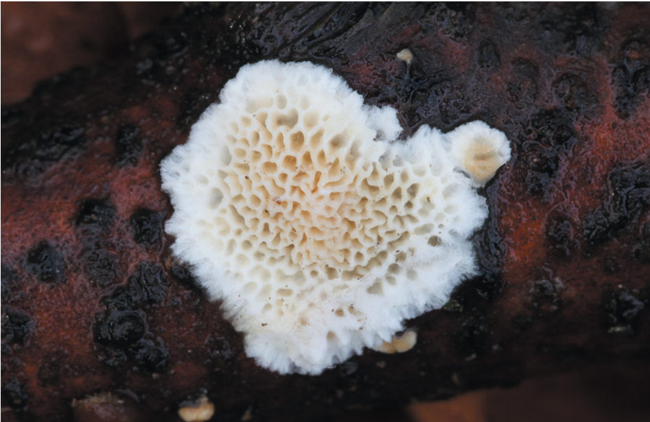
Fig. 2. Fresh basidiocarp of Cartilosoma rene-hentic , Radotínské údolí Nature Reserve, Český kras (Bohemian Karst), Czech Republic (PRM 951086).