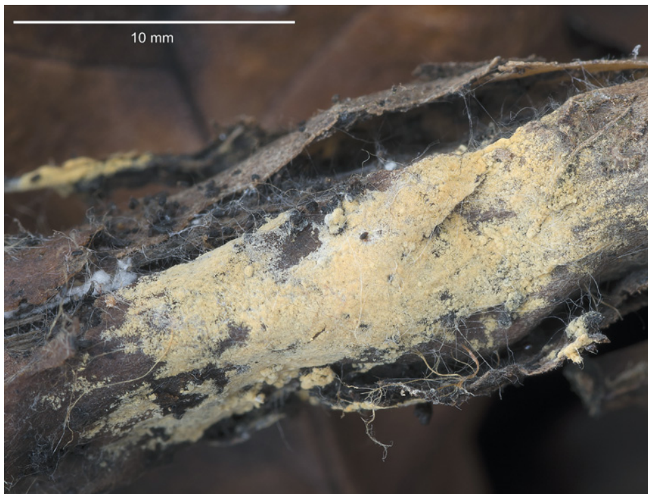
Fig. 1. Basidioma of Athelidium caucasicum (HR B000023). Scale bar = approx. 1 cm.