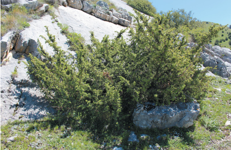
Fig. 1. The elongated juniper ( Juniperus oblonga ) growing on south-facing slope.