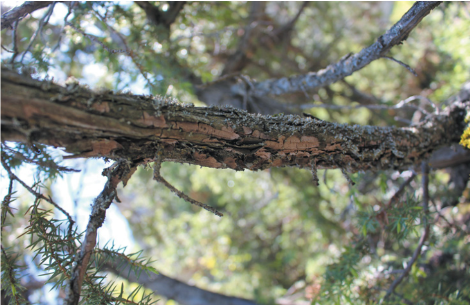
Fig. 3. Basidiocarps of Peniophora junipericola on fallen trunk of Juniperus oblonga (LE 314762).