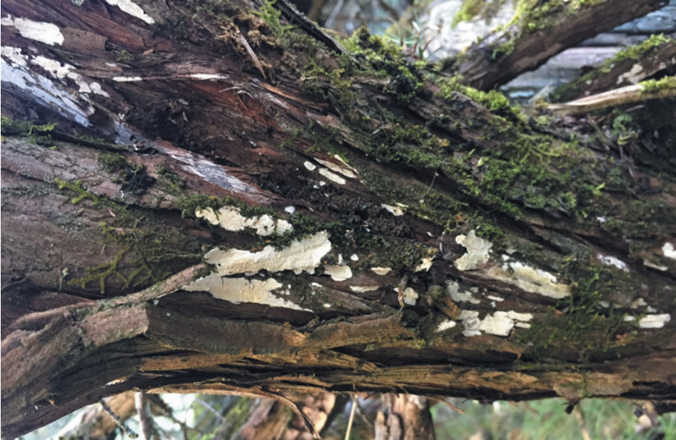
Fig. 2. Basidiocarps of Lyomyces juniperi on bark of living trunk of Juniperus oblonga (8 October 2018, not documented by voucher).