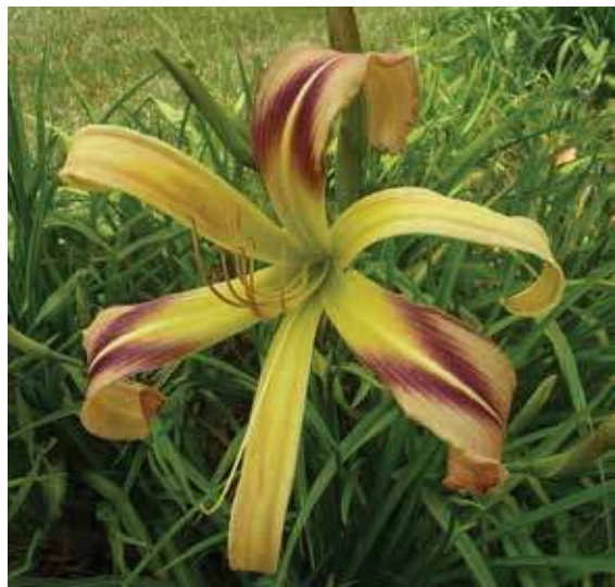
H. 'Tennessee Flycatcher' ( Harris-Reinke ) Dip: 34", 10" spider ratio 5.60: 1; HM 1996