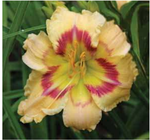
H. 'Violet Explosion' (Stamile) Dip: 25", 6.5"; No Awards