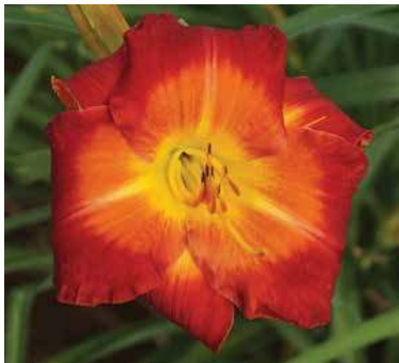
H. 'Magic Carpet Ride' ( D. Kirchhoff ) Tet: 28", 6"; HM 1996, AM 1999