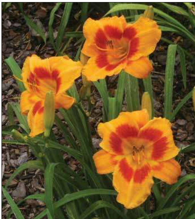
H. 'Eye-yi-yi' (McCroskey 1988)