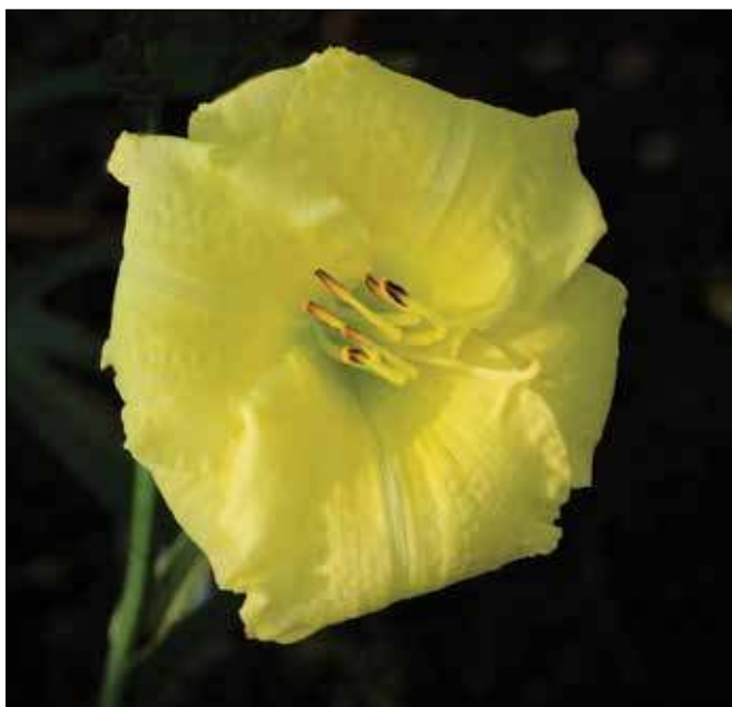
H. 'Marble Faun' (Millikan 1983)

green throat, won an HM in 1990. Another tetraploid, ' Old Tangiers ' (1985), a 28", 5" tangerine with red eyezone and chartreuse throat, won an HM in 1993. Among other diploids, ' Snowed In ' (1985), a 25", 5.5" white with light green overlay and a green throat, won an HM in 1991; ' Green Eyed Lady ' (1985), a 24", 4.5" yellow green self with a green throat, won an HM in 1991; ' Video ' (1985), a 20", 5" lemon yellow self with a green throat, won an HM in 1992; ' Carlotta ' (1986), a 25", 4.5" blend of red and cherry pink with cream midribs and a green throat, won an HM in 1993; ' Chantelle ' (1988), a 24", 4.5" bright pink with lighter midribs and green throat, won an HM in 1993; and ' Camay ' (1989), a 20", 4.5" rich medium pink self with a very green throat, won an HM in 1995. Millikan registered several daylilies in conjunction with