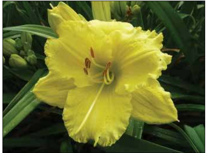
H. 'Floyd Cove' ( Stamile 1987)