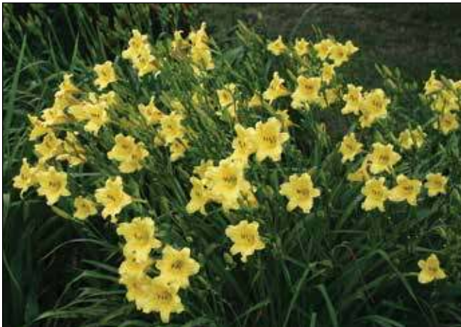
H. 'Toy Trumpets' (Sobek 1984)