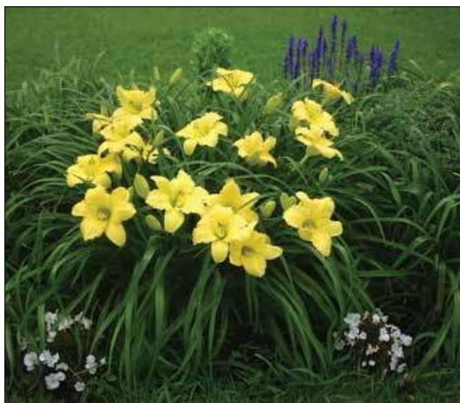
H. 'Andrew Christian' (Harris-Benz 1990)