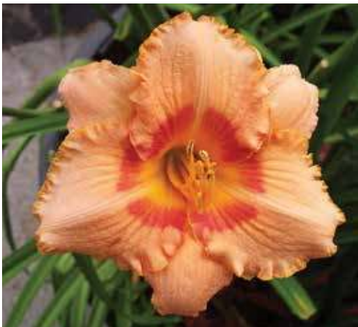
H. 'Roses with Peaches' (D. Kirchhoff)

Dip: 34", 6"; HM 2013