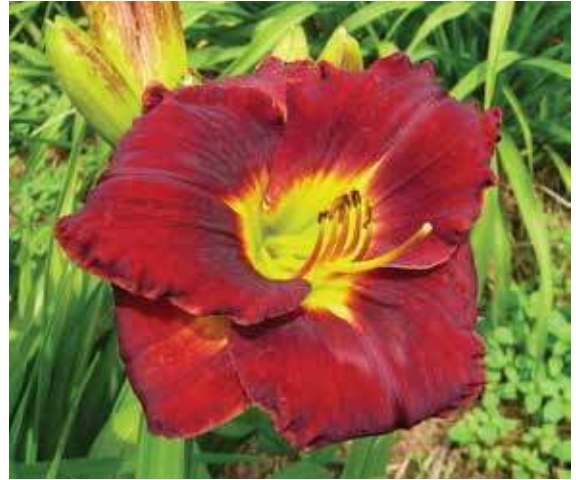
H. 'Rain Dance' (Benz) Tet: 28", 5"; HM 2000