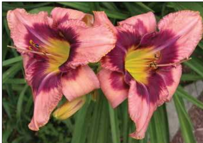
H. 'Emperor's Dragon' (R. W. Munson, Jr. 1988)

a chartreuse yellow throat, won an HM in 1993. 'Lexington Avenue' (1990), a 24", 6" wine with whitish wine eyezone and a greenish yellow throat, won an HM in 1995. These represent but a fraction of his award winners. Notable among his many cultivars which have not been recognized for awards are 'Nairobi Night' (1983), a 30", 6" purple with a large cream lavender eye above a yellow green throat; 'Nile Plum' (1984), a 20", 5" silvery mauve plum with plum claret eyezone and a yellow green throat; and 'Grand Palais' (1987), a 24", 6" silvery lilac lavender self with a lemon cream throat.