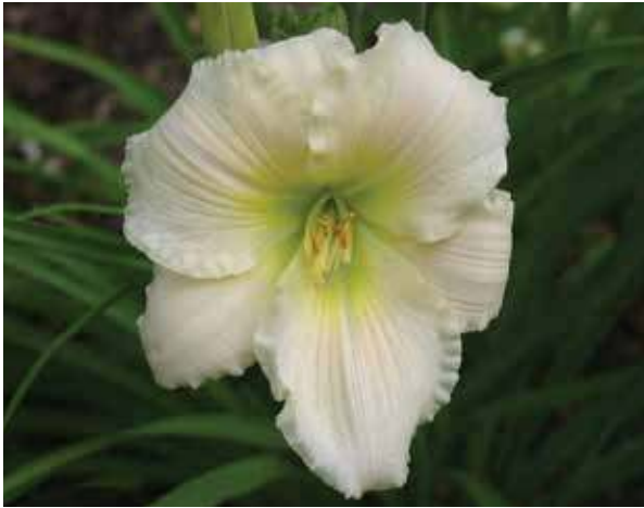
H. 'Southern Tradition' (Wall) Dip: 30", 5.5"; No Awards