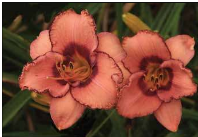
H. 'Lady Dancer' (Rasmussen 1989)

(1987), a 24", 4.5" golden yellow with a red eyezone and gold throat, won an HM in 1997. 'Raging Tiger' (1987), a 25", 6" burnt orange and yellow blend with a wine red eyezone and an orange yellow throat, won an HM in 1990. 'Lady Dancer' (1989), a 28", 5.5" rose pink blend edged plum with a green gold throat, won an HM in 2000. Several of his tetraploids from the historical period, however, have been overlooked for awards, among them: 'Island Blackout' (1981), a 34", 6.5" black red blend with a gold throat; 'Moonless Night' (1985), a 30", 6" black red self with a yellow green throat; and 'Modern Design' (1989), a 24", 4" beige pink with a dark plum eyezone and green throat. In all, he is credited with 65 registrations.