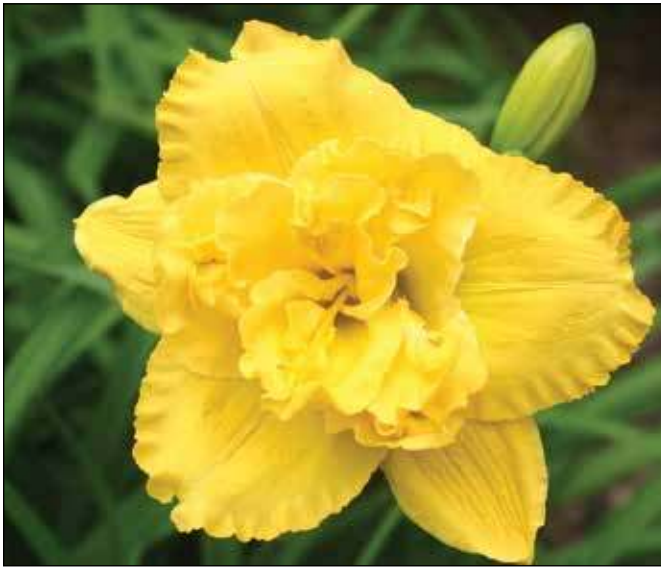
H. ‘ Betty Woods ’ (Kirchoff-D. 1980)