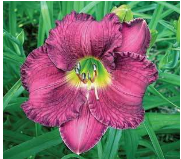
H. 'Solomons Robes' ( Talbott ) DIP: 30", 6"; HM 1995, AM 1998