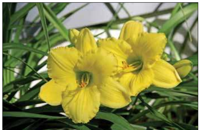
H. 'Atlanta Full House' (Petree 1984)