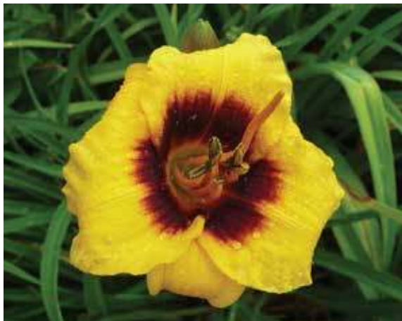
H. 'Lightning Bug' (Kroll) Dip: 16", 2.25"; Florida Sunshine Cup 2002