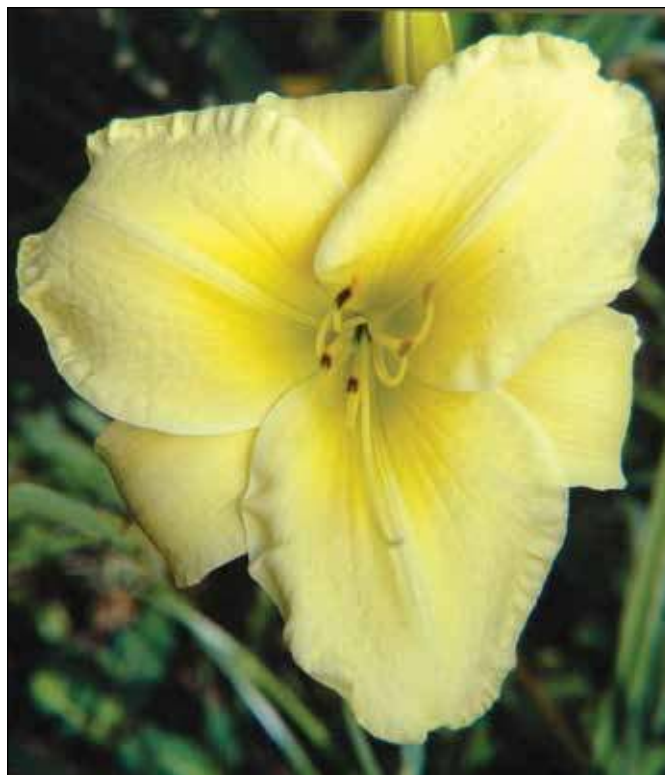
H. 'Irish Melody' (Benz 1989)