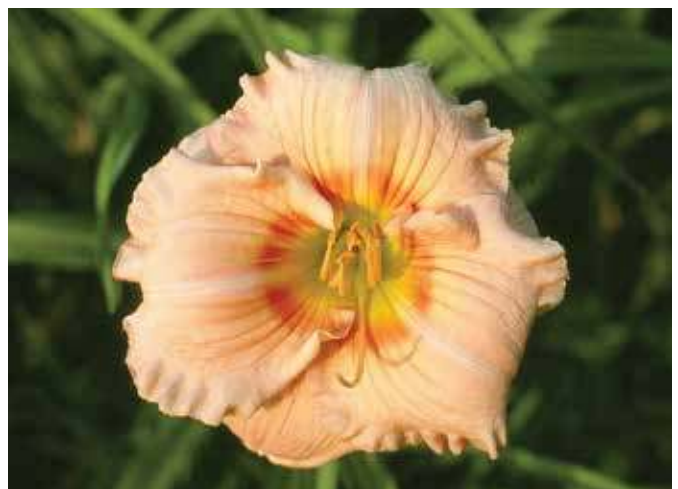
H. 'In Glad Adoration' (Billingslea) Dip: 22", 6"; HM 1998