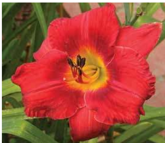
H. 'Pedro Osornio' (R. Mercer) Tet: 26", 5.5"; HM 2000