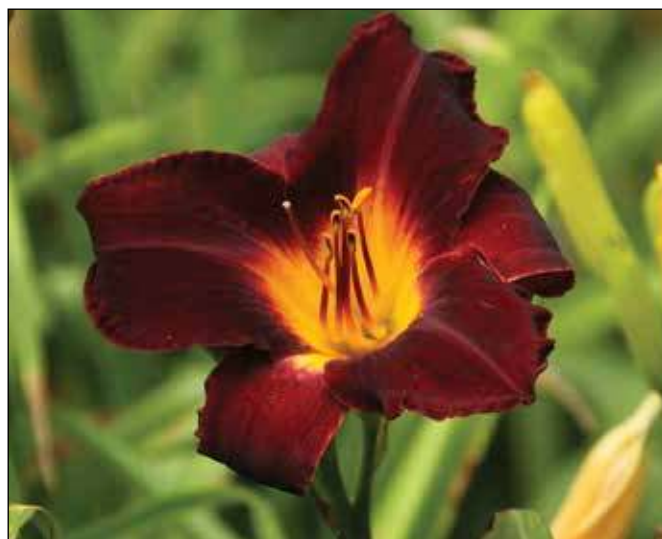
H. 'Moonless Night' (Rasmussen 1985)

(1987), a 24", 4.5" golden yellow with a red eyezone and gold throat, won an HM in 1997. 'Raging Tiger' (1987), a 25", 6" burnt orange and yellow blend with a wine red eyezone and an orange yellow throat, won an HM in 1990. 'Lady Dancer' (1989), a 28", 5.5" rose pink blend edged plum with a green gold throat, won an HM in 2000. Several of his tetraploids from the historical period, however, have been overlooked for awards, among them: 'Island Blackout' (1981), a 34", 6.5" black red blend with a gold throat; 'Moonless Night' (1985), a 30", 6" black red self with a yellow green throat; and 'Modern Design' (1989), a 24", 4" beige pink with a dark plum eyezone and green throat. In all, he is credited with 65 registrations.