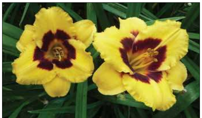
H. 'Blackberry Candy' (Stamile 1989)