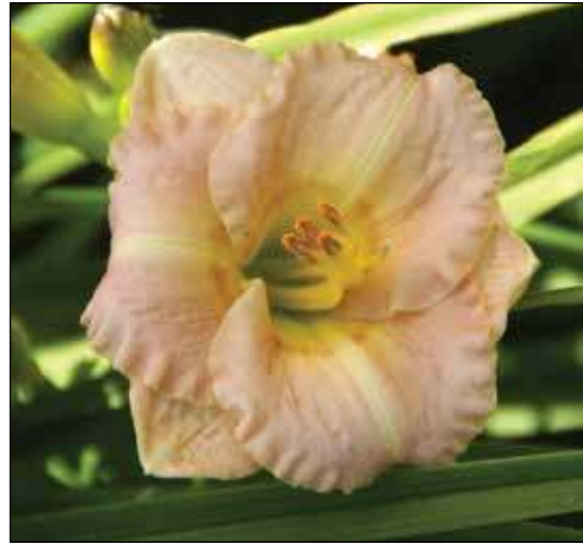
H. 'Cowrie Flower' (Weston 1988)

administrator for the Detroit Institute of Arts, which housed a fine collection of African artifacts. Her diploid, 'Bologongo' (1986), a 16", 5.5" Chinese red self with a yellow green throat, named for a 15th-century African king, won an HM in 1991. 'Bubbling Brown Sugar' (1987), a 27", 5.5" yellow edged cinnamon tetraploid with a brown eyezone and green yellow throat, won an HM in 1992. 'Cowrie Flower' (1988), a 16",