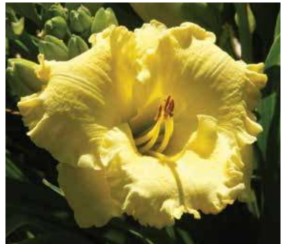
H. 'Emperor's Choice' (Benz) Tet: 24", 5"; HM 1998