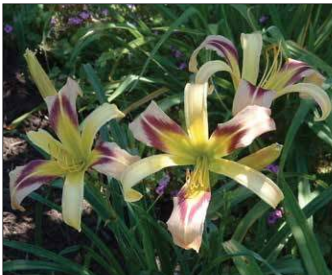
H. 'Rainbow Spangles' (Temple 1983)