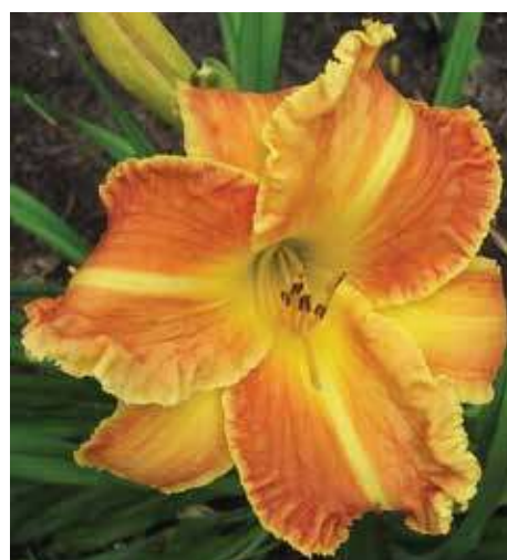
H. 'Butter Pecan' ( Gould ) Tet: 30", 6.5"; HM 1999