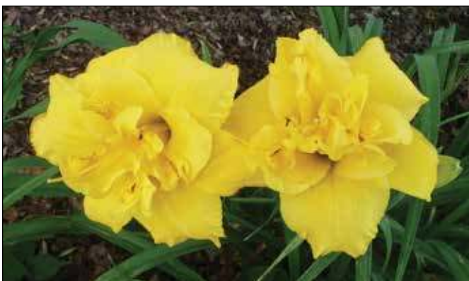
H. 'Layers of Gold' (Kirchhoff-D. 1990)