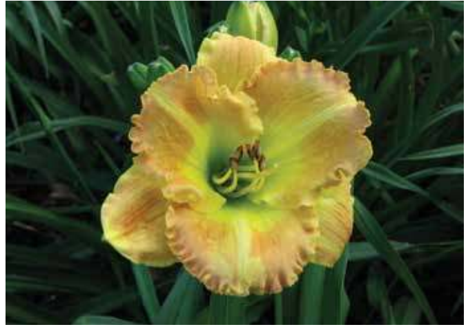
H. 'Smuggler's Gold' ( Branch ) Tet: 24", 6" HM 1997, AM 2002