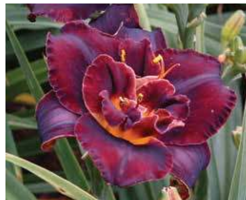
H. 'Ezekiel' (Talbot) Tet: 28", 5" double; HM 1995