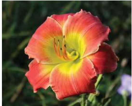
H. 'God is Listening' (Hansen) Dip: 26", 4"; HM 2000