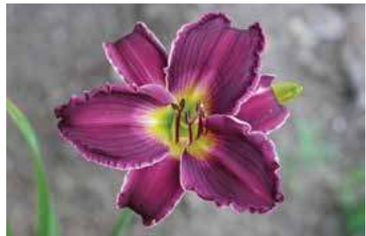
H. 'Indian Giver' (Ferguson) Dip: 20", 4.5"; HM 1997, AM 2000