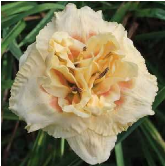
H. 'Siloam Peony Display' ( P. Henry ) Dip: 18", 6" double; HM 1995