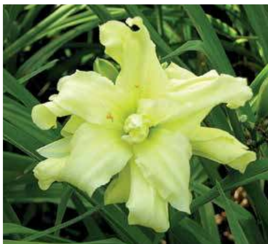
H. 'Maymont Double' (Larch) Dip: 32", 6.5" double; HM 2019