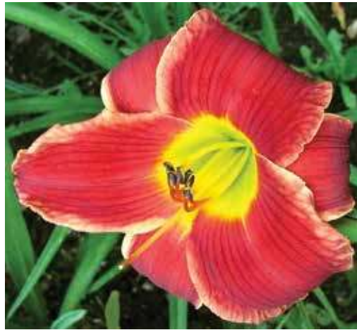
H. 'Street Urchin' D. Kirchhoff) Tet: 25", 5.5"; HM 1998