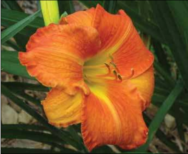
H. 'Old Tangiers' (Millikan 1985)