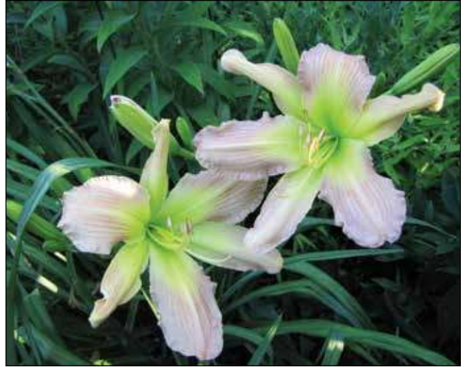
H. 'Prague Spring' (Lambert 1985)