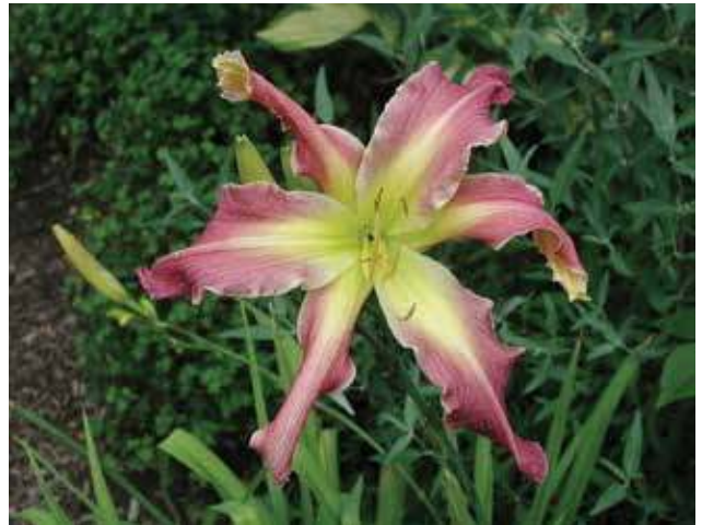
H. 'Chin Whiskers' (McRae) Dip: 20", 5", unusual form crispate; No Awards