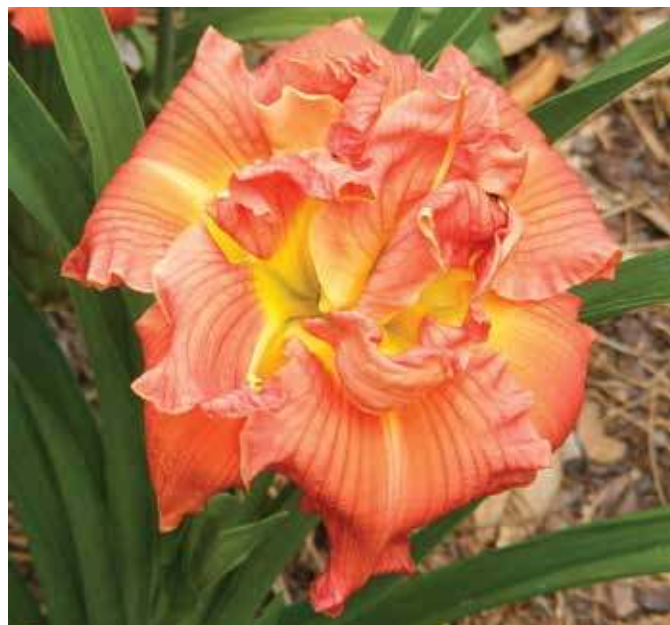
H. 'Feisty'

with (left to right) Russian sage, dried alliums, Gold Mop False Cypress, Ageratum houstonianum, Nicotina alata, sedum, and rose campion