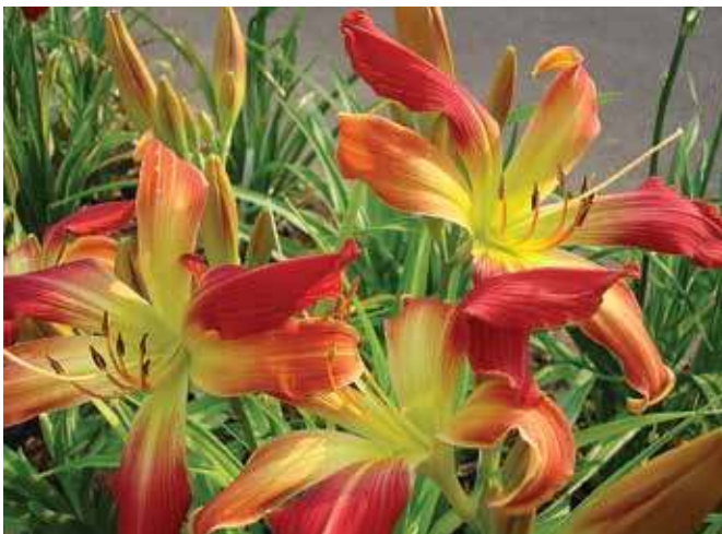
H. 'Hot Wheels' (Calhoun) Dip: 36", 8.5" spider ratio 5.50:1; No Awards