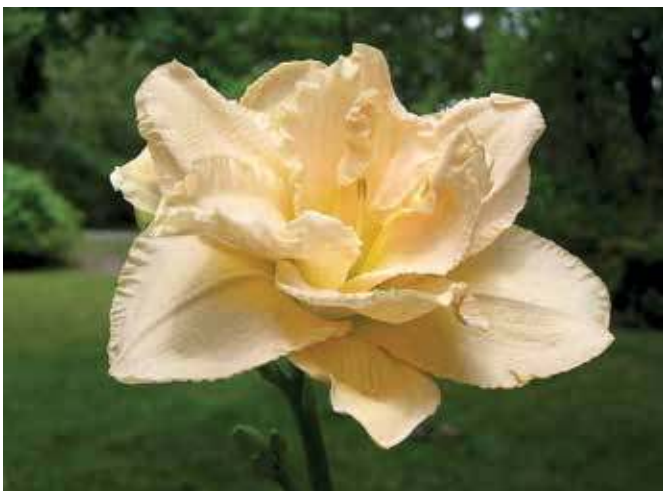
H. 'Land of Cotton' (Joiner) Dip: 30", 6" double; HM 1995