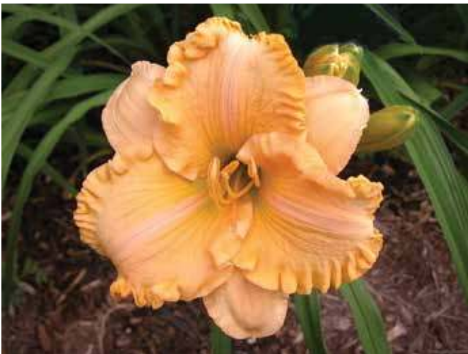
H. 'Alexandra' (Salter) Tet: 24", 5.5"; HM 1997