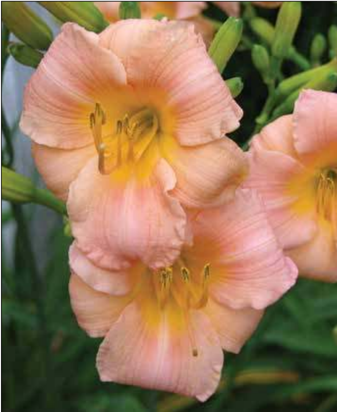
H. 'Promises Promises' (Warner 1981)