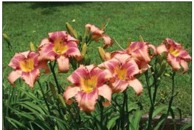
H. 'Designer Jeans' (Sikes 1983)

deep orange red eyezone and a green throat, which received an HM in 1993; 'Restless Heart' (1985), a 27", 6" golden orange blend with a red eyezone and green throat, which won an HM in 1996; 'Heartfelt' (1987), a 26", 6" red orange with a deep orange red halo and a green yellow throat, which won an HM in 1993; 'Designer Rhythm' (1987), a 25", 6" light mauve blend with deep lavender petal edges and a deep lavender eyezone above a green yellow throat, which received an HM in 1994; and 'Royal Dancer' (1988), a 25", 5.5" brick red with a deeper halo and a green yellow throat, which won an HM in 1993. Her 'Designer Image' (1987), a 20" 5.5" lemon beige with a large deep lavender eyezone and petal edges above a green yellow throat, also deserves notice. It won an HM in 1999. Among the most famous of her tetraploids was 'Designer Jeans' (1983), a 34", 6.5" lavender with dark lavender edges and eyezone and a yellow green throat. It won an