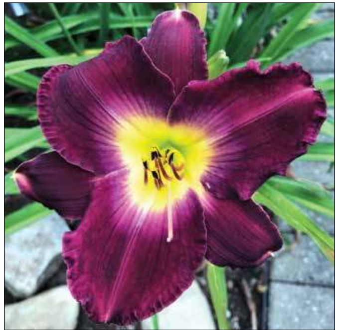
H. 'Strutter's Ball' (Moldovan 1984)

'Vera Biaglow' (1984), a 28", 6" rose pink edged silver with a lemon green throat, captured an HM in 1989 and an AM in 1993. 'Pewter Lake' (1986), a 28", 6" gray bluish lavender blend with deeper veins and a lemon yellow green throat, won an HM in 1991. 'Avante Garde' (1986), a 26", 5.5" amber tan bitone with a red orange eyezone and a yellow green throat, won an HM in 1993, and 'Geppetto' (1986), a 26", 5" pink cream with a strong pink eyezone and yellow green throat, won an HM in 1994. Four other tetraploids, registered on the cusp of the next decade, are worth mentioning. 'Anchors Aweigh' (1990), overlooked for awards, is a 28", 6" bluish violet blend