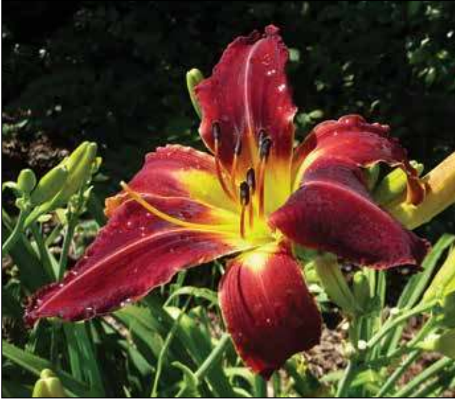
H. 'Samar Star Fire' (Sullivan 1985)