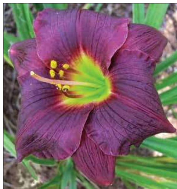
H. 'Poe's Raven' (Ury Winniford 1985)