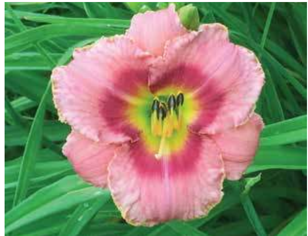
H. 'Sublime Enchantment' (D. Kirchhoff) Tet: 25", 4.25"; HM 1996