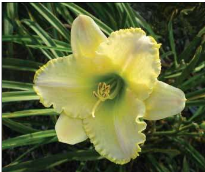
H. 'Fragrant Bouquet' (Reckamp-Klehm 1989)