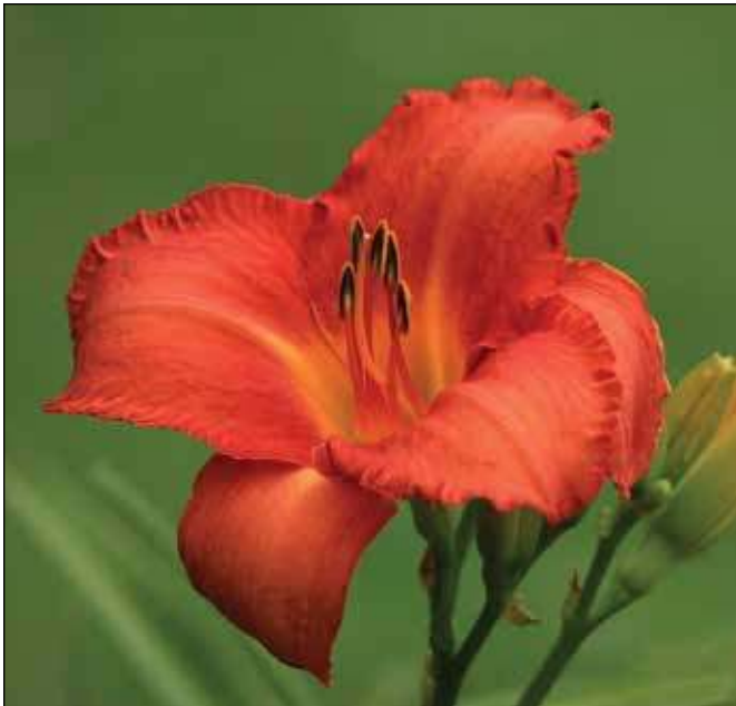
H. 'Hot Ember' ( Stamile 1986)