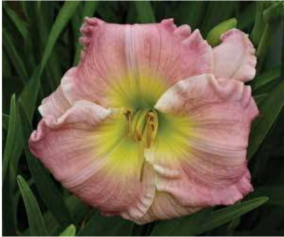
H. 'Pink Scenario' (Sikes) Dip: 19", 5.5"; HM 1997