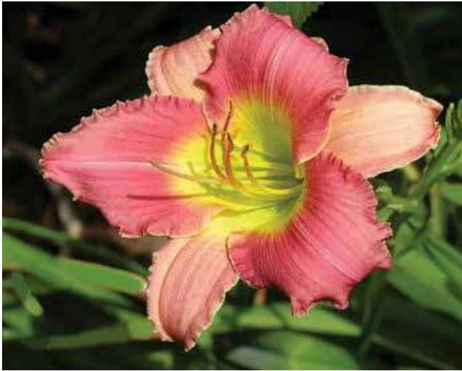
H. 'Final Touch' (Apps) Dip: 32", 4.75"; HM 1996