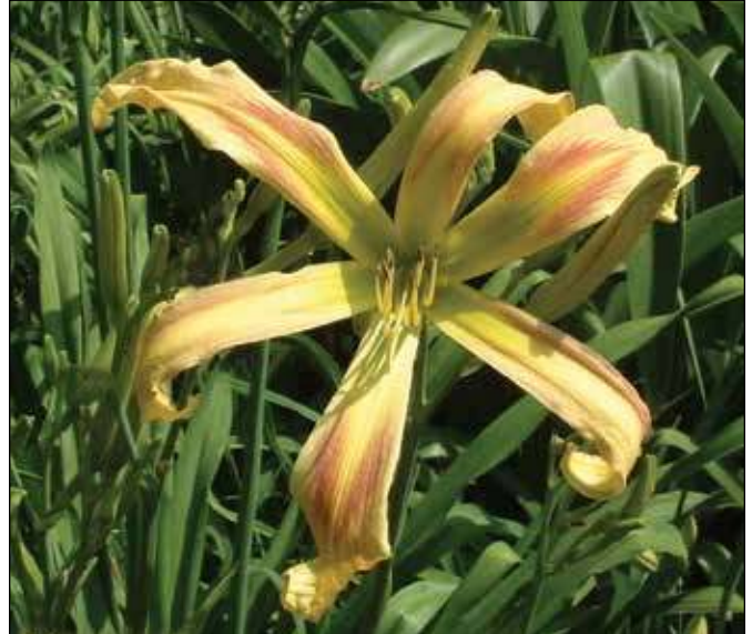
H. 'Slender Lady' (Crandall 1987)

yellow amber self with a very green throat and a spider ratio of 5.00:1, won an HM in 1997. 'Satan's Curls' (1987), a 29", 6" unusual form crispate red with a yellow band outside a very green throat, was popular, but also overlooked for an award. In contrast, 'Calico Spider' (1987), a 32", 6.75" gold with a brown mahogany eyezone and a spider ration of 4.20:1, eventually won an HM in 2011.