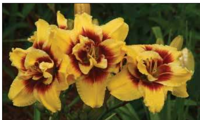
H. 'Mount Helena' (Grooms 1985)