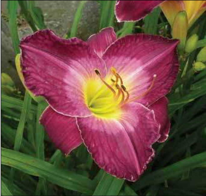
H. 'Tuxedo Moon' (Hanson 1989)