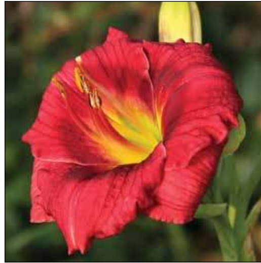
H. 'Siloam Grace Stamile' (Henry-P. 1984)

throat, won an HM in 1989. 'Siloam Grace Stamile' (1984), a 14", 2.2" red with deeper red halo and green throat, won an HM in 1987 and the Donn Fischer Award in 1991. And the list goes on. 'Siloam Merle Kent' (1984), an 18", 3.5"