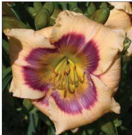
H. 'Jason Mark' (Crochet 1989)