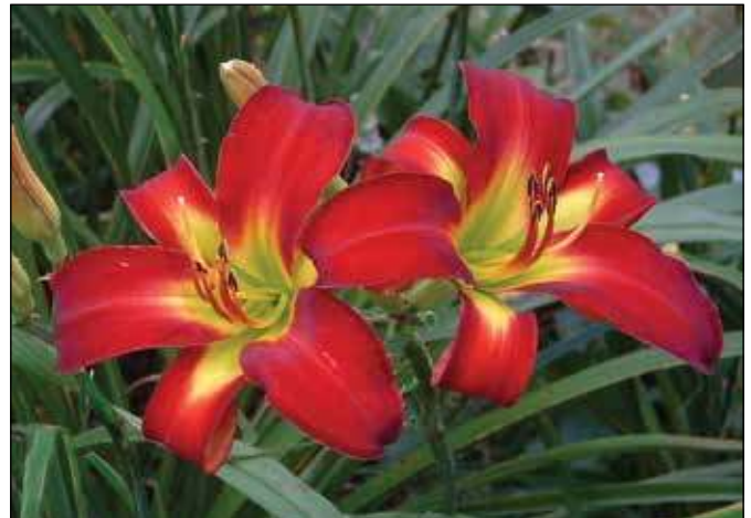
H. 'Fire from Heaven' (Grovenstein 1985)

Seasons' (1990), a 21", 2.62" light yellow self with a very small green throat; 'Echo the Sun' (1990), a 41", 3.25" bright yellow self with a green throat; and 'Cool Spice' (1990), a 36", 5.25" greenish yellow self with a green throat, are indicative of his registrations.