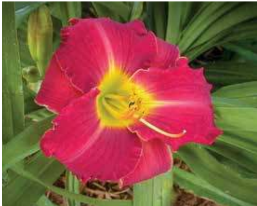
H. 'Obsession in Red' ( D. Kirchhoff ) Tet: 28", 4.5"; HM 1994