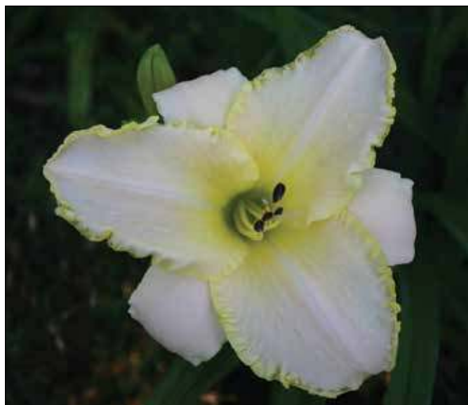
H. 'Wedding Band' (Stamile 1987)