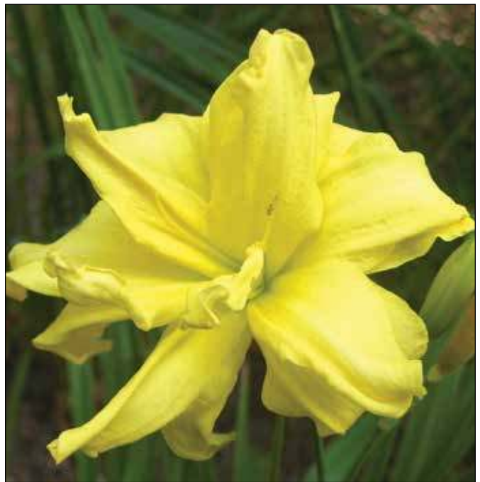
H. 'Double River Wye' (Kropf 1982)