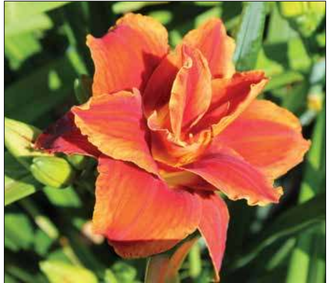
H. 'Fires of Fuji' (Hudson 1990)