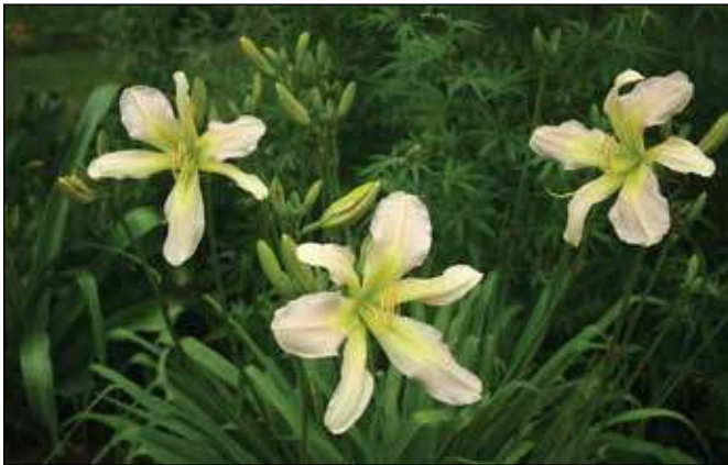
H. 'Asterisk' (Lambert 1985)