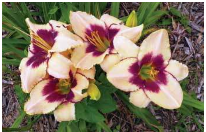
H. 'Lin Wright' (Morss) Tet: 24", 6"; HM 2004