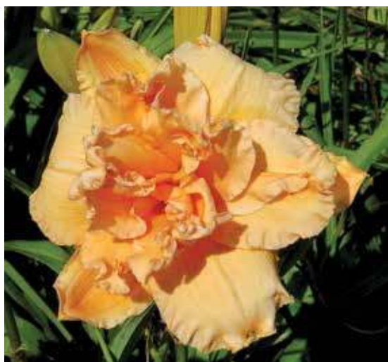
H. 'Madge Cayse' (Joiner) Dip: 24", 6" double; HM 1994, AM 1999 (Photo by Chris Petersen)