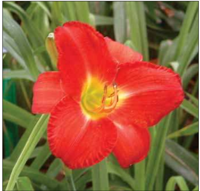
H. 'King Lamoni' (Roberson 1981)

between the late 1970s and mid 1990s, both diploids and tetraploids. For whatever reason, only one of his introductions has received an award. The diploid, H. 'Mormon' (1977), a 20", 8.5" near white self, won an HM in 1985. Although overlooked for awards, his tetraploid, 'King Lamoni' (1981), a 24", 5" scarlet self with a green throat, is still grown. He is perhaps best known for his diploid, 'Black Eyed Stella' (1989), a 13", 3.12" golden yellow with a dark red eyezone and a yellow gold throat. Though distributed commercially in thousands of plants, it nevertheless has not been recognized for awards by the AHS.