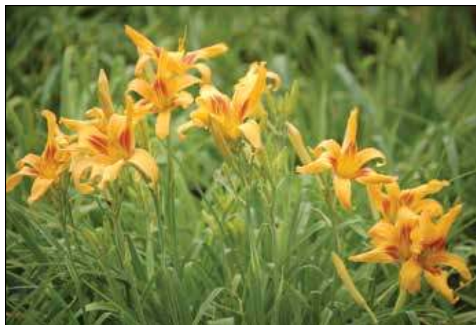
H. 'Crazy Pierre' (Whitacre 1990)

too remains overlooked. Jim is credited with a total of 14 cultivars. In the previous decade, John Whitacre had registered 'Trog' (1976), a 40", 7" deep red with chrome midribs and a chrome orange throat; it too has won no awards. Collectively, the Whitacres registered a total of 47 cultivars.