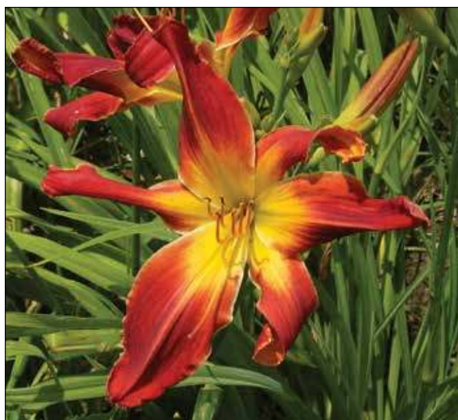
H. 'Tail Feathers' (McRae 1989)

3.5" lavender with a darker halo and a green yellow throat, and 'Tail Feathers' (1989), a 20", 7" tetraploid bright red and yellow spidery bicolor with a large green throat, both remain overlooked for an award.