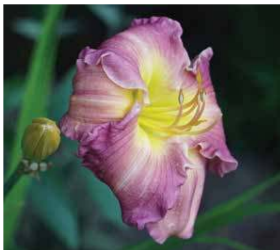
H. 'Wisteria' ( Dekerlegand ) Dip: 20", 5.75"; HM 2018