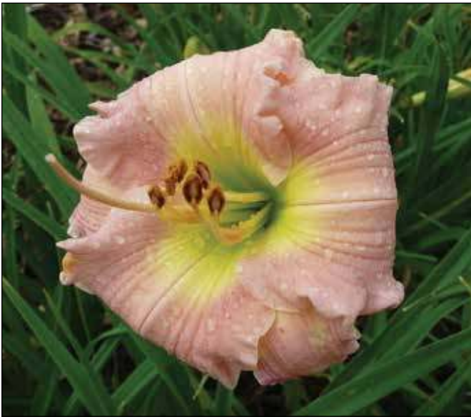
H. 'From Morning Dews' (Billingslea 1990)

HM in 1994. 'Michelangelo's David' (1990), a 21", 5.5" cream white with pink glow and a green throat, won an HM in 1995. 'From Morning Dews' (1990), a 22", 5" clear light pink self with a green throat, won an HM in 1997. 'Lights of Evening' (1990), a 25", 6" pale creamy yellow self with a green throat, won an HM in 1998. 'What Wondrous Love' (1990), a 24", 6" pink with a rose eyezone and green throat, won an HM in 1998. 'Mulberry Frost' (1990), a 20", 6" rose mulberry blend with a silvery blush and green throat, was popular, but was overlooked for awards. 'Rhythm in Pink' (1990), a 26", 6" veined light rose pink with a green throat, was also much admired, but overlooked for awards. As of the present, Oliver Billingslea has registered a total of 59 cultivars, for which he received 18 HMs, including the President's Cup at