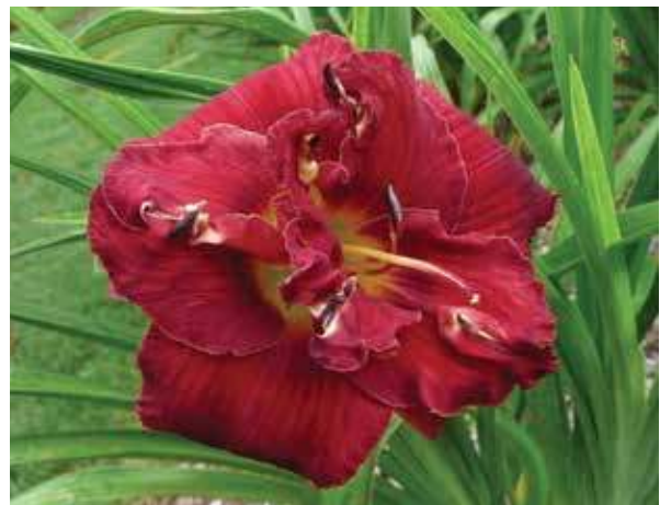
H. 'Wally' (T. Howard) Dip: 22", 5.25" double; HM 1994