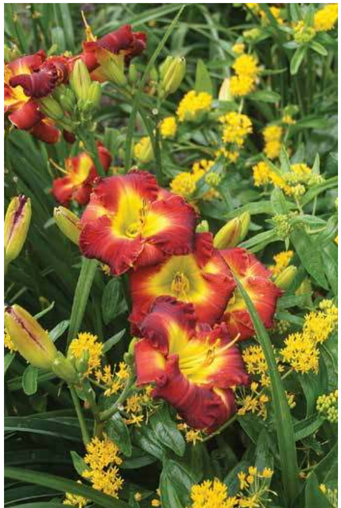
H. 'Dragon King' (D. Kirchoff) with Asclepias tuberosa 'Hello Yellow'