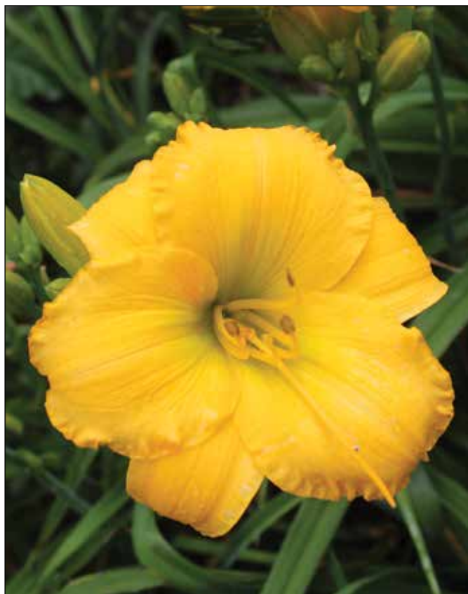
H. 'Forty Carats' (Benz 1988)