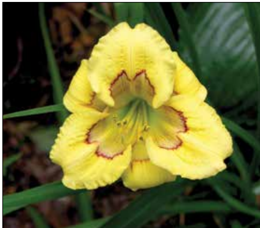
H. 'Patchwork Puzzle' (E.H. Salter 1990)