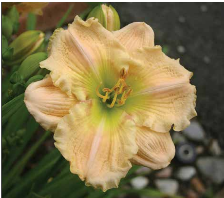
H. 'Elsie Spalding' (Spalding-W.M. 1985)