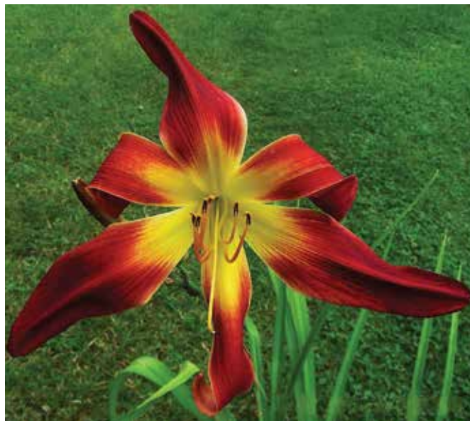
H. 'Starman's Fantasy' ( Burkey ) Dip: 30", 8" unusual form crispate; HM 2002