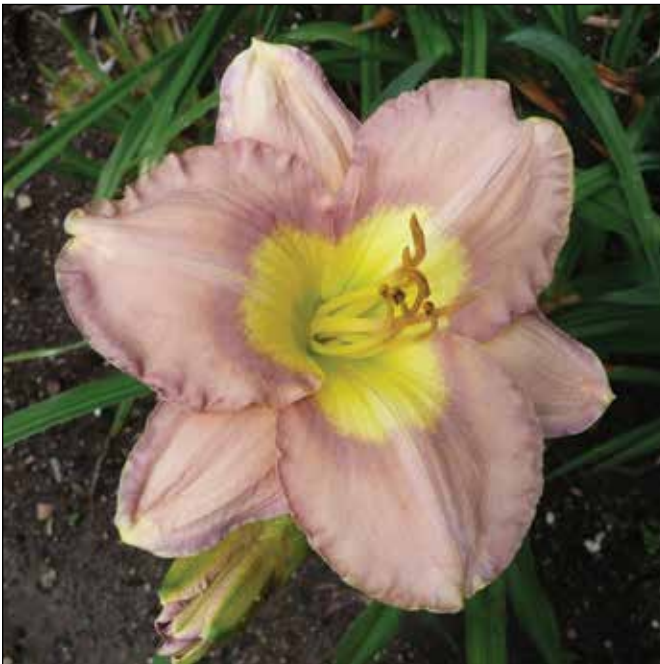
H. 'Mandala' (Morss 1988)

violet and gold with a violet eyezone above a yellow green throat, won an HM in 1992. 'Graceland' (1987), a 28" 6" pastel lavender, cream, and chartreuse polychrome edged gold with a yellow halo above a green throat, won an HM in 1992. 'Mandala' (1988), a 27", 5" creamy lavender edged gold with a green throat, won an HM in 1993. 'Mort's Magic' (1989), a 26", 5.5" medium mauve edged purple and white with a green throat, won an HM in 1995. 'Into the Mystic' (1990), a 26", 5.5" medium orchid edged gold with a lavender violet halo