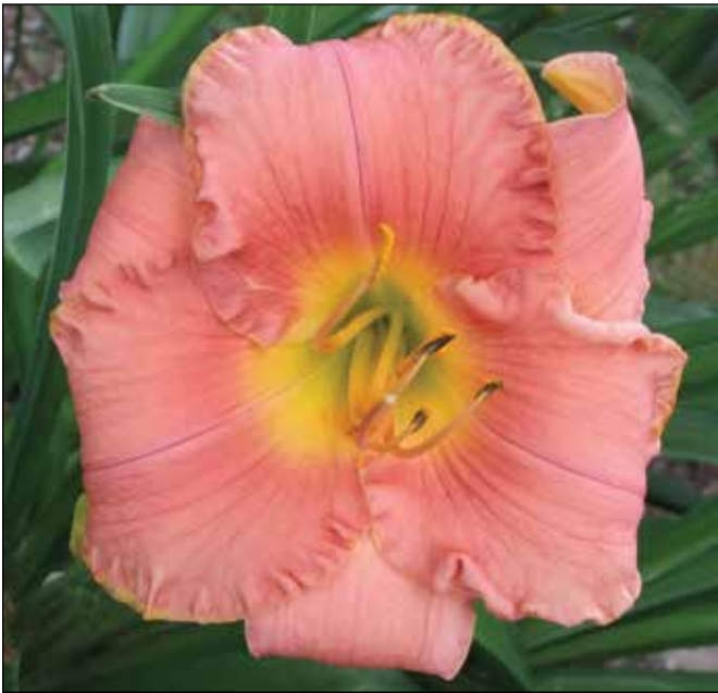
H. 'Silken Touch' (Stamile 1990)