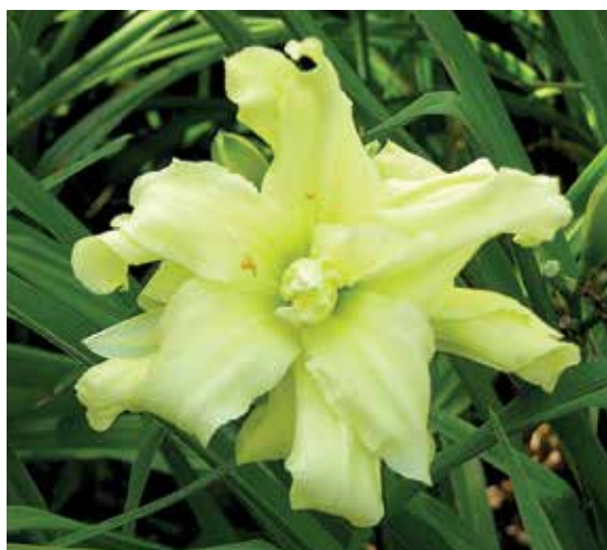
H. 'Maymont Double' (Larch) Dip: 32", 6.5" double; HM 2019