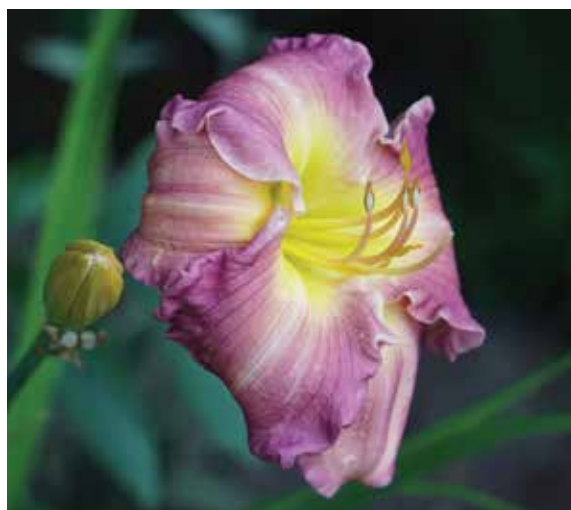
H. 'Wisteria' ( Dekerlegand ) Dip: 20", 5.75"; HM 2018