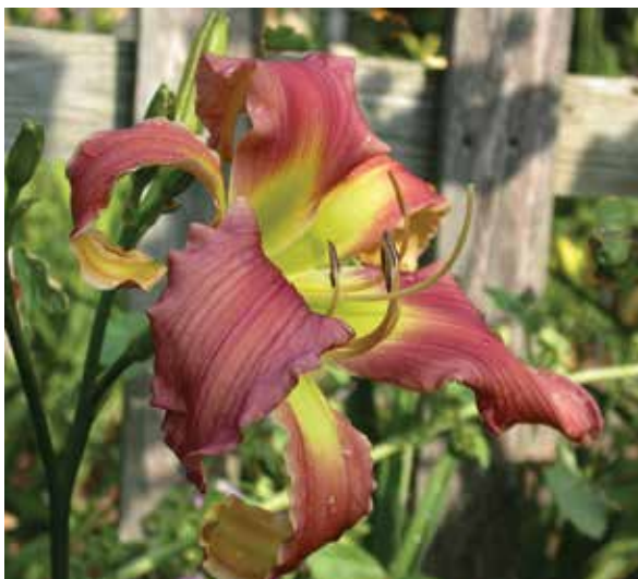
H. 'Curly Rosy Posy' (Hansen) Dip: 30", 9.5" spider ratio 5.20:1; HM 1999