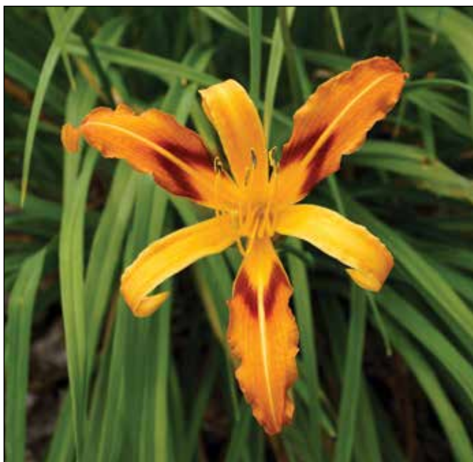
H. 'Twiggy' (Dickerson 1990)

18", 4" orange with a wine eyezone above a green throat and a spider ratio of 6.30:1. A tetraploid, 'Guinea Jubilee' (1990), a 30", 9" wine spider-type with a large gold eyezone and a green throat, has received no awards as well. In all, Dickerson registered a total of 134 cultivars.