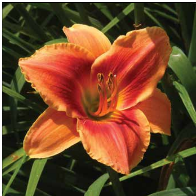
H. 'Avante Garde' (Moldovan 1986)