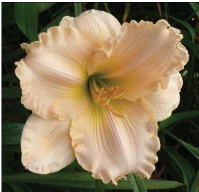
H. 'Southern Love' (Sikes 1985)