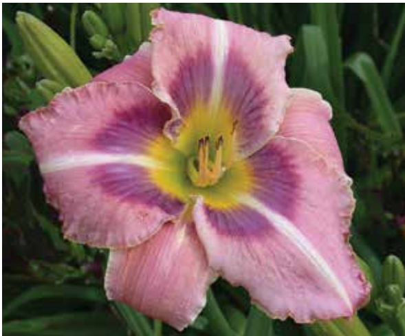
H. 'Last Flight Out' (Hansen) Tet: 22", 6"; HM 2000