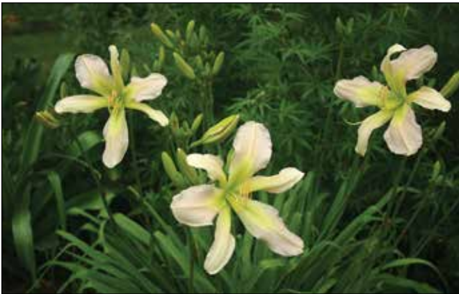
H. 'Asterisk' (Lambert 1985)