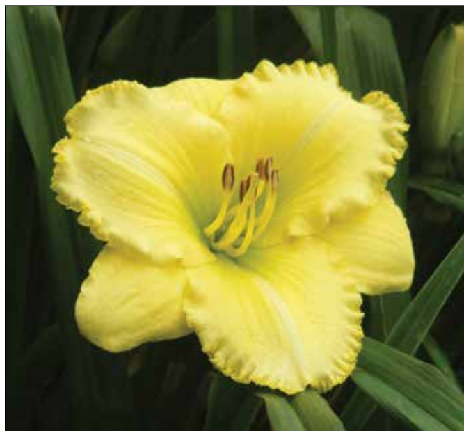
H. 'Atlanta Elegant Charm' (Petree 1990)