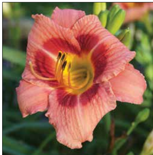
H. 'Decatur Cherry Smash' (Davidson 1981)

Clyde Davidson of Decatur, Georgia, continued registering his "Decatur" series of tetraploid daylilies into the 1980s. H. 'Decatur Cherry Smash' (1981), a 26", 4" medium pink with a cherry eyezone and a yellow green throat, won an HM in 1986. 'Decatur Double Dandy' (1981), a 32", 5" double medium red self with a yellow throat, however, remains overlooked. 'Decatur Piecrust' (1982), a 22", 5" salmon pink self, won an HM in 1985. 'Decatur Double Delight' (1983), a 26", 6.25" double light yellow self, remains overlooked.