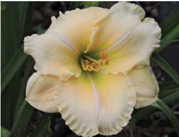
H. 'Champagne Elegance' (E.C. Brown) Dip: 29", 6.25"; HM 1997