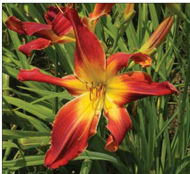
H. 'Tail Feathers' (McRae 1989)

3.5" lavender with a darker halo and a green yellow throat, and 'Tail Feathers' (1989), a 20", 7" tetraploid bright red and yellow spidery bicolor with a large green throat, both remain overlooked for an award.