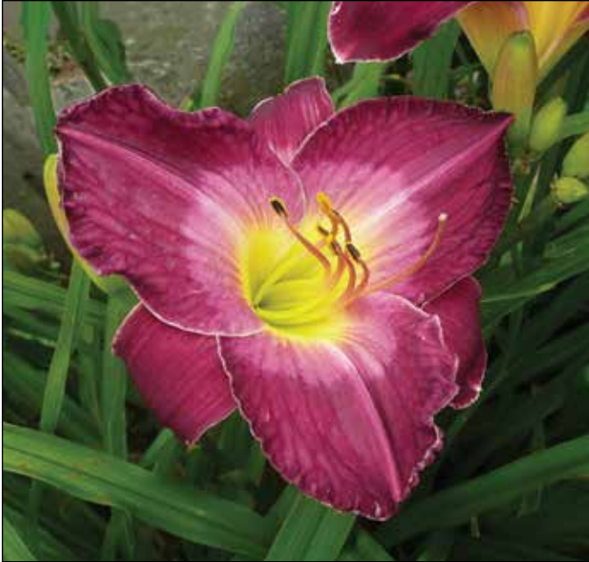
H. 'Tuxedo Moon' (Hanson 1989)