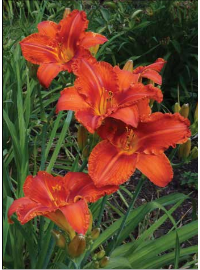
H. 'Alabama Jubilee' (Webster 1988)