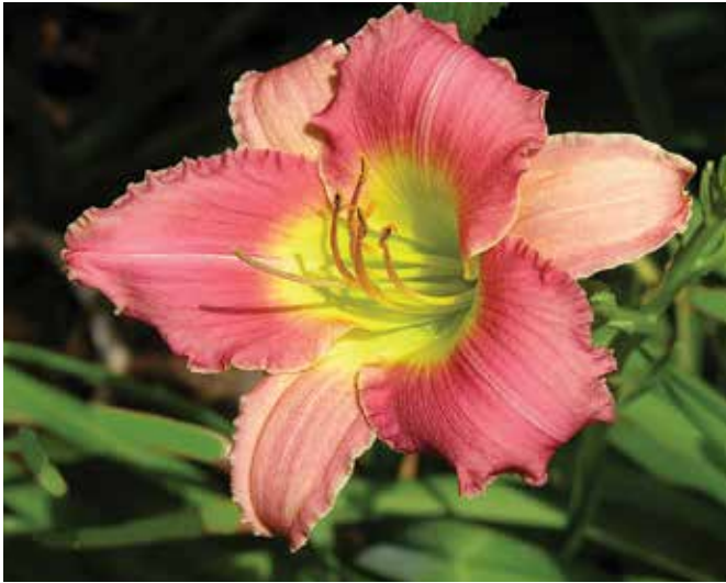
H. 'Final Touch' (Apps) Dip: 32", 4.75"; HM 1996