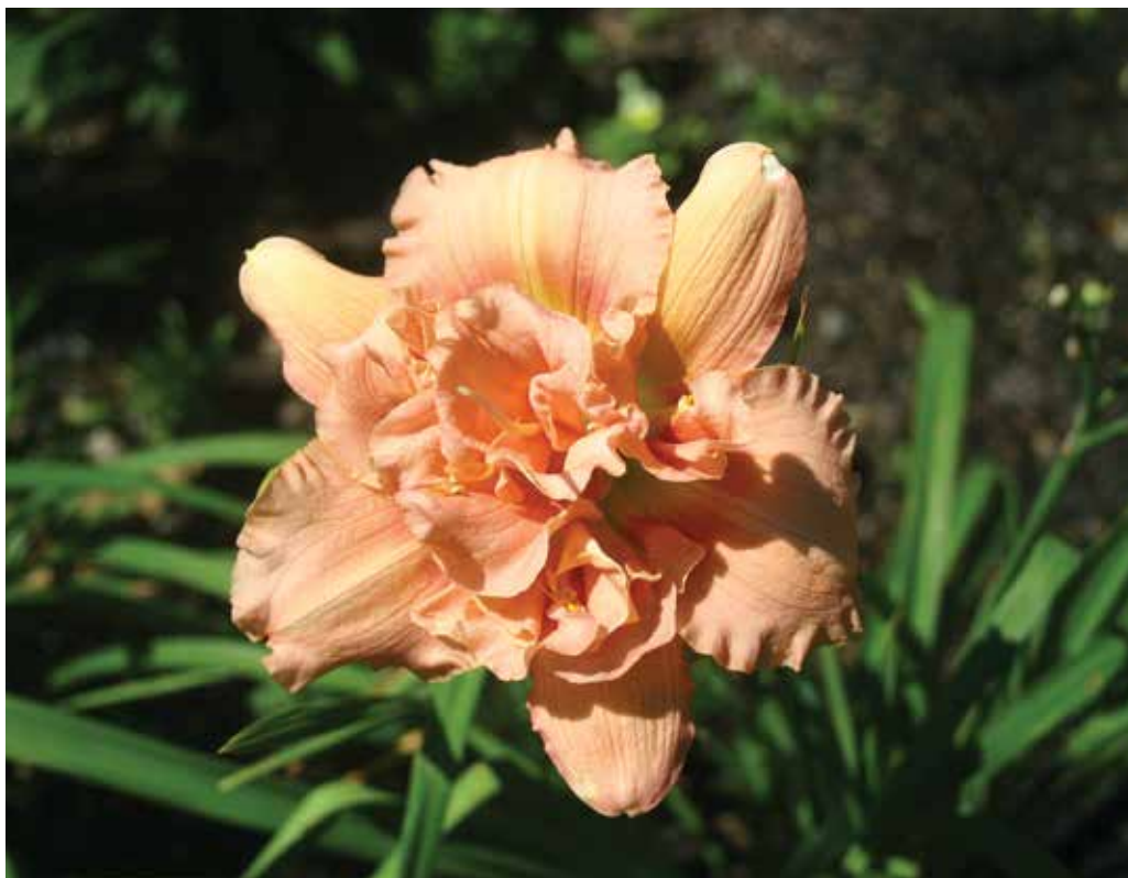
H. 'Yazoo Jim Terry' (Smith-Barfield) Dip: 20", 6" double; HM 2005