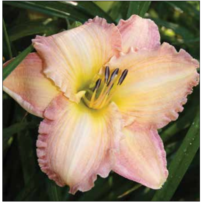
H. 'Princess Ellen' (Crochet 1985)

18", 5.5" cream with a rose border and a green throat, won an HM in 1989. 'Little Red Warbler' (1985), an 18" 3.5" dark red with a maroon eyezone and yellow green throat, won an HM in 1990; 'Pocket Change' (1985), an 18", 4.5" dark red with lighter red edges and a green throat, won an HM in 1993; and 'Candide' (1986), an 18", 3.5" rose salmon and pink blend with a fuchsia eyezone and chartreuse throat, won an HM in 1991. His unusual form crispate 'Pink Windmill' (1987), a 24", 6" spidery pink with a green throat, received an HM in 1994. One of his most famous diploids, 'Ellen Christine' (1987), a 23", 7" pink gold blend double with a dark green throat, won an HM in 1990, an AM in 1993, and the Ida Munson Award for doubles in 1994. His 'Olin Frazier' (1988), a