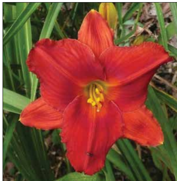
H. 'Nouveau Riche' (Apps 1990)