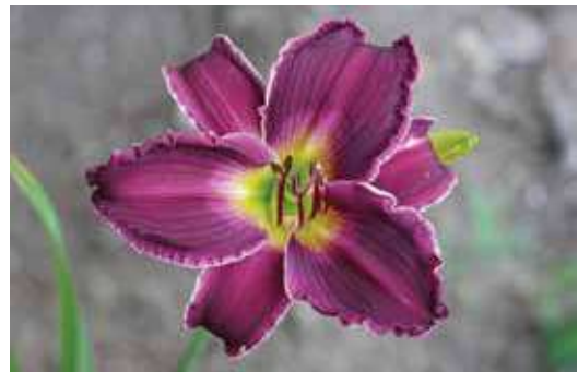
H. 'Indian Giver' (Ferguson) Dip: 20", 4.5"; HM 1997, AM 2000