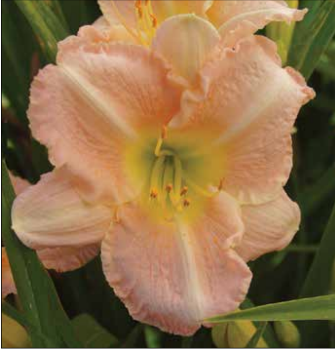
H. 'Delmar' (Whatley 1986)

(1986), a 20", 5" light yellow self with a green throat, was an exception to Whatley's breeding program in the 1980s in that it was a diploid. It won an HM in 1991. A second diploid, 'Delmar' (1986), a 20", 5" medium pink self with a green throat, won an HM in 1992. 'Sedalia' (1986), a 27", 6.5" rose pink tetraploid with a green throat, won an HM in 1993. 'Three Diamonds' (1986), a 27", 6" dark red tetraploid with a green