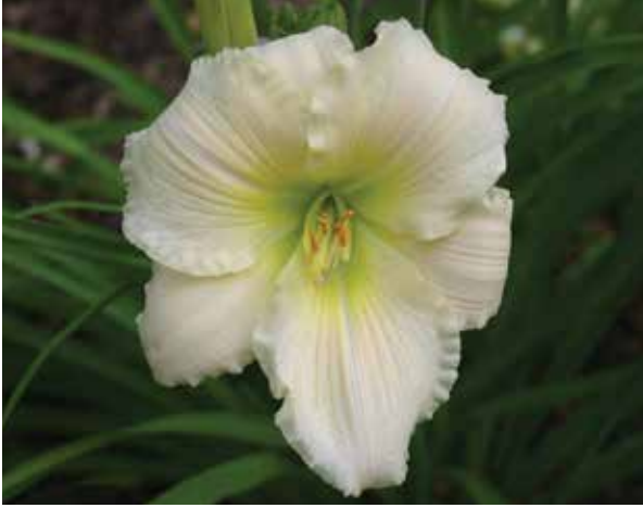
H. 'Southern Tradition' (Wall) Dip: 30", 5.5"; No Awards