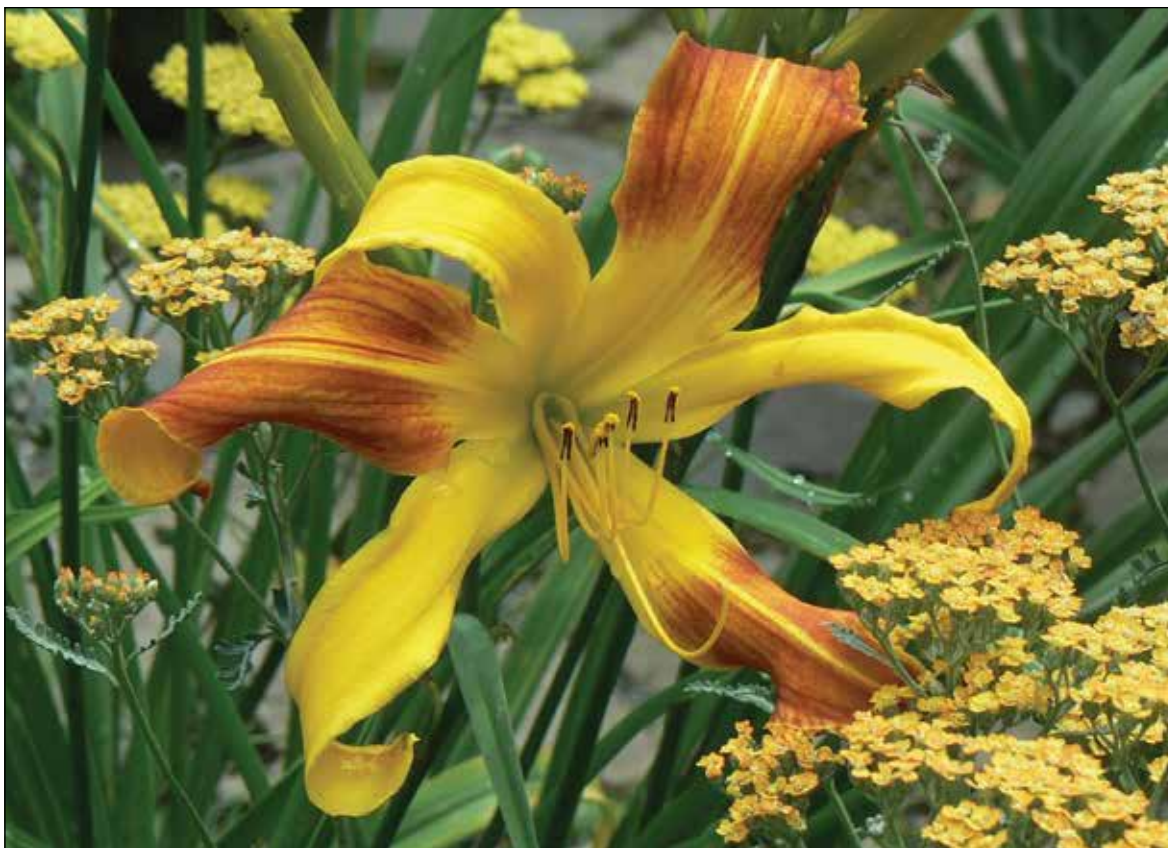
H. 'Spindazzle' (Wilson 1983)