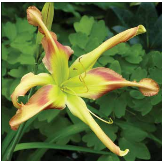
H. 'Rosy Lights' (Wilson-Schott 1990)

The diploid, 'Mad Max' (Wilson-Schott 1989), a 46", 7" rosy purple unusual form cascade with a deep purple eyezone and a chartreuse throat, won an HM in 2011. Another diploid, 'Rosy Lights' (Wilson-Schott 1990), a 40", 8.5" rose beige unusual