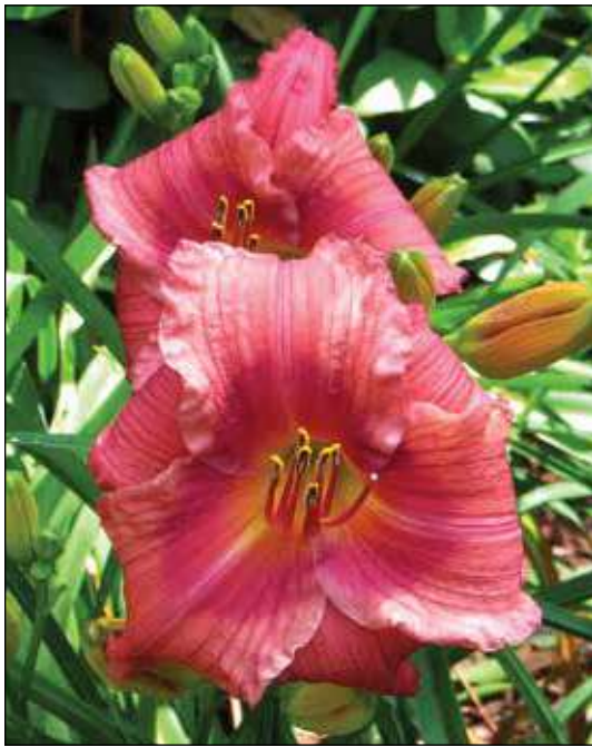
H. 'Gordon Biggs' (Crochet 1981)

18", 5.5" cream with a rose border and a green throat, won an HM in 1989. 'Little Red Warbler' (1985), an 18" 3.5" dark red with a maroon eyezone and yellow green throat, won an HM in 1990; 'Pocket Change' (1985), an 18", 4.5" dark red with lighter red edges and a green throat, won an HM in 1993; and 'Candide' (1986), an 18", 3.5" rose salmon and pink blend with a fuchsia eyezone and chartreuse throat, won an HM in 1991. His unusual form crispate 'Pink Windmill' (1987), a 24", 6" spidery pink with a green throat, received an HM in 1994. One of his most famous diploids, 'Ellen Christine' (1987), a 23", 7" pink gold blend double with a dark green throat, won an HM in 1990, an AM in 1993, and the Ida Munson Award for doubles in 1994. His 'Olin Frazier' (1988), a