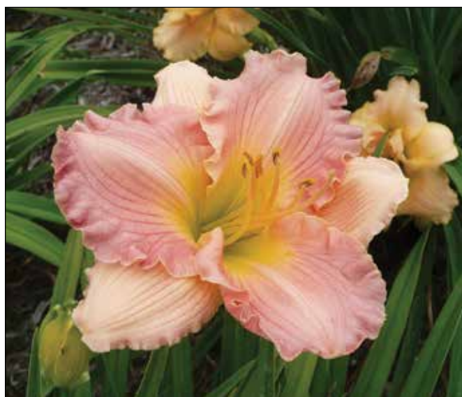
H. 'Blessing' (Applegate 1989)