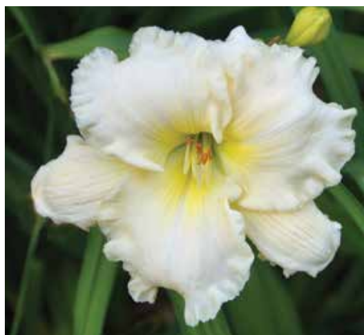
H. 'Great Nothern' (W. Spalding) Dip: 16", 6.5"; No Awards