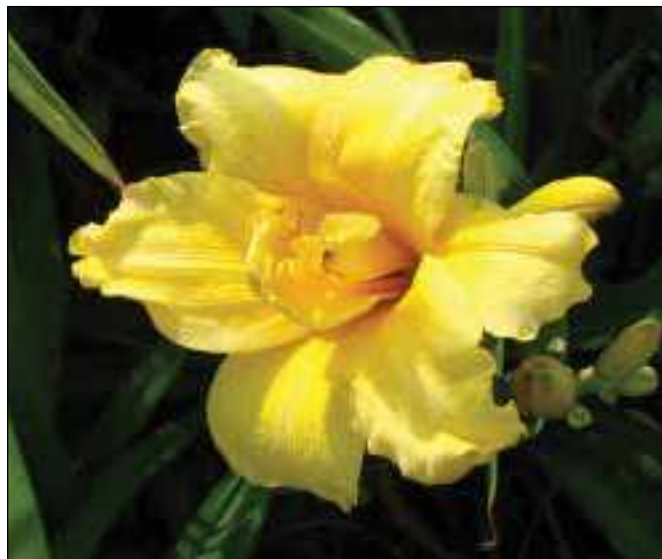
H. 'Butter Dish' (Kropf 1988)