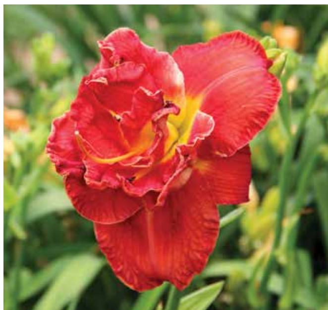
H. 'Fiery Dragon' (Durio)

Dip: 24", 6" double; HM 1995