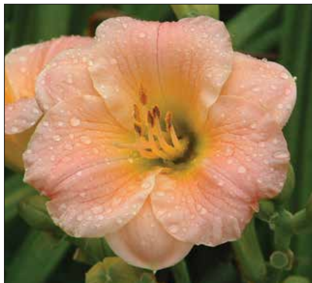
H. 'Pink Puff' (Jablonski-Sharp 1988)

24", 5.5" cantaloupe double with a green throat, captured an HM in 1991. However, his 'Double Joanna' (1982), a 30", 6" medium violet double with a dark violet eyezone and green throat, remains overlooked. 'Amethyst Art' (1988), an 18", 5" lavender double with a yellow throat, won an HM in 1994. 'Butter Dish' (1988), an 18", 5" butter yellow double with a green throat, also captured an HM in 1994. Several of his doubles received awards more than a decade after their registration. 'Zada Mae' (1982), a 22", 4.5" light peach self with a tiny green throat, received an HM in 2008. 'Double River Wye' (1982), a 30", 4.5" light yellow self with a green throat, received an HM in 2009. His 'Four Star' (Kropf-Tankesley-Clarke, 1988), a 30", 6" yellow gold double with a spider ratio of 4.30:1, although still popular, has so far been overlooked for awards. 'Carrot Crest' (1990), a 28", 4" light carrot orange with paprika eyezone above an orange green throat, won an HM in 1996.