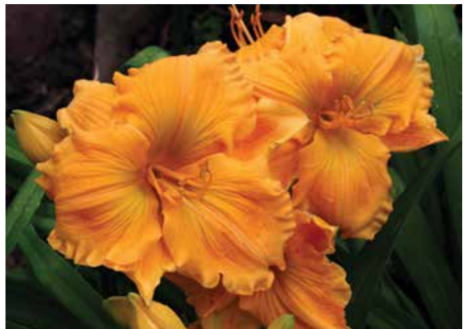
H. 'Golden Hibiscus' (J. Morrison) Dip: 14", 6.5"; HM 1997, President's Cup 2003