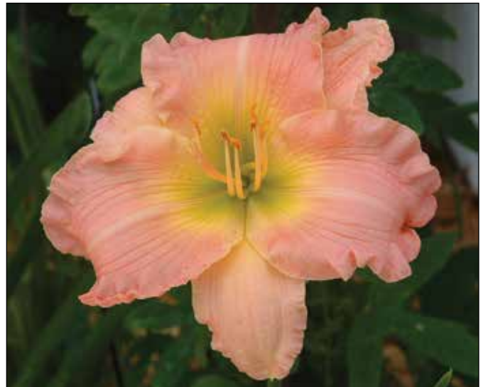
H. 'Perfectly Pink' (Cruse 1990)