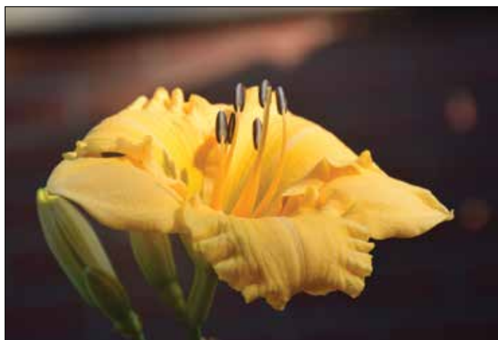
H. 'Golden Scroll' (Guidry 1983)