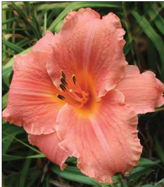
H. 'Watermelon Moon' (Stamile 1987)