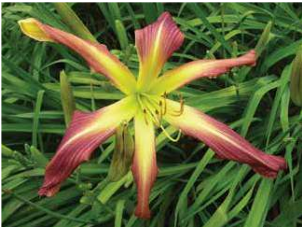
H. 'Watchyl Christmas Widow' (Kreger) Dip: 25", 10" spider ratio 5.00:1; No Awards