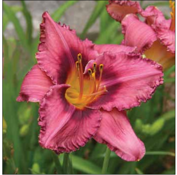
H. 'Mort's Magic' (Morss 1989)