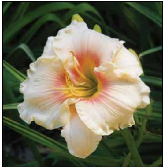
H. 'Little Fruit Cup' (Guidry 1988)

7.25" pink cream bitone with a lime green throat, won an HM in 1989 and the LEP in 1995. 'Cajun Gambler' (1986), a 24", 7" burnt orange polychrome with a darker eyezone and a yellow throat, won an HM in 1991 and an AM in 1995. 'Smoky Mountain Autumn' (1986), an 18", 5.25" rose blend with a rose lavender halo and olive green throat, won an HM in 1989, an AM in 1992, the LEP in 1990, and the Lenington All-American Award in 1997. It became one of her most famous day-lilies and a great parent for things to come. 'Timeless Fire' (1986), an 18", 5.25" deep red self with a yellow green throat, won an HM in 1989. 'Little Fruit Cup' (1988), a 20", 4.75" cream with a strawberry red eyezone and a green throat, won an HM in 1994. 'China Bride' (1989), a 24", 6" rose pink and cream pink bicolor with a rose halo and green throat, won an HM in 1992. To close out her historical period, 'Kiowa Sunset' (1990), a 23", 5" bronze orange blend with a bronze eyezone and green throat, won an HM in 1993. Lucille Guidry was awarded the Bertrand Farr Silver Medal in 1990.