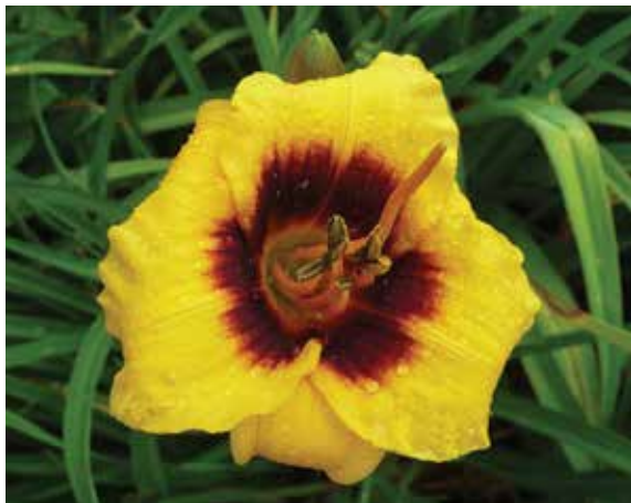
H. 'Lightning Bug' (Kroll) Dip: 16", 2.25"; Florida Sunshine Cup 2002