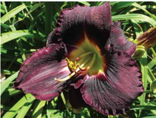
H. 'Black Ambrosia' (Salter) Tet: 28", 5"; HM 1999, AM 2003