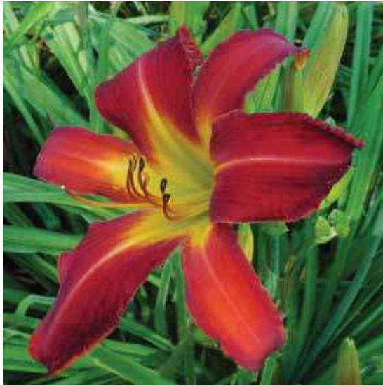
H. 'Point of View' (S. Roberts) Tet: 35", 7.5"; HM 2001