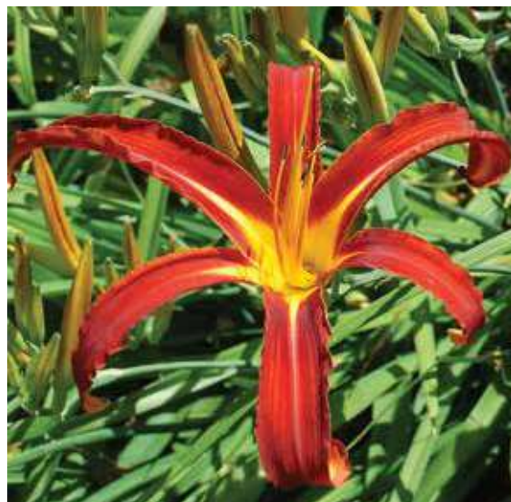
H. 'Nona's Garnet Spider' (N. Ford) Dip: 36", 6.5" spider ratio 4.33:1; No Awards