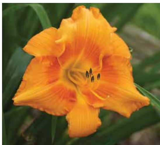
H. 'Tropical Heat Wave' ( D. Kirchhoff ) Tet: 28", 5.25"; HM 1998