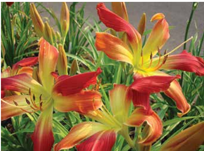
H. 'Hot Wheels' (Calhoun) Dip: 36", 8.5" spider ratio 5.50:1; No Awards