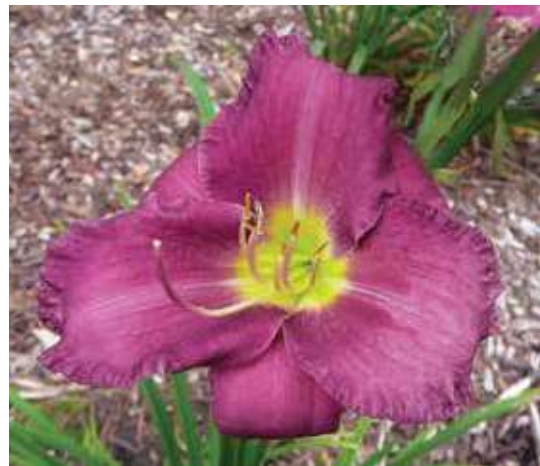
H. 'Woodside Rhapsody' (Apps) Dip: 31", 4"; HM 1998