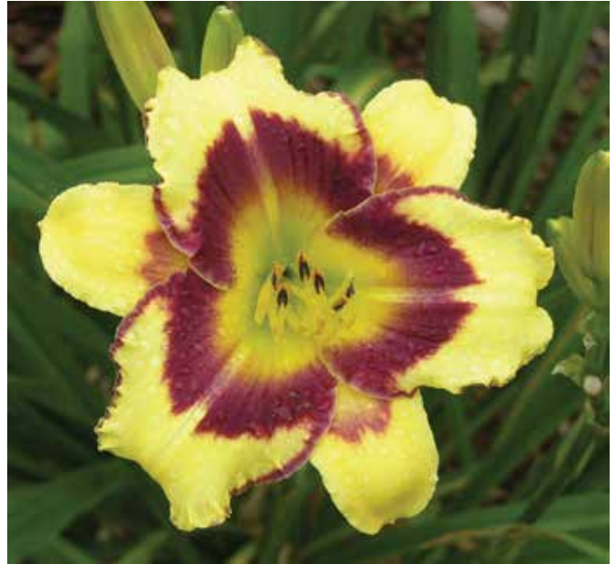
H. 'El Desperado' (Stamile) Tet: 28", 5"; HM 1997, PC 2000, AM 2000, Don C. Stevens 2001