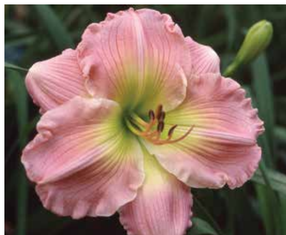
H. 'True Pink Beauty' ( Copenhaver ) Dip: 22", 7"; HM 1998