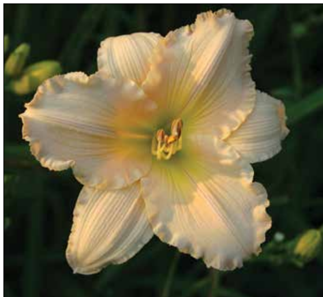
H. 'Fairy Tale Pink' (Pierce 1980)