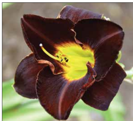
H. 'Obsidian' (Stamile 1988)

1992 and the Eugene S. Foster Award in 1992 for late blooming cultivars. 'Victorian Collar' (1988), a 24", 6.25" gold self, won an HM in 1993 and an AM in 1996. 'Ptarmigan' (1989), a 20", 5.75" near white self with a green throat, won an HM in 1993. 'Cherry Berry' (1989), a 30", 4.25" cream with a wine eyezone and a green throat, won an HM in 1994. 'Joe Marinello' (1989), a 21", 5" cream with a wine purple eyezone and a green throat, won an HM in 1994 and an AM in 1997. 'Tigerling' (1989), a 25", 3.75" light orange with a bright red eyezone and a green throat, won an HM in 1994, an AM in 1997, and the Annie T. Giles Award for small flowers in 1998. 'Tigger' (1989), a 24", 4.25" orange with a red eyezone and green throat, however, remains overlooked. Then came the first group of the "Candies." 'Plum Candy' (1989), a 24",