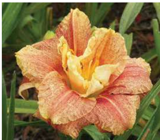
H. 'Happy Hooligan' (Talbot) Dip: 18", 5.5" double; HM 1999