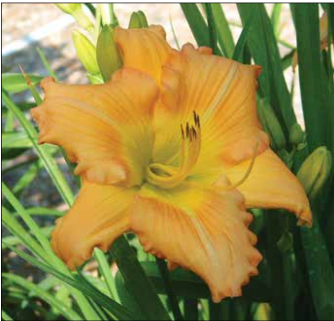
H. 'Waimea Cliffs' (Carpenter-Glidden 1983)