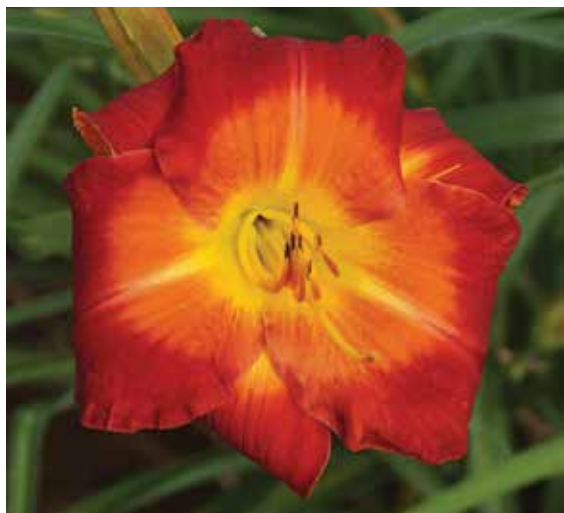
H. 'Magic Carpet Ride' ( D. Kirchhoff ) Tet: 28", 6"; HM 1996, AM 1999