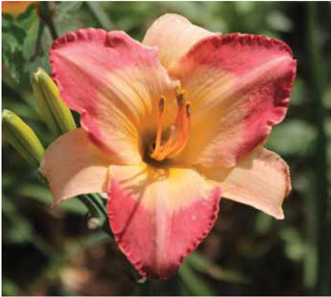
H. 'Cherry Chapeau' (R. W. Munson, Jr. 1983)

purple eyezone and a peach orange throat, won an HM in 1987. 'Sovereign Queen' (1983), a 30", 6" bluish lavender self with a cream throat, won an HM in 2003. 'Apollodorus' (1984), a 28", 4.5" violet purple self with a cream yellow throat, won an HM in 1987. 'Nivia Guest' (1984), a 24", 5" purple self with a yellow green throat, won an HM in 1993. 'Cameroons' (1984), a 28", 5" claret self with a yellow green throat, won an HM somewhat belatedly in 2000. 'Beijing' (1986), a 24", 5" pale flesh self with a cream yellow throat, won an HM in 1990. 'Borgia Queen' (1986), a 26", 5" silver lavender mauve with a slate blue eyezone and a cream chartreuse throat, also won an HM in 1990. 'Emperor Butterfly' (1986), a 28", 5" violet orchid mauve blend with a yellow violet eyezone and a yellow green throat, won an HM in 1993. 'Ruffled Dude' (1986),