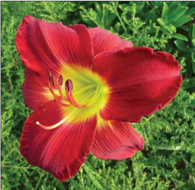
H. 'Scarlet Orbit' (Gates-L. 1984)

most Indecent' (1986), a 20", 6.5" tetraploid double lavender and cream blend with a chalky chartreuse throat, also received an HM in 1991 and an AM in 1995. It was the winner of the Ida Munson Award in 1995. Several other tetraploids were honored with both HMs and AMs: 'Seducator' (1983), an 18", 6" apple red self with a green throat, won an HM in 1986 and an AM in 1990; 'Scarlet Orbit' (1984), a 22", 6" red self with a chartreuse throat, won an HM in 1987 and an AM in 1991; and 'Superlative' (1986), a 24", 6" dark red tetraploid with darker eyezone and green throat, received an HM in 1992 and