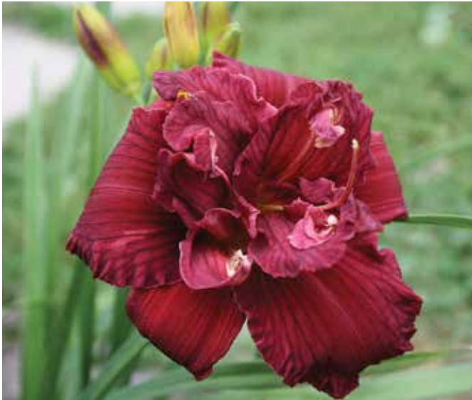
H. 'Double Cranberry Ruffles' (Talbot) Dip: 19", 5" double; HM 2004