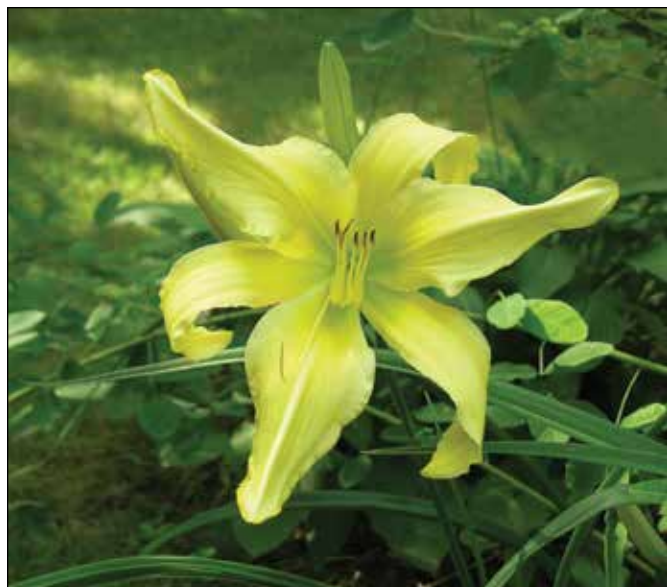
H. 'Risen Star' (Webster 1988)