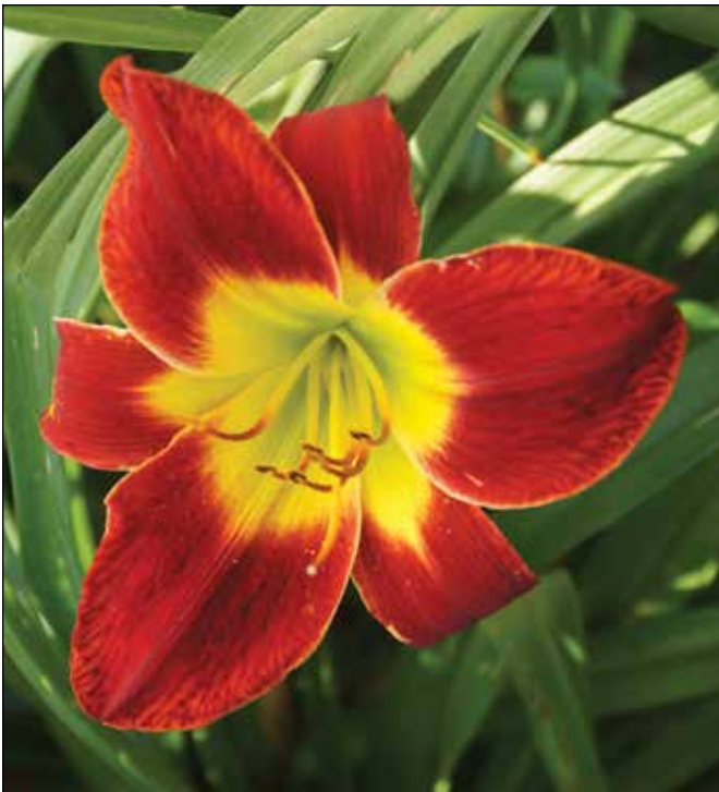
H. 'Sligo' (Whatley 1988)

throat, won an HM in 1994. Other tetraploids included 'Sligo' (1988), a 26", 5.5" dark red self with a green throat, which won an HM in 1993; 'Khorassan' (1988), a 30", 6" pink and yellow blend with a yellow throat, which won an HM in 1994; 'Kuan Yin' (1988), a 24", 6" bright red self with a green throat, which also won an HM in 1990; and 'Adjure' (1990), a 25", 6" rose pink self with a very green throat, which won an HM in 2001. These are just some of the 37 cultivars registered during this period. Oscie Whatley was awarded the Bertrand Farr Silver Medal in 1984.