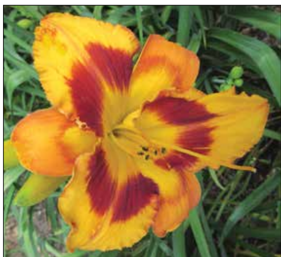
H. 'Raging Tiger' (Rasmussen 1987)