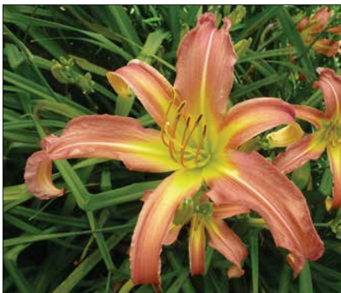
H. 'Star Twister' (Mills 1988)

Twister' (1988), a 26", 7" rose blend with a spider ratio of 4.40:1, however, remains overlooked for awards.