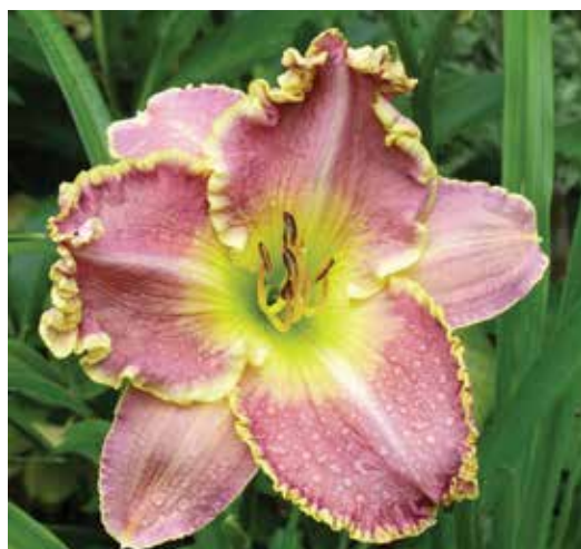
H. 'David Kirchhoff' (Salter) Tet: 26", 5.5" HM 2000, AM 2003