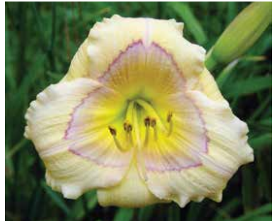
H. 'Little Print' (E.H. Salter) Dip: 16", 2.75"; HM 2002