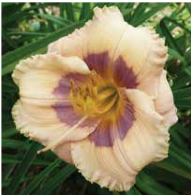
H. 'Blue Moon Rising' (E.H. Salter) DIP: 24", 3"; HM 1997