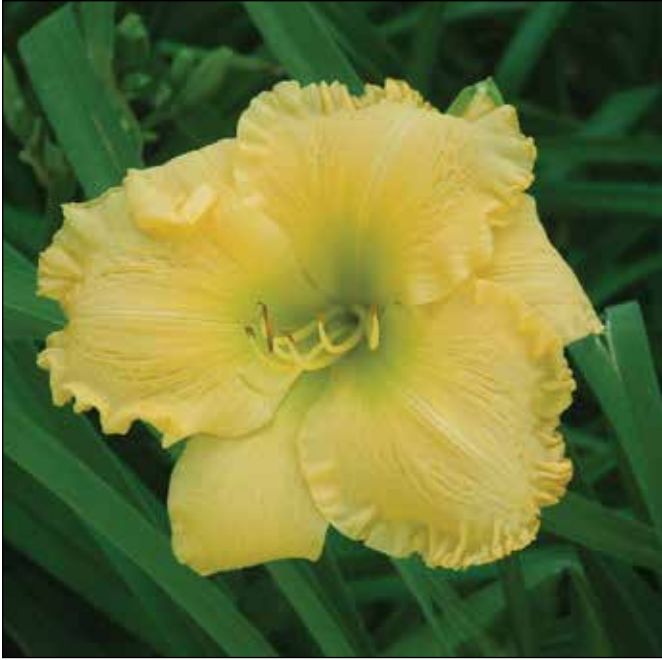
H. 'Alec Allen' (Kate Carpenter 1982)

with an olive green throat, in 1984; 'Vision of Beauty' (1985), a 21", 6" very light pink with a lavender pink halo and green throat, in 1990; and 'Unique Style' (1985), a 21", 3.25" yellow edged rose amber and greenish yellow bicolor with a large green throat, in 1992. Kate Carpenter was awarded the Bertrand Farr Silver Medal in 1994.