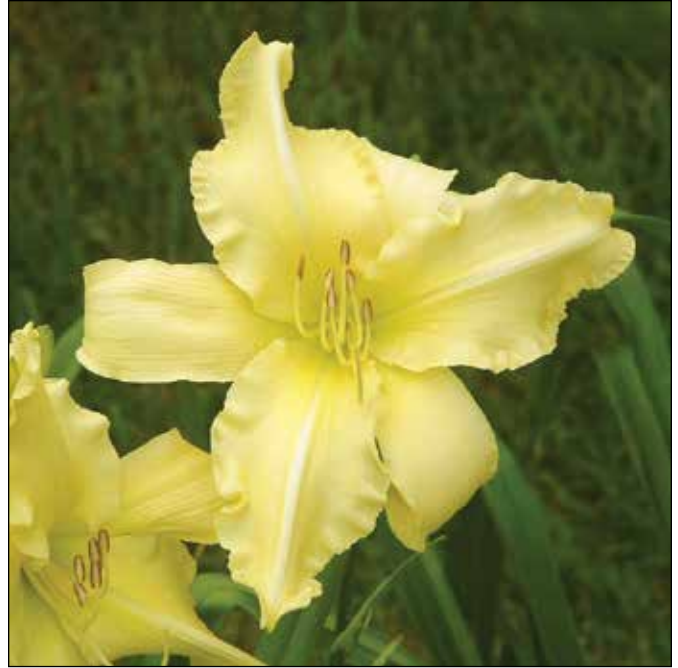
H. 'Twirling Skirt' (Carpenter-Glidden 1984)