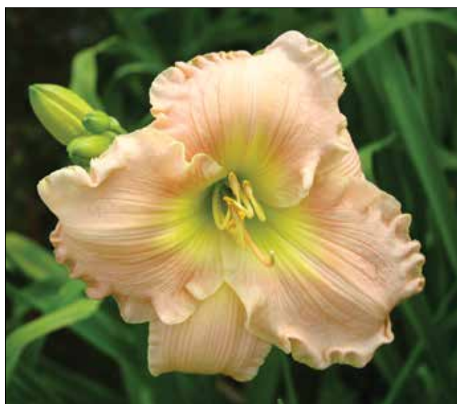
H. 'Rachel Billingslea' (Billingslea 1990)