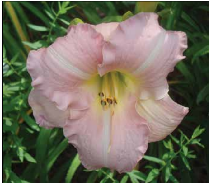
H. 'Frosted Pink Ice' ( Stamile 1987)

orange throat, won an HM in 1992. 'Floyd Cove' (1987), a 21", 5" yellow self with a green throat, won an HM in 1990. 'Earth Angel' (1987), a 25", 4.5" apricot self with a green throat, won an HM in 1991. Two diploids from the same year were accorded awards: 'Frosted Pink Ice' (1987), a 28", 5" blue pink self with a green throat, won an HM in 1990 and the L. Ernest Plouf Award for fragrance in 1996; and 'Double Conch Shell' (1987), a 26", 6" double melon pink blend with a green throat, won an HM in 1991. 'Glory Days' (1987), a 24", 5.5" tetraploid gold self, won an HM in 1995. 'Wedding Band' (1987), a 26", 5.5" cream white edged yellow with a green throat, won an HM in 1990, an AM in 1993, and the Stout Silver Medal in 1996. 'Watermelon Moon' (1987), a 28", 6.5" watermelon pink blend with an orange throat, won an HM in 1992. 'Obsidian' (1988), a 27", 4.25" black self with a chartreuse throat, won an HM in 1992. 'Regal Finale' (1988), a 26", 6" violet purple self with a green throat, won an HM in