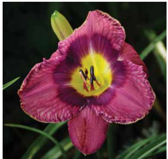
H. 'Rhine Maiden' (Morss) Tet: 28", 6"; HM 1996