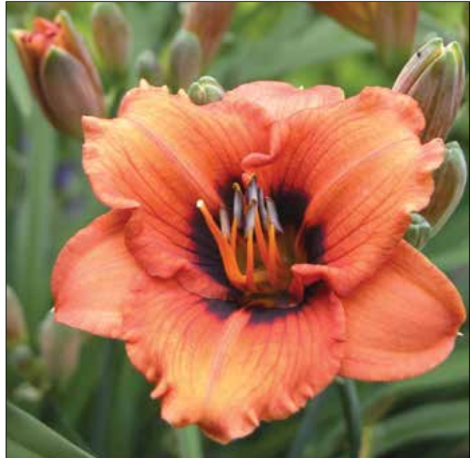
H. 'Desert Princess' (Oakes 1987)

period. Today it is one of the largest nurseries in the country. Most of Oakes' 20 registrations were during the 1980s. H. 'Red Volunteer' (1984), a 30", 7" clear candle red tetraploid with a gold yellow throat, won an HM in 1989, an AM in 1994, and the Lenington All-American Award in 2004. 'Desert Princess' (1987), a 16", 3.25" dark orange diploid with a burgundy eyezone and a green throat, remains overlooked. 'Jen Melon' (1987), a 26", 5" melon cream diploid with a chartreuse