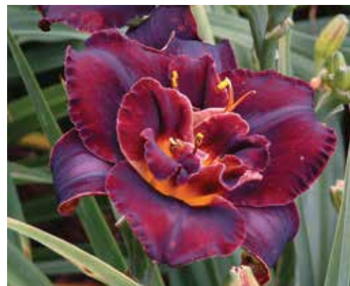
H. 'Ezekiel' (Talbot) Tet: 28", 5" double; HM 1995