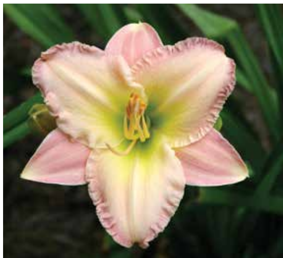
H. 'Orchid Harmony' (M. Gage) Dip: 26", 5"; No Awards