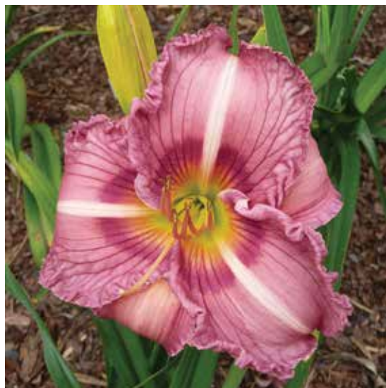
H. 'Jedi Little Mike' (Wedgeworth) Dip: 26", 5"; HM 2003