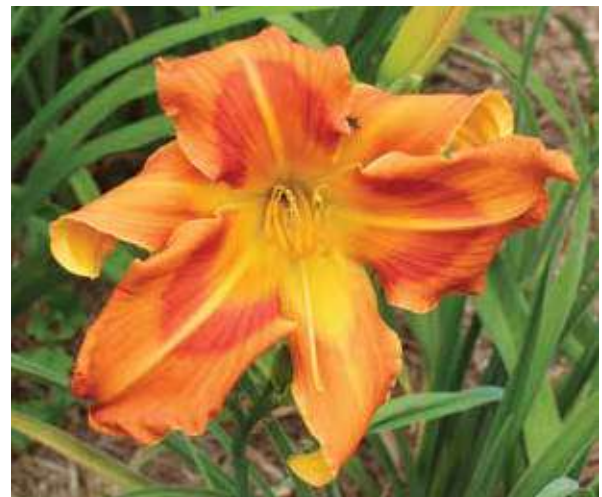
H. 'Orangutan' ( Reed ) Dip: 26", 6"; HM 2003