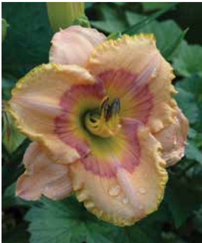
H. 'April in Paris' (Moldovan) Tet: 22", 4.5"; HM 2002