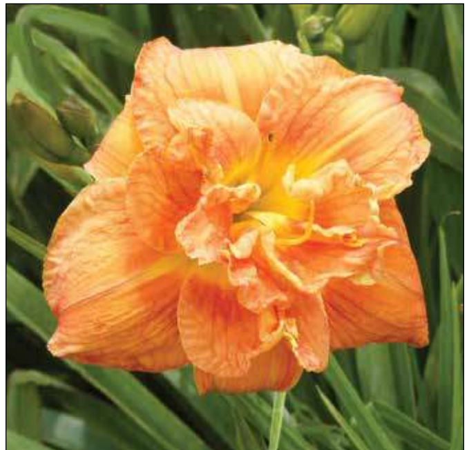
H. 'Double Dipper' (Durio-D. 1990)