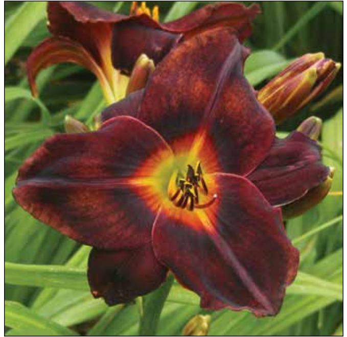
H. 'Total Eclipse' (Durio-D. 1984)

HM in 1996. His tetraploid, 'Double Dipper' (1990), a 28", 6.5" double tangerine and melon pink blend with a rose rouge halo above a green chartreuse throat, remains overlooked.