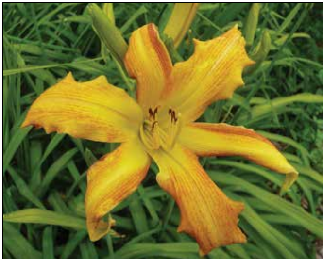
H. 'Spinneret' (Tankesley-Clarke 1990)