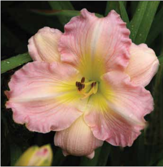
H. 'Pink Flirt' (DeKerlegand 1987)

won an HM in 1992 and an AM in 1995. One diploid, 'Wisteria' (1991), a 20", 5.75" lavender, registered just beyond the historical period, was recently accorded an HM in 2018.