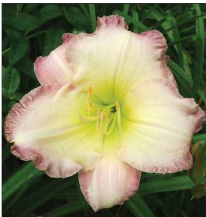
H. 'Seal of Approval' (Santa Lucia 1990)