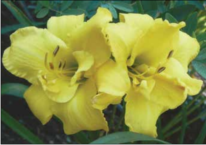
H. 'Decatur Double Delight' (Davidson 1983)