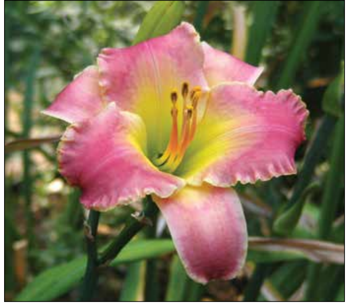
H. 'Morning Dawn' (Reckamp-Klehm 1981)