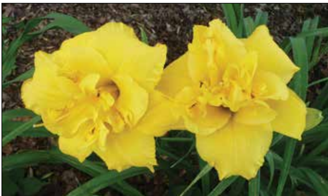
H. 'Layers of Gold' (Kirchhoff-D. 1990)