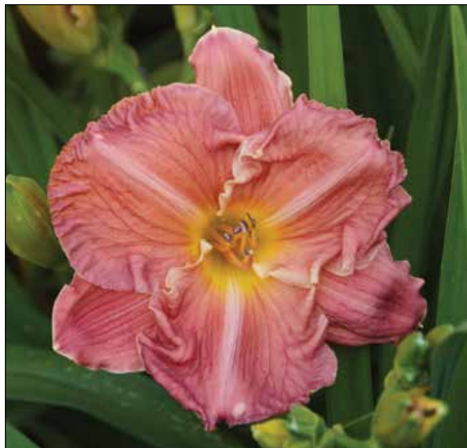
H. 'Mae West' (Weston 1990)

2.5" cream diploid with pink overlay and a slight pink halo above a green throat, won an HM in 1993. 'Artful Dodger' (1988), a 28", 3.75" tetraploid double lavender blend with a yellow green throat, won an HM in 1998. 'Iditarod' (1989), a 28", 3" diploid near white self with a green throat, won an HM in 1995. 'Borders on Pink' (1990), a 17", 5" fuchsia pink diploid with pale edges and a bright green throat, won an HM in 1994. 'House of Orange' (1990), a 27", 5.25" dark bitter-sweet orange diploid with a dark green throat, also won an