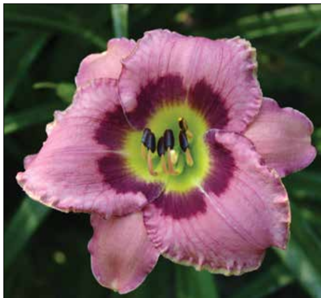
H. 'Always Afternoon' (Morss 1987)