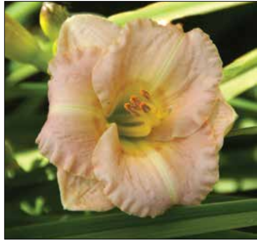
H. 'Cowrie Flower' (Weston 1988)

administrator for the Detroit Institute of Arts, which housed a fine collection of African artifacts. Her diploid, 'Bologongo' (1986), a 16", 5.5" Chinese red self with a yellow green throat, named for a 15th-century African king, won an HM in 1991. 'Bubbling Brown Sugar' (1987), a 27", 5.5" yellow edged cinnamon tetraploid with a brown eyezone and green yellow throat, won an HM in 1992. 'Cowrie Flower' (1988), a 16",