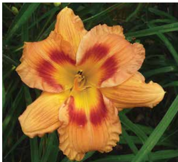
H. 'Cinnamon Sunrise' (Copenhaver) Dip: 25", 6.5"; HM 2000 (Photo by Debbie Monbeck)