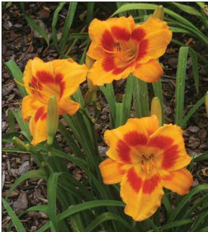
H. 'Eye-yi-yi' (McCroskey 1988)