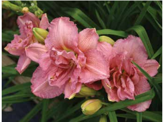
H. 'Charming Ethel Smith' (Terry) Dip: 20", 6" double; HM 1997