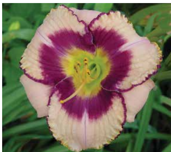
H. 'Daring Dilemma' (Salter) Tet: 24", 5"; HM 1997, AM 2000