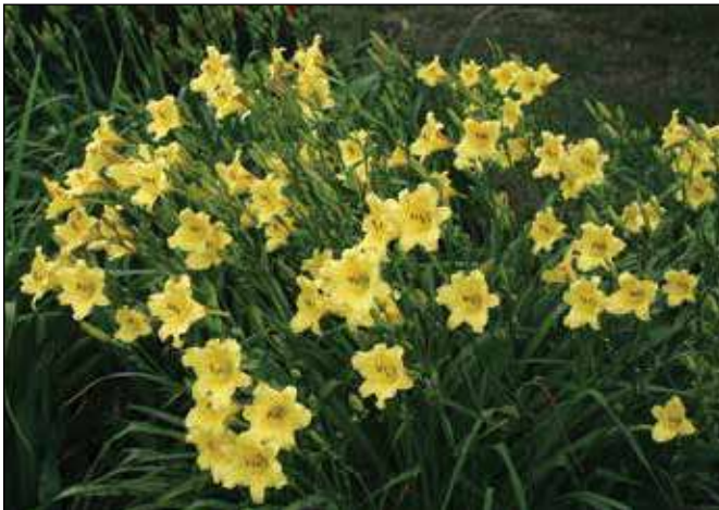
H. 'Toy Trumpets' (Sobek 1984)