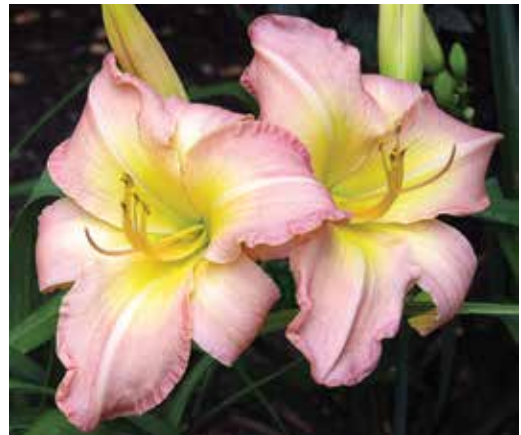
H. 'Bird Bath Pink' (Webster) Tet: 26", 7"; HM 2018