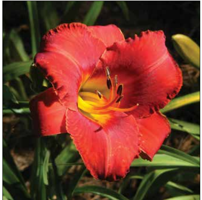
H. 'Amadeus' (Kirchhoff-D. 1981)