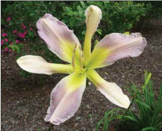
H. 'Cerulean Star' (Lambert 1982)