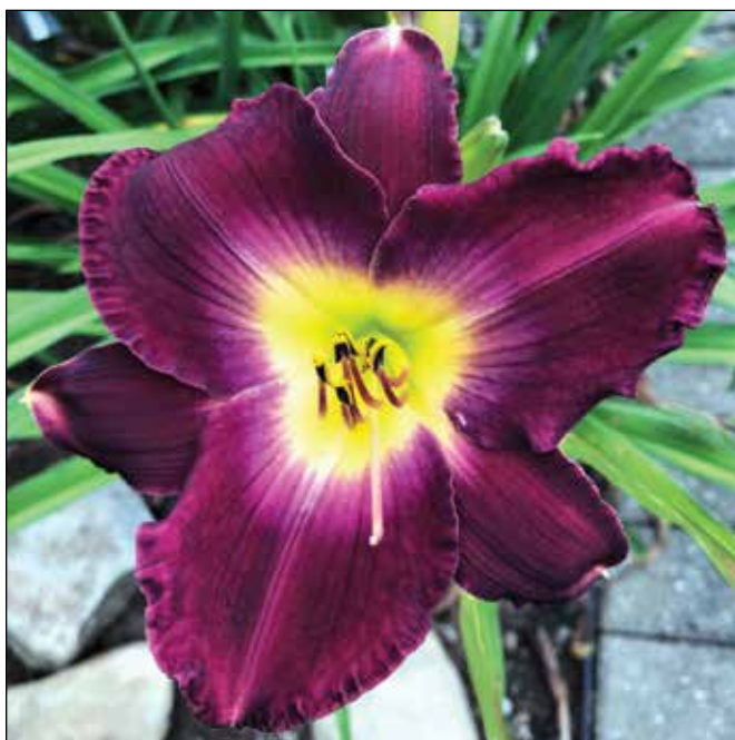
H. 'Strutter's Ball' (Moldovan 1984)

'Vera Biaglow' (1984), a 28", 6" rose pink edged silver with a lemon green throat, captured an HM in 1989 and an AM in 1993. 'Pewter Lake' (1986), a 28", 6" gray bluish lavender blend with deeper veins and a lemon yellow green throat, won an HM in 1991. 'Avante Garde' (1986), a 26", 5.5" amber tan bitone with a red orange eyezone and a yellow green throat, won an HM in 1993, and 'Geppetto' (1986), a 26", 5" pink cream with a strong pink eyezone and yellow green throat, won an HM in 1994. Four other tetraploids, registered on the cusp of the next decade, are worth mentioning. 'Anchors Aweigh' (1990), overlooked for awards, is a 28", 6" bluish violet blend