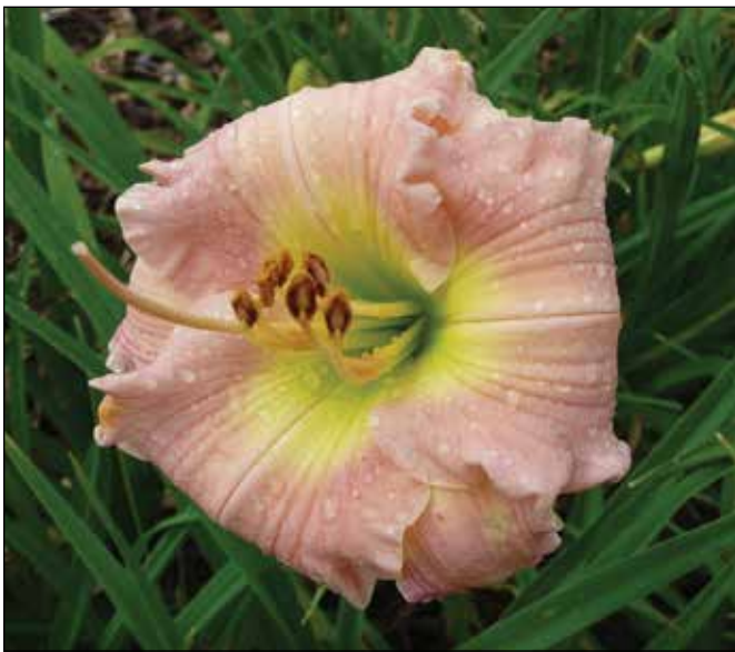
H. 'From Morning Dews' (Billingslea 1990)

HM in 1994. 'Michelangelo's David' (1990), a 21", 5.5" cream white with pink glow and a green throat, won an HM in 1995. 'From Morning Dews' (1990), a 22", 5" clear light pink self with a green throat, won an HM in 1997. 'Lights of Evening' (1990), a 25", 6" pale creamy yellow self with a green throat, won an HM in 1998. 'What Wondrous Love' (1990), a 24", 6" pink with a rose eyezone and green throat, won an HM in 1998. 'Mulberry Frost' (1990), a 20", 6" rose mulberry blend with a silvery blush and green throat, was popular, but was overlooked for awards. 'Rhythm in Pink' (1990), a 26", 6" veined light rose pink with a green throat, was also much admired, but overlooked for awards. As of the present, Oliver Billingslea has registered a total of 59 cultivars, for which he received 18 HMs, including the President's Cup at