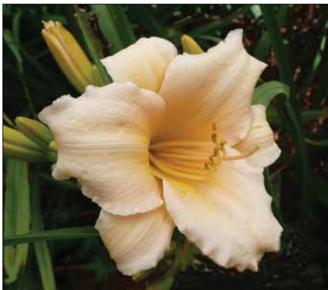
H. 'Mini Pearl' (Jablonski 1982)