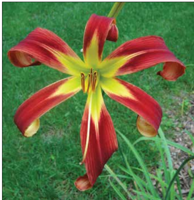
H. 'Red Rain' (Whitacre 1988)

red eyezone above a yellow green throat with a spider ratio of 6.00:1, won an HM in 1997 and is perhaps her most famous daylily. 'Tylwyth Teg' (1988), a 40", 8" pale cream rainbow polychrome with lavender midribs and a pale gold throat and a spider ratio of 5.60:1, however, remains overlooked for awards, as does 'Crazy Pierre' (1990), a 24", 7" pale orange peach with a bright red eyezone above a pale yellow throat and a spider ratio of 5.00:1. Jim Whitacre, Rosemary's husband, registered 'Watermelon Man' (1990), a 17", 4.5" black red with a chrome yellow throat and a spider ratio of 5.00, but it