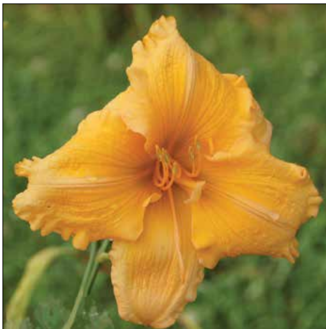
H. 'Orange Velvet' (Joiner 1988)