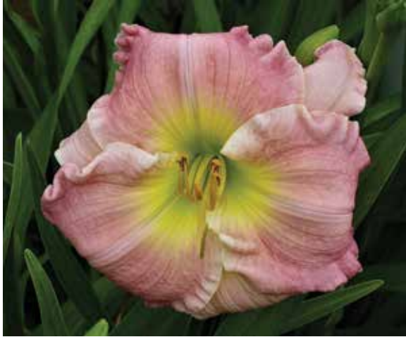
H. 'Pink Scenario' (Sikes) Dip: 19", 5.5"; HM 1997