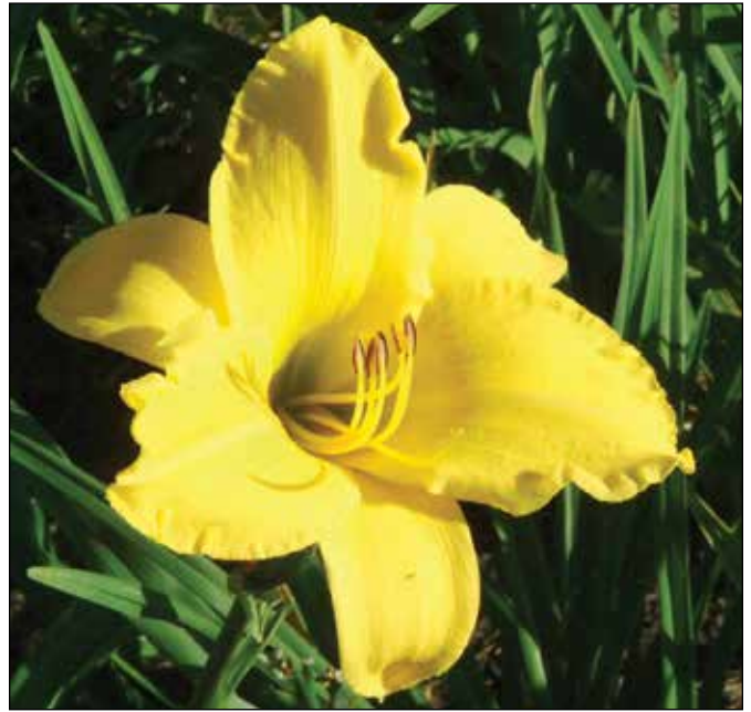
H. 'California Sunshine' (Chesnik 1985)

(1985), a 30", 6" yellow gold self with a pale green throat, won an HM in 1988. 'California Sunshine' (1985), a 33", 6.5" intense yellow self, won an HM in 1990. Both of these were tetraploids. A diploid 'Purple Rain' (1985), registered as a 15", 3" bright grape purple bitone with a black eyezone and a green throat, also won an HM in 1988.