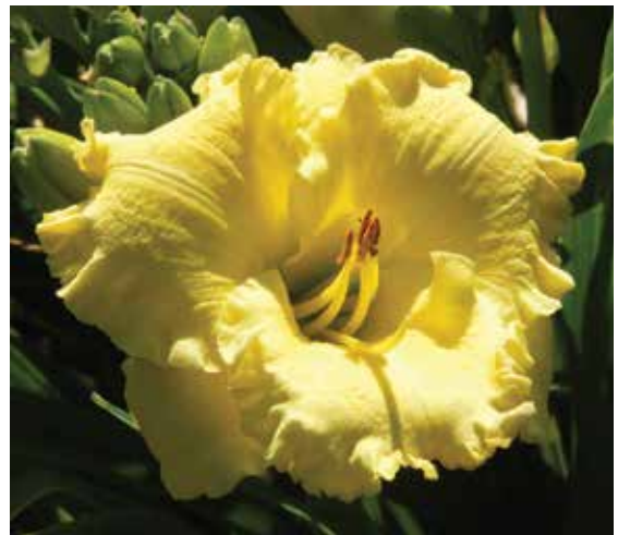
H. 'Emperor's Choice' (Benz) Tet: 24", 5"; HM 1998