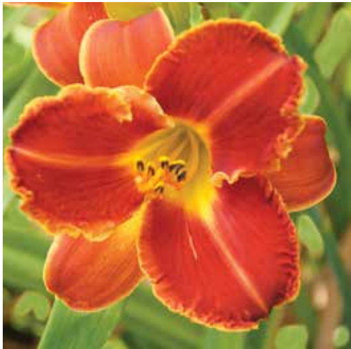
H. 'Velvet Beads' (E.Olson) Tet: 28", 5"; HM 2000