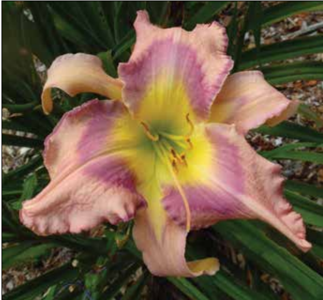
H. 'Designer Gown' (Sikes 1982)

register daylilies during the 1990s. H. 'Royal Rage' (1980), a 28", 5.5" deep brick red tetraploid with a green gold throat, won an HM in 1983. It continued the legacy of 'Sound and Fury' which had been registered in 1979. A number of her tetraploid registrations in the 1980s were honored, including 'Designer Gown' (1982), a 29", 6" pale pink lavender with a deep pink lavender halo and a yellow green throat, which received an HM in 1985; 'Ardent Affair' (1982), a 32", 6"