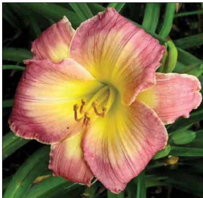
H. 'Kurumba' (Weston 1985)

green throat, won an HM in 1985. It was hybridized while Judith still lived in Detroit. A small-flowered tetraploid, 'Pygmy Paramour' (1984), a 17", 3.5" medium pink self with a