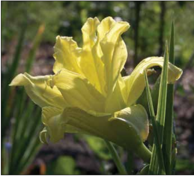
H. 'Double River Wye' (Kropf 1982)