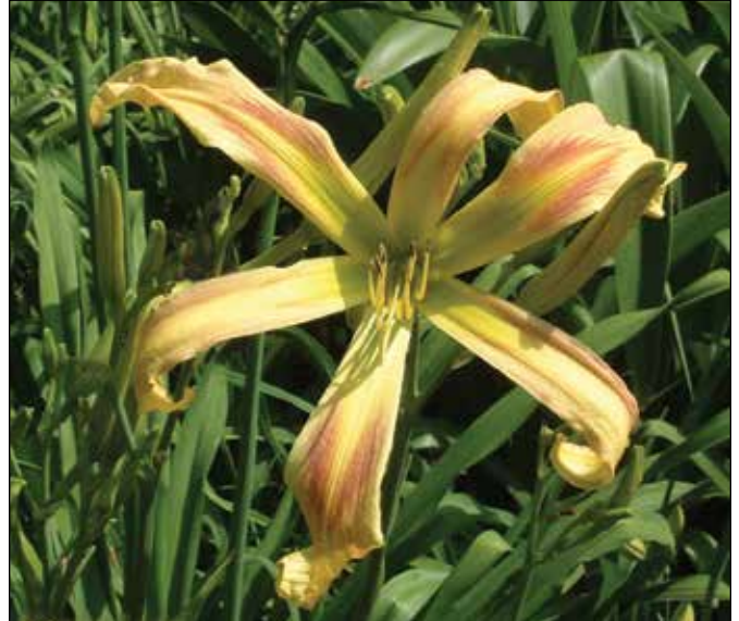
H. 'Slender Lady' (Crandall 1987)

yellow amber self with a very green throat and a spider ratio of 5.00:1, won an HM in 1997. 'Satan's Curls' (1987), a 29", 6" unusual form crispate red with a yellow band outside a very green throat, was popular, but also overlooked for an award. In contrast, 'Calico Spider' (1987), a 32", 6.75" gold with a brown mahogany eyezone and a spider ration of 4.20:1, eventually won an HM in 2011.