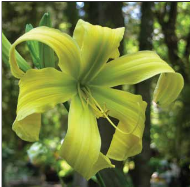
H. 'Lois Burns' (Temple 1986)

H. 'Green Widow' (1980), a 26", 6.5" yellow green self with a spider ratio of 4.10:1 and a very green throat, won an HM in 1987 and the Harris Olson Spider Award in 1996. 'Rainbow Spangles' (1983), a 30", 7" lavender and chartreuse bicolor with a spider ratio of 4.40:1 and a purple eyezone above a green throat, won an HM in 1991. 'Lois Burns' (1986), a 30", 8.5" yellow green with a spider ratio of 4.00:1, won an HM in 1991 and the Harris Olson Spider Award in 1995. 'Mountain Top Experience' (1988), a 30", 5.87" lavender petaled bicolor with a spider ratio of 4.80:1 and cream orange blend sepals with a red chevron on its petals and a green to yellow throat, won an HM in 1991 and the Harris Olson Spider Award in 1993. 'Umbrella Parade' (1990), a 30", 9" purple and yellow