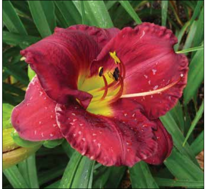
H. 'Jovial' (Gates-L. 1986)

an AM in 1996. Among his tetraploids winning HMs alone were 'Shaman' (1985), a 20", 5.5" canary yellow self with a green throat, in 1989; 'Jovial' (1986), a 20", 5" wine red self with a chartreuse green throat, in 1990; 'Ultra Plum' (1986), a 20", 5.5" plum purple with darker eyezone and green throat, in 1991; 'Excitable' (1986), a 20", 5.5" double rose pink self with a green throat, in 1992; 'Shared Excitement' (1986), a 20", 6" green yellow blend with a green throat, in 1993; 'Snow Bride' (1986), a 20", 5" diamond dusted near white with a