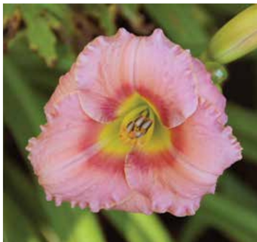
H. 'Chorus Line Kid' (G. Stamile) Tet: 26", 3.5"; HM 1996