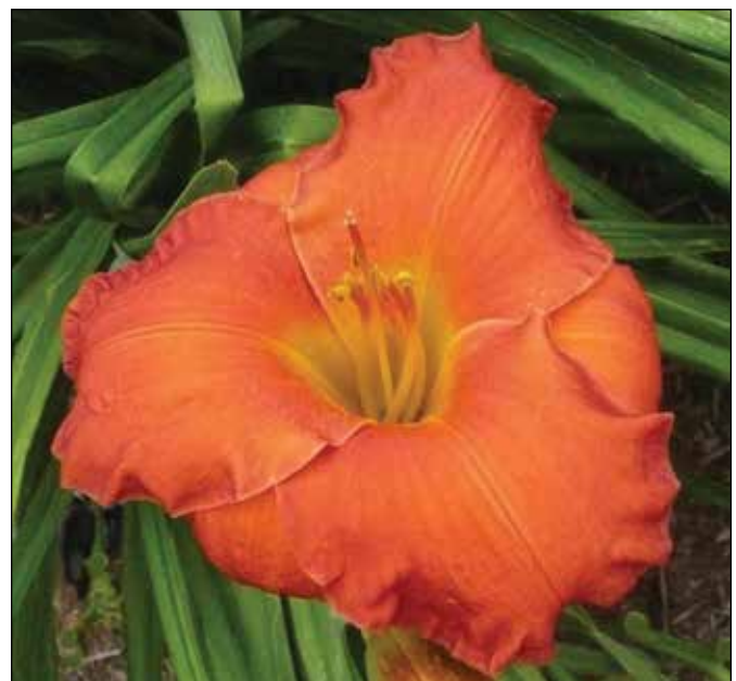
H. 'House of Orange' (Weston 1990)