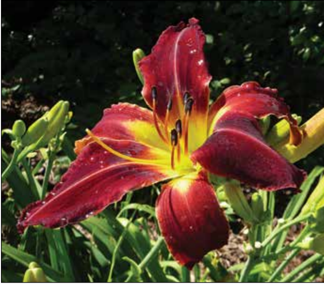
H. 'Samar Star Fire' (Sullivan 1985)