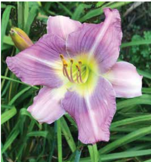
H. 'Ocean Ice' ( Talbott ) Dip: 29", 5.5"; HM 2001