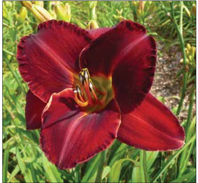
H. 'Illini Jackpot' (Varner 1981)

light orange beige blend with a green throat, won an HM in 1994. 'Illini Show Girl' (1984), a 32", 6" deep red self with a very green throat, won an HM in 1991.