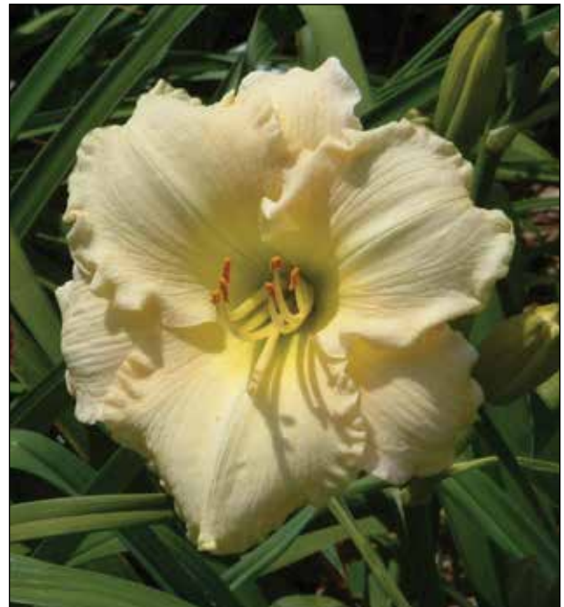
H. 'Ruffled Ivory' (Brown-E.C. 1982)