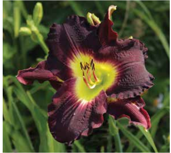
H. 'Which Way Jim' (Shooter) Dip: 26", 5.5"; HM 2005