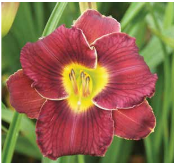
H. 'Rue Madelaine' (Carr) Tet: 27", 5.5"; HM 1996