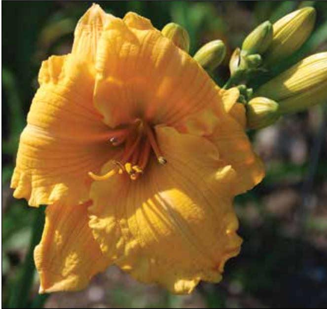
H. 'Golden Scroll' (Guidry 1983)

(1981), a 20", 6.5" cream self with a green throat, also won an HM in 1984. However, 'New Testament' (1981), an 18", 6" pink self with a green throat, remains overlooked. 'Antique Lace' (1983), a 26", 6.5" cream self with a green throat, won an HM in 1986. 'Golden Scroll' (1983), a 19", 5.5" tangerine self with a green throat, won an HM in 1985, an AM in 1989, and the LEP in 1989. 'Little Orange Drop' (1983), a 26", 5"