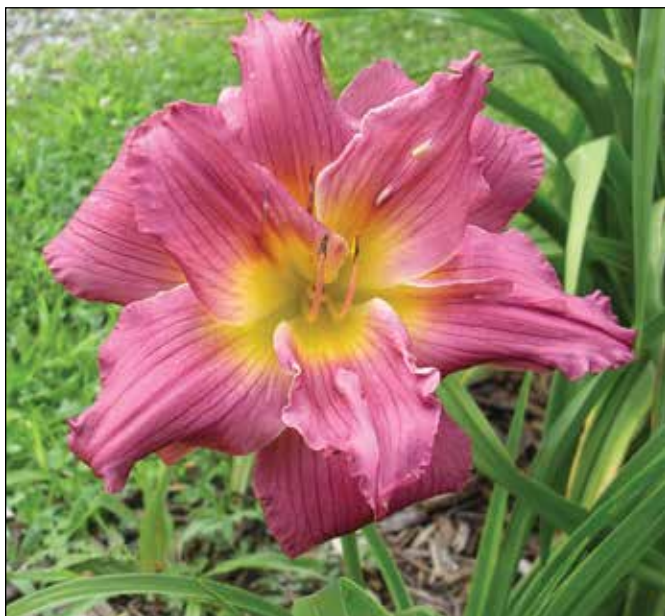
H. 'Amethyst Art' (Kropf 1988)