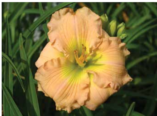
H. 'Mountain Almond' (Billingslea) Dip: 21", 6"; HM 1996