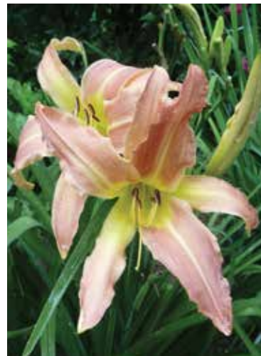
H. 'Arachnophobia' (Dickerson) Dip: 20", 7" spider; No Awards