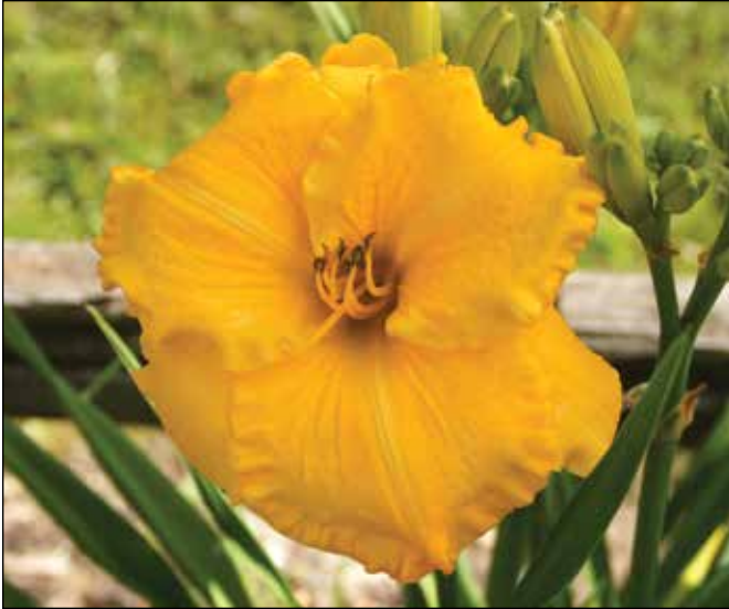
H. 'Victorian Collar' (Stamile 1988)