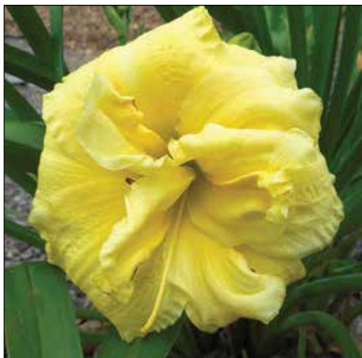
H. 'Cabbage Flower' (Kirchhoff-D. 1984)