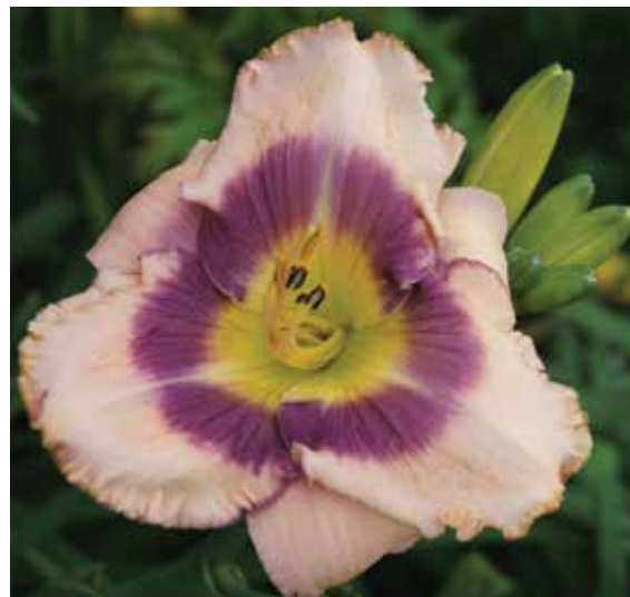
H. 'Medieval Splendor' (Salter) Tet: 28", 6.5"; HM 1999