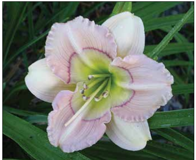
H. 'Baby Blues' (G. Stamile 1990)