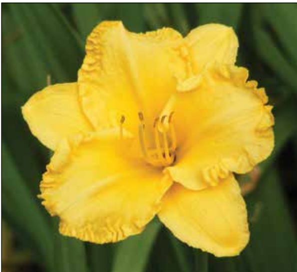
H. 'Butterfly Ballet' (Dunbar 1983)

Charles Dunbar of Mendocino, California, is credited with 17 registrations, although none received an award from the AHS. H. 'Mountain Lilac' (1983), a 26", 5.5" lilac lavender self with a cream green throat, was nonetheless popular, as were 'Butterfly Ballet' (1983), a 28", 4" gold self with a green throat, and 'Butterfly Charm' (1984), an 18", 4" butter yellow with a green throat.