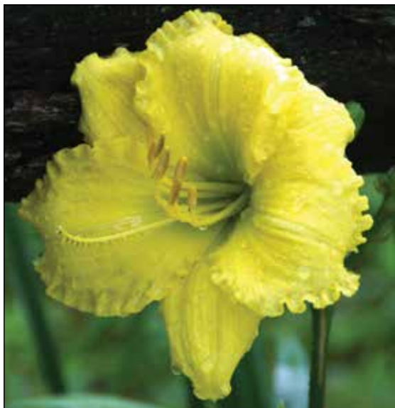
H. 'Seneca Valley' (Bennett 1983)