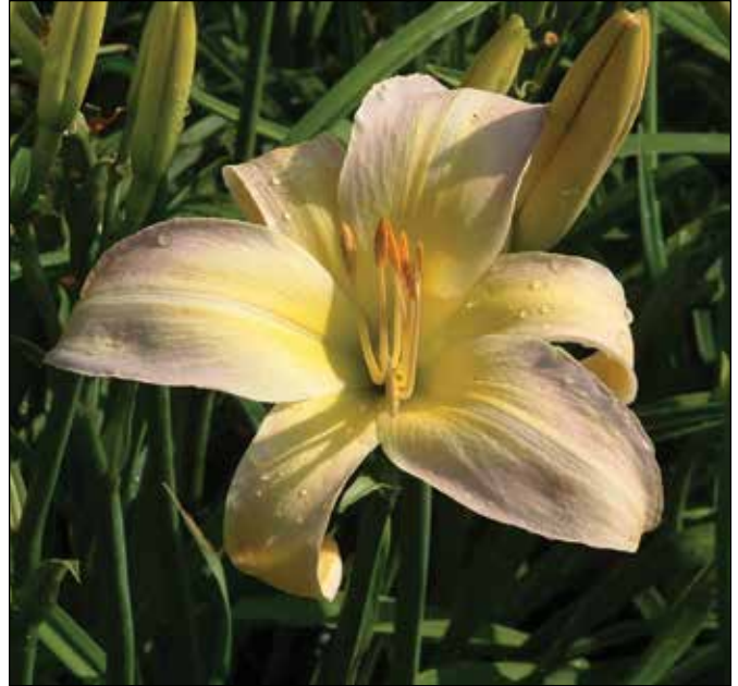
H. 'Skyhooks' (Hanson 1990)