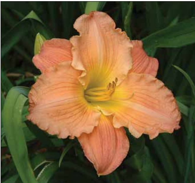
H. 'Cinnamon Bear' (Tarrant 1988)