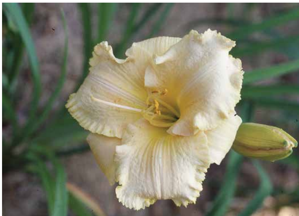
H. 'Zuppa Inglese' (J. Weston) Tet: 22", 5"; HM 2000