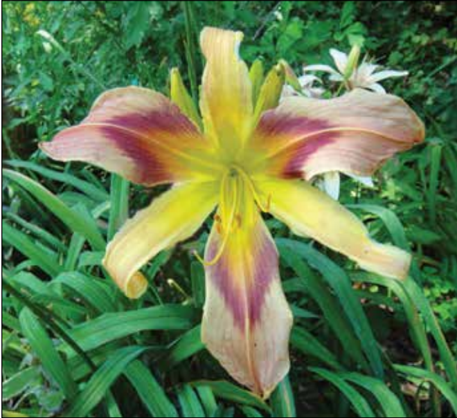
H. 'Pat Thornton' (Glidden 1988)

1990s. H. 'Startle' (1988), a 26", 5" red bitone with a darker halo, a cream edge and a green throat, achieved popularity and won an HM in 1999.