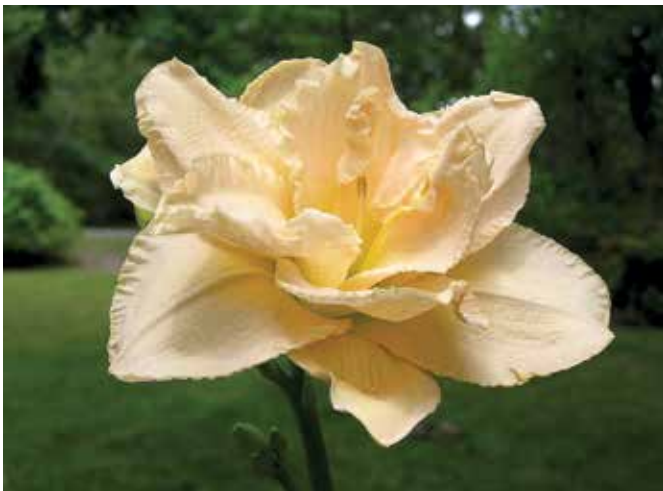
H. 'Land of Cotton' (Joiner) Dip: 30", 6" double; HM 1995