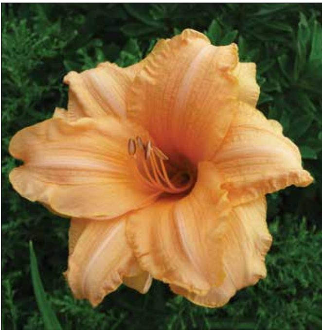
H. 'Zella Virginia' (Kropf 1982)