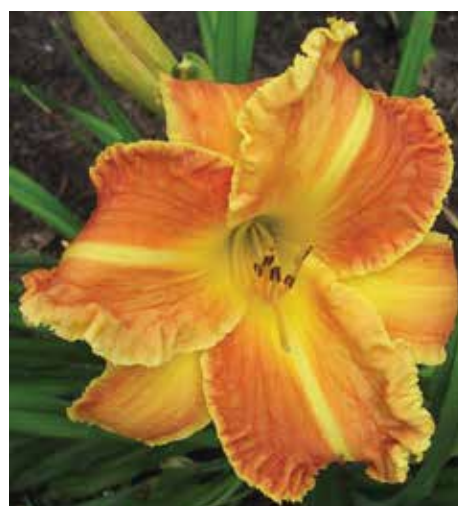
H. 'Butter Pecan' ( Gould ) Tet: 30", 6.5"; HM 1999