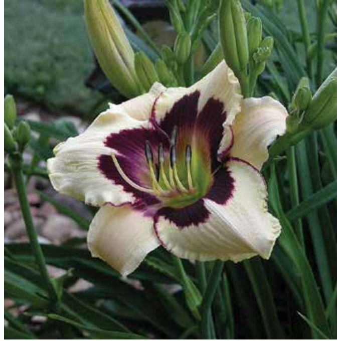
H. 'Moonlit Masquerade' (Salter) Tet: 26", 5.5"; HM 1999, AM 2002, Stout Medal 2004