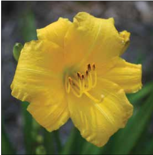
H. 'Yellow Lollipop' (Crochet 1980)