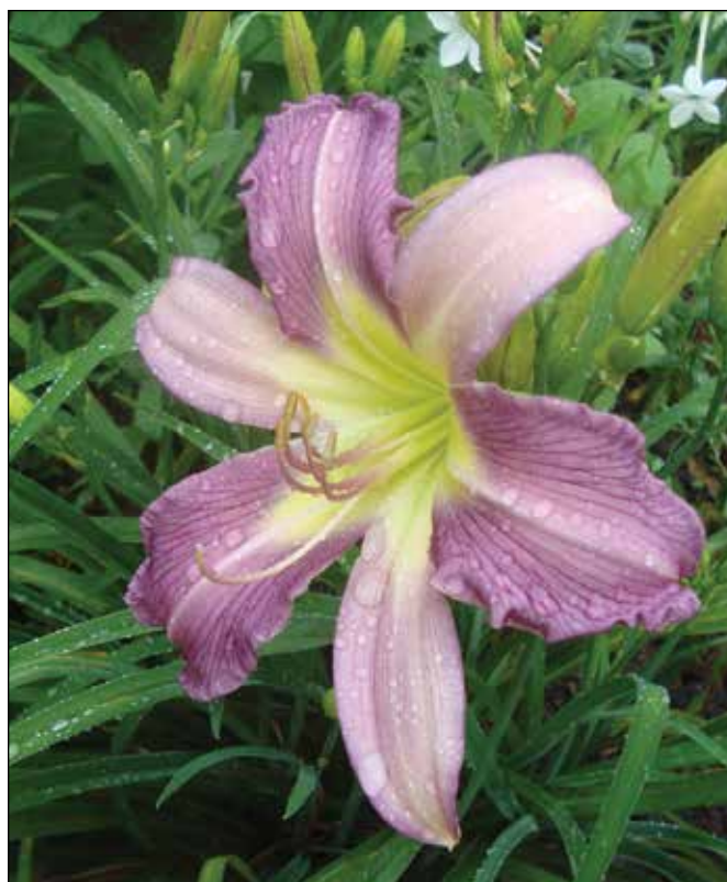
H. 'Moonlight Orchid' (Talbot 1986)