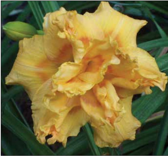
H. 'Violet Osborne' (Kirchhoff-D. 1987)