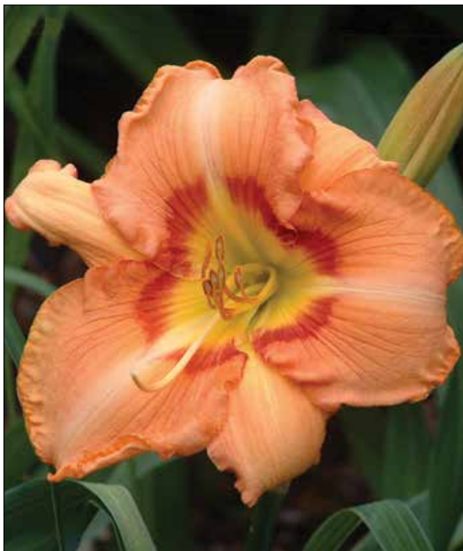
H. 'Lambada' (Kirchhoff-D. 1990)

Doris Simpson of Baltimore, Maryland, registered 31 diploids during the 1980s. H. 'Fond Hope' (1981), a 27", 5" peach with a faint pink blush at its center and a green throat, won an HM in 1986. 'Bite Size' (1981), a 20", 2.37" gold self, won an HM in 1987. 'Peachy Pie' (1982), a 28", 4" toasted peach bitone with a small golden peach halo and a gold throat, won an HM in 1990. 'Lemon Lollypop' (1985), a 24", 2.87" light lemon yellow self with a green throat, won an HM in 1990. 'Ah Youth' (1987), a 28", 4.5" clear pink with a slightly deeper pink eyezone and a lemon green throat, won an HM in