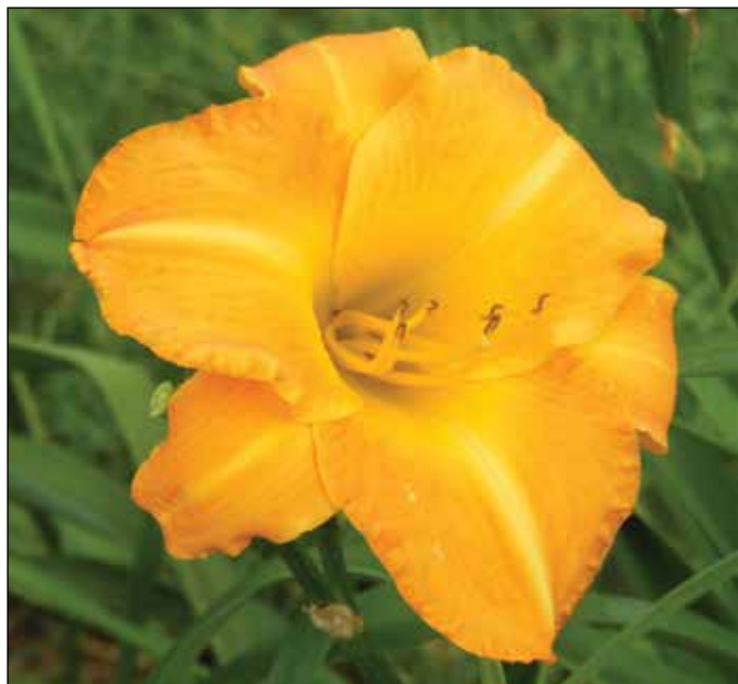
H. 'Carrot' (Edgar W. Brown 1985)

'Sunshine Magic' (1981), a 23", 7" gold self with a green throat, won an HM in 1987. Another tetraploid, 'Firepower' (1984), a 25", 6" barn red self with a green throat, won an HM