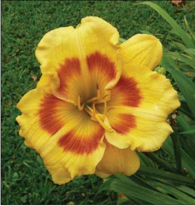
H. 'Jedi Tequila Sunrise' (Wedgeworth 1990)