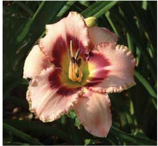
H. 'Oliver Dragon Tooth' ( Morss ) Tet: 20", 4.25"; HM 1999