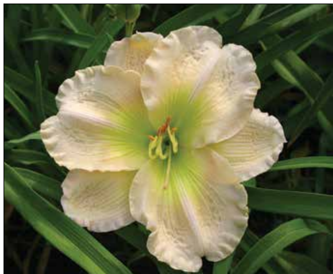
H. 'In Pastures Green' (Billingslea 1990)