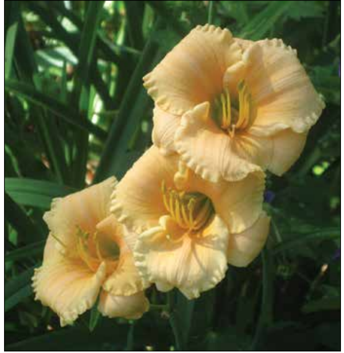
H. 'Moonlight Mist' (Hudson 1981)