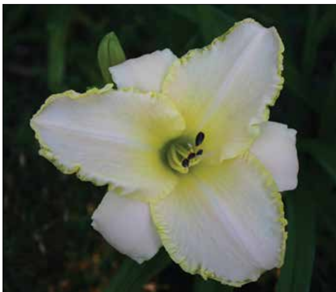
H. 'Wedding Band' (Stamile 1987)