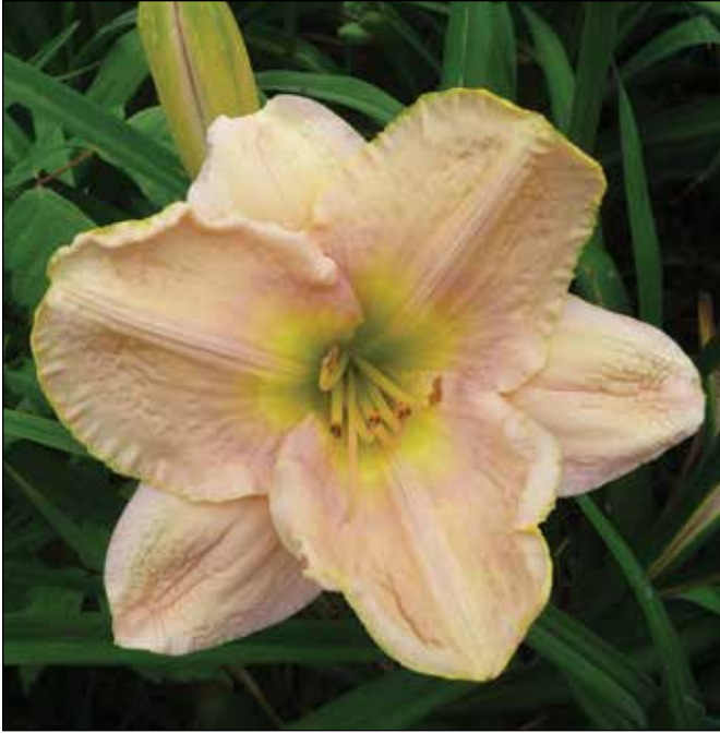
H. 'Graceland' (Morss 1987)