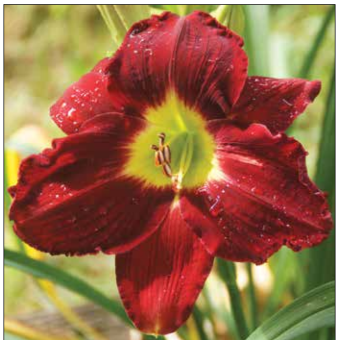
H. 'Big Apple' (Sellers 1986)