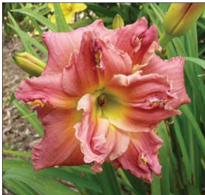
H. 'Sanford House' (Kirchhoff-D. 1984)

HM in 1987 and an AM in 1991. 'Cabbage Flower' (1984), still another diploid, won an HM in 1987 and the Ida Munson Award in 1990. It is a 17", 4.62" double pastel lemon yellow self with a green throat. The diploid double, 'Far Niente' (1984), a 26", 5.5" rose pink, flesh and lavender polychrome with a yellow throat, won an HM in 1994. However, 'Desdemona' (1984), a 20", 4.5" diploid double blend of magenta, orchid, and rose with a grayed watermark above a yellow green throat, remains overlooked, as does 'Fanciful Finery' (1984), a 15", 4.5" diploid double medium amber blend with pink highlights and an olive throat. 'Sanford House' (1984), a 26", 4.75" diploid double medium rose pink self with a green throat, also remains overlooked. 'Homer Howard Glidden' (1985), a 20", 3.25" diploid near white with an orchid cast and a yellow green throat, won an HM in 1988. 'Cotton Club'