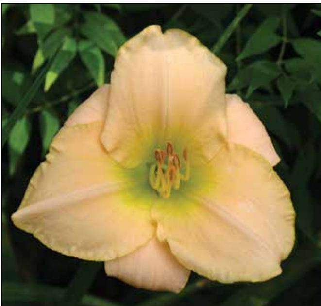
H. 'Ming Porcelain' (Kirchhoff-D. 1981)