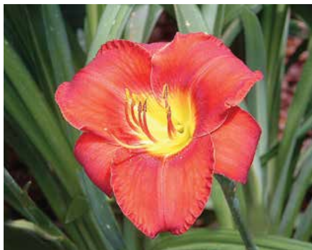
H. 'Sultry Siren' ( L. Gates ) Tet: 25", 6"; HM 1996