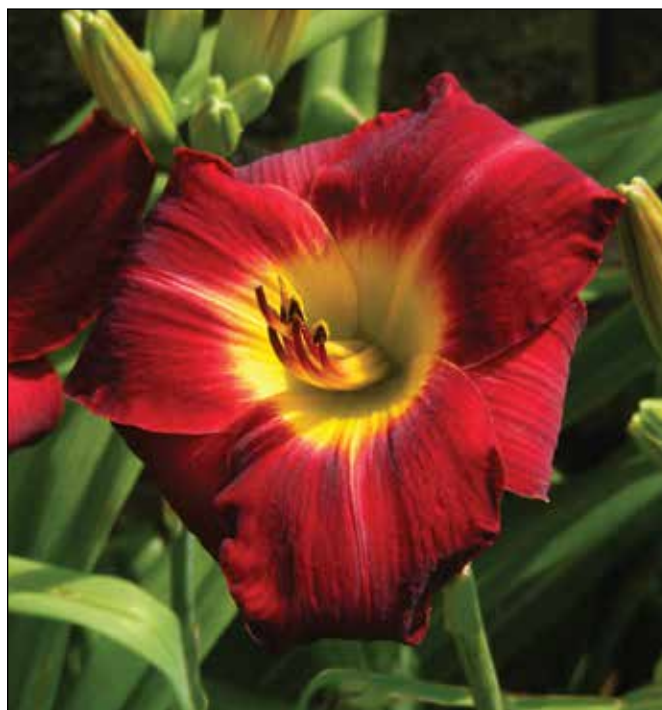
H. 'Gato' (Durio 1981)