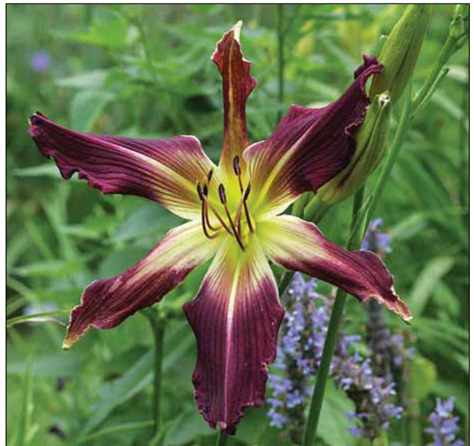
H. 'Vampire Lestat' (Lambert-Whitacre 1990)