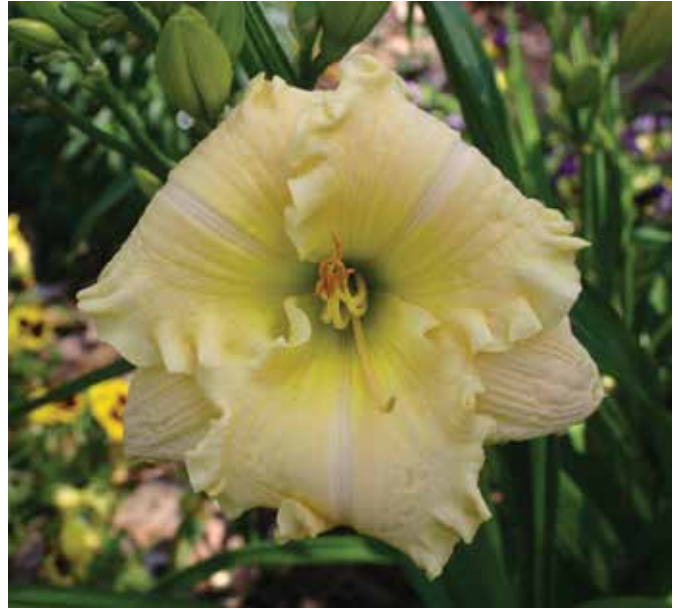
H. 'Lights of Evening' (Billingslea 1990)