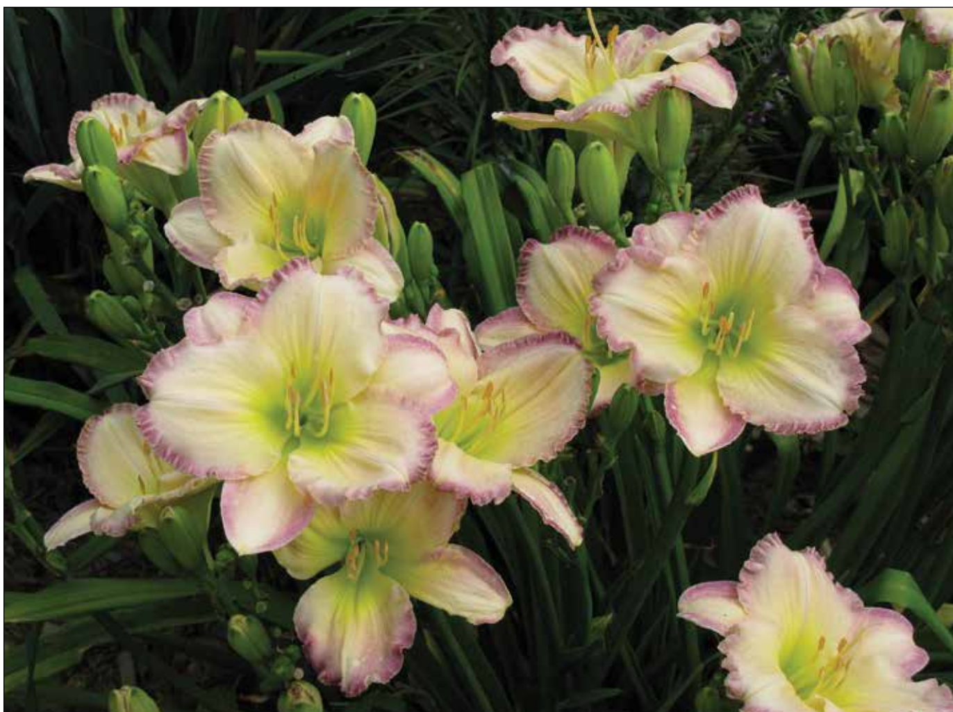
H. 'Seal of Approval' (Santa Lucia 1990)