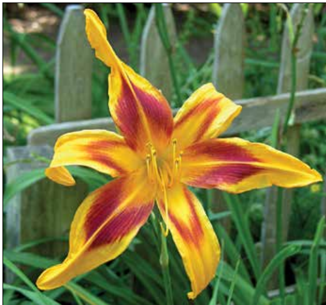
H. 'Calico Spider' (Crandall 1987)