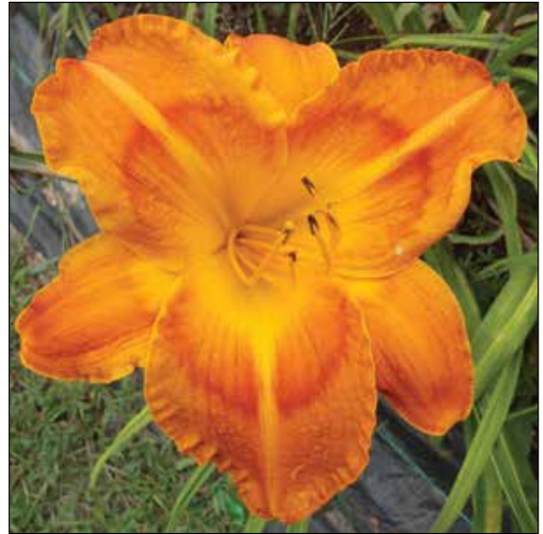
H. 'Jambalaya' (Soules 1981)

a 21", 4" pink, orange, and lavender blend with a purple eyezone and a green throat, won an HM in 1986. Two additional diploids also received honors: 'Royal Charm' (1988), a 16", 3.37" Egyptian buff edged wine grape with a wine grape halo and a lime green throat, won an HM in 1994; and 'Porcelain Ruffles' (1990), a 23", 5.5" ivory with pink overlay and a chartruse throat, won an HM in 1996. Another popular diploid, 'Inca Toy' (1990), a 20", 3.25" yellow cream blend edged rosy mahogany with a yellow green throat, remains overlooked, as does 'Swingin' Miss' (1990), a 22", 3.25" rose red diploid with white midribs and yellow throat.