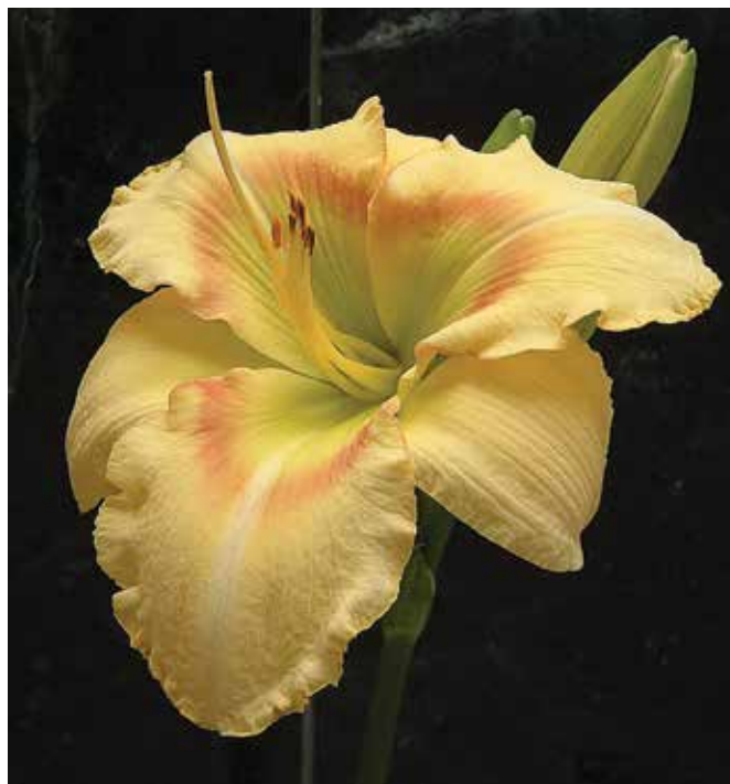
H. 'Big Doc' (D. Kirchoff) Tet: 27", 7"; HM 1998