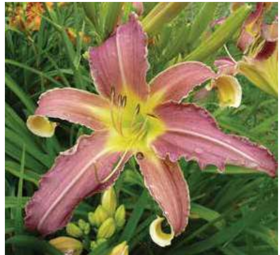
H. 'Loch Ness Monster' (G. Couturier) Dip: 25", 7.5" spider ratio 4.40:1; HM 2008