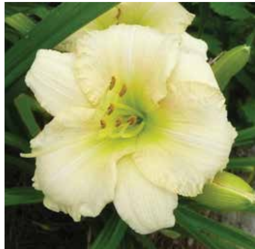
H. 'White Lemonade' (Loughry) Dip: 25", 3.5"; Florida Sunshine Cup 1993, HM 1998