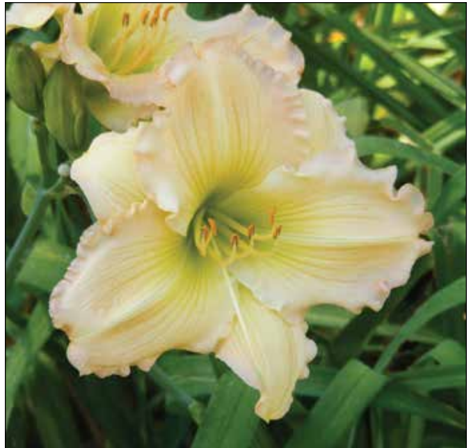
H. 'Stop the Show' (Gates-L. 1986)

green throat, in 1992; 'Stop the Show' (1986), a 24", 6.5" lavender pink and yellow polychrome with a green chartreuse