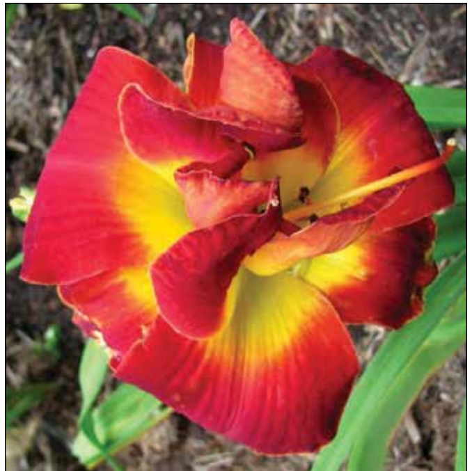
H. 'Red Explosion' (Sellers 1986)

'Charm' (1986), a 26", 4" pale pink diploid with a pink halo and green throat, won an HM in 1993, and a diploid double, 'Red Explosion' (1986), a 26", 5.5" red with a yellow green throat, won an HM in 1994. Two of his most honored diploids were 'Exotic Echo' (1984), a 16", 3" pink cream blend double with a burgundy eye and a green throat, which won an HM in 1989, the Annie T. Giles Award for small flowers in 1994, and an AM in 1994; and 'Big Apple' (1986), a 26", 5" cerise red self with a green throat, which won an HM in 1989 and an AM