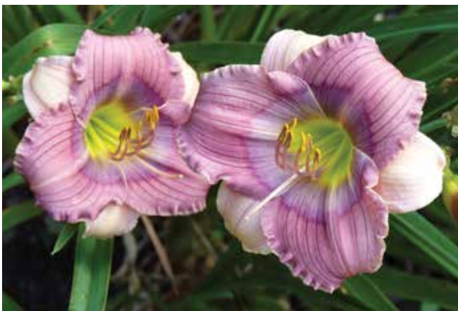
H. 'Siloam Tiny Tim' (Henry-P. 1984)

pinkish beige with a deep rose eyezone and green throat, won an HM in 1984. 'Siloam Show Girl' (1981), an 18", 4.25" red with a deep red eyezone and a green throat, also won an HM in 1984. 'Siloam Sambo' (1982), a 24", 4" black red self with a bright green throat, won an HM in 1992. Something of a departure in size, 'Siloam Mama' (1982), a 24", 5.75" yellow self with a green throat, won an HM in 1985; 'Siloam Medalion' (1982), a 26", 6.5" yellow self with a green throat, won an HM in 1992; and 'Siloam Harold Flickinger' (1983), a 26", 6" yellow pink blend with a green throat, won an HM in 1988. 'Siloam Royal Prince' (1983), a 19", 4" red purple self with a green throat, won an HM in 1986. 'Siloam Tiny Tim' (1984), a 14", 3" blue purple blend with a deep purple and smoky blue eyezone above a green throat, won an HM in 1988. 'Siloam Betty Woods' (1984), an 18", 5" double pink self with a green