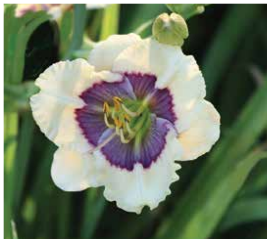
H. 'Elfin Etching' (E. H. Salter) Dip: 20", 3"; HM 1999