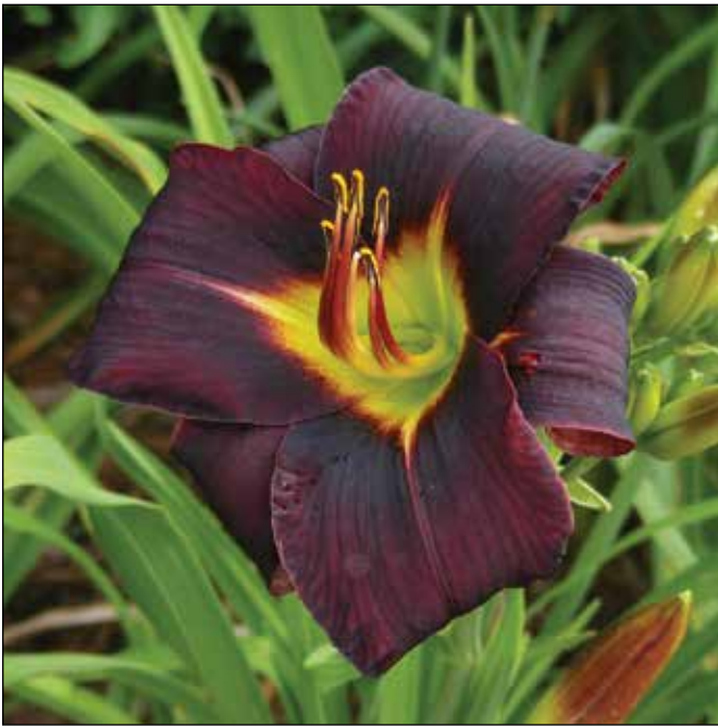
H. 'Black Velvet Elvis' (Glidden 1988)