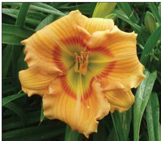
H. 'Pumpkin Kid' (Spalding-W. 1987)