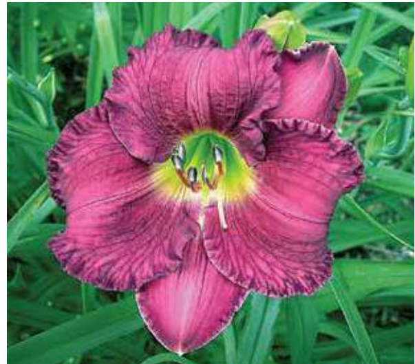
H. 'Solomons Robes' (Talbot) DIP: 30", 6"; HM 1995, AM 1998