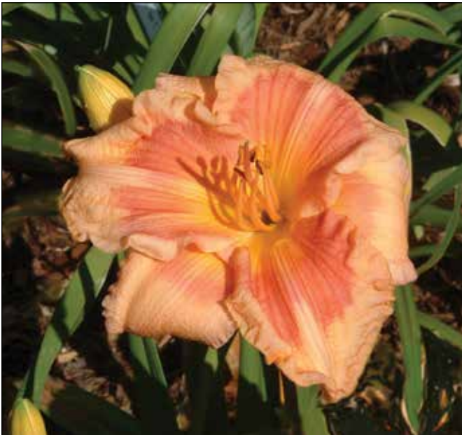
H. 'Paige's Pinata' (Hansen 1990)

gene S. Foster Award for late booming cultivars in 1994. 'Tusawilla Tigress' (1988), a 25", 7.25" bright orange tetraploid with a dark orange eyezone and a chartreuse throat, won an HM in 1992 and an AM in 1996. 'Tusawilla Tranquility' (1988), a 21", 5.5" near white diploid with a lemon lime throat, won an HM in 1992. 'Night Beacon' (1988), a 27", 4" black purple diploid with a large chartreuse center and a green throat, won an HM in 1998. 'Palo Duro Canyon' (1989) a 26", 6" rust brown diploid with a darker center edged gold with an ol-