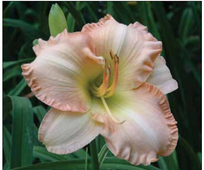
H. 'Heaven Can Wait' (Hansen 1990)

ive throat, won an HM in 1994. 'Tusawilla Princess' (1990), a 26", 5" pink diploid with a tiny olive throat, won an HM in 1993. 'Paige's Pinata' (1990), a 26", 6" peach diploid with a bold fuchsia band around an orange eyezone and a dark green throat, won an HM in 1994, an AM in 1997, and the Don C. Stevens Award for banded or eyed cultivars in 1998. 'Affair to Remember' (1990), a 22", 6" hot fuchsia pink and cream bitone diploid with a very large chartreuse throat, won an HM in 1994. 'Heaven Can Wait' (1990), a 23", 5" peach pink diploid with a darker edge and a green throat, won an HM in 1994. 'Sings the Blues' (1990), a 26", 6" lavender with a variegated violet blue eyezone and an emerald throat, won an HM in 1994. 'Riseman's Flame' (1990), a 22", 6" cream yellow diploid with rose red overlaid patterns above a green throat, won an HM in 1995. 'Prince Michael' (1990), a 28", 7" violet diploid with a magenta purple eyezone and a green throat, won an HM in 1997. 'Just Whistle' (1990), a 24", 4.25" orchid diploid with a dark purple eyezone and an emerald throat, won