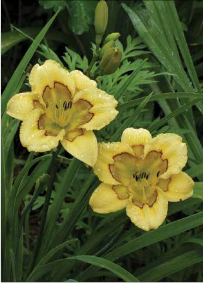
H. 'Patchwork Puzzle' (E. H. Salter 1990)