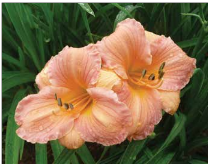
H. 'Little Rosy Cloud' (Elna Winniford 1985)