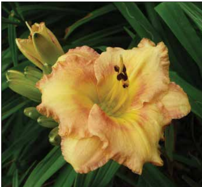
H. 'Inca Toy' (Soules 1990)