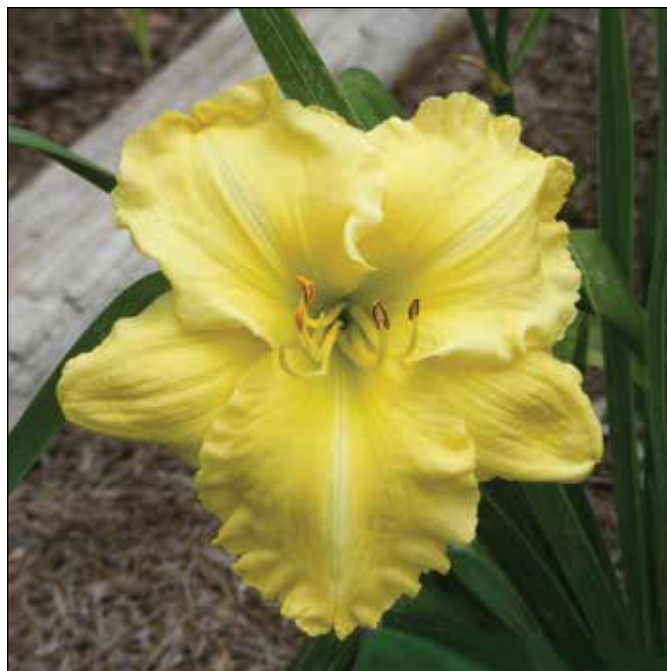
H. 'Ruffled Perfection' (J. Carpenter 1989)