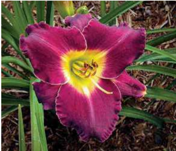
H. 'African Diplomat' (Carr) Tet: 29", 5.5"; HM 1998