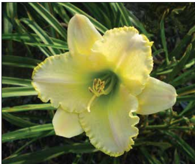
H. 'Fragrant Bouquet' (Reckamp-Klehm 1989)