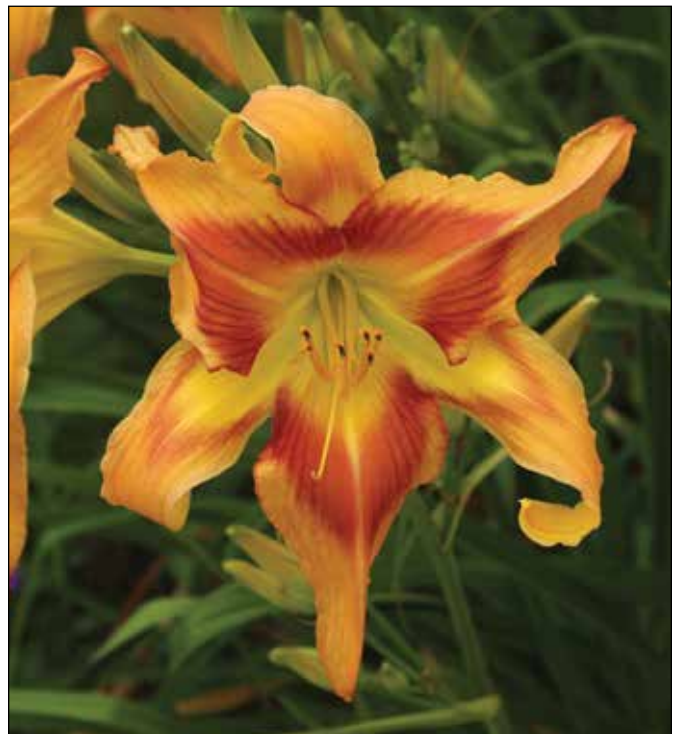
H. 'Parade of Peacocks' (Oakes 1990)