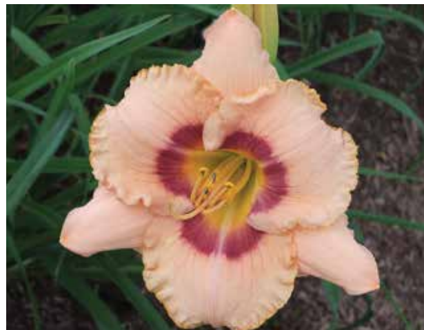
H. 'True Grit' ( Stamile ) Tet: 21", 5"; HM 1996