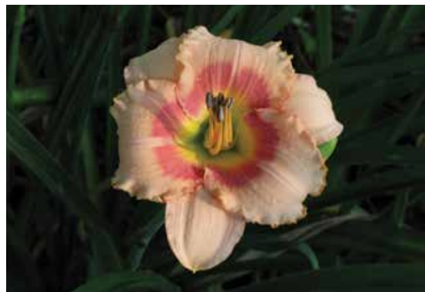
H. 'Sweet Sugar Candy' ( Stamile ) Tet: 25", 4"; HM 2008