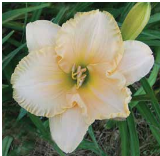
H. 'Luverne' (Sikes) Dip: 28", 5.75"; HM 1996