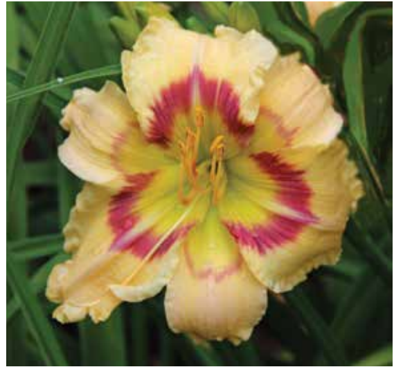
H. 'Violet Explosion' (Stamile) Dip: 25", 6.5"; No Awards