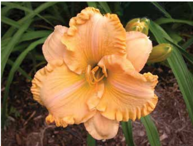
H. 'Alexandra' (Salter) Tet: 24", 5.5"; HM 1997