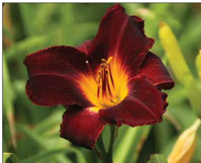
H. 'Moonless Night' (Rasmussen 1985)

(1987), a 24", 4.5" golden yellow with a red eyezone and gold throat, won an HM in 1997. 'Raging Tiger' (1987), a 25", 6" burnt orange and yellow blend with a wine red eyezone and an orange yellow throat, won an HM in 1990. 'Lady Dancer' (1989), a 28", 5.5" rose pink blend edged plum with a green gold throat, won an HM in 2000. Several of his tetraploids from the historical period, however, have been overlooked for awards, among them: 'Island Blackout' (1981), a 34", 6.5" black red blend with a gold throat; 'Moonless Night' (1985), a 30", 6" black red self with a yellow green throat; and 'Modern Design' (1989), a 24", 4" beige pink with a dark plum eyezone and green throat. In all, he is credited with 65 registrations.