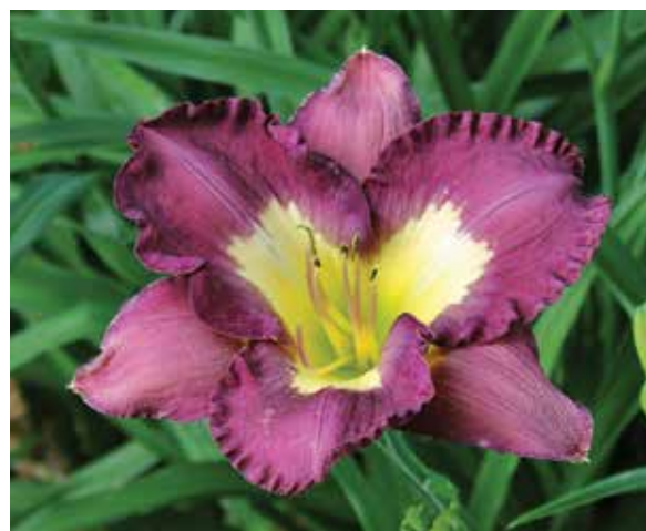
H. 'Silent Sentry' (Salter) Tt: 24", 5.5"; HM 2006