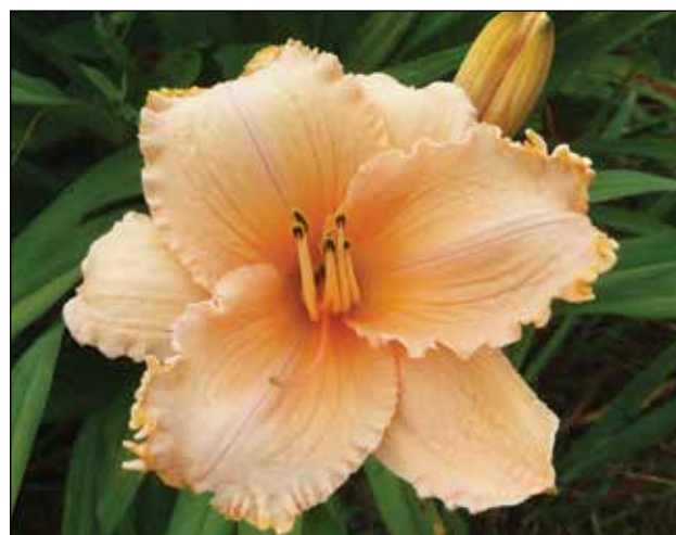
H. 'Decatur Piecrust' (Davidson 1982)