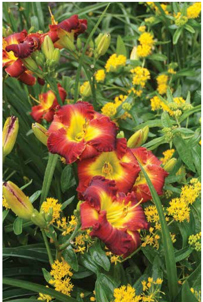
H. 'Dragon King' (D. Kirchhoff) with Asclepias tuberosa 'Hello Yellow'