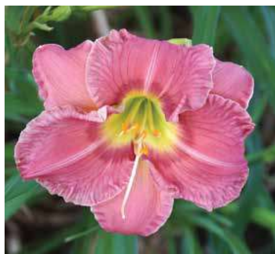
H. 'Fair Kelly Michelle' (Wall) Dip: 24", 5"; HM 1997