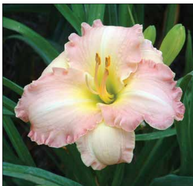
H. 'Antique Rose' (Sikes 1987)