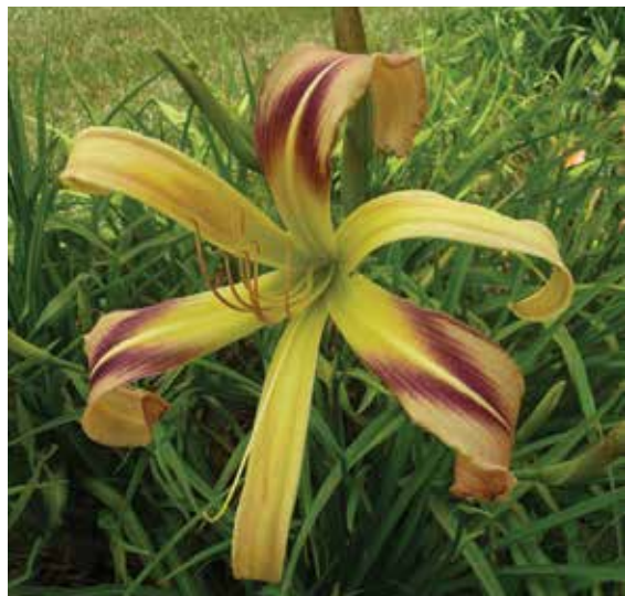
H. 'Tennessee Flycatcher' ( Harris-Reinke ) Dip: 34", 10" spider ratio 5.60: 1; HM 1996