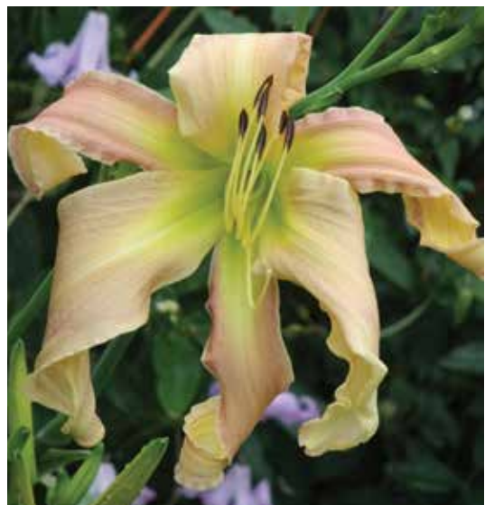
H. 'Lola Branham' (Burkey) Dip: 38", 7.5" unusual form crispate; HM 1999, L/W Award 2003