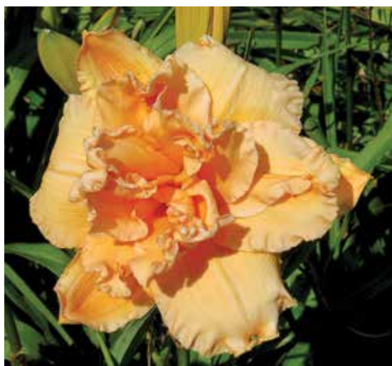
H. 'Madge Cayse' (Joiner) Dip: 24", 6" double; HM 1994, AM 1999 (Photo by Chris Petersen)