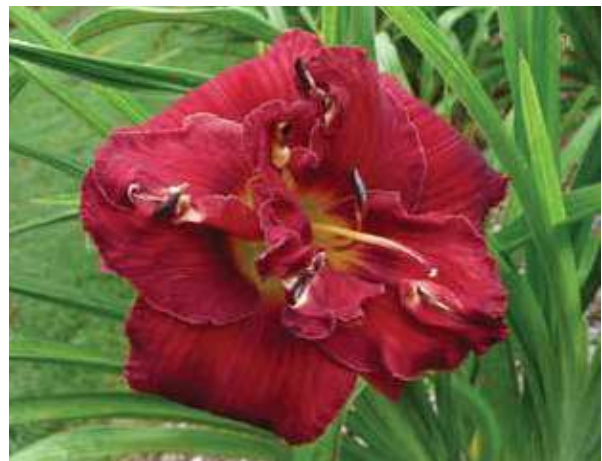
H. 'Wally' (T. Howard) Dip: 22", 5.25" double; HM 1994