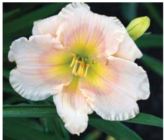
H. 'Cindy Ann' (Crochet) Dip: 22", 5.5"; HM 1996