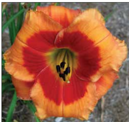
H. 'Bold Tiger' (Stamile 1990)

throat, won an HM in 1996 and the Eugene S. Foster Award in 1997 for late blooming cultivars. 'Almond Puff' (1990), a 23", 6.5" diploid double beige self with a green throat, won an HM in 1995, the Ida Munson Award in 1997, and an AM in 1998. 'Admiral's Braid' (1990), a 21", 5.5" white and pink bicolor edged in gold with a green throat, won an HM in 1996 and an AM in 1999. 'Silken Touch' (1990), a 23", 6" rose pink self with a green throat, won an HM in 1996. 'Isle of Capri' (1990), a 23", 6" deep lemon yellow self with a green throat, won an HM in 1997. 'Olympic Showcase' (1990), a 24", 6.25" brilliant gold self with a green throat, won an HM in 2005.