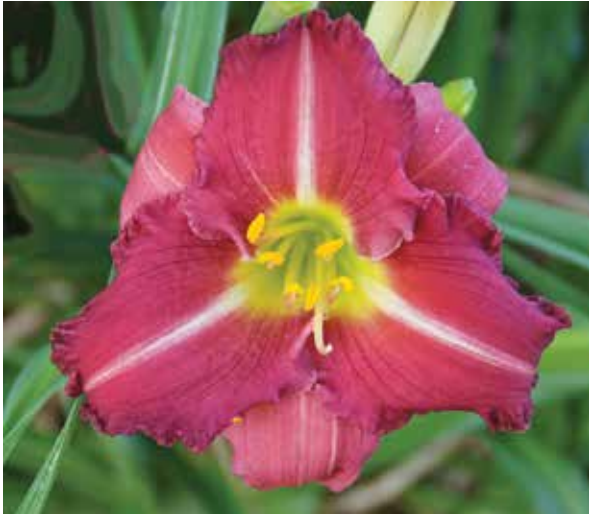
H. 'Herman Apps' (Apps) Dip: 28", 5.5"; HM 1996