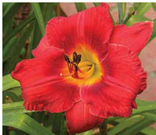
H. 'Pedro Osornio' (R. Mercer) Tet: 26", 5.5"; HM 2000