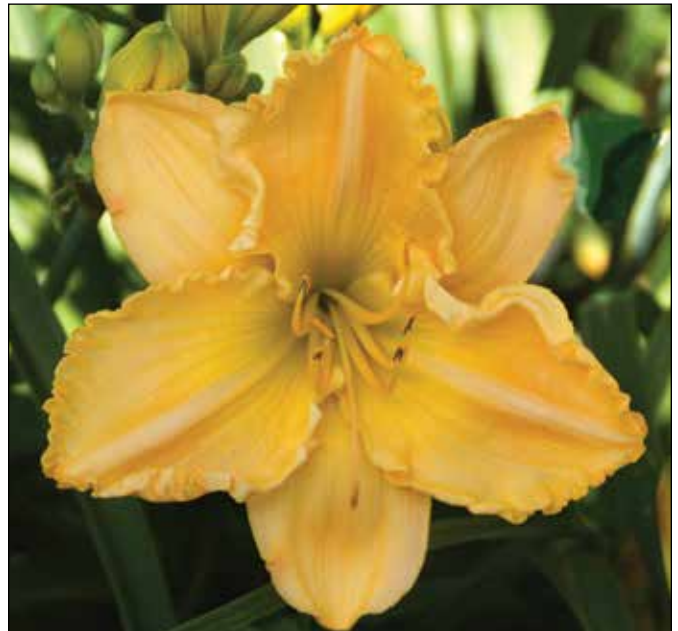
H. 'Josephine Marina' (J. Carpenter 1987)

'Regal Heir' (1987), a 22", 5.5" purple self with a yellow green throat, won the President's Cup at the National Convention in 1992, but again no further awards. 'Josephine Marina' (1987), a 21", 7.5" apricot peach self with an olive green throat, won an HM in 1990 and an AM in 1993. 'Marie Hooper Memorial' (1988), a 26", 8.25" melon pink blend with yellow green throat, won an HM in 1998. 'Ruffled Perfection' (1989), a 24", 7" lemon yellow self with a green throat, won an HM in 1997 and an AM in 2000. 'Dark and Handsome' (1990), a 20", 5.75" smoky pink with a dark maroon eyezone and a yellow green throat, won an HM in 1997. 'Merle Kent