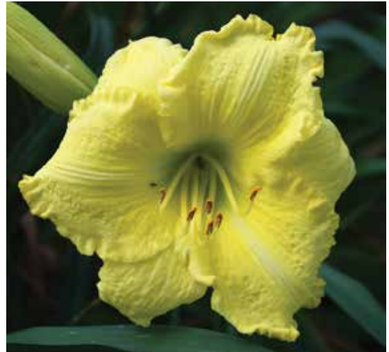
H. 'Omomuki' ( Stamile ) Tet: 26", 5"; HM 1995