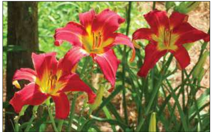
H. 'Spider Man' (Durio 1982)