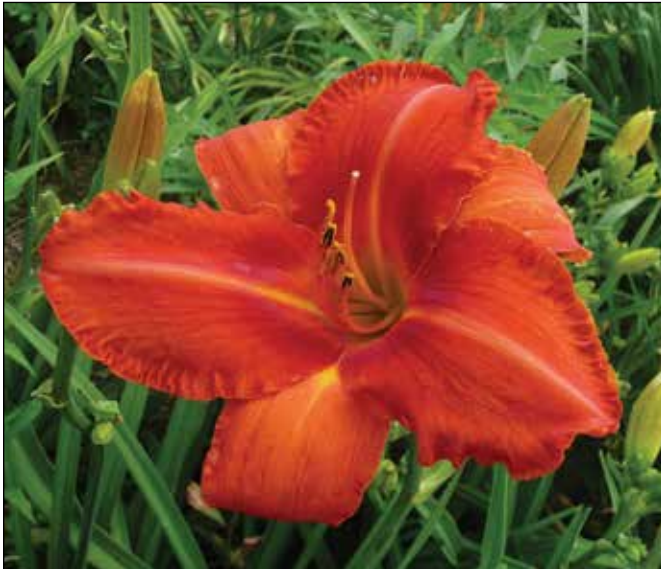
H. 'Alabama Jubilee' (Webster 1988)

24", 5" bright red self with a green throat, won an HM in 1992. 'Roll Tide' (1987), a 26", 5.5" bright red self with a small green throat, won an HM in 1996. 'Alabama Jubilee' (1988), a 30", 7" fluorescent red orange with a brighter red halo, won an HM in 1993. However, 'Centerpiece' (1988), a 26", 6.5" vivid orange yellow with a deep purple eyezone, and 'Risen Star' (1988), a 26", 10" soft yellow unusual form crispate with a greenish yellow throat, remain overlooked, as does 'Exotic Dancer' (1989), a 28", 7.5" pink unusual form crispate with a green throat. 'Red Suspenders' (1990), a 32", 11" bright red unusual form crispate with a chartreuse green throat, won an HM in 1995 and came the closest of any of these to winning an AM, missing by one vote.