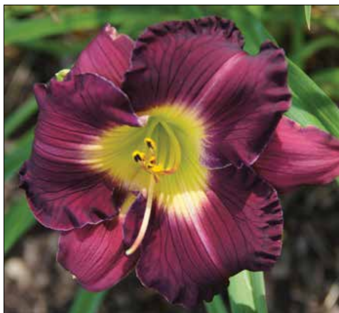
H. 'Ruth Griffin' (Weldon 1990)