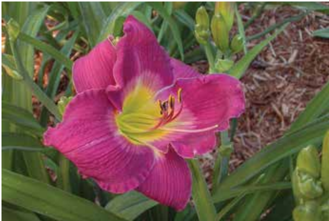
H. 'African Grape' (R.W. Munson, Jr.) Tet: 28", 6"; HM 2000