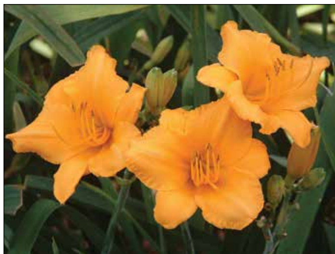
H. 'Little Orange Tex' (Faggard 1985)