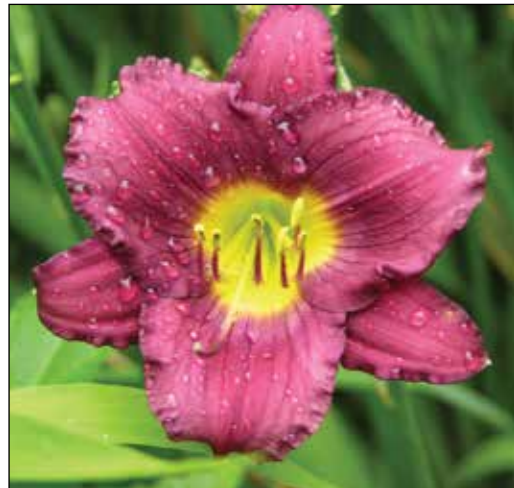
H. 'Velvet Shadows' (Hudson 1981)

from the early part of the decade included 'Moonlight Mist' (1981), an 18", 3" frost pink peach blend with a chartreuse throat; 'Crimson Icon' (1982), a 15", 2.75" diploid red self with a yellow green throat; and 'Jim McGinnis' (1983), a 15", 2.75" diploid pink with a rose red eyezone and a green throat. The first received an HM in 1985, and the latter two, HMs in 1987. Another, 'Velvet Shadows' (1981), a 15", 2.75" violet purple diploid with a chalky lavender watermark and green throat, was honored somewhat belatedly with an HM in 2011,