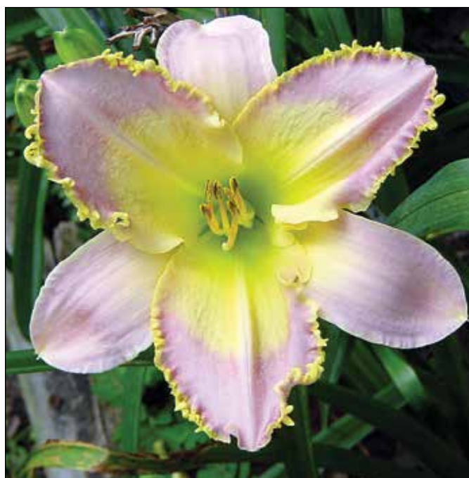
H. 'Magic Filigree' (Salter 1988)