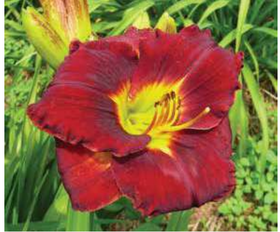
H. 'Rain Dance' (Benz) Tet: 28", 5"; HM 2000