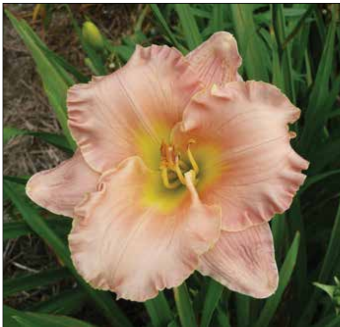
H. 'Someone Special' (Sikes 1985)

self with a chartreuse throat, won an HM in 1990. The most famous of her diploids from the mid-1980s was 'Neal Berrey' (1985), an 18", 5" rose pink blend with a green yellow throat. It won an HM in 1989, an AM in 1992, and the Stout Silver Medal in 1995. Other important diploids included 'Antique Rose' (1987), a 25", 5.5" rose pink bitone with a green yellow throat, which won an HM in 1989 and an AM in 1994; 'Trade-last' (1988), a 24", 4.75" deep pink blend with a green yellow throat, won an HM in 1991; 'Special Moment' (1990), a 26", 5" lavender blend with a green throat, which won an HM in 1995; and 'Heather Pink' (1990), a 22", 5" pink blend with a green throat, which won an HM in 1996. Sarah was awarded