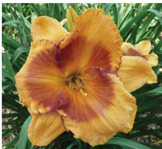
H. 'Brown Eyed Girl' ( D. Kirchhoff ) Tet: 28", 5"; HM 1998