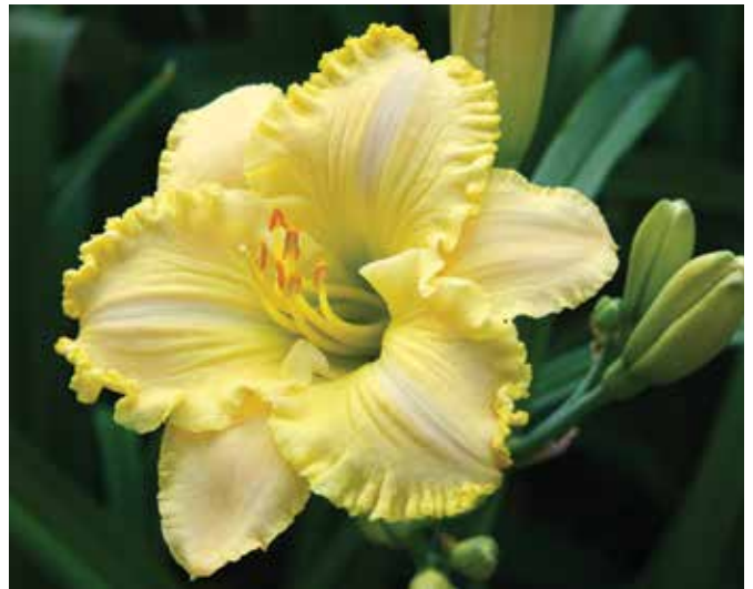
H. 'Betty Warren Woods' (R. W. Munson, Jr. 1987)

a 20", 5" cream self with a chartreuse throat, won an HM in 1997. 'Malaysian Monarch' (1986), a 24", 6" burgundy purple self with a cream white throat, won an HM in 1990 and an AM in 1993. 'Respighi' (1986), a 20", 6" wine black with a chalky wine eyezone and a yellow green throat, won an HM in 1993 and an AM in 1996. Another of his most famous registrations, 'Betty Warren Woods' (1987), a 24", 4.5" cream yellow self with a green throat, won an HM in 1997 and an AM in 2000. 'Court Magician' (1987), a 25", 5" purple with