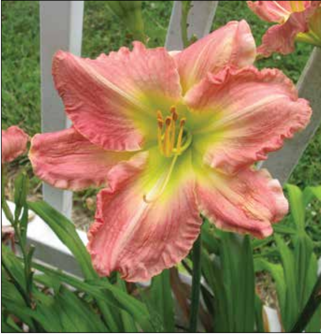
H. 'Mabel Nolen' (Nolen 1984)