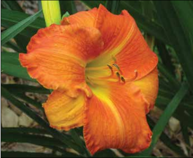
H. 'Old Tangiers' (Millikan 1985)