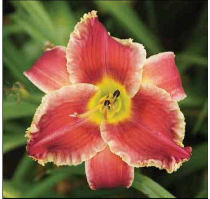
H. 'Startle' (Belden 1988)

Ron Rose of East Taunton, Massachusetts, registered only four cultivars. His diploid H. 'Blueberry Breakfast' (1988), a 22", 5" slate lavender with wide magenta purple mid-ribs and a deep purple eyezone above a green throat, gained popularity and won an HM in 2002.