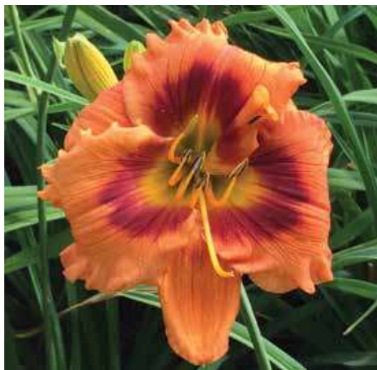
H. 'Bronze Eyed Beauty' ( J. Carpenter ) Dip: 24", 6"; HM 1997