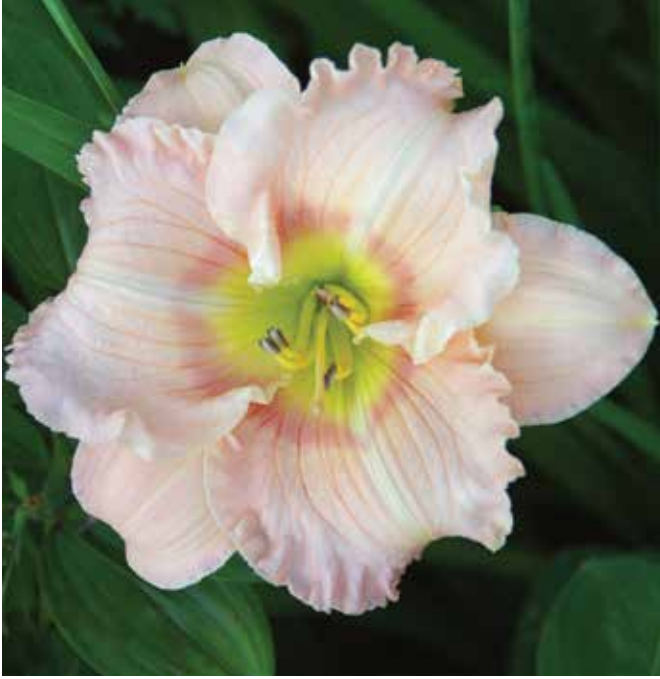
H. 'Molino Pink Loveliness' (McCord) Dip: 18", 5.5"; HM 1997