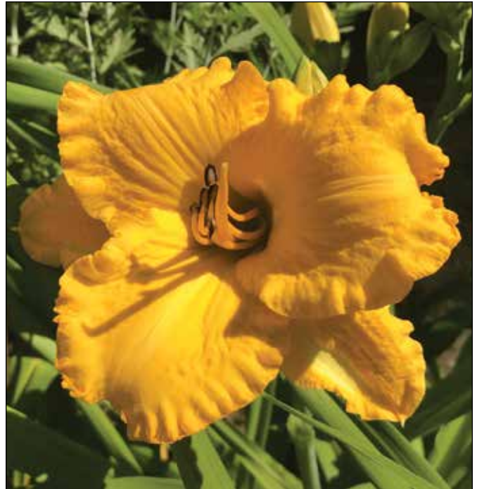
H. 'Jerusalem' (Stevens-Seawright 1985)