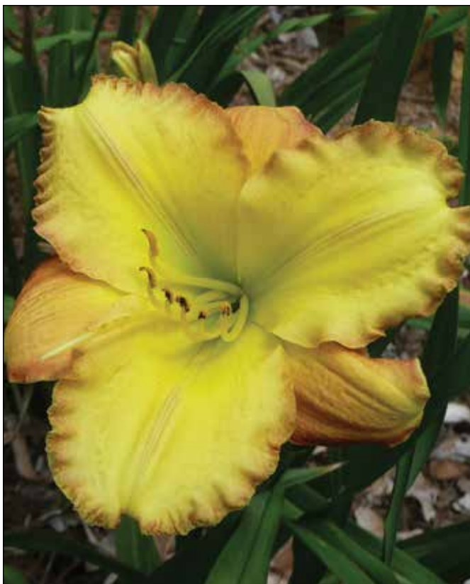
H. 'Unique Style' (Kate Carpenter 1985)