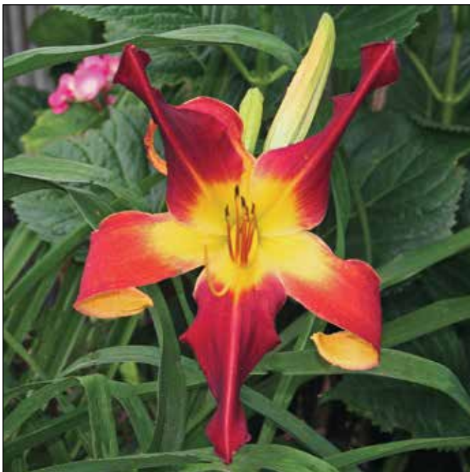
H. 'Red Suspenders' (Webster 1990)