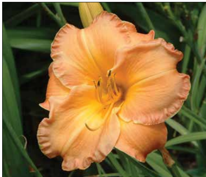
H. 'Clay Basket' (Ford 1989)