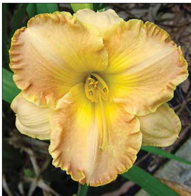
H. 'Chestnut Mountain' (Salter 1989)