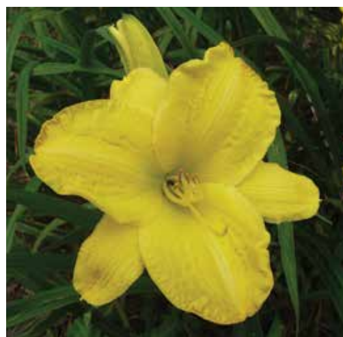
H. 'Deloris Gould' (Gould) Tet: 25", 5"; HM 1998