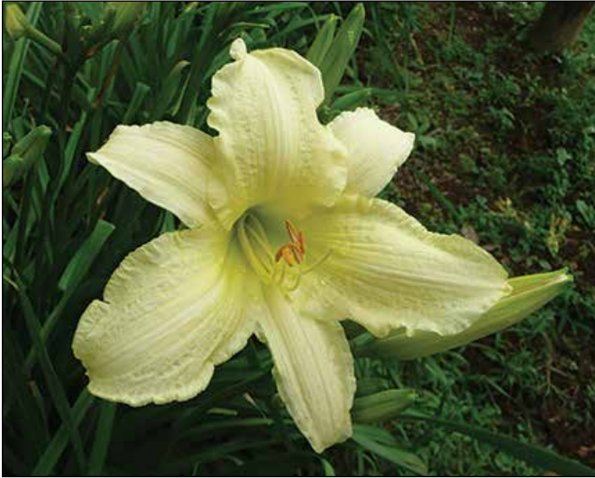
H. 'Ghost Fingers' (Nelson 1987)