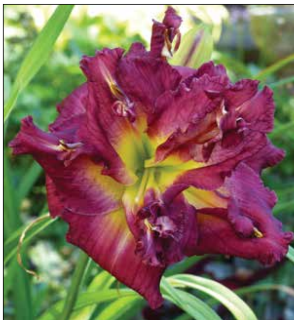
H. 'Desdemona' (Kirchhoff-D. 1984)