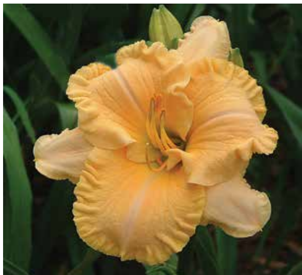
H. 'Good Morning America' (Salter) Tet: 26", 6"; HM 2005