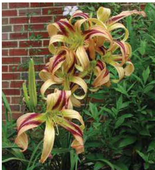
H. 'De Colores' (Temple) Dip: 28", 8.5" spider ratio 6.00:1; Harris Olson Award 1998, HM 1999