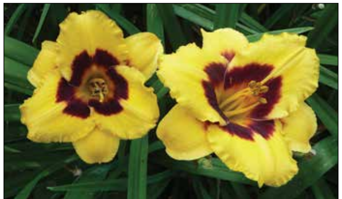
H. 'Blackberry Candy' (Stamile 1989)