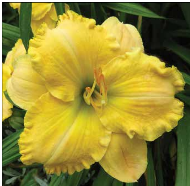
H. 'My Darling Clementine' (Salter 1988)