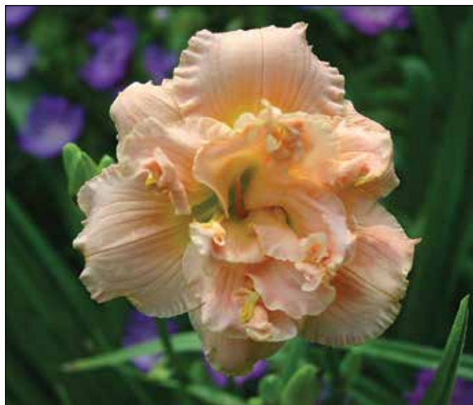
H. 'Siloam Double Classic' (Henry-P. 1985)