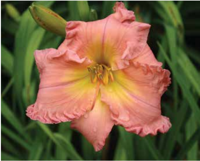
H. 'Tahitian Waterfall' (Billingslea) Dip: 26", 5.5"; HM 1996