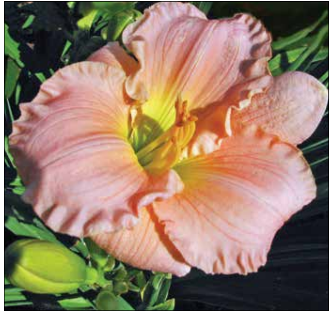
H. 'Jedi Brenda Spann' (Wedgeworth 1990)

er rose eyezone and green throat, it won an HM in 1997 and an AM in 2001. 'Jedi Brenda Spann' (1990), a 24", 6" pink self with a green throat, won an HM in 1997 and is still widely grown. Other cultivars included 'Jedi Tom Wilson' (1988), a 22", 6" copper and cinnamon peach blend with a green throat; 'Jedi Codie Wedgeworth' (1990), a 26", 6" lavender pink with maroon eyezone and green throat; and 'Jedi Tequila Sunrise' (1990), a 20", 5.5" green yellow with a maroon eyezone and a green throat. All three won HMs in 1997.