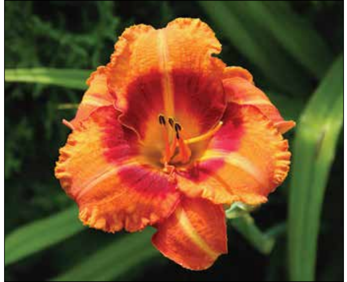
H. 'Tigger' (Stamile 1989)