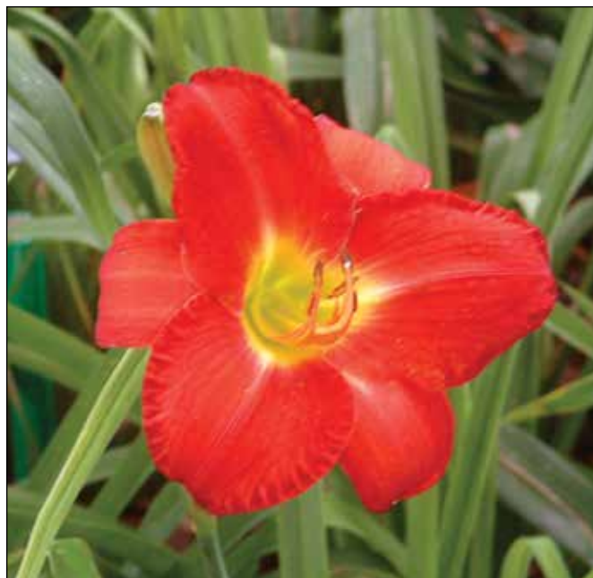
H. 'King Lamoni' (Roberson 1981)

between the late 1970s and mid 1990s, both diploids and tetraploids. For whatever reason, only one of his introductions has received an award. The diploid, H. 'Mormon' (1977), a 20", 8.5" near white self, won an HM in 1985. Although overlooked for awards, his tetraploid, 'King Lamoni' (1981), a 24", 5" scarlet self with a green throat, is still grown. He is perhaps best known for his diploid, 'Black Eyed Stella' (1989), a 13", 3.12" golden yellow with a dark red eyezone and a yellow gold throat. Though distributed commercially in thousands of plants, it nevertheless has not been recognized for awards by the AHS.