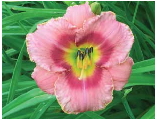
H. 'Sublime Enchantment' (D. Kirchhoff) Tet: 25", 4.25"; HM 1996