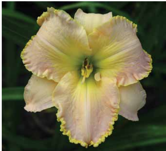
H. 'Ida's Magic' (Ida Munson 1988)

the Stout Silver Medal. 'Chinese Temple Flower' (1980), a 24", 5" lilac with purple eyezone and green throat, won an HM in 1982. 'Chinese Cloisonne' (1984), a 26", 5" peach ivory with a pale slate eyezone and green gold throat, won an HM in 1985. And 'Ida's Magic' (1988), a 28", 6" amber peach edged gold with a green gold throat, won an HM in 1986, an AM in 1999, and the Stout Medal in 2001.