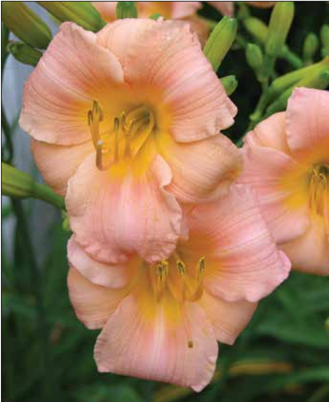
H. 'Promises Promises' (Warner 1981)