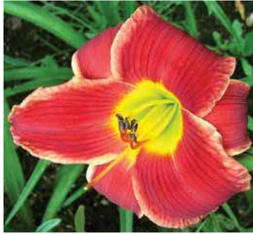
H. 'Street Urchin' D. Kirchhoff) Tet: 25", 5.5"; HM 1998