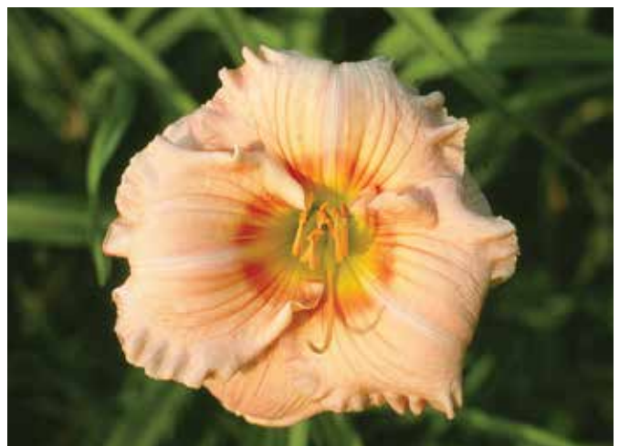
H. 'In Glad Adoration' (Billingslea) Dip: 22", 6"; HM 1998