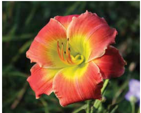
H. 'God is Listening' (Hansen) Dip: 26", 4"; HM 2000