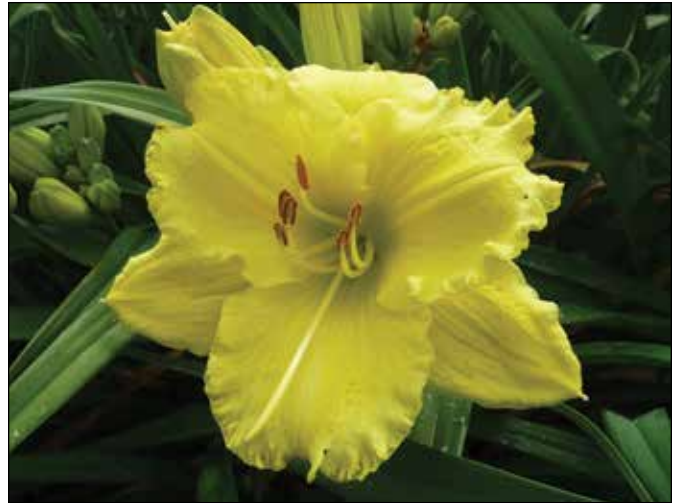
H. 'Floyd Cove' ( Stamile 1987)