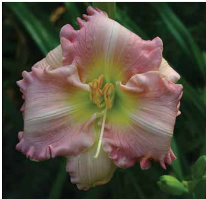
H. 'Neal Berrey' (Sikes 1985)