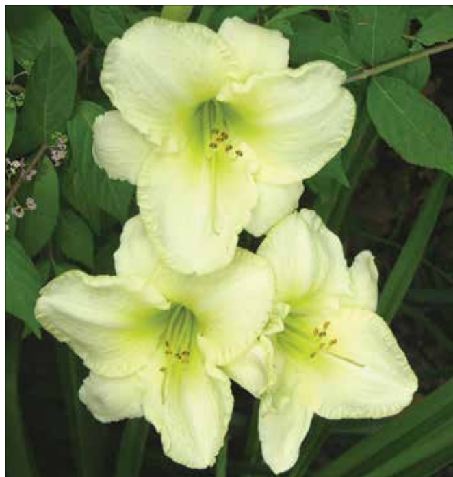
H. 'Lime Frost' (Stamile 1990)