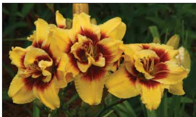
H. 'Mount Helena' (Grooms 1985)