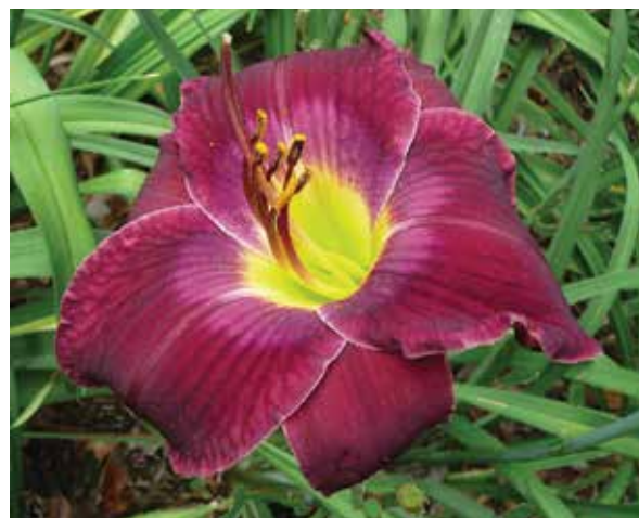
H. 'Nordic Night' (Salter) Tet: 24", 5"; HM 2003