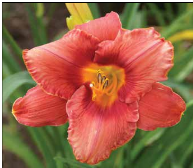
H. 'Ricky Rose' (Brooks 1990)

light greenish yellow self with a green throat, won an HM in 1993. 'Ricky Rose' (1990), a 30", 6.25" rose pink with a deep raspberry eyezone and a pale yellow green throat, won an HM in 1993.