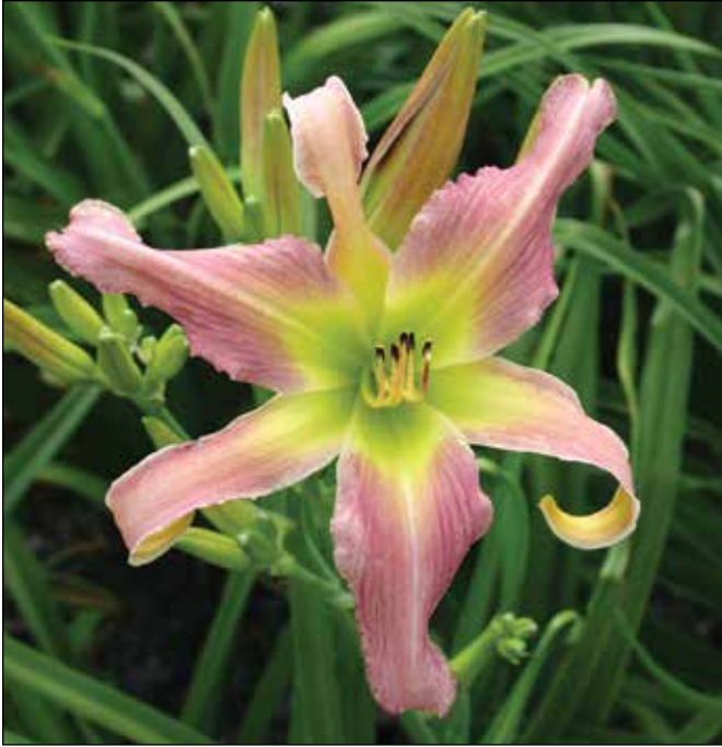
H. 'Exotic Dancer' (Webster 1989)