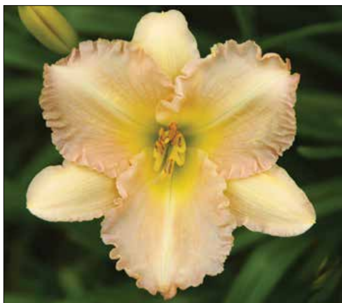
H. 'Iced Champagne' (Steinborn 1986)

6" white tetraploid brushed lavender pink with a light green throat, won an HM in 1991. 'Iced Champagne' (1986), a 28", 5" champagne pink blend diploid with a yellow green throat, won an HM in 1999. She is credited with a total of 39 cultivars.