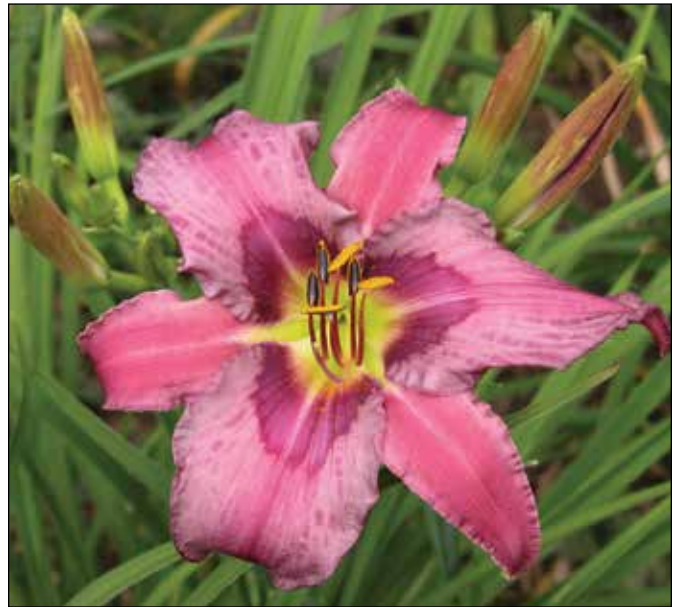
H. 'Blueberry Breakfast' (Rose 1988)