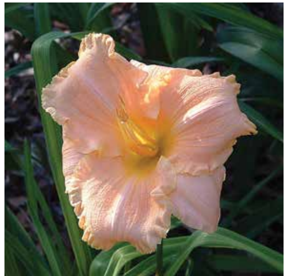
H. 'Tears of Love' (Shooter) Dip: 28", 5.5"; HM 2006