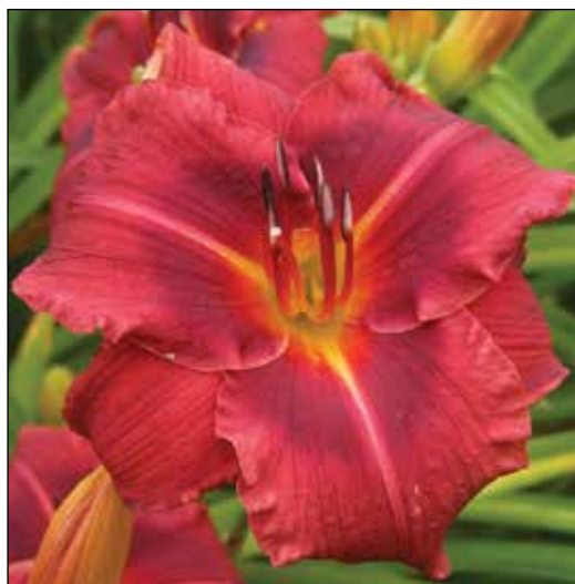
H. 'Little Red Warbler' (Crochet 1985)