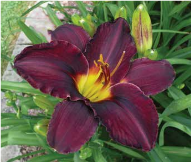
H. 'Derrick Cane' (B. Brooks) Tet: 34", 5"; HM 1995