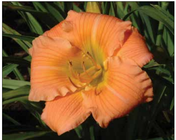
H. 'Kiowa Sunset' (Guidry 1990)