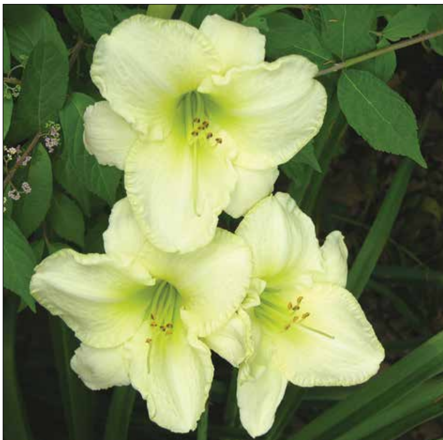
H. 'Lime Frost' (Stamile 1990)