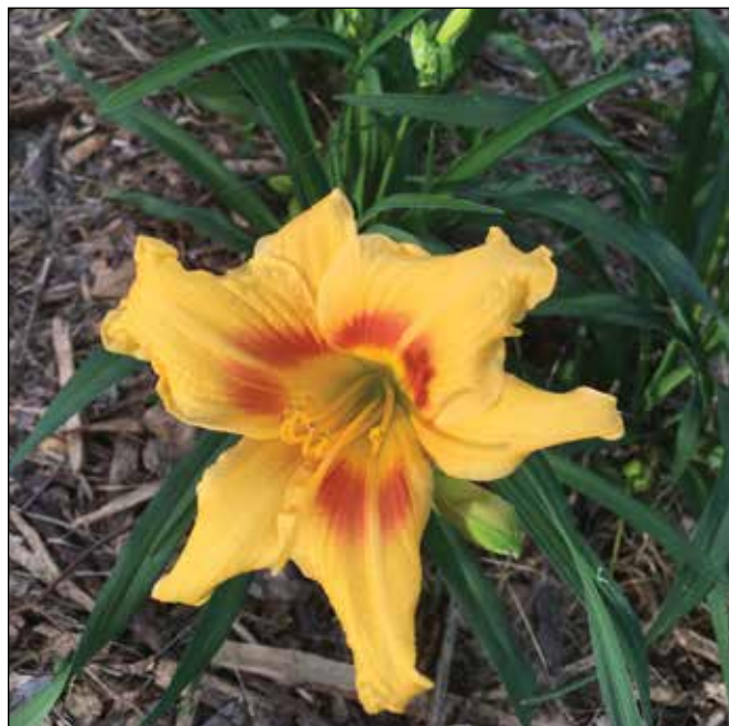
H. 'Black Eyed Stella' (Roberson 1989)