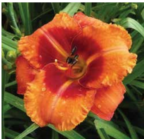
H. 'Tiger Kitten' ( G. Stamile ) Tet: 22", 3.25"; HM 1995