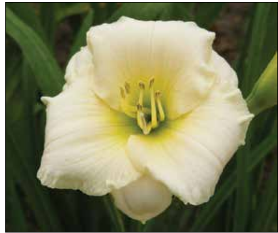
H. 'Iditarod' (Weston 1989)