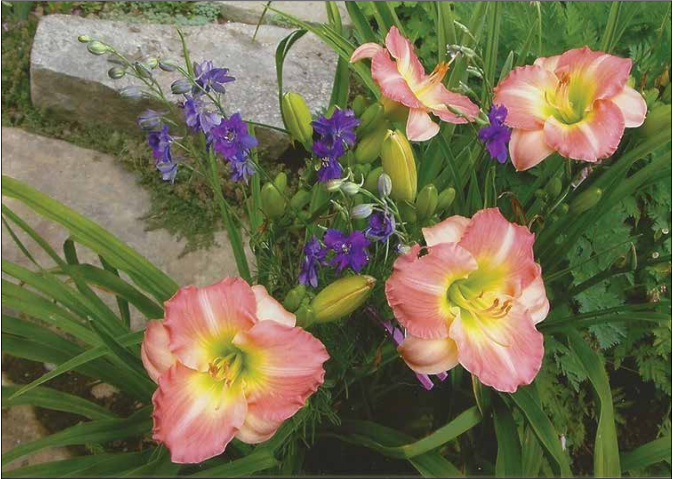
H. 'Pink Power' (Jablonski-Sharp 1989)