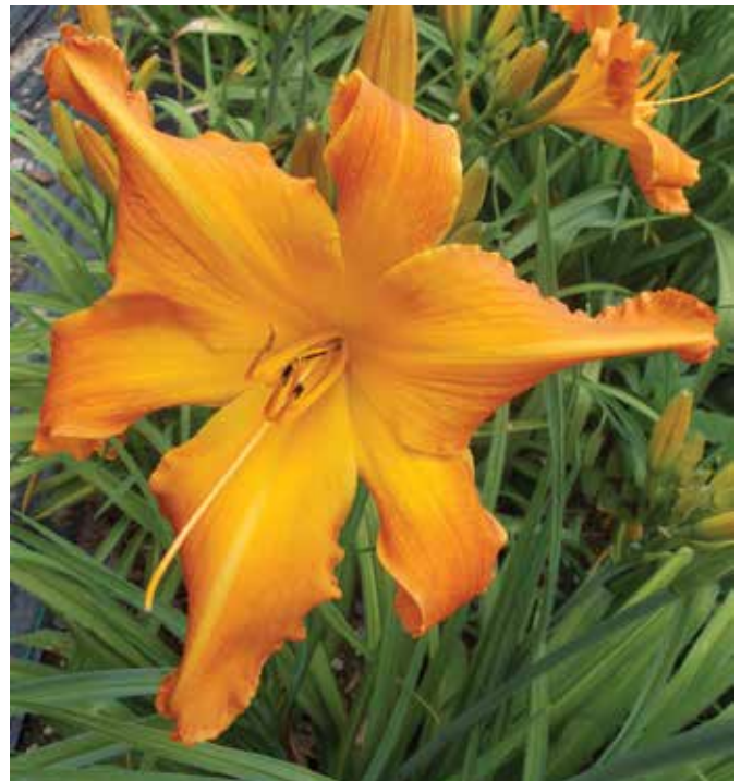
H. 'Highland Pinched Fingers' (Toll) Tet: 30", 7.5"; HM 2007