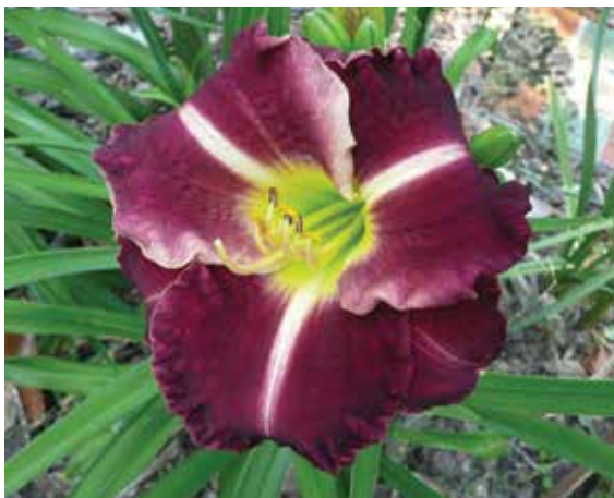
H. 'Purple Sand Dollar' (E.C. Brown) Dip: 19", 4.75"; HM 2003