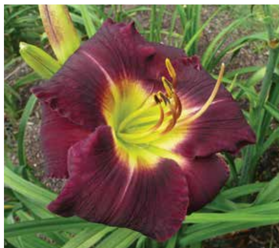
H. 'Killer' (Stamile) Tet: 28", 6"; HM 1997