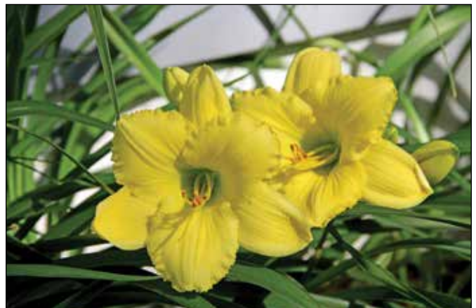
H. 'Atlanta Full House' (Petree 1984)