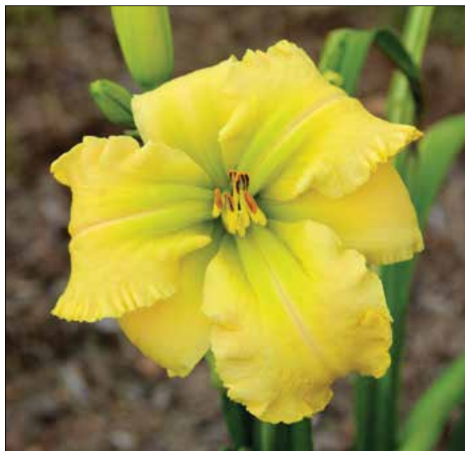
H. 'Anastasia' (Salter 1985)

throat, won an HM in 1993, as did 'Well of Souls' (1988), a 26", 6" peach pink and lavender blend with a black purple eyezone above a green throat. 'Light of Heaven' (1988), a 24", 6" pale cream self with a green throat, won an AM in 1995. 'My Darling Clementine' (1988), a 21", 4.5" yellow self with a green throat, won an HM in 1994 and an AM in 1997. 'Kathleen Salter' (1989), a 28", 6" yellow self with a green throat, won an HM in 1993. 'Walking on Sunshine' (1989), a 22", 5" yellow self with a green throat, also won an HM in 1993. 'Chestnut Mountain' (1989), a 24", 5.5" chestnut copper and