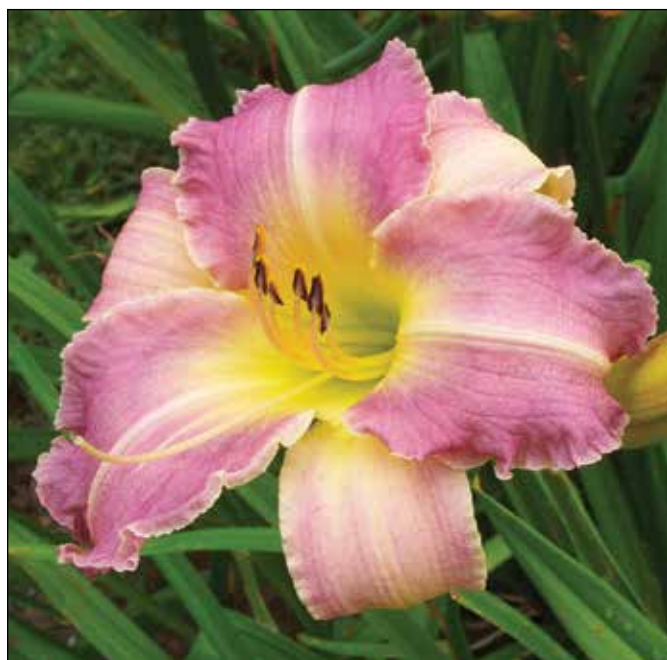
H. 'Lavender Deal' (Kirby-Oakes 1981)