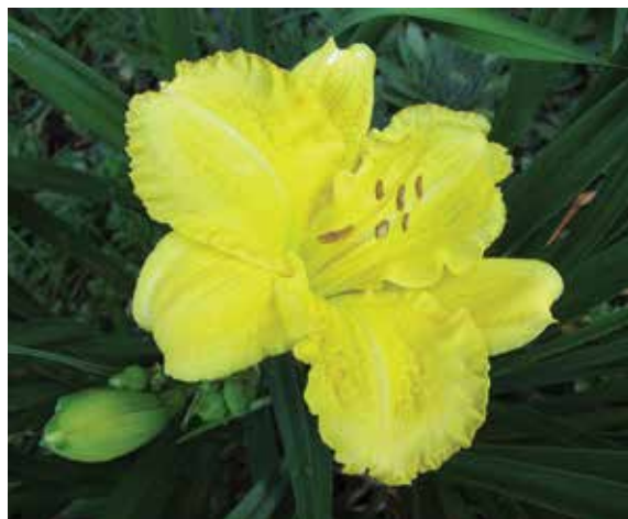
H. 'Yellow Explosion' ( Oakes ) Dip: 27", 5.5"; HM 2011