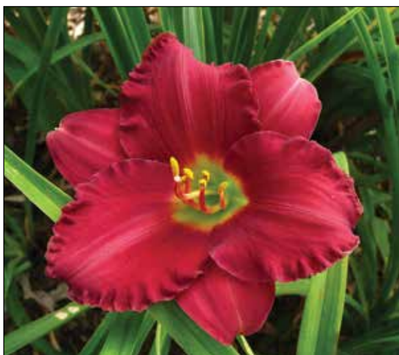
H. 'Woodside Ruby' (Apps 1989)

1992. Several other Apps diploids from the historical period have won HMs. Among these are 'Preppy' (1985), a 24", 4" pink self with a green throat, which won an HM in 1990; 'Little Squiz' (1985), a 26", 2.5" dark red with a dark red eyezone and green throat, which received an HM in 1991; 'Lavender Patina' (1987), a 28", 4.75" lavender with a deeper lavender eyezone and yellow green throat, which won an HM in 1991; 'Bone China' (1987), a 30", 4" near white with a green throat, which won an HM in 1993; 'Queen Anne's Lace' (1989), a 23", 4.5" near white with a green throat, which received an HM in 1997; 'Royal Occasion' (1990), a 26", 4.37" black violet with a black eyezone and a bright green throat, which received an HM in 1994; 'Nouveau Riche' (1990), a 26", 4.37" bright red with a ruby red eyezone and yellow green throat, which won an HM in 1995; and 'Jungle Beauty' (1990), a 30", 5.5" black red with a very faint black eyezone above a yellow green throat, which won an HM in 1996. Three of his diploids using the prefix "Woodside" in honor of his nursery also received HMs: 'Woodside Ruby' (1989), a 34", 4.5" ruby red self