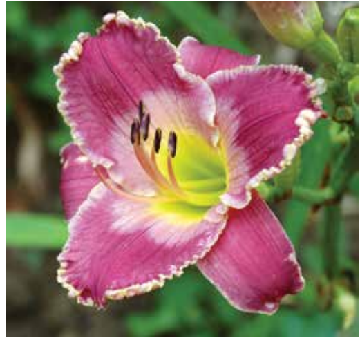
H. 'Arabian Magic' (Salter) Tet: 28", 5"; HM 2006