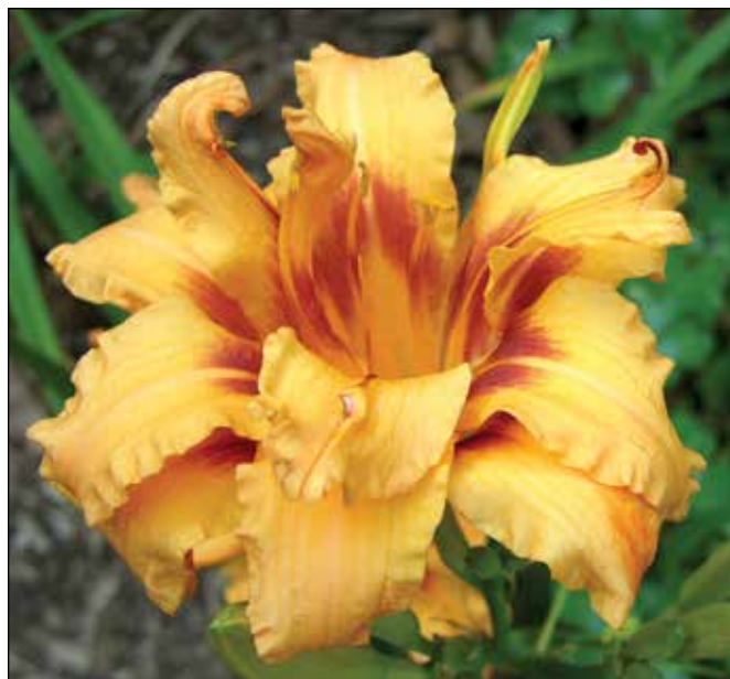
H. 'Carrot Crest' (Kropf 1990)