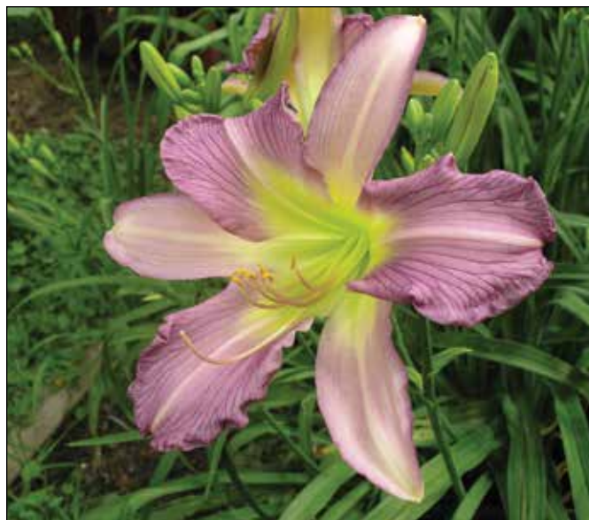
H. 'Moonlight Orchid' (Talbot 1986)