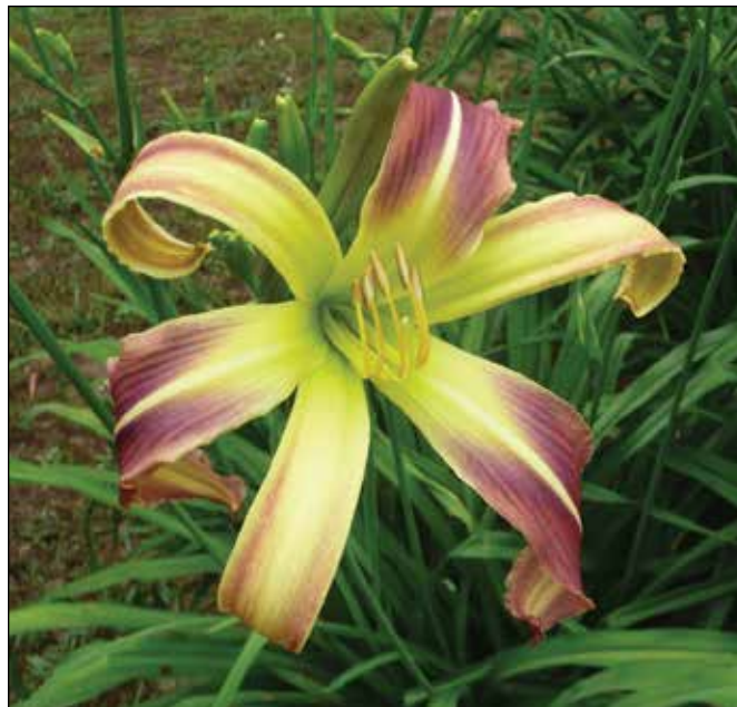
H. 'Lavender Spider' (Harris-Reinke 1990)