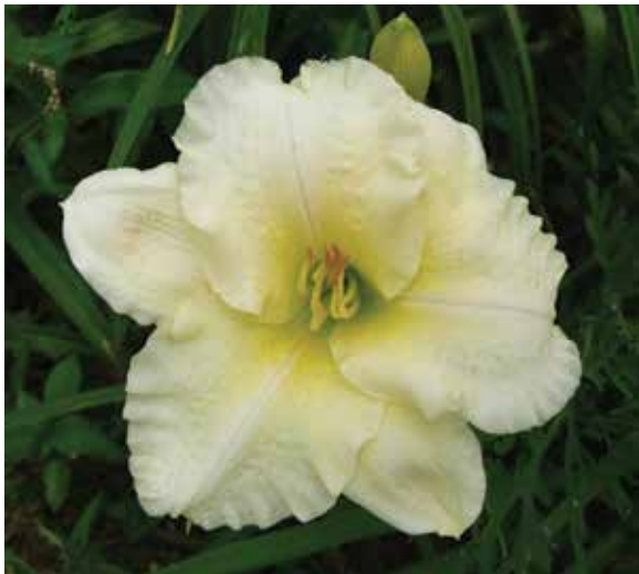
H. 'Full Moon Rising' (L. Ward) Dip: 22", 6"; HM 1995