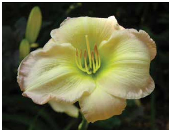
H. Raining Violets (Wild 1983)