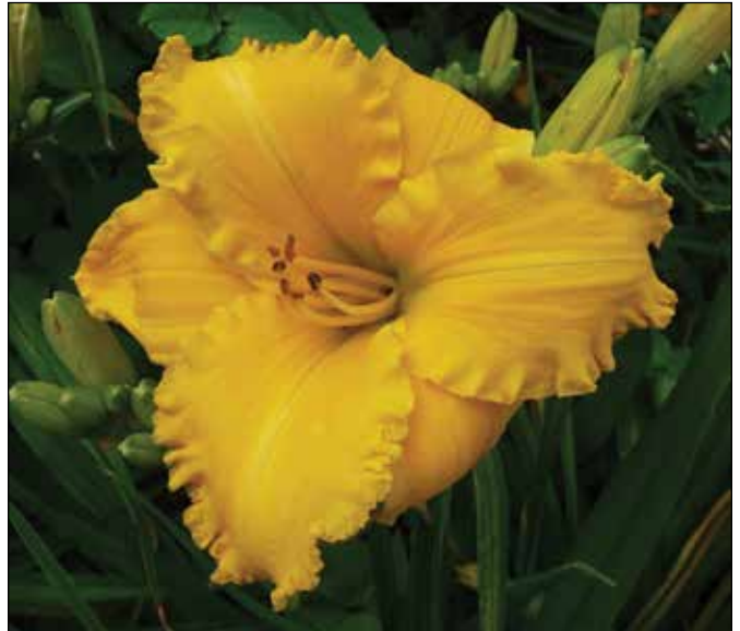
H. 'Olympic Showcase' (Stamile 1990)