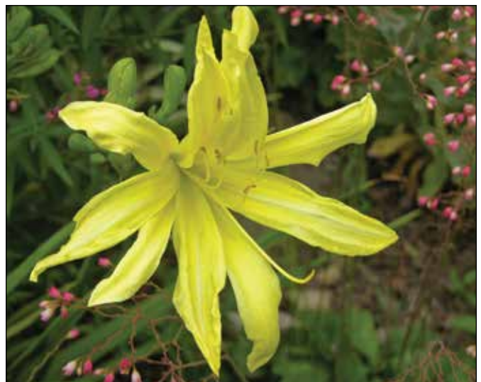
H. 'Four Star' (Kropf-Tankesley-Clarke 1988)