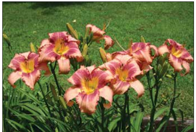
H. 'Designer Jeans' (Sikes 1983)

deep orange red eyezone and a green throat, which received an HM in 1993; 'Restless Heart' (1985), a 27", 6" golden orange blend with a red eyezone and green throat, which won an HM in 1996; 'Heartfelt' (1987), a 26", 6" red orange with a deep orange red halo and a green yellow throat, which won an HM in 1993; 'Designer Rhythm' (1987), a 25", 6" light mauve blend with deep lavender petal edges and a deep lavender eyezone above a green yellow throat, which received an HM in 1994; and 'Royal Dancer' (1988), a 25", 5.5" brick red with a deeper halo and a green yellow throat, which won an HM in 1993. Her 'Designer Image' (1987), a 20" 5.5" lemon beige with a large deep lavender eyezone and petal edges above a green yellow throat, also deserves notice. It won an HM in 1999. Among the most famous of her tetraploids was 'Designer Jeans' (1983), a 34", 6.5" lavender with dark lavender edges and eyezone and a yellow green throat. It won an