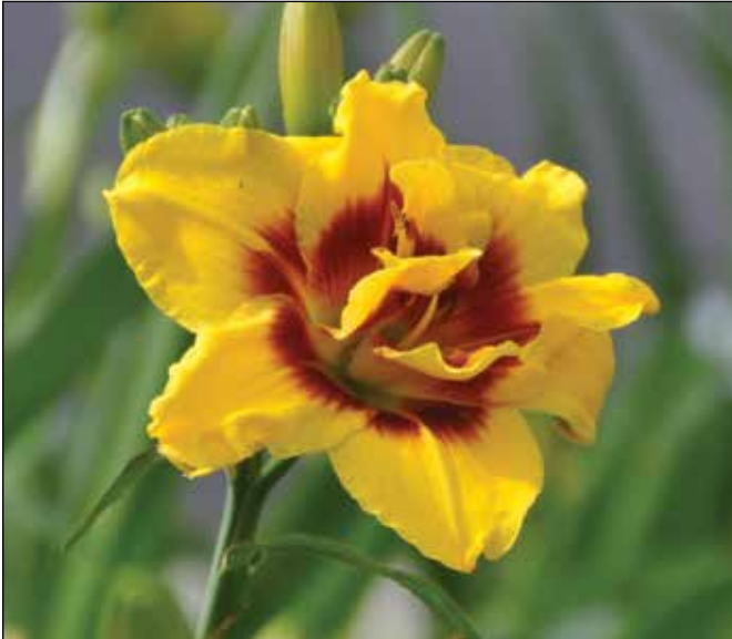
H. 'Mount Helena' (Grooms 1985)