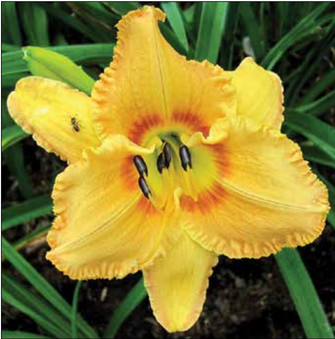
H. 'Bubbling Brown Sugar' (Weston 1987)

administrator for the Detroit Institute of Arts, which housed a fine collection of African artifacts. Her diploid, 'Bologongo' (1986), a 16", 5.5" Chinese red self with a yellow green throat, named for a 15th-century African king, won an HM in 1991. 'Bubbling Brown Sugar' (1987), a 27", 5.5" yellow edged cinnamon tetraploid with a brown eyezone and green yellow throat, won an HM in 1992. 'Cowrie Flower' (1988), a 16",