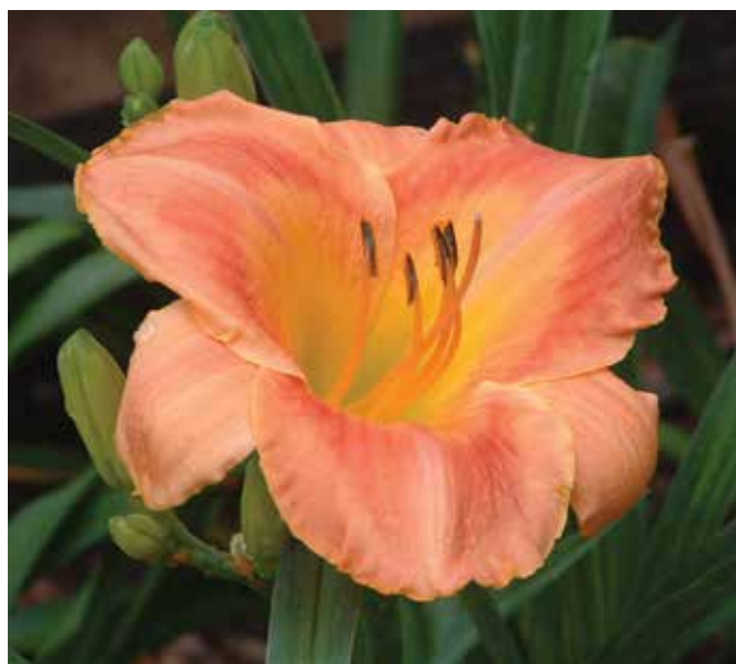
H. 'Mayan Poppy' (R. W. Munson, Jr. 1980)

24", 7" yellow self, won an HM in 1988 and an AM in 1991. 'Bookmark' (1982), a 24", 5" pink beige self with a yellow green throat, won an HM in 1988. 'Royal Saracen' (1982), a 26", 6" light purple self with a cream chartreuse throat, won an HM in 1988. 'China Lake' (1982), a 28", 6" plum rose lilac with a cream throat, won an HM in 1989. 'Merry Witch' (1983), a 30", 6" rose with lighter eyezone and a lemon cream throat, won an HM in 1986. 'Cherry Chapeau' (1983), a 28", 5" rose red and pink bicolor with a lemon cream throat, won an HM in 1987. 'Highland Lord' (1983), a 22", 5" red wine double with a lemon throat, won an HM in 1985. 'Time Lord' (1983), a 30", 6" copper rose red with a lime gold throat, won an HM in 1986. 'Panache' (1983), a 22", 5" peach with plum