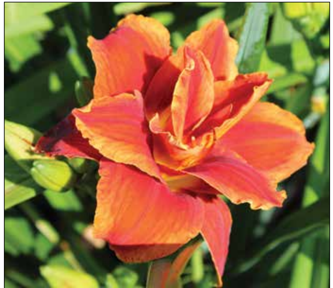
H. 'Fires of Fuji' (Hudson 1990)