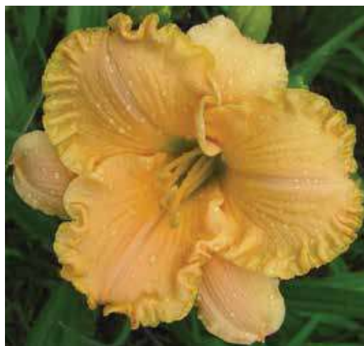
H. 'Lady Arabella' (Salter) Tet: 28", 5"; HM 1999