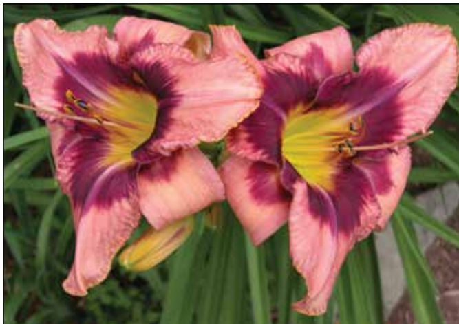
H. 'Emperor's Dragon' (R. W. Munson, Jr. 1988)

a chartreuse yellow throat, won an HM in 1993. 'Lexington Avenue' (1990), a 24", 6" wine with whitish wine eyezone and a greenish yellow throat, won an HM in 1995. These represent but a fraction of his award winners. Notable among his many cultivars which have not been recognized for awards are 'Nairobi Night' (1983), a 30", 6" purple with a large cream lavender eye above a yellow green throat; 'Nile Plum' (1984), a 20", 5" silvery mauve plum with plum claret eyezone and a yellow green throat; and 'Grand Palais' (1987), a 24", 6" silvery lilac lavender self with a lemon cream throat.