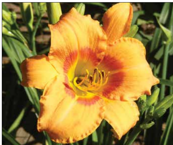
H. 'Caprician Fiesta' (Rogers 1984)