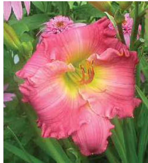
H. 'Hush Little Baby' (Sikes) Dip: 22", 5"; HM 1997