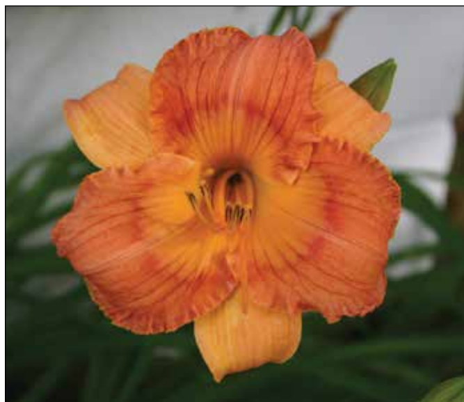
H. 'Brand New Lover' (Brooks 1987)

HM in 1994. Still another diploid, 'Mae West' (1990), a 20", 7.25" shrimp rose with a green throat, won an HM in 1995. 'Jump Start' (1990), a 19", 5.5" red tetraploid edged white with a yellow green throat, won an HM in 1996.