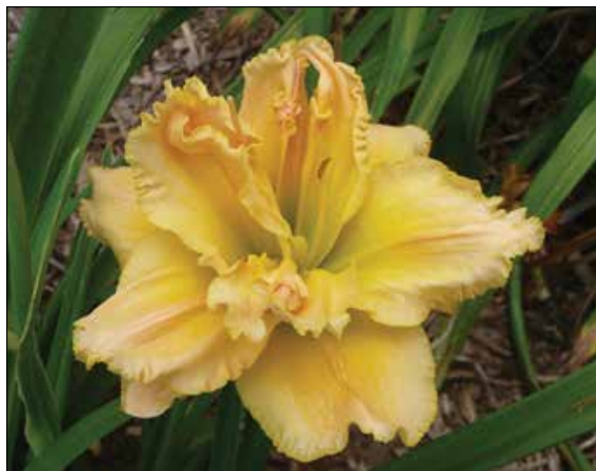
H. 'Fanciful Finery' (Kirchhoff-D. 1984)