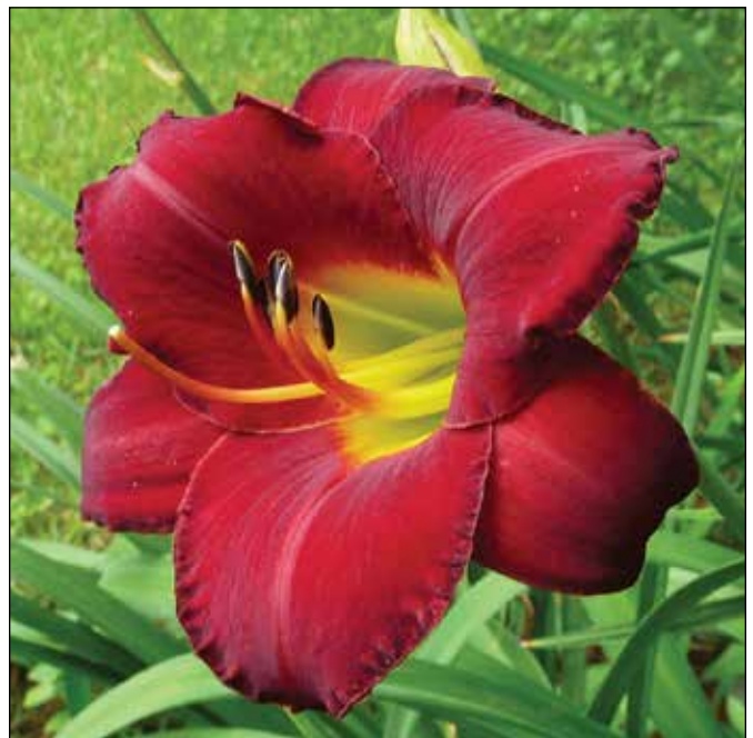
H. 'Study in Scarlet' (Kirchhoff-D. 1985)

and the Eugene S. Foster Award in 1995. 'Ming Porcelain' (1981), a 28", 5.25" pastel ivory pink touched peach and edged in gold with a wide yellow halo and a lime green throat, won an HM in 1985, an AM in 1989, and the Lenington All-American Award in 2001. Still another tetraploid, 'Bittersweet Holiday' (1981), a 23", 5.5" red, copper and burnt orange blend with a wide yellow halo and green throat, won an HM in 1986. 'Amadeus' (1981), a 26", 5.5" scarlet tetraploid with a yellow green throat, the result of David's treatment of the Wiese diploid, also won an HM in 1986. 'Study in Scarlet' (1985), a 28", 5" blood red self with a green throat, won an HM in 1990. 'Vintage Bordeaux' (1986), a 27", 5.75" black cherry