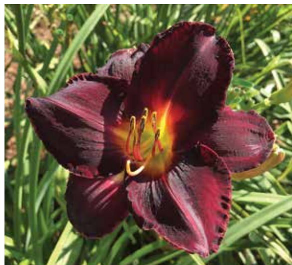
H. 'Tuscawilla Blackout' ( Hansen ) Tet: 32", 5"; HM 1999