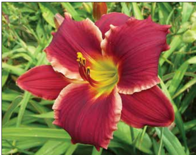
H. 'Pocket Change' (Crochet 1985)