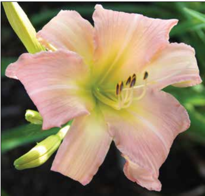
H. 'Mimosa Umbrella' (Hendricks 1984)

W. B. Hendricks of Woodland, Georgia, is credited with 43 registrations. H. 'Dream Blue' (1982), a 26", 5.5" grape purple with a slightly darker eyezone and a green throat, won an HM in 1992. 'Mimosa Umbrella' (1984), a 28",