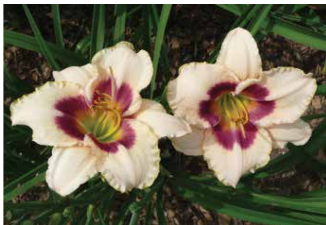
H. 'Dewberry Candy' (Stamile) Tet: 22", 3.75"; HM 1995