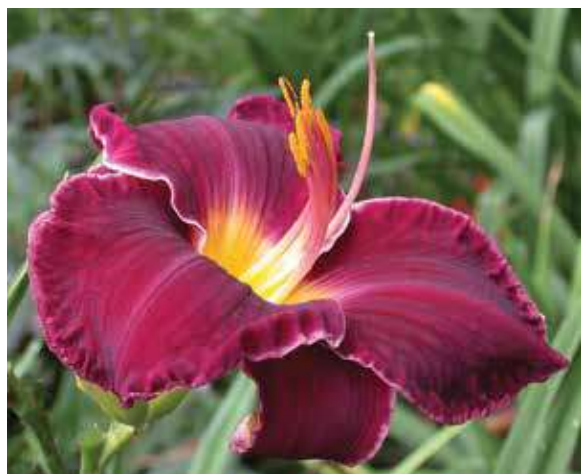
H. 'Noble Lord' (Moldovan) Tet: 30", 6"; HM 2002