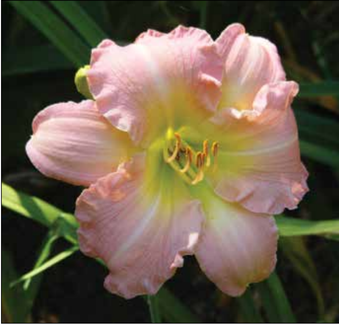
H. 'Vi Simmons' (Talbot 1987)