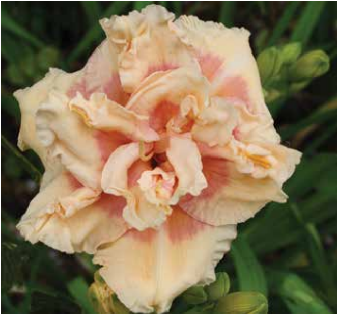
H. 'Big Kiss' (Joiner) Dip: 28", 5.5" double; HM 2002, AM 2005