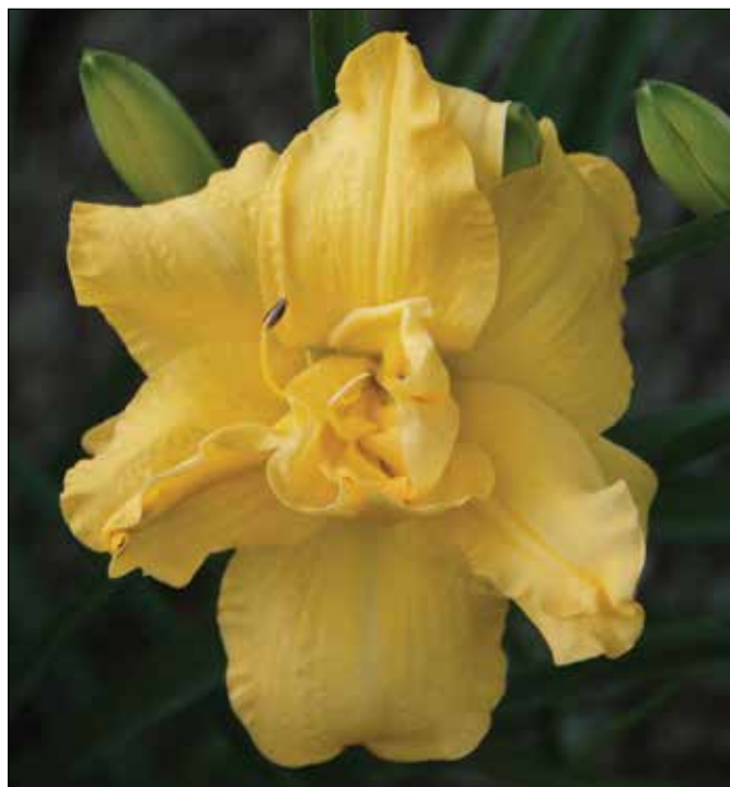
H. 'Rachael My Love' (Talbot 1983)

1987. 'Rachael My Love' (1983) an 18", 5" golden yellow double, won an HM in 1988 and an AM in 1991, having won the Ida Munson Award for doubles in 1989. 'Hamlet' (1984), an 18", 4" purple with a deep purple eyezone and a green throat, won an HM in 1987 and the JEM in 1988. 'Femme Fatale' (1985), a 21", 5" creamy tangerine with a purple eyezone and green throat, won an HM in 1985. 'Ra Hansen' (1986), a 28", 4.75" dark orchid lavender with variegated blue powder shading and a green throat, won an HM in 1990. 'Moonlight Orchid' (1986), a 28", 6.5" blue lavender with a light blue eyezone and green throat, won an HM in 2001. 'Vi Simmons'