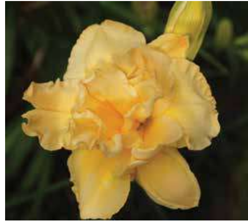
H. 'Heather Herrington' (Joiner) Dip: 30", 6" double; HM 1994