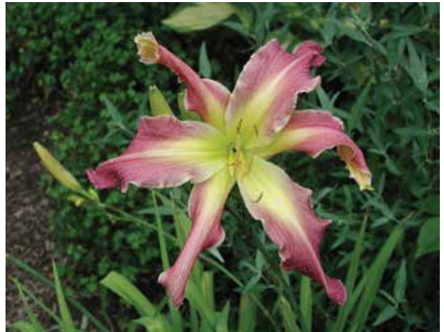
H. 'Chin Whiskers' (McRae) Dip: 20", 5", unusual form crispate; No Awards