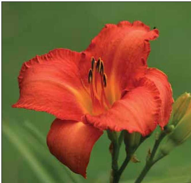
H. 'Hot Ember' ( Stamile 1986)