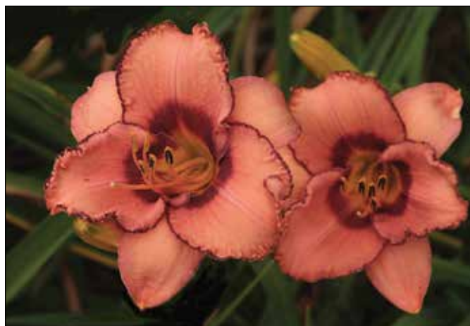
H. 'Lady Dancer' (Rasmussen 1989)

(1987), a 24", 4.5" golden yellow with a red eyezone and gold throat, won an HM in 1997. 'Raging Tiger' (1987), a 25", 6" burnt orange and yellow blend with a wine red eyezone and an orange yellow throat, won an HM in 1990. 'Lady Dancer' (1989), a 28", 5.5" rose pink blend edged plum with a green gold throat, won an HM in 2000. Several of his tetraploids from the historical period, however, have been overlooked for awards, among them: 'Island Blackout' (1981), a 34", 6.5" black red blend with a gold throat; 'Moonless Night' (1985), a 30", 6" black red self with a yellow green throat; and 'Modern Design' (1989), a 24", 4" beige pink with a dark plum eyezone and green throat. In all, he is credited with 65 registrations.