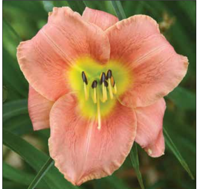
H. 'Adjure' (Whatley 1990)

throat, won an HM in 1994. Other tetraploids included 'Sligo' (1988), a 26", 5.5" dark red self with a green throat, which won an HM in 1993; 'Khorassan' (1988), a 30", 6" pink and yellow blend with a yellow throat, which won an HM in 1994; 'Kuan Yin' (1988), a 24", 6" bright red self with a green throat, which also won an HM in 1990; and 'Adjure' (1990), a 25", 6" rose pink self with a very green throat, which won an HM in 2001. These are just some of the 37 cultivars registered during this period. Oscie Whatley was awarded the Bertrand Farr Silver Medal in 1984.