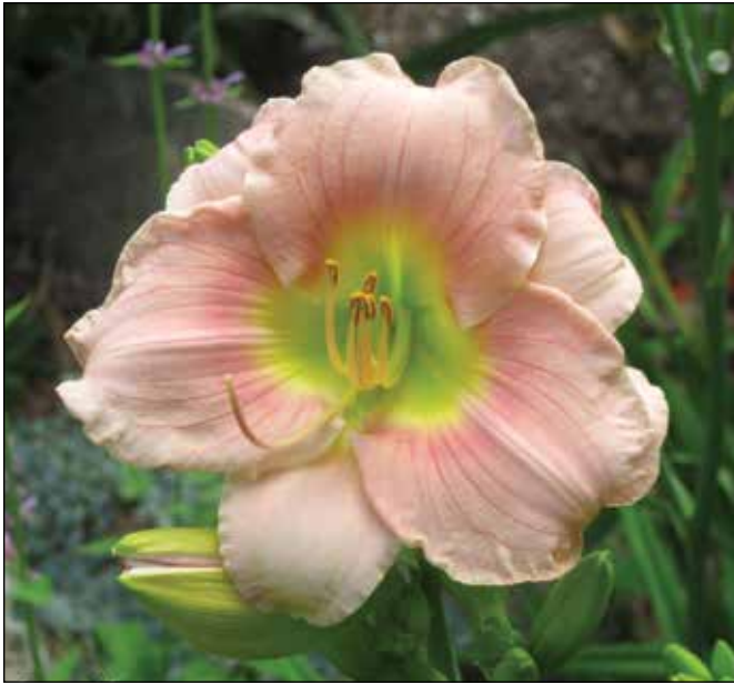
H. 'Ah Youth' (Simpson 1987)

1992. 'Aquarelle' (1987), a 24", 5.5" peach pink polychrome with lavender midribs and a lemon green halo above a green throat, won an HM in 1994. 'Speak of Angels' (1987), a 26", 6" flesh pink with a soft pink lavender halo and a very large chartreuse green throat, won an HM in 1994.