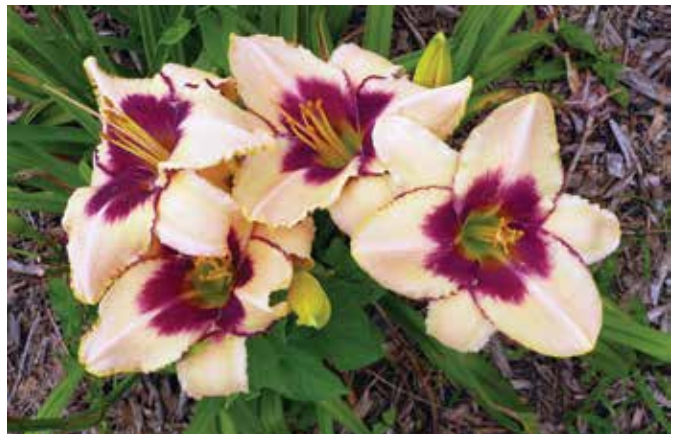
H. 'Lin Wright' (Morss) Tet: 24", 6"; HM 2004