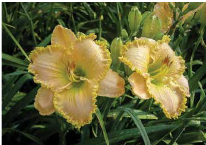
H. 'Something Wonderful' ( Salter ) Tet: 28", 5"; HM 1997, AM 2002