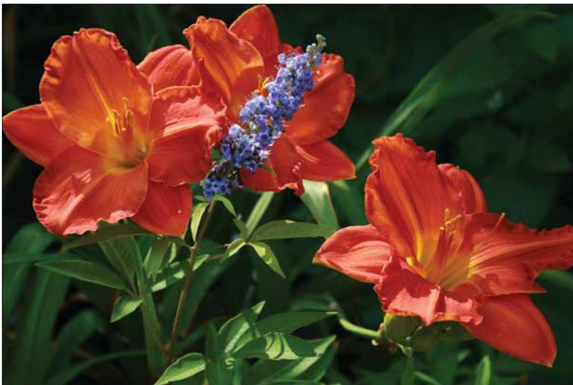
H. 'House of Orange' (Weston 1990)