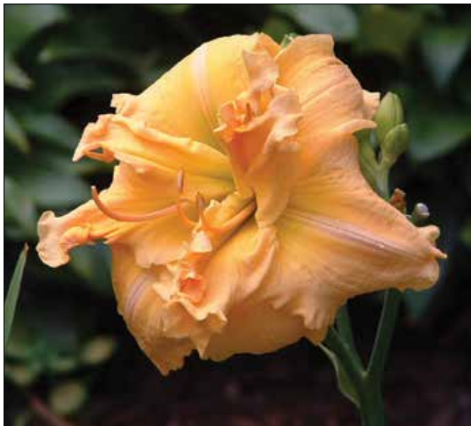
H. 'Double Conch Shell' (Stamile 1987)