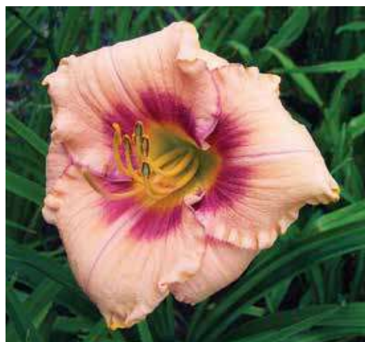
H. 'Peach Candy' (Stamile) Tet: 25", 4.75"; HM 1997