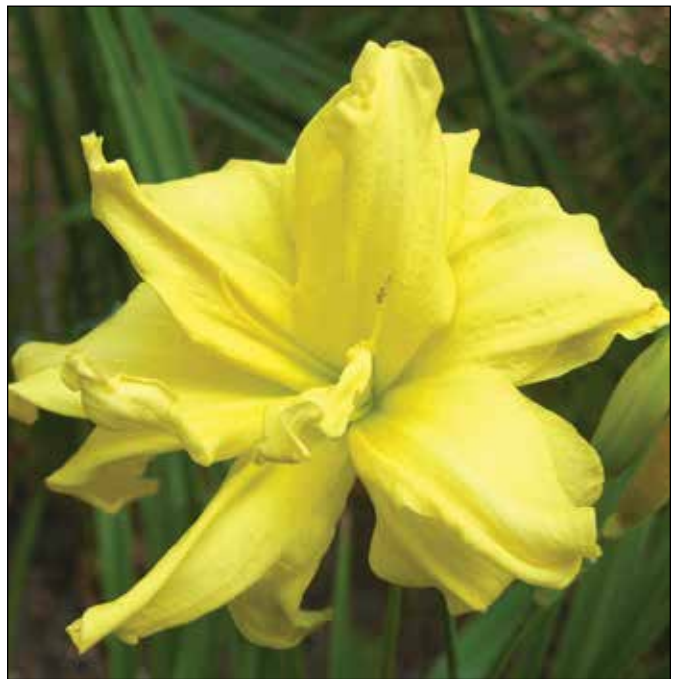
H. 'Double River Wye' (Kropf 1982)