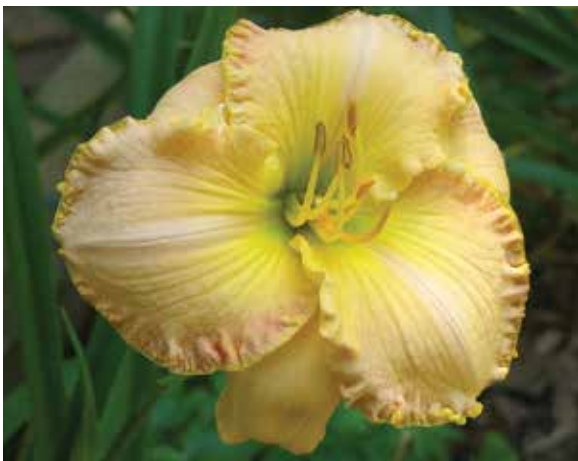
H. 'Untamed Glory' (Salter) Tet: 26", 5.5"; HM 1997