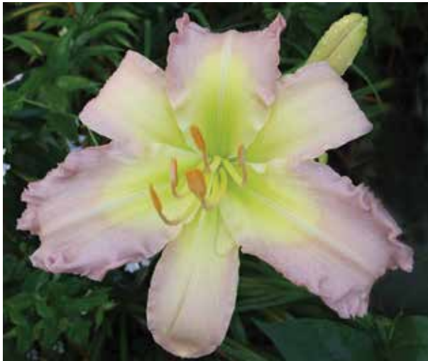
H. 'Regency Heights' (H. Dougherty) Dip: 34", 6"; HM 2013