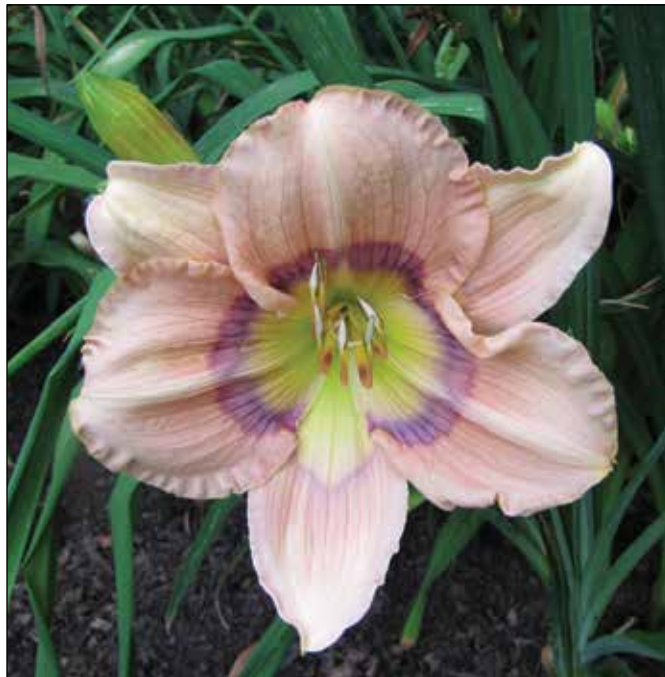
H. 'Priscilla's Rainbow' (Spalding-Guillory 1985)

1984), a 14", 6" rose blend with a green throat, won an HM in 1990 and an AM in 1993. 'Edith Vaughan' (1985), a 22", 5.5" mauve with a deeper eyezone and a green throat, won an HM in 1989. 'Elsie Spalding' (1985), a 14", 6" ivory blushed pink with a light pink halo and a green throat, won an HM in 1987 and an AM in 1990. Also co-registered with her daughter-in-law, 'Priscilla's Rainbow' (Spalding-Guillory 1985), a 22", 6.25" pink lavender with a rainbow halo and green throat,