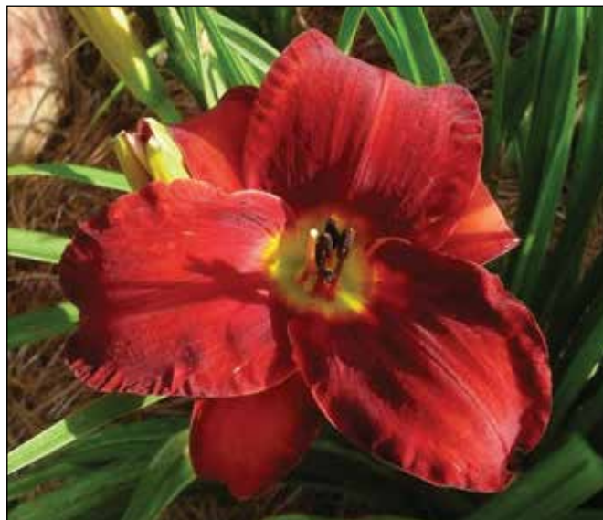
H. 'Roll Tide' (Webster 1987)

large green throat, won an HM in 1995. 'Purple Arachne' (1982), a 22", 7" purple spider with a spider ratio of 4.70:1 and a green throat, however, was overlooked for an award, as were 'Fire Arrow' (1985), a 24", 8.5" bright red unusual form crispate with a chartreuse green throat, and 'Galaxy Rose' (1986), a 32", 9.5" deep rose unusual form crispate with a chartreuse green throat. (Perhaps these daylilies were registered prior to a time when these forms became fully appreciated.) 'Purple Storm' (1985), a 26", 5" pinkish lavender with a deep purple eyezone and a green throat, won an HM in 1992. 'Ivory Gown' (1985), a 26", 6" ivory cream with a pinkish cast and green throat, won an HM in 1991. 'Bama Bound' (1986), a