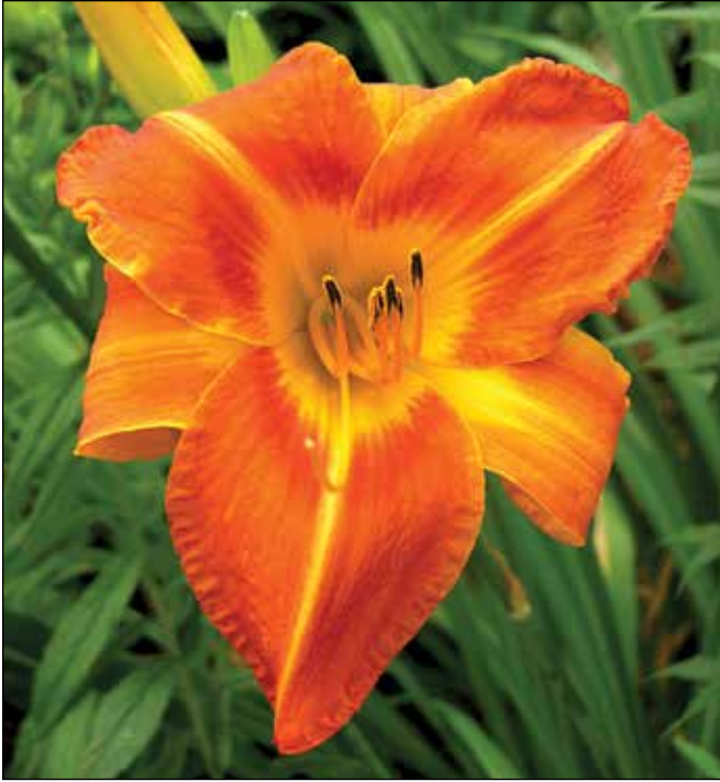
H. 'Tusawilla Tigress' (Hansen 1988)

gene S. Foster Award for late booming cultivars in 1994. 'Tusawilla Tigress' (1988), a 25", 7.25" bright orange tetraploid with a dark orange eyezone and a chartreuse throat, won an HM in 1992 and an AM in 1996. 'Tusawilla Tranquility' (1988), a 21", 5.5" near white diploid with a lemon lime throat, won an HM in 1992. 'Night Beacon' (1988), a 27", 4" black purple diploid with a large chartreuse center and a green throat, won an HM in 1998. 'Palo Duro Canyon' (1989) a 26", 6" rust brown diploid with a darker center edged gold with an ol-