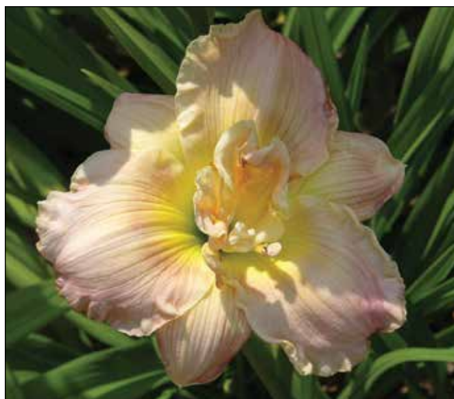
H. 'Almond Puff' (Stamile 1990)