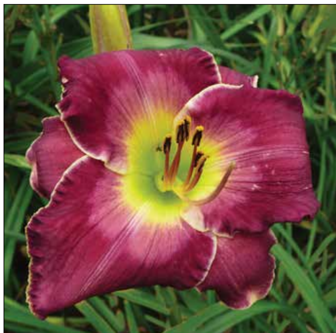
H. 'Violet Shadows' (Lachman 1988)