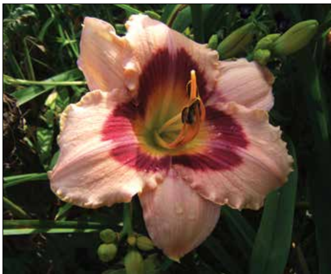
H. 'Wineberry Candy' (Stamile 1990)