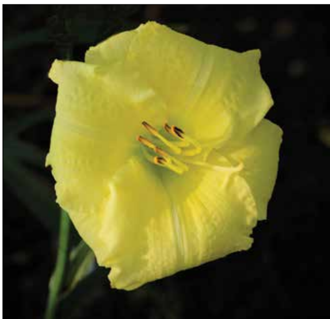
H. 'Marble Faun' (Millikan 1983)

green throat, won an HM in 1990. Another tetraploid, 'Old Tangiers' (1985), a 28", 5" tangerine with red eyezone and chartreuse throat, won an HM in 1993. Among other diploids, 'Snowed In' (1985), a 25", 5.5" white with light green overlay and a green throat, won an HM in 1991; 'Green Eyed Lady' (1985), a 24", 4.5" yellow green self with a green throat, won an HM in 1991; 'Video' (1985), a 20", 5" lemon yellow self with a green throat, won an HM in 1992; 'Carlotta' (1986), a 25", 4.5" blend of red and cherry pink with cream midribs and a green throat, won an HM in 1993; 'Chantelle' (1988), a 24", 4.5" bright pink with lighter midribs and green throat, won an HM in 1993; and 'Camay' (1989), a 20", 4.5" rich medium pink self with a very green throat, won an HM in 1995. Millikan registered several daylilies in conjunction with