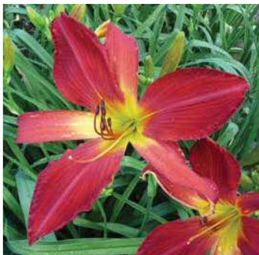
H. 'Christmas Ribbon' (Stamile) Tet: 34", 8.5" unusual form spatulate; HM 2004