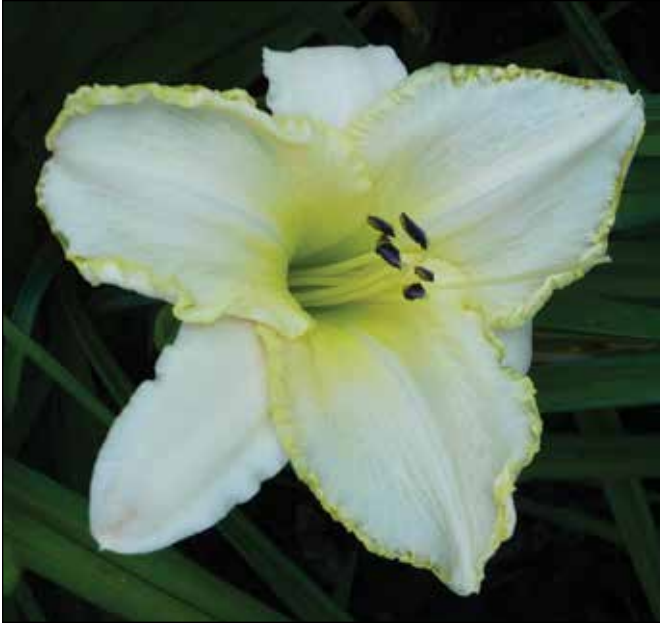
H. 'Admiral's Braid' (Stamile 1990)