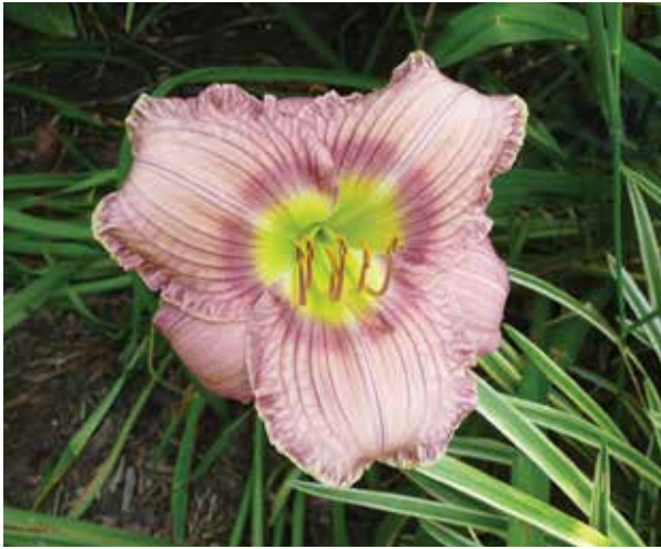
H. 'Fan Club' (Shooter) Dip: 27", 4"; HM 2005