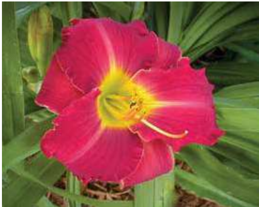
H. 'Obsession in Red' ( D. Kirchhoff ) Tet: 28", 4.5"; HM 1994