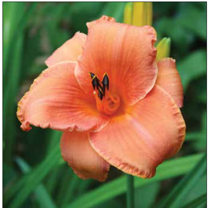
H. 'Hawaiian Party Dress' (Soules 1982)