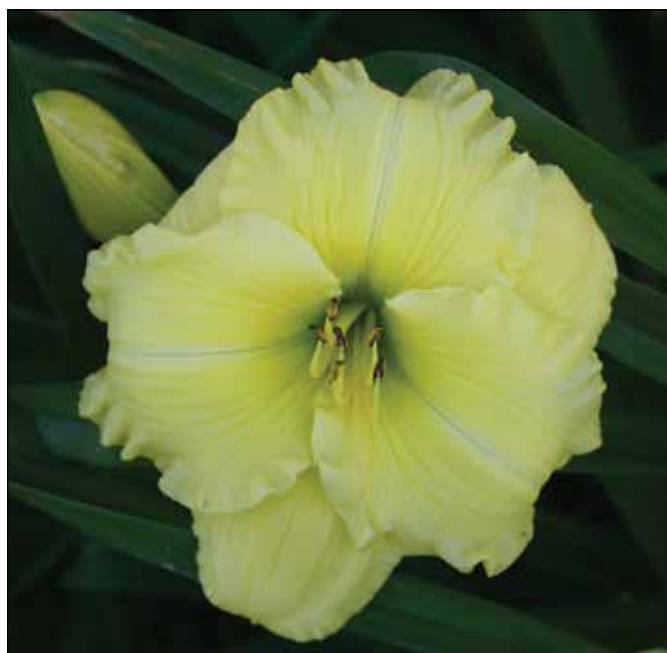
H. 'Judith Weston' (Gates-L. 1989)