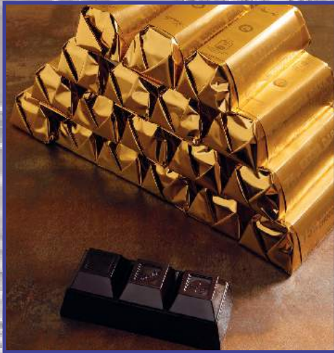
ITEM 116155 75% CUOR DI CACAO BLOCK GOLD EDITION 18/185GR