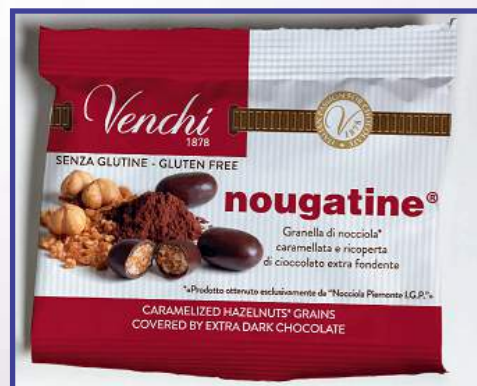
ITEM 180068 SNACK NOUGATINE (BAG) 21/40GR CANDIED HAZELNUTS COVERED IN DARK CHOCOLATE