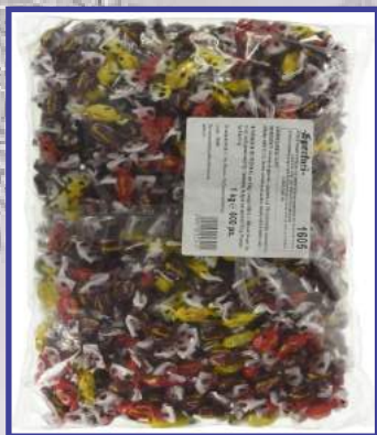
ITEM 605 CAMELLINE CAFFE COFFEE FLAVORED 6/1KG