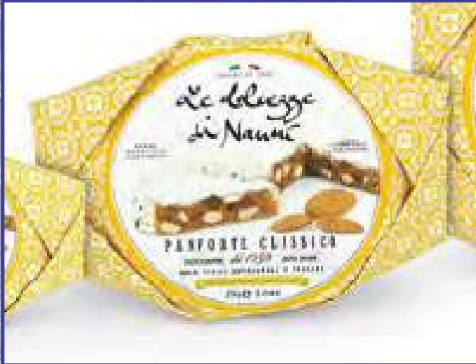
ITEM 91 PANFORTE CLASSICO 16/250GR

TRADITIONAL TUSCAN PANFORTE MADE WITH CANDIED FRUIT AND NUTS