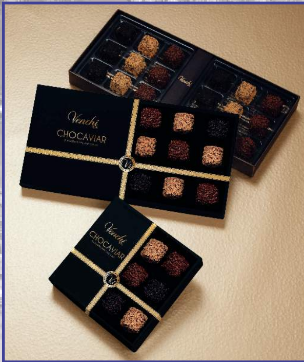
ITEM 124137 CHOCAVIAR MINI PRALINES GIFT BOX 8/260GR