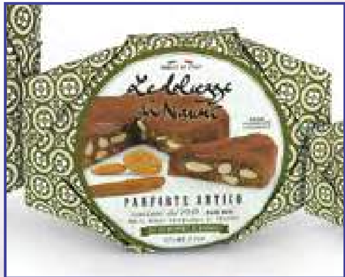
ITEM 821D PANFORTE FLORIANA 16/250GR

TRADITIONAL TUSCAN PANFORTE MADE WITH CANDIED FRUIT AND NUTS COVERED IN CHOCOLATE