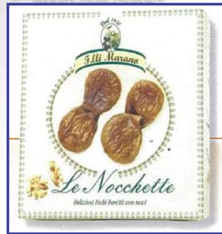
ITEM 005 LE NOCCHETTE 14/250GR FIGS STUFFED WITH WALNUTS