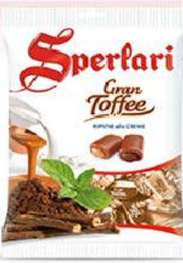
ITEM 1345 GRAN TOFFEE CREAM 24/175GR