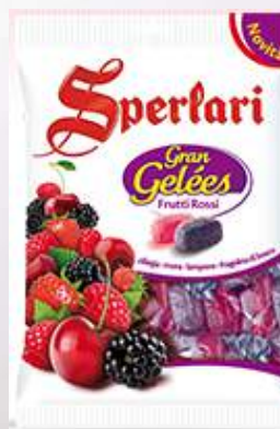
ITEM 4605 GRAN GELEES RED FRUITS 18/175GR