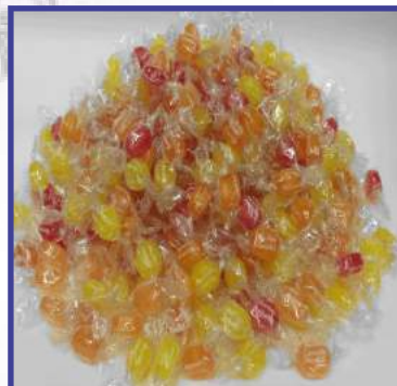
ITEM 619 CAMELLINE FRUTTA FRUIT FLAVORED HARD CANDY