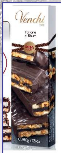
ITEM 128208 CHOCOLATE COVERED NOUGAT BAR WITH RHUM 12/250GR