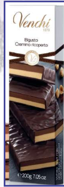
ITEM 126287 BIGUSTO CREMINO RICOPERTO BAR 12/200GR CREMINO BAR WITH WHITE & MILK GIANDUJA COVERED IN CHOCOLATE