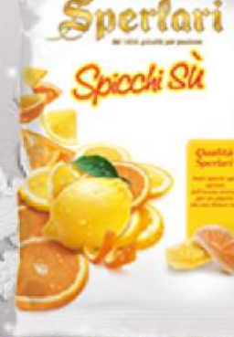
ITEM1549 SPICCHI SU CITRUS FRUIT 20/500GR