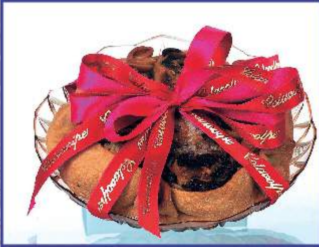
ITEM 0716 PITTA'MPIGLIATA 6/500GR

COLAVOLPE OFFERS ONE OF THE MOST POPULAR SWEETS OF THE CALABRIAN TRADITION