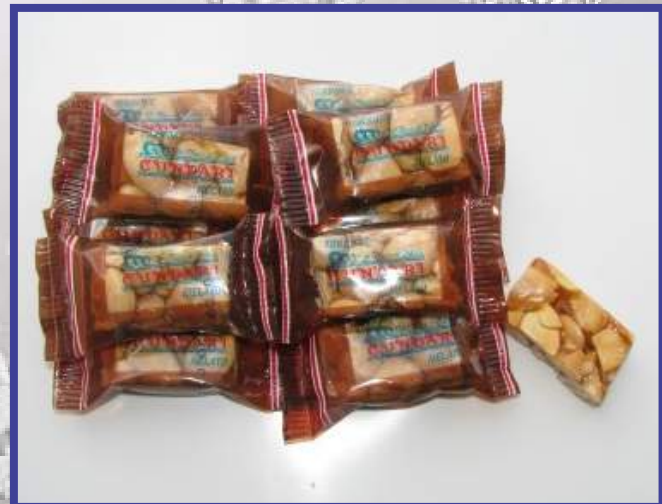
ITEM CUNMEL TORRONE MELATO 18/250GR ALMOND BRITTLE

ALL CUNDARI PRODUCTS PACKAGED IN A WHITE GIFT BOX