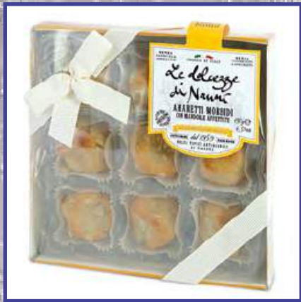
ITEM 4802 AMARETTI MORBIDI 8/130GR