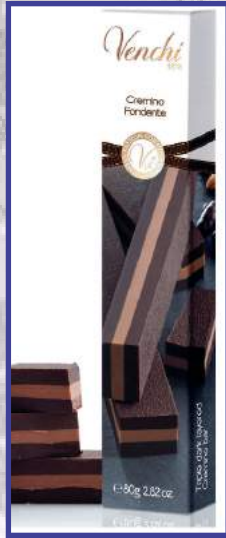
ITEM 126282 CREMINO EXTRA DARK SOFT BAR 12/80GR DARK CHOCOLATE AND ALMOND PASTE BETWEEN GIANDUJA