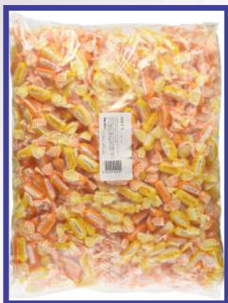
ITEM 611 MISTO SPICCHI SU CITRUS FRUIT SLICES 2/3KG