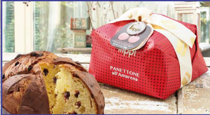
ITEM SPE1205 PANETTONE all'AMARENA 6/1000GR

PANETTONE MADE WITH CANDIED SOUR CHERRIES