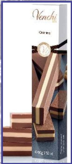
ITEM 126281 CREMINO SOFT BAR 12/80GR WHITE CHOCOLATE W/ALMOND PASTE BETWEEN GIANDUJA