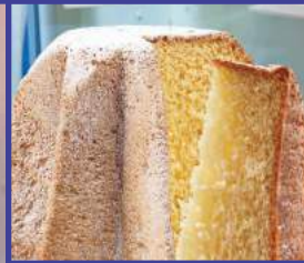
ITEM AVO0105P PANDORO CLASSICO 6/1000GR

SOFT CAKE MADE WITH THE RICHNESS OF FRESH BUTTER AND NATURALLY FLAVORED WITH VANILLA