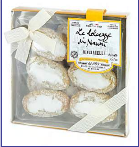
ITEM 301D RICCIARELLI 8/240GR

SOFT ALMOND COOKIES WITH FIGS AND WALNUTS