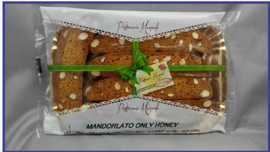
ITEM 15a SUGAR-FREE ALMOND BISCUITS 16/250GR