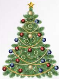
ITEM 128301 NOUGAT TORRONCINI BULK 4/1KG