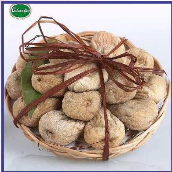
ITEM 0495 MOSCIONI FIGS 12/250GR MOSCIONI FIGS IN ROUND BASKET