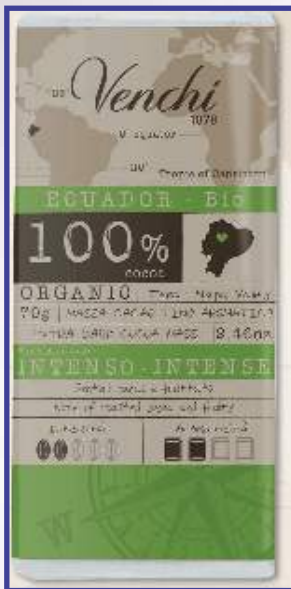
ITEM 117503 ECUADOR ORGANIC DARK CHOCOLATE BAR 18/70GR 100% PREMIUM COCOA