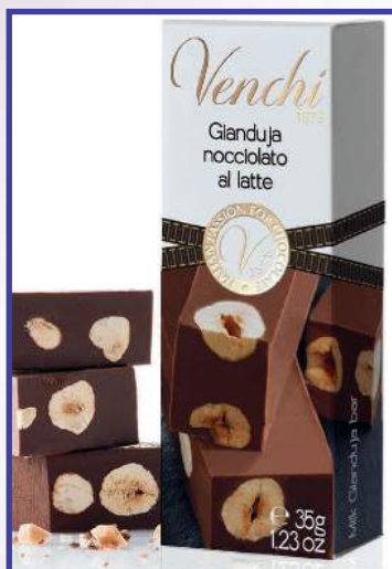
ITEM 126284 SOFT MINI GIANDUJA BAR W/HAZELNUTS 24/35GR