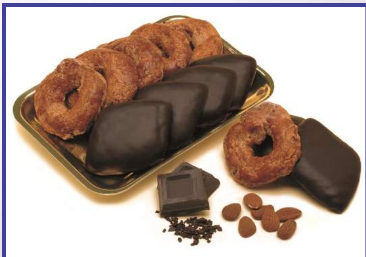
ITEM# ROCCMOST MOSTACCIOLI/ ROCOCCO 10/500GR