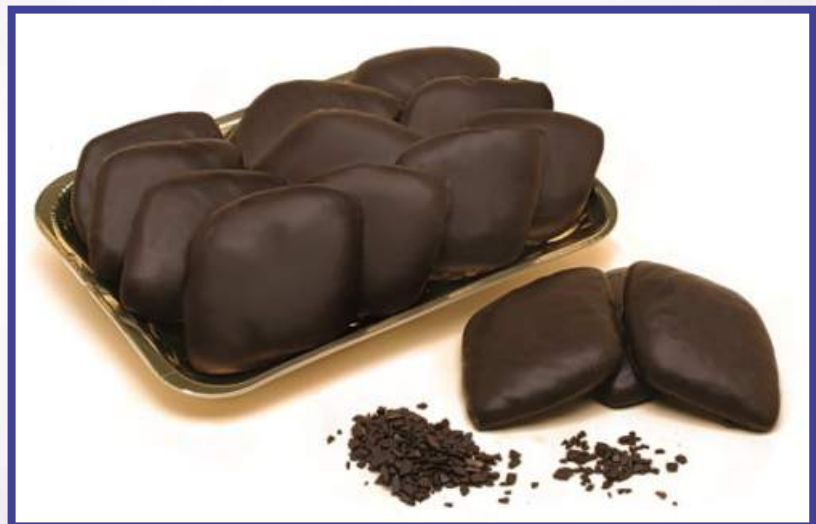
ITEM# 500MOSTA MOSTACCIOLI 10/500GR