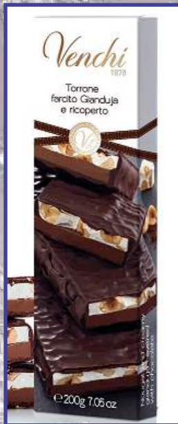
ITEM 128207 NOUGAT GIANDUJA BAR 12/200GR