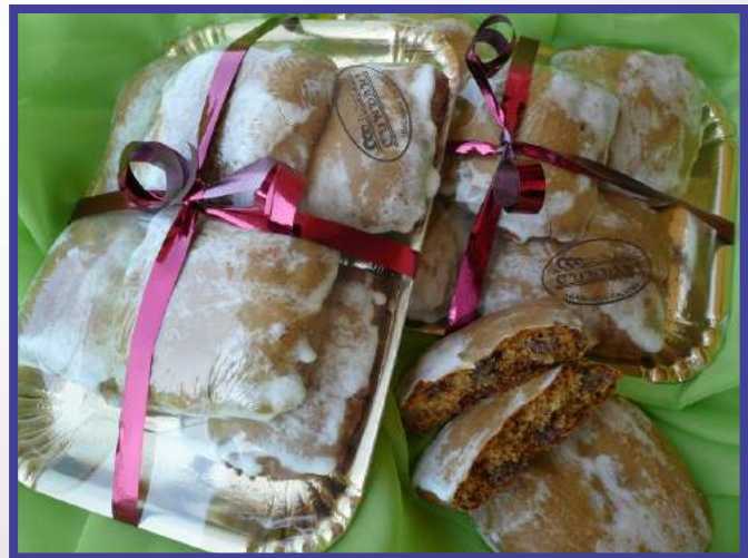
ITEM CUNPIZZE PIZZE SAN MARTINO 16/250GR

ALL CUNDARI PRODUCTS PACKAGED IN A WHITE GIFT BOX