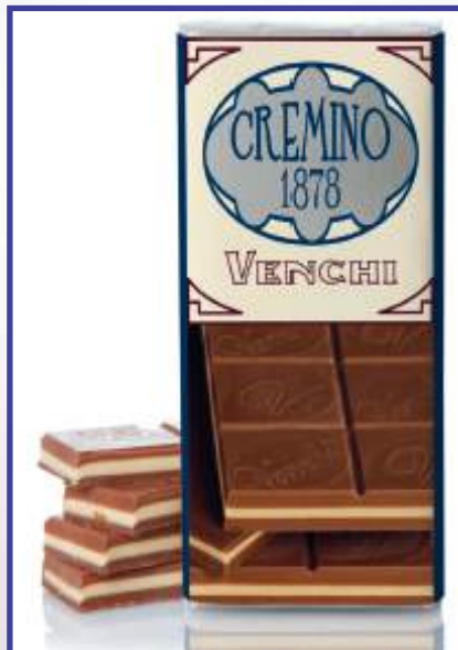
ITEM 116201 CREMINO 1878 BAR 20/110GR WHITE CHOCOLATE WITH ALMOND PASTE CENTER IN GIANDUJA