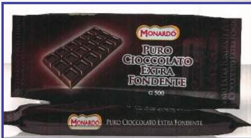
ITEM 4T DARK PURE CHOCOLATE BARS 10/500GR