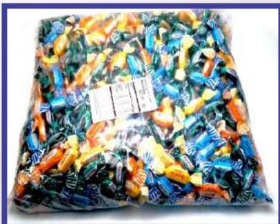
ITEM 632 GRAN MISTO ASSORTED FLAVORS 2/3KG