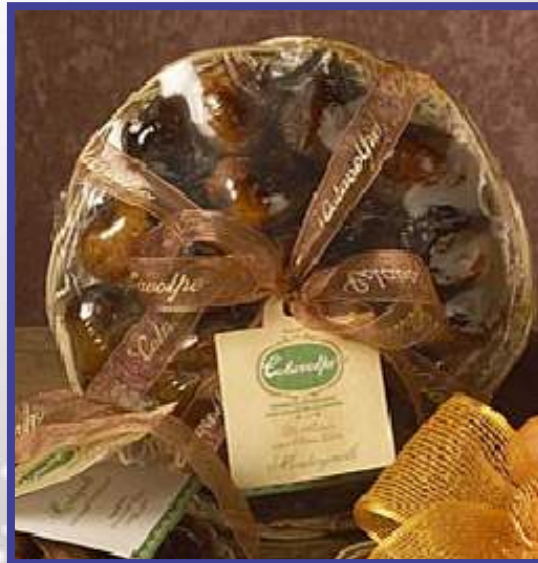
ITEM 5032 - MONTAGNOLI CESTO TONDO 8/250GR MONTAGNOLI DRIED OVEN BAKED FIGS IN ROUND BASKET