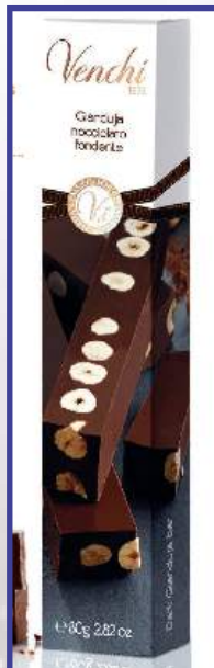
ITEM 126264 DARK GIANDUJA WITH HAZELNUTS SOFT BAR 12/80GR