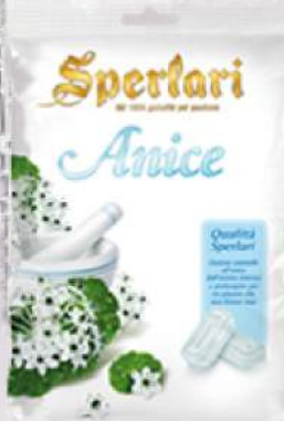
ITEM 1204 ANICE FLAVORED CANDY 18/200GR