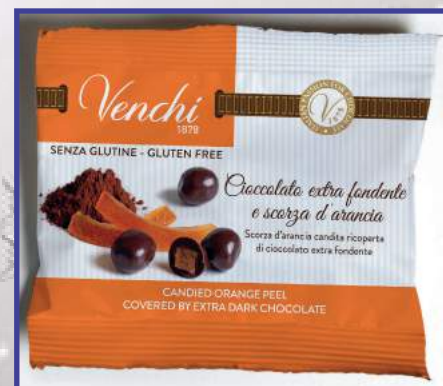
ITEM 124337 SNACK ORANGE PEELS (BAG) 21/40GR CANDIED ORANGE PEEL COVERED IN DARK CHOCOLATE