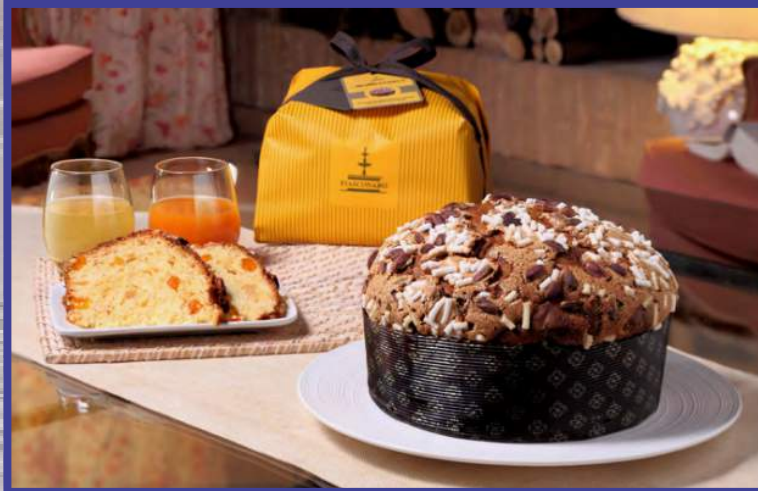
ITEM 104001 PANETTONE MEDITERRANEO 6/1000GR

HAND-WRAPPED TRADITIONAL CAKE WITH CANDIED PINEAPPLE AND APRICOT, TOPPED WITH ICING AND PISTACHIO NUTS.