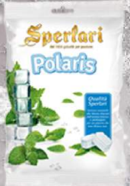
ITEM 1349 POLARIS GLACIER MINT 18/200GR