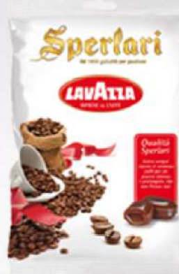
ITEM 1106 CAFFE LAVAZZA FILLED 18/175GR