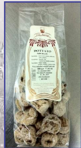
ITEM 001MP FICHI DOTTATO DEL CONSENTINO 1/5KG