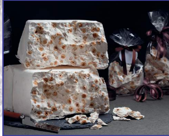
ITEM 128001 CRISPY NOUGAT BLOCK 1/4KG