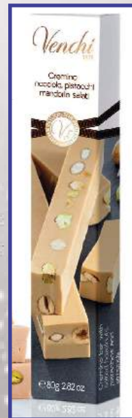
ITEM 126266 WHITE GIANDUJA W/SALTED NUTS SOFT BAR 12/80GR