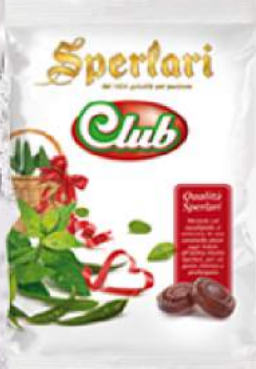
ITEM L114 CLUB EUCALIPTUS MENTHOL 18/200GR