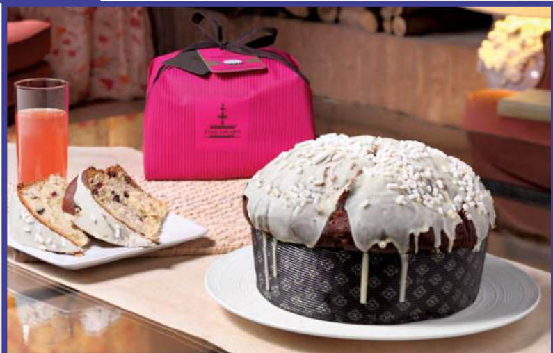
ITEM 126001 PANETTONE PERA & CIOCCOLATO 6/1000GR

HAND-WRAPPED TRADITIONAL CAKE WITH SEMI-DRIED WILD BERRIES, TOPPED WITH WHITE ICING.