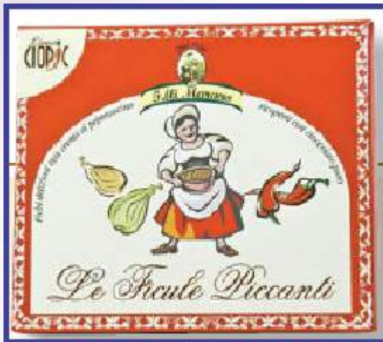
ITEM 015 LE FICULE PICCANTE 12/250GR FIGS WITH HOT CHILLI PEPPER CREAM COATED WITH DARK CHOCOLATE