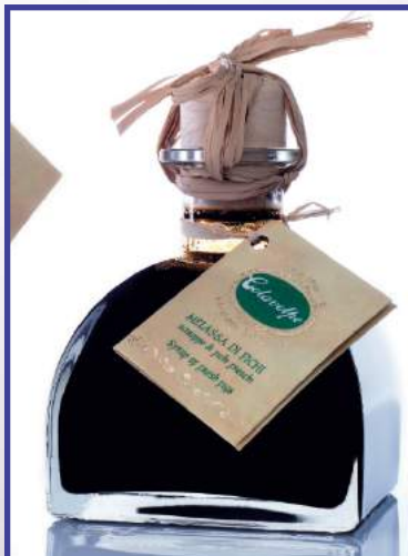
ITEM 1195 MELASSA DI FICHI 6/250ML