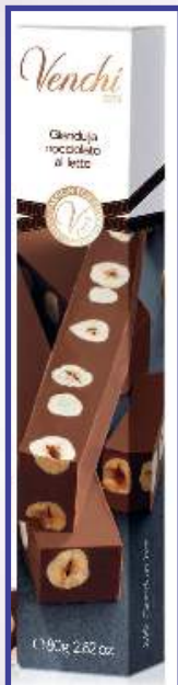
ITEM 126265 GIANDUJA WITH HAZELNUTS SOFT BAR 12/80GR