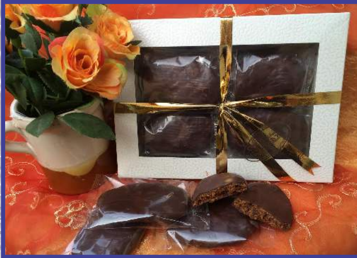
ITEM CUNSUSC SUSAMELLE COVERED IN CHOCOLATE 16/250GR