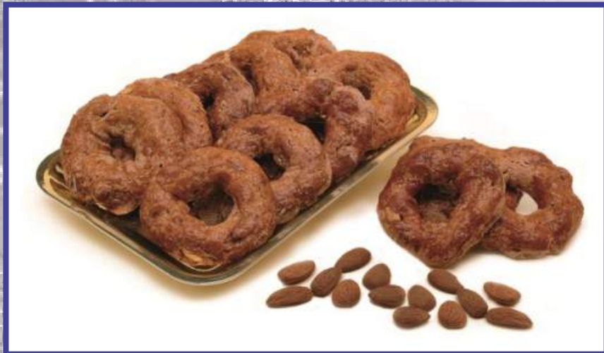
ITEM# 500ROCC ROCOCCO 10/500GR