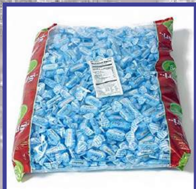
ITEM 603 HARD ANISE FLAVORED 2/3KG