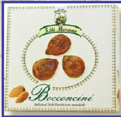
ITEM 004 BOCCONCINI CON MANDORLA 14/250GR FIGS STUFFED WITH ALMOND