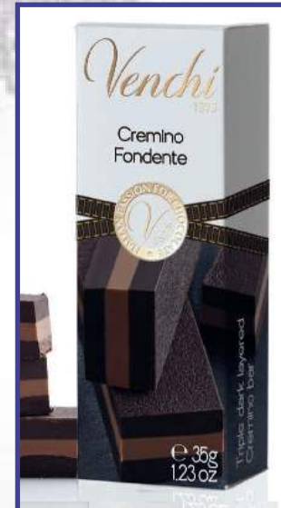
ITEM 126285 SOFT MINI BAR CREMINO EXTRA DARK 24/35GR