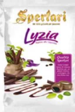
ITEM 1104 LYZIA LIQUORICE FILLED 18/200GR