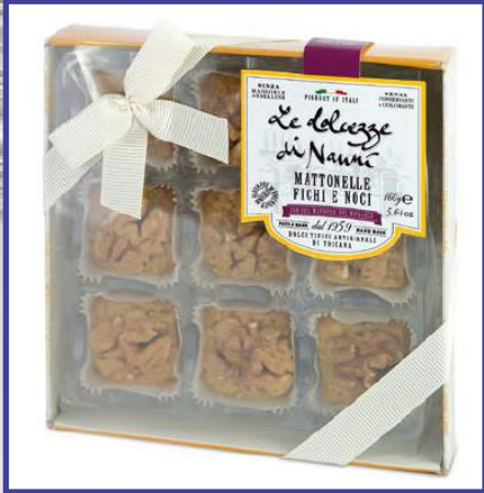
ITEM 5761 MATTONELLE 8/160GR

SOFT ALMOND COOKIES WITH FIGS AND WALNUTS