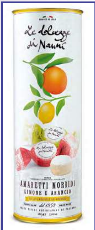
ITEM 4613 AMARETTI MORBIDI LIMONE E ARANCIO 3/160GR

SOFT ALMOND COOKIES LEMON AND ORANGE FLAVORED