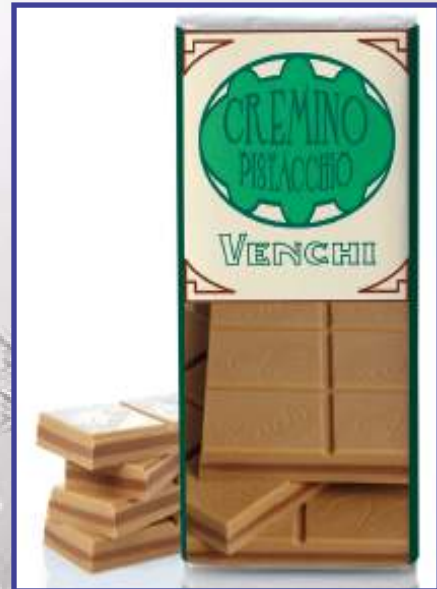
ITEM 116203 CREMINO PISTACHIO BAR 20/110GR LAYERS OF LIGHTLY SALTED PISTACHIO GIANDUJA