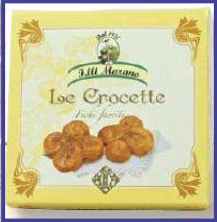
ITEM 001M LE CROCETTE CON MANDORLA 14/250GR FIGS STUFFED WITH ALMOND