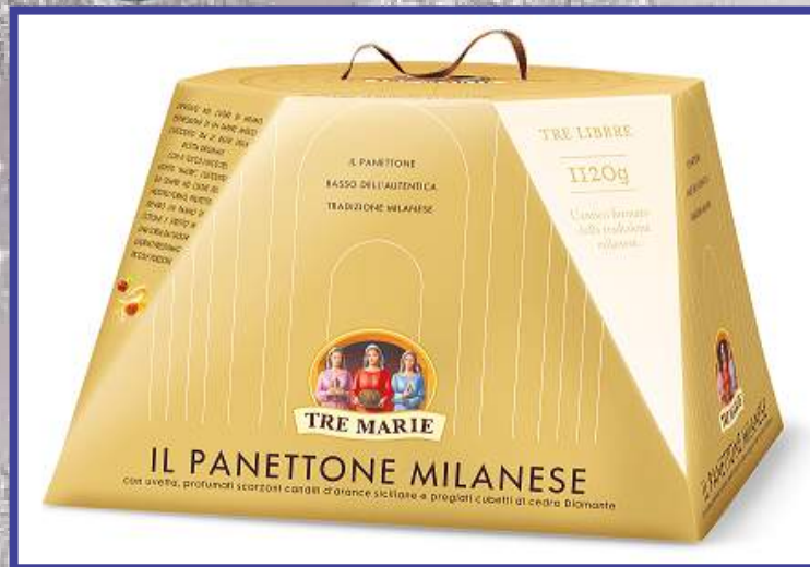
ITEM 3038 IL PANETTONE MILANESE 12/1120GR

TRADITIONAL RECIPE MADE WITH SWEET SULTANAS, CANDIED ORANGE PEELS FROM SICILIAN ORANGES AND DICED CITRON.