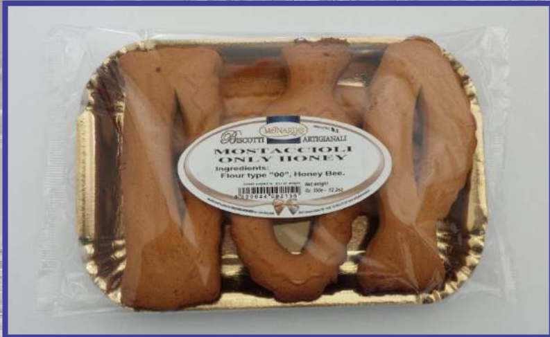
ITEM 14a MOSTACCIOLI CALABRESE 16/350GR