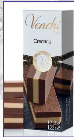
ITEM 126283 SOFT MINI BAR CREMINIO 24/35GR