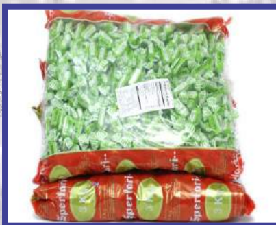
ITEM 607 HARD MINT FLAVORED 2/3KG