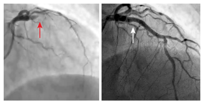
Fig 2 Angiograms before (left) and after (right) primary percutaneous coronary intervention in a blocked left anterior descending artery (arrows)