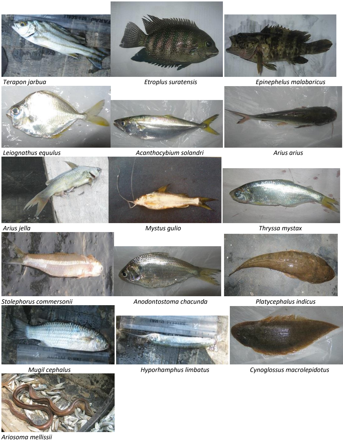
Figure 1: Family wise Distribution of Fishes at Kadaludi Estuary