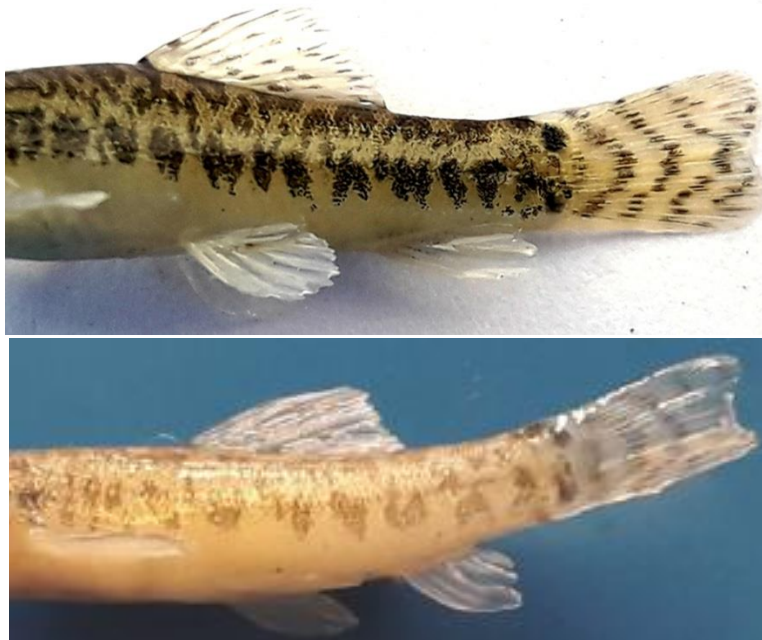
Figure 3 Colour pattern on side of body in Paracanthocobitis tumitensis sp. nov.

Body brown to greyish with 15-16 dark brown to black scattered blotches along lateral line and not extending onto lower side of body, 15-17 dark brown scattered dorsal saddles. Dark spots and blotches on head; 1 uninterrupted black bar from anterior eye to tip of snout, and 1 interrupted black bar from the tip of snout to the posterior end of eye which lower surface of eye i.e., in infraorbital region. 2 black ocellus like spots at the upper and lower portions or bases of the caudal-fin origin. Dorsal-fin with 3-4 black dotted rows of bands.