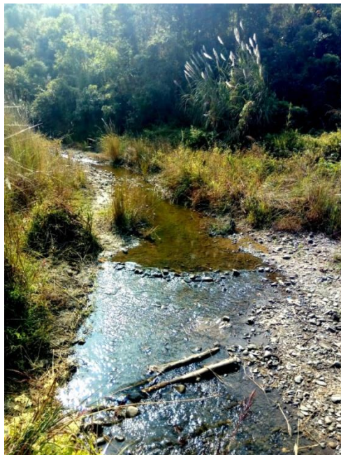
Figure 4 Type locality of Paracanthocobitis tumitensis sp. nov., Tumit River, Purum Chumbang Village, Chandel district, Manipur, India.

The species inhabits flowing clear water with gravel bottom and lush green algal bloom (Fig. 4). They were found adhering to rocks at the time of collection and associated with Devario , Schistura , Mastacembelus , Pethia and Opsarius species.