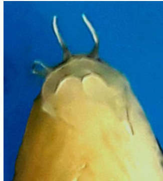
Figure 2 Oromandibular structure of Paracanthocobitis tumitensis sp. nov.

Lateral line incomplete, reaching at most to dorsal-fin insertion, 28-33 pores. Axillary pelvic lobe absent. Mouth arched with papillated lips; upper lips with 2-3 minute rows of papillae, discontinuous with large pads on lower lip. Three pairs of barbels, inner rostral barbel extends to or slightly past base of maxillary barbel, maxillary barbel and outer rostral barbel extend to or slightly past orbit or eye. Body covered with scales, 10½ branched dorsal-fin rays; 11-12½ pectoral-fin rays and pointed or acuminate, 9 pelvic-fin rays and rounded to subacuminate, 7 branched anal-fin rays; 18 branched caudal-fin rays.