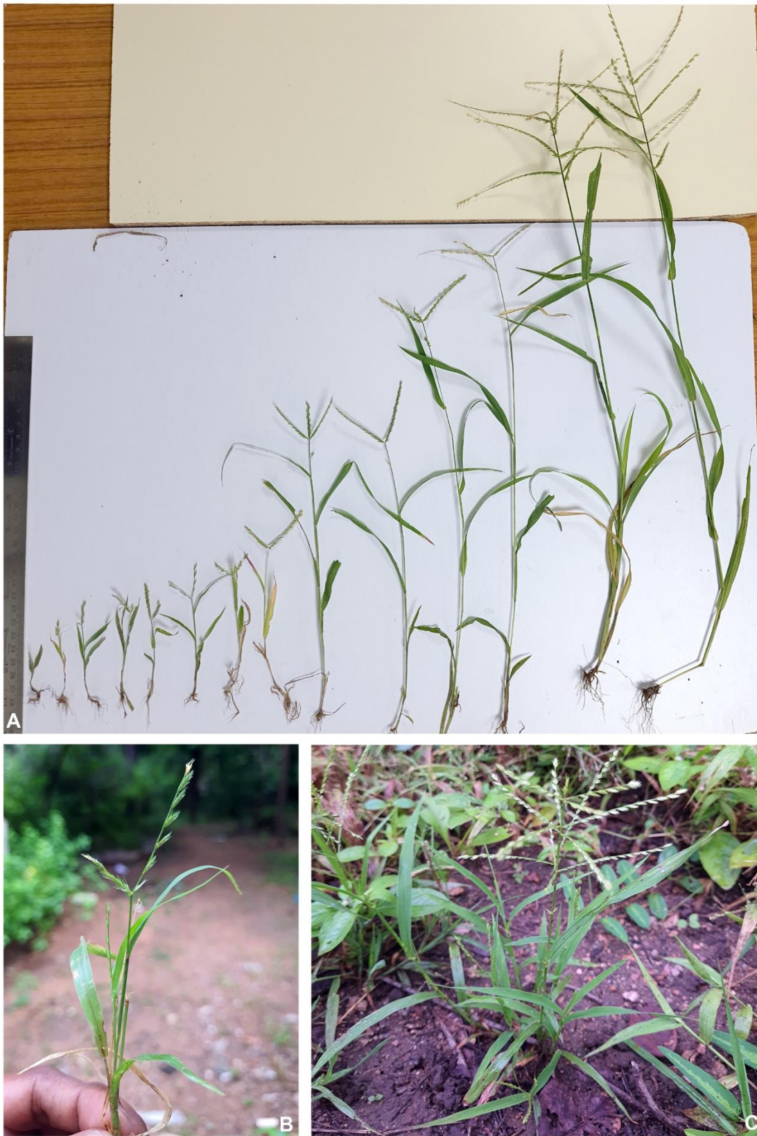
Figure 2: A–C. Acrachne racemosa habit and inflorescence variations