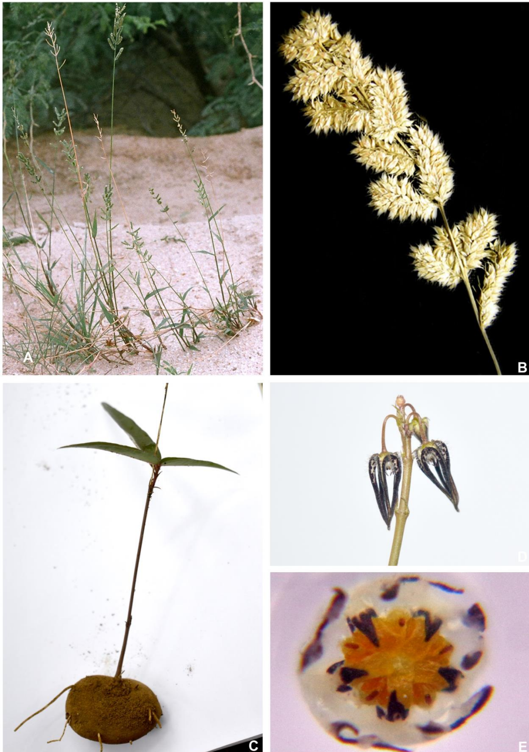
Figure 1: A–B. Acrachne henrardiana ; C–E. Brachystelma bilobatum

Type: India, Tamil Nadu, Kanyakumari District, Vivekanandhapuram, seacoast, fl., 21 Nov. 1995, Muthukumar 106403 (holotype CAL!; isotypes MHI, K).