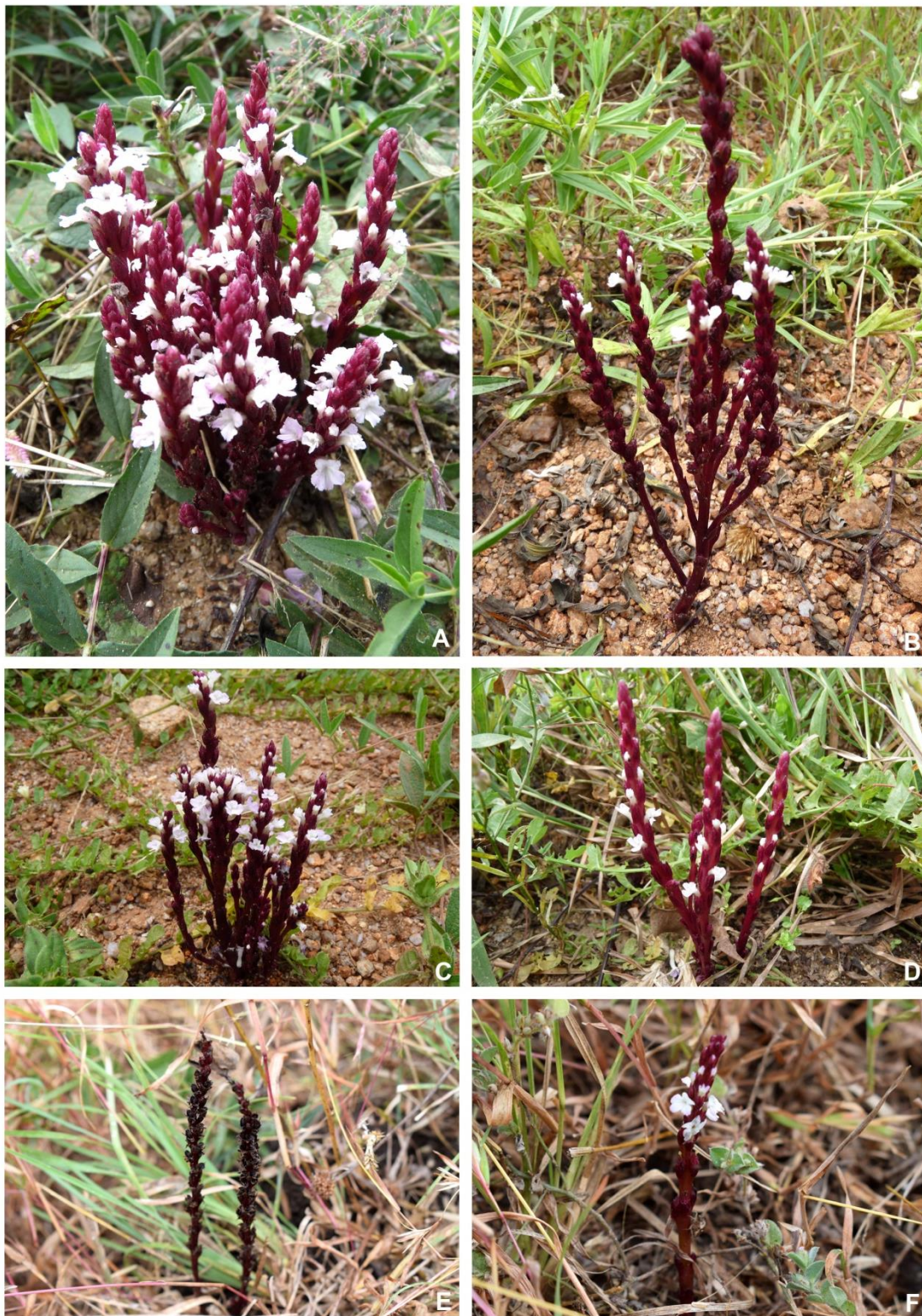
Figure 4: A–F. Habit variations in Striga gesnerioides

Notes: Among all the witch weed species, S. gesnerioides has vast distribution range and it has developed host-specific strains that have distinct morphotypes. These strains will differ in succulence, length and number of branches, color and indumentum of stem, length of bracts comparative to calyx, length of calyx lobes comparative to tube and color of corolla, size and presence of indumentum on it (Mohamed et al. , 2001). We have studied the several specimens of S. gesnerioides from Andhra Pradesh, Karnataka, Kerala, Rajasthan, Tamil Nadu and Telangana and observed several variations within the same populations and populations at different geographical areas (Figure 4), such as stem solitary to branched, subterete to angular and flowers pinkish or