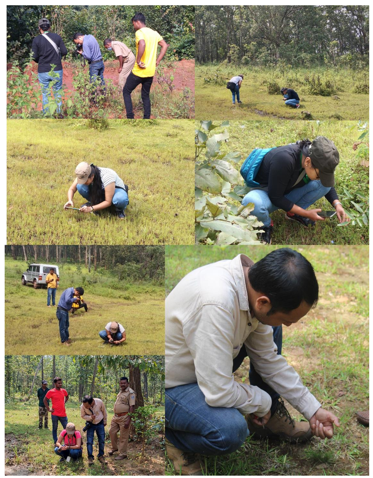
Plate 1: Field survey for enumeration of indicator plants

study highlights the importance and urgent need of the restoration of natural salt lick along with plantation of food plants near them.