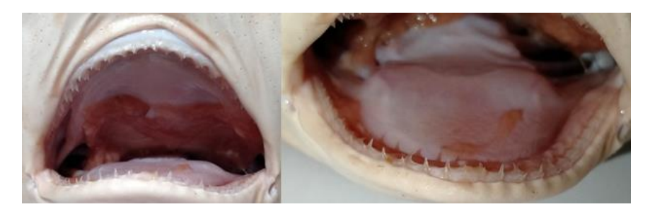
Figure 4. The upper and lower teeth of the specimen

The identification of C. altimus is often confused with other sharks; that is why, a more extensive distribution range can be expected in the Mediterranean Sea (Serena 2005). C. altimus is classified as "Data Deficient" in the Mediterranean Sea by the International Union for Conservation of Nature (Mancini et al. 2015, Dulvy et al. 2016). Sharks are the largest predators in the marine food chain, and in general, they maintain the balance and control of the biological system (Cortés 1999). Although sharks are considered to be economically low worldwide, they are extensively hunted by industrial fishing. There are no robust data on the amount and composition of the bycatch. Distributional data of large sharks have been collected from the western and central parts of the Mediterranean basin (Sperone et al. 2012; Mancusi et al. 2014). Data on these species from the eastern part of the Mediterranean, however, are limited (Kabasakal et al. 2017).