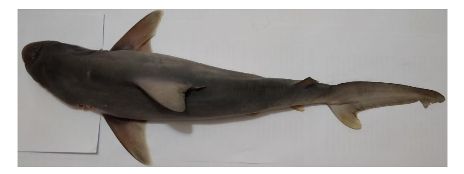
Figure 3. The dorsal view of the specimen