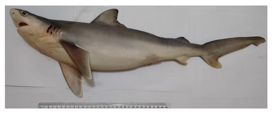
Figure 2. Carcharhinus altimus (680 mm TL)

Table 1. Morphometric measurements of C. altimus caught in Iskenderun Bay (Samandağ coast)