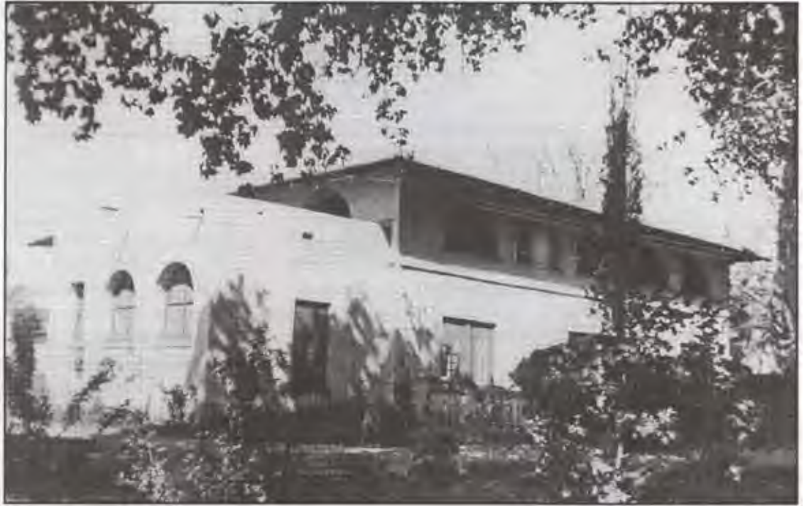
Home of the Good Shepherd.

* Foss says it was only a private residence (p. 2) while Owen