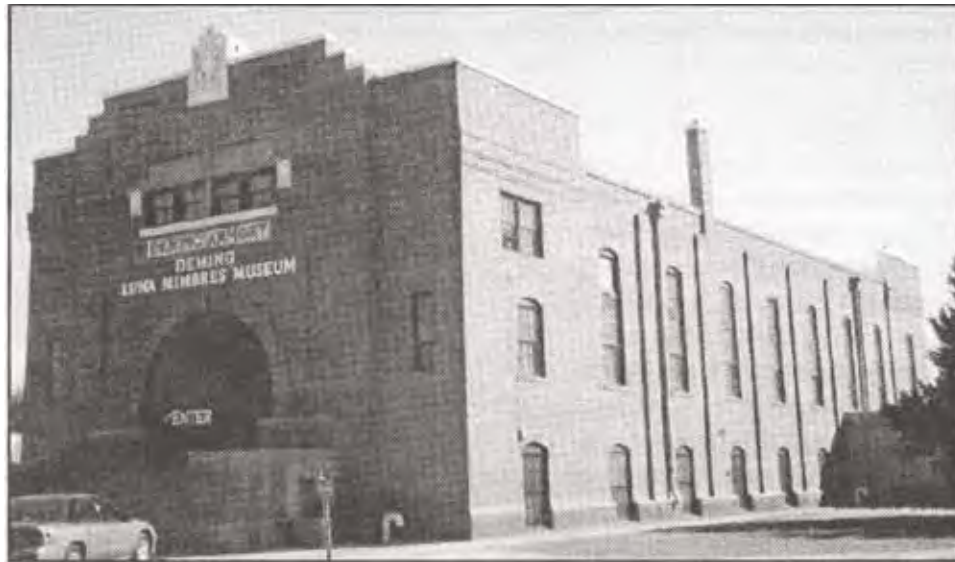
Modern view of the Old Armory Building housing the Museum, view to the northeast.