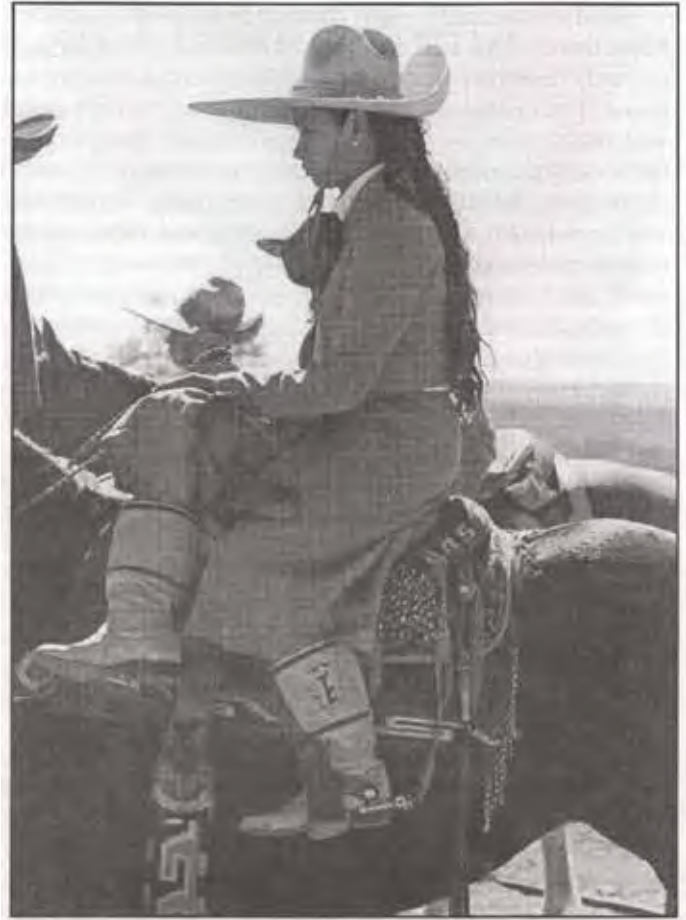
Escaramuza saddle and charra outfit, Emiliano Zapata Charro Association of Las Cruces, October 22, 1999.

The escaramuza teams, all women or girls riding sidesaddle, represent the many horsewomen in Mexican