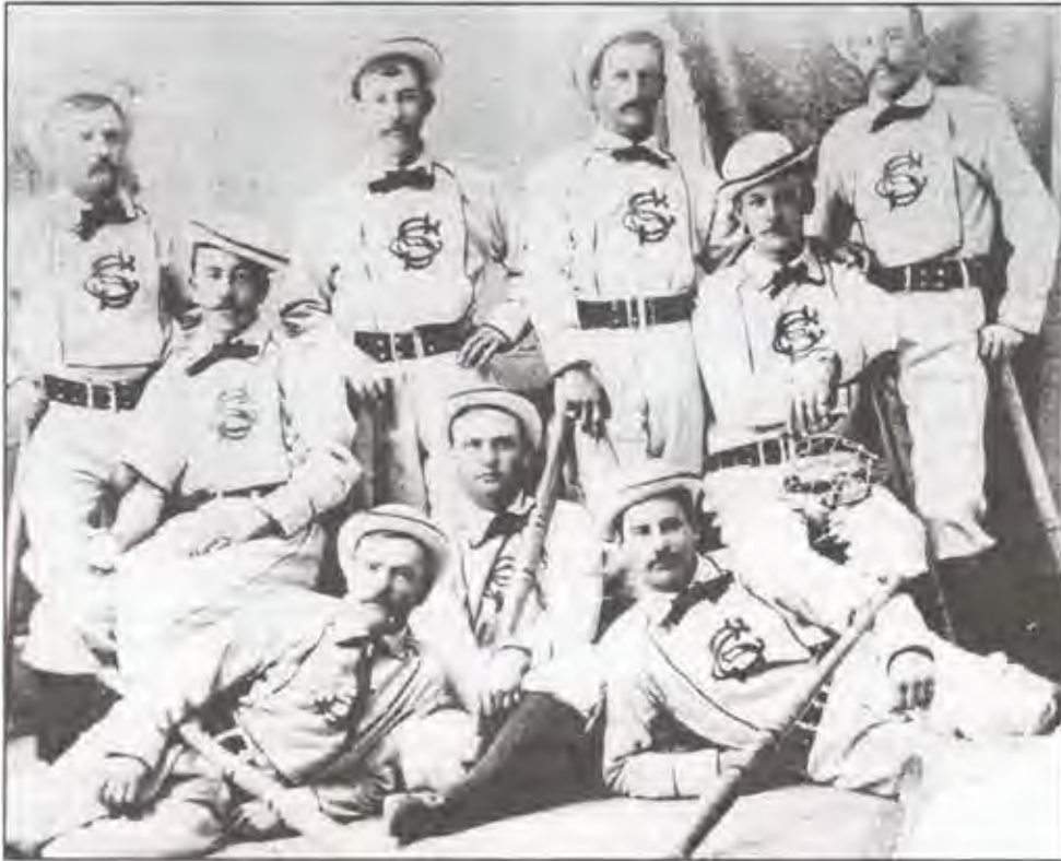
Silver City baseball team, 1885.

Democrat denied that the Duke City team was made up of former professionals, 8 but clearly at that point some very experienced players were beginning to show up in the Southwest, a trend that would continue for many years.