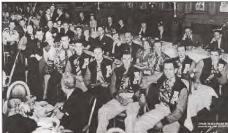
NIT Team at Jack Dempsey's, New York city.