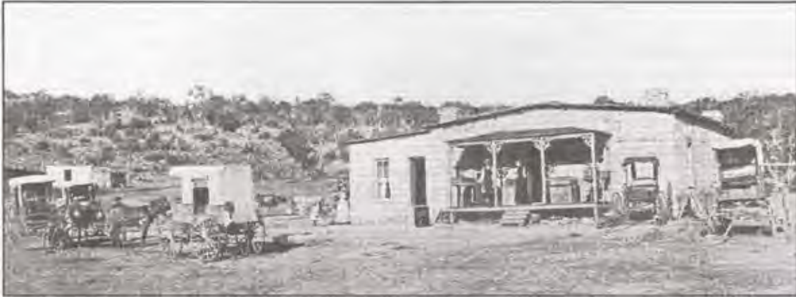
Ozane State Line's Mountain Station Ranch, ca. 1890.