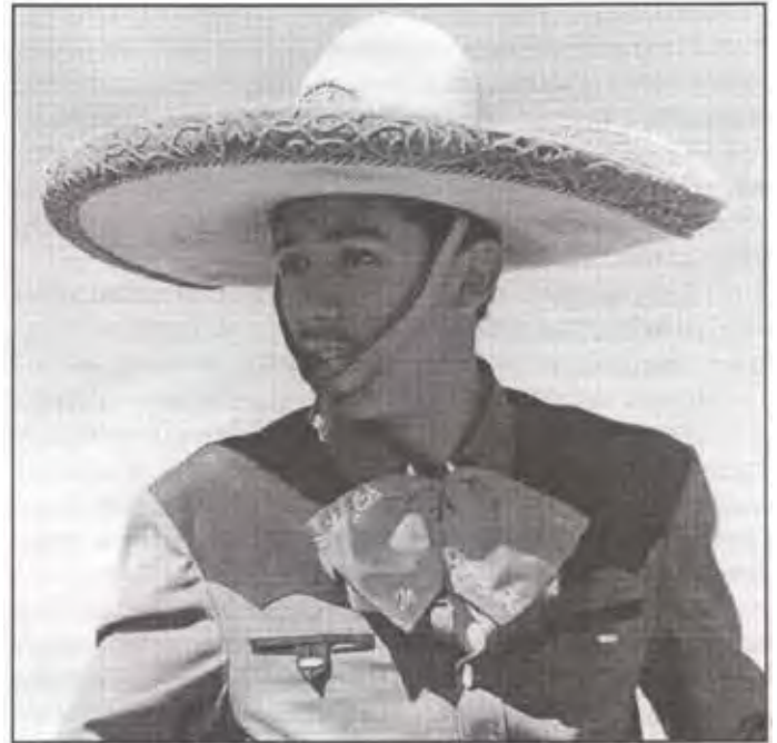
Charro outfit, Emiliano Zapata Charro Association of Las Cruces, October 22, 1999.

As riders leave to wait for future events, the charros move into the first event — the cala de caballos . Here the ability of a charro to control his horse and to work as one with the horse is clearly demonstrated. The charro and