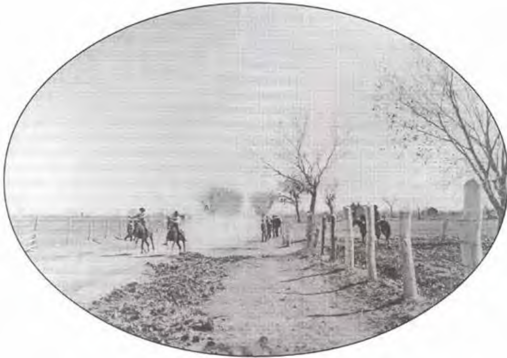
Sunday afternoon horse race on North Alameda Drive, Las Cruces, ca. 1890s.