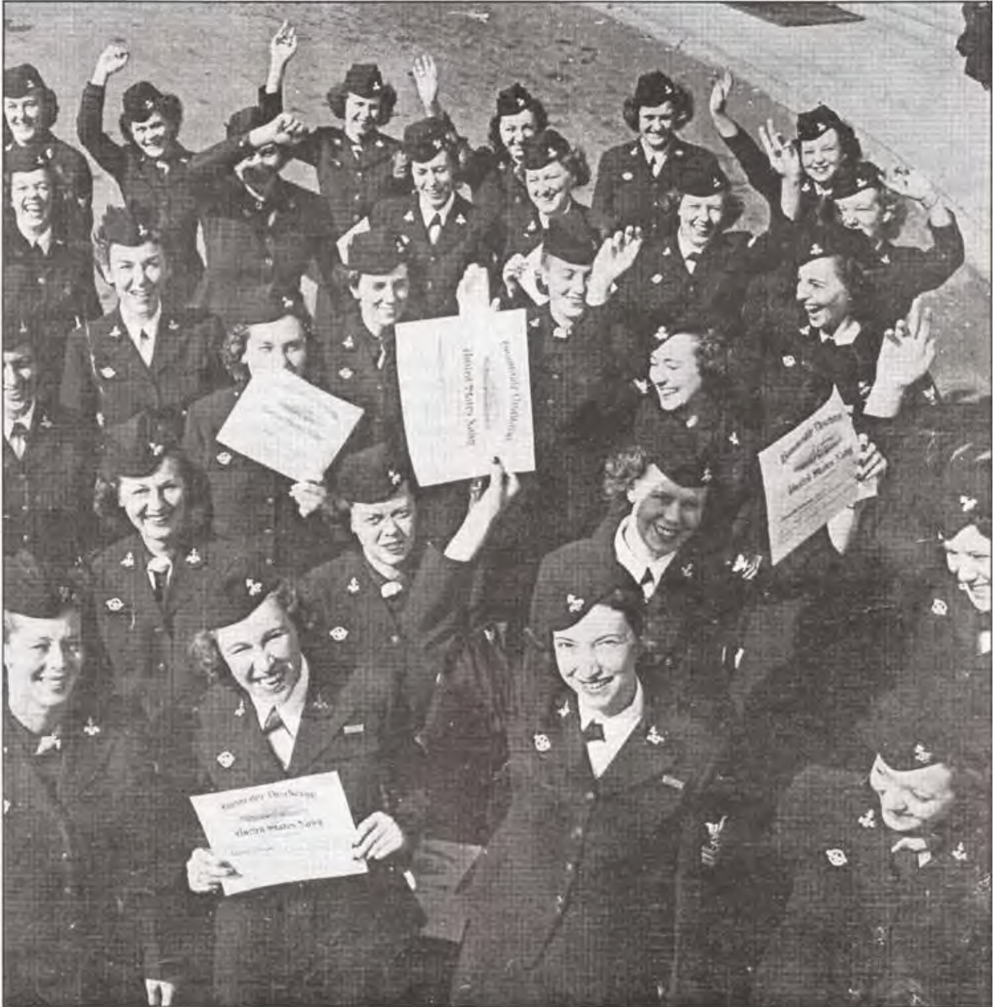
WAVES discharged in late 1945, Washington, D.C.

sea duty and sightseeing fill their positive memories. Working as statisticians, tabulating statistics on dead and wounded American servicemen, hearing about ships being destroyed at sea on which they had friends, boy-friends, even husbands, fill their saddest recollections. 27 When asked about rules, regulations, dress codes, and proper WAVES behavior, answers suggested that protocol varied from station to station. Most agreed, how-