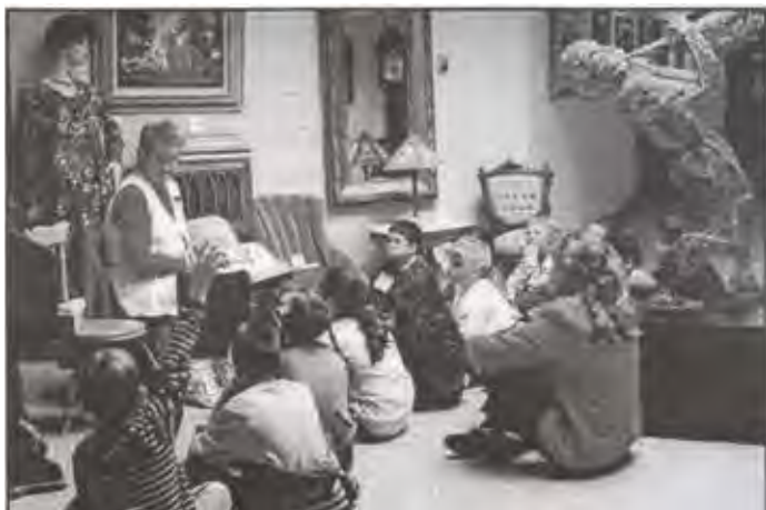
Docent with a children's group. Note the period furniture, mannikin, and modern sculpture.

no money, but the museum project just snowballed.