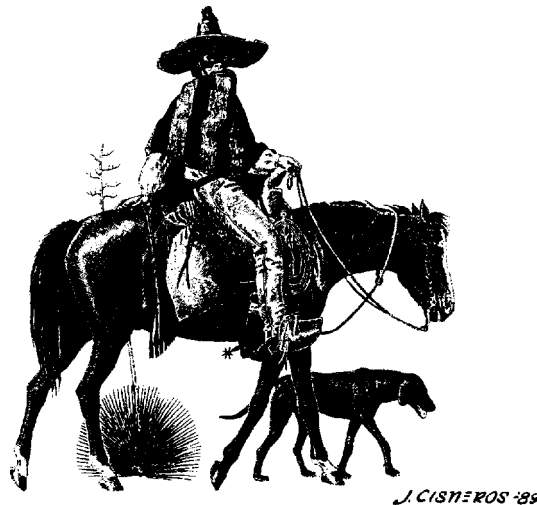
Pasajero del Camino Real Property of DACHS

Doña Ana County Historical Society 500 N. Water Street Las Cruces, NM 88001-1224