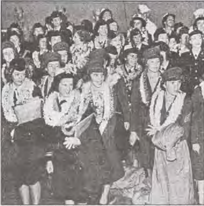
First WAVES, SPARS, and women Marines prepare to leave Hawaii for stateside, October 13, 1945.

and to substantiate this, one former WAVES member remembered the following Navy saying: “If it moves — salute it. If it doesn’t — paint it.” 28 Furthermore, according to a 1944 handbook on etiquette and customs for members of the WAVES and SPARS, the following rigid description of “the Salute” applied to all in uniform: