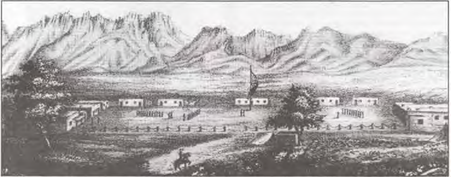
Ft. Fillmore. From the London Illustrated News, December 2, 1854.