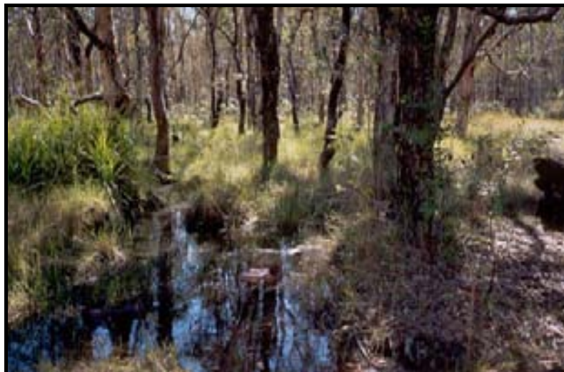
Figure 4: Intermediate eucalypt forest / heath community, Jerusalem area

While wallum heath freshwater bodies are clearly the core habitat, further work may be needed to assess the tolerance and adaptability of pygmy perch to variable habitat and changes in water quality parameters.