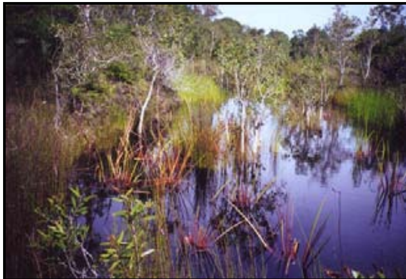
Figure 3: Typical pygmy perch habitat, Broadwater National Park

Wallum heath country has a well-distributed annual rainfall (of 1016 to 1778 mm) and freshwater lakes, creeks and wetlands feature prominently throughout the region [3] . Waterbodies in the wallum heath are characterised by very low salinity, low magnesium; calcium hardness and (pH >3 to <7). Habitats range from low conductivity (<250 \mu\text{s cm}^{-1} ), clear waters with a pH of 6 to 6.5, to estuarine, darkly stained dystrophic waters of pH 4 to 6, over siliceous sands, aquatic vegetation or plant debris. The generally high organic acid content of these water bodies is derived from leachates from swamps and riparian vegetation, particularly Melaleucas.