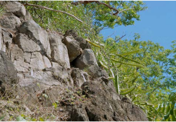
Climbs on Trees and Bushes