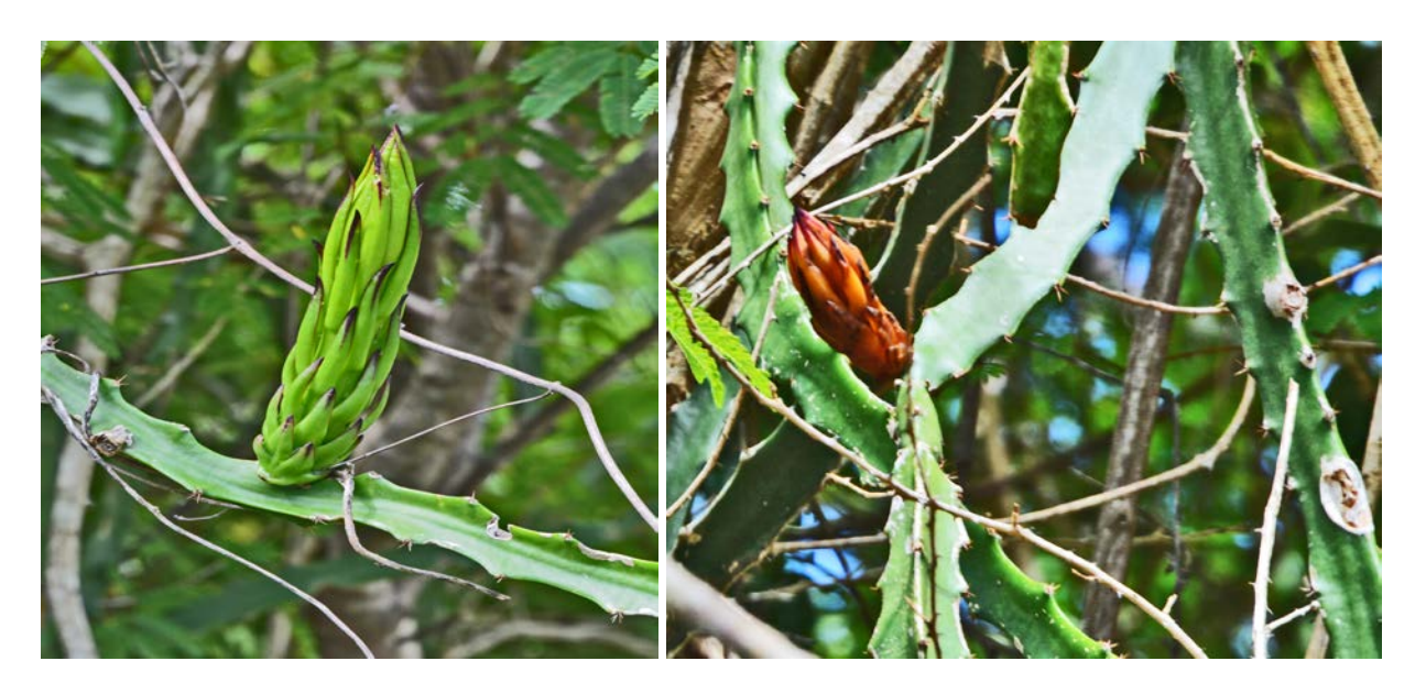
Maturing Flower Perianth with prior flower scar on stem's left

The upper tips of the younger stems have brown areoles up to the stem tip that are closer in distance and curved in the tip edges from where flower cephalia tubes develop. Some flower perianth stop developing and dry out without flowering, turning orange red before falling off the stem. The ones that flower and fruit equally drop of leaving a noticeable scar on the rib areole that bear the spines.