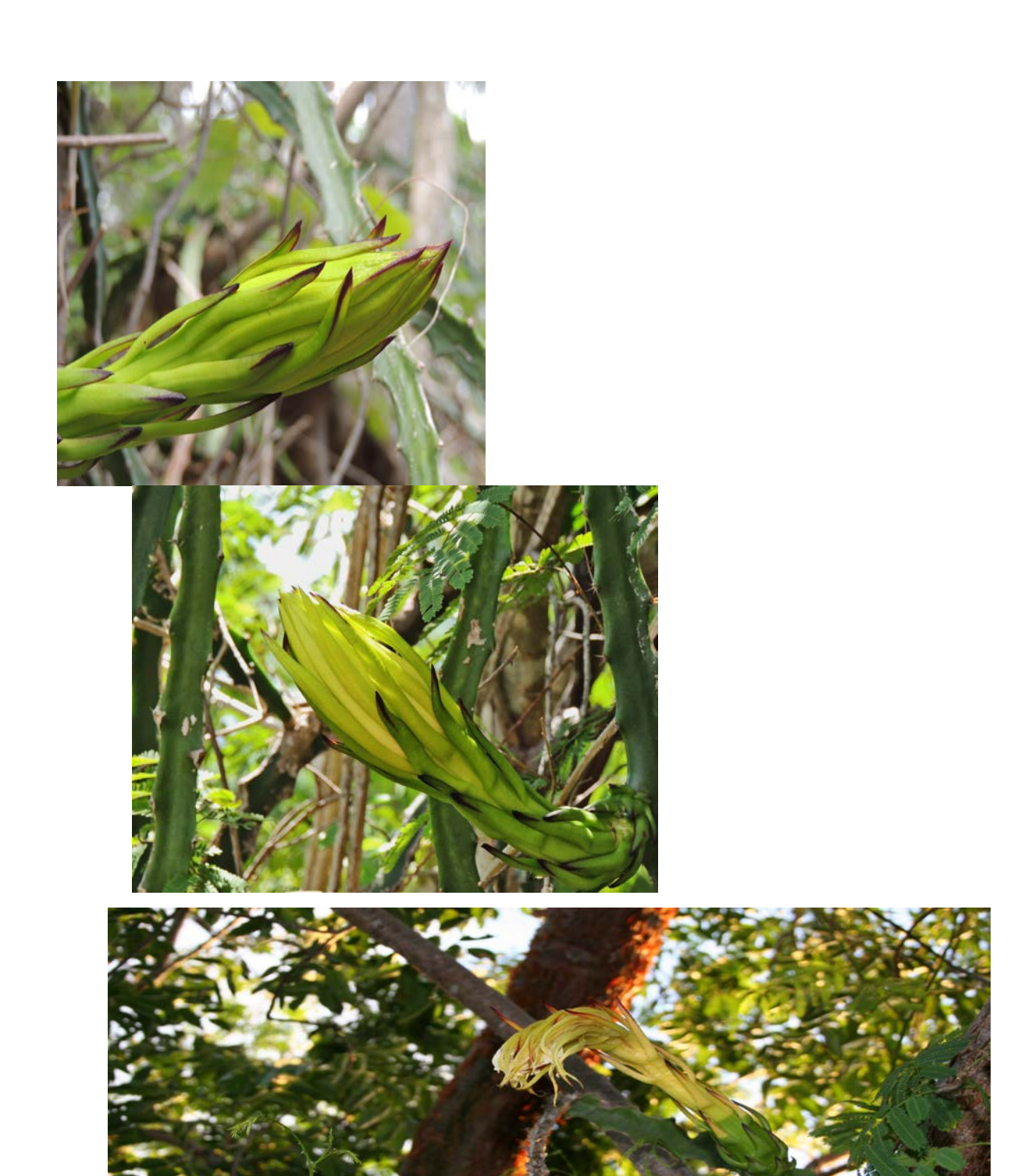
The Hylocereus genus of cacti is often referred to as the night-blooming cactus (though the term is used for many other cacti). Its flowers are the largest in the cacti family. It is best