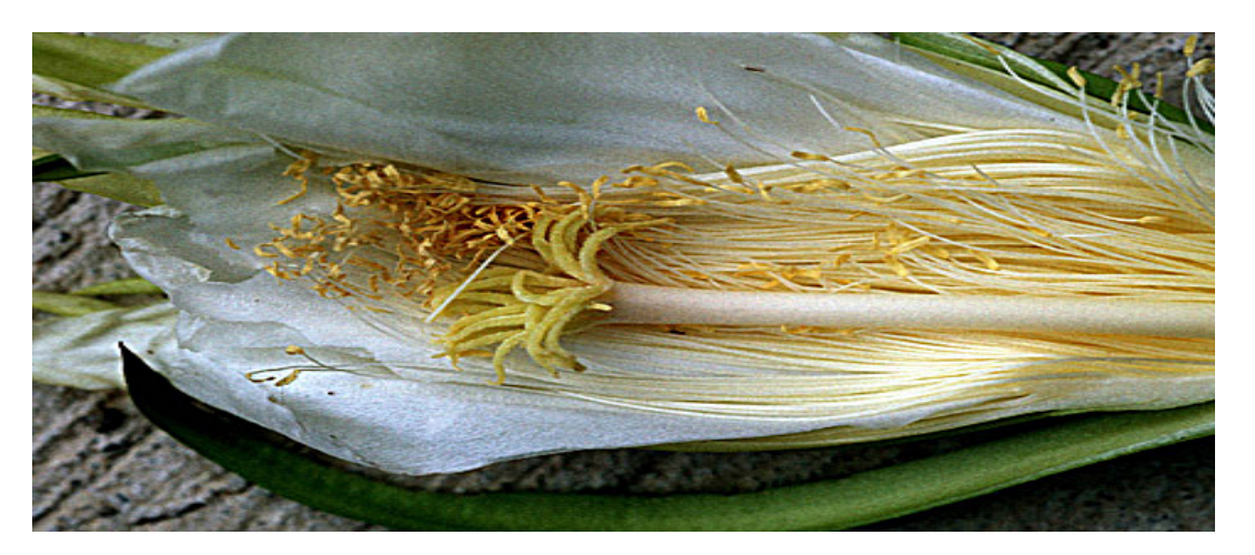
Hylocereus trigonus - Inner Perianth Pistil and Detail

The flower's calyx has an outer segments are sepal, acuminate, style elongated 4.5 to 7.5 cm. long, oblong and usually yellow or yellowish green, the corolla's inner segments are white petals, acuminate, style elongated 3.5 to 7.5 cm. long, and twice as wide as the sepals, numerous stamens capped with yellowish anthers and a large finger or tree like style crowned with numerous stigma lobes of the pistil that when appreciated together as a whole flower creates both a beautiful, crowded and very reproductive functional mature flower.