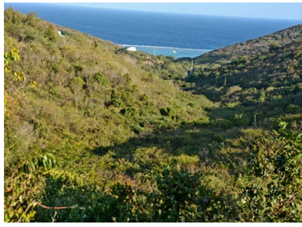
Green Valley Looking Toward East SE

The Green Valley Area between the central hill and lower south hill that a pristine developed dry tropical forest area.