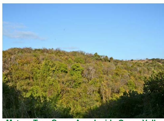
Mature Tree Cover Area Inside Green Valley