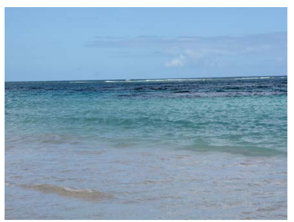
Very Clean Beaches