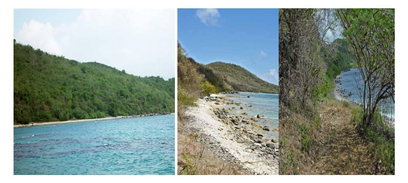
The "Cascajo" designation for the beach area describes its fractured stone, dead coral and seashell ground cover. Other limited areas of the island of Culebra provide wider coastal habitat extensions and even some sand dune areas allowing for better development of coastal habitat plants within such areas and also allowing, in some sandy beaches, turtle nesting areas.

The coastal area of Playa Cascajo , in VMT's southern boundary, provides a proper habitat for coastal vegetation of the dry forest association. This habitat is limited by the seashore's short depth and the immediate cliff associations that are characteristic of the geography of the southern extension of the VMT site and Culebra generally. The beach area is not deep or sandy and is covered by rocks or dead coral and shells ("cascajo" in Spanish).