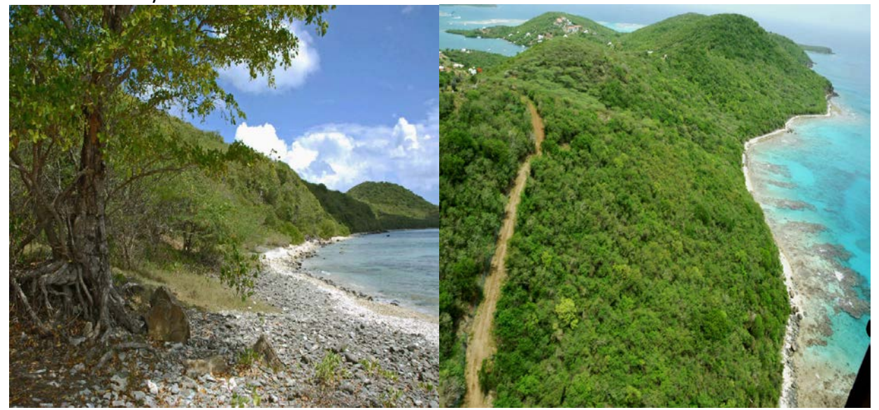
Cascajo Beach Area

The <u>cliff association</u> is found in the extreme southern area of the property where significant seashore cliffs roll down to <u>Playa Cascajo</u>. This <u>cliff association</u>, as its names describes, is characterized by extreme cliff contours and narrow coastal areas.