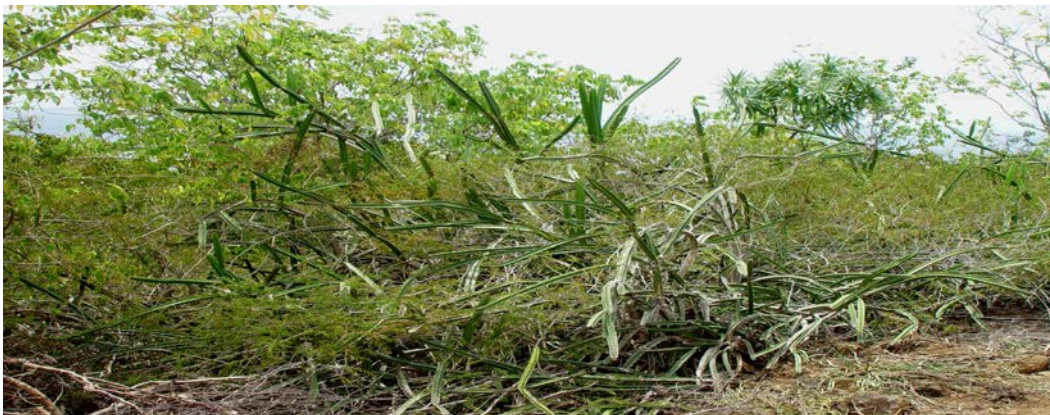
VMT Upper South Hill Cacti Population

An inventory of water wells was carried out from May to June 1991 by the USGS 29 and a Report was published in 1995. The report described 77 wells of which two are found in the VMT property. They were dug by the Fishbach family prior owners of the property to water cattle. Of the 77 historical well only two (2) were operating for household use and four (4) for agricultural use in 1991. Most are probably close today or use for garden or non-potable use.