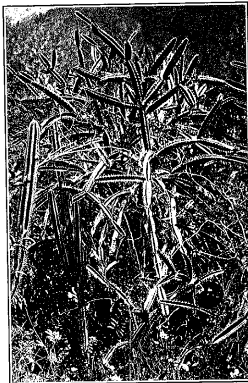
Leptocereus quadricostatus from Britton and Rose "The Cactaceae" Vol. II, p. 81. An illustration of the new species will be shown soon in this JOURNAL.

A plant transferred to the New York Botanical Garden, flowered there in November, 1933.