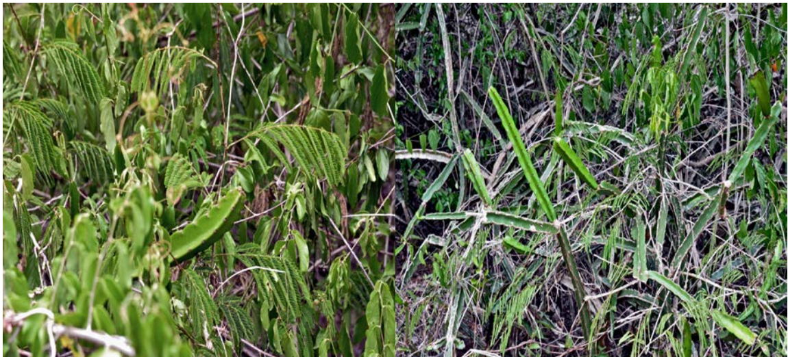
Protective Growth with other Spiny Celtis Iguanaeae Species