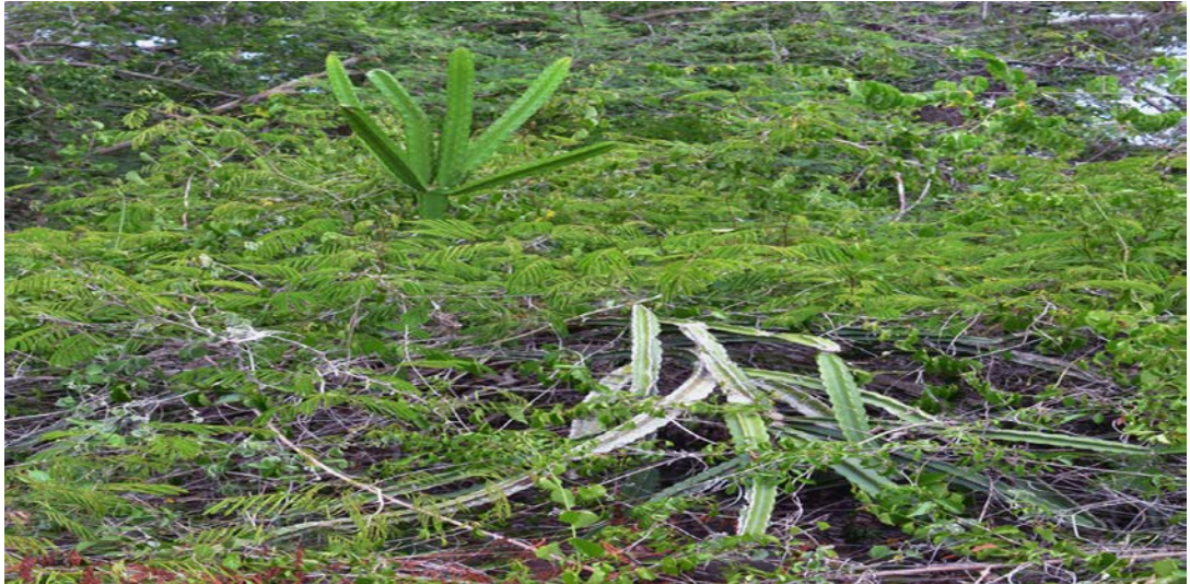
Exposed Stand-alone Branch and Protective Growth with other Spiny Species