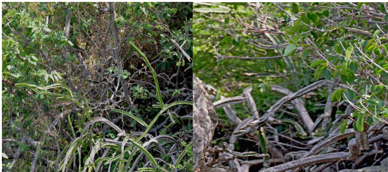
Punta Melones Population base and stem segments

The original population in the Punta Melones area was observed in both in July 2011 and May 2012 as continuing to do well. It is a mature population as can be observed from the color and size of many of its base stems and newer upper plant segments. It is, however, more exposed and threatened today, 18 years later, than in 1995, when the USFWS Recovery Plan was approved.