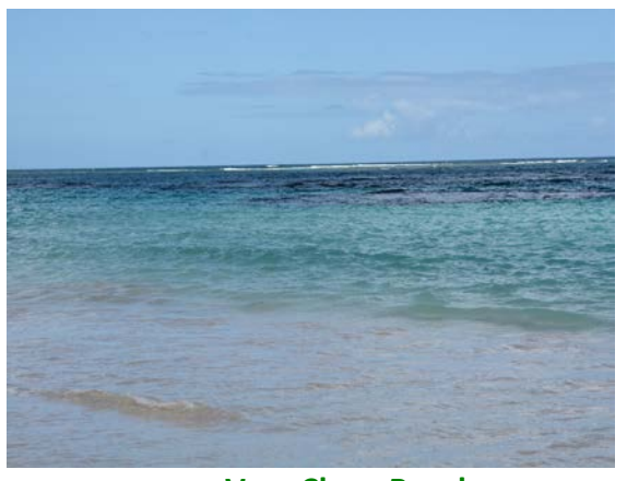
Very Clean Beaches