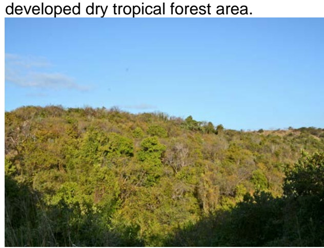
Mature Tree C Cover Area Inside Green Valley