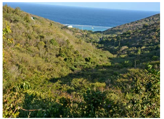
Green Valley Looking Toward East SE

The Green Valley Area between the central hill and lower south hill that a pristine