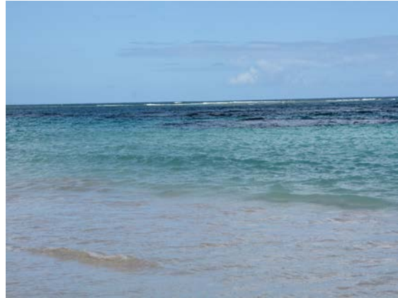
Very Clean Beaches