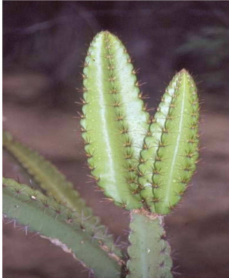
Figure 1: Photo A Villardebo

feature change as the plants matured with age. All the information additionally assists in plant classification. The older stems and base stems as well as other general growth features to assist in the species description.