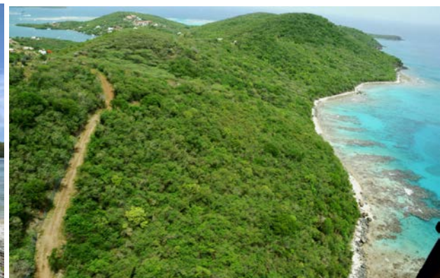
Cascajo Beach Cliffs Association