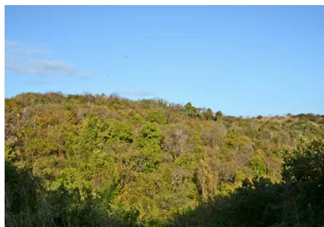
Mature Tree C Cover Area Inside Green Valley