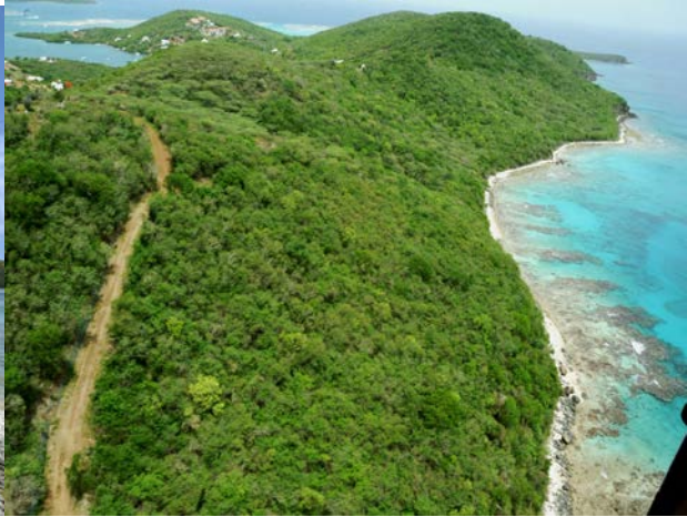
Cascajo Beach Cliffs Association

The cliff association is found in the extreme southern area of the property where significant seashore cliffs roll down to Playa Cascajo . This cliff association , as its names describes, is characterized by extreme cliff contours and narrow coastal areas.