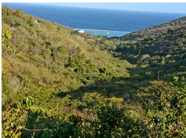
Green Valley Looking Toward East SE

The Green Valley Area between the central hill and lower south hill that a pristine developed dry tropical forest area.