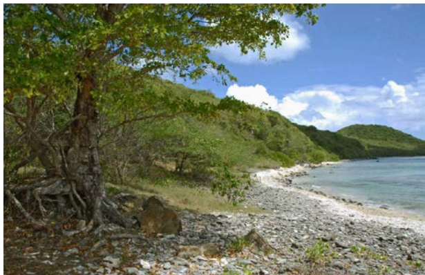
Cascajo Beach Area

The cliff association is found in the extreme southern area of the property where significant seashore cliffs roll down to Playa Cascajo . This cliff association , as its name describes, is characterized by extreme cliff contours and narrow coastal areas.