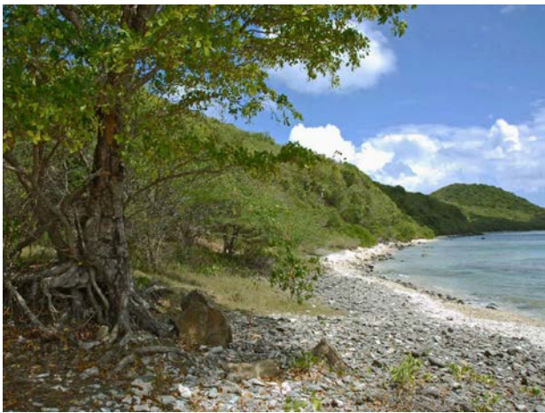
Cascajo Beach Area