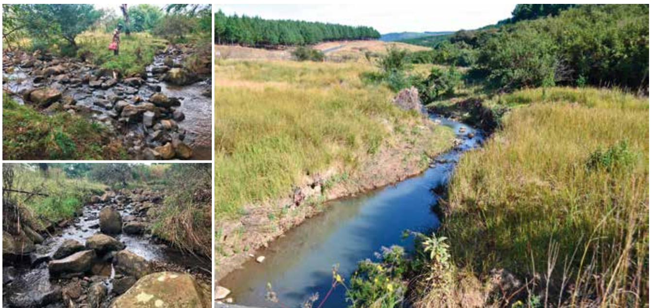
Figure 3: Photographs of habitats where specimens of Maloti minnow were collected in the Mzimkhulu River system

Downloaded by [41.9.68.207] at 10:03 23 October 2017