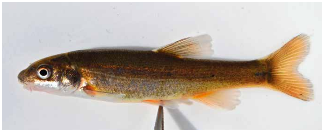
Figure 1: A specimen of the Maloti minnow (SAIAB 204589) from the Mzimkhulu River system showing live colour pattern and the distinctly small scales, which are the key characteristics of Pseudobarbus quathlambae distinguishing it from its congeners

This discovery is significant, not only being the rediscovery of this species in South Africa, but also the first record of the species in the Mzimkhulu River system. This confirms the assertion that the species was more widespread in the Drakensberg streams of KwaZulu-Natal at the time of its original discovery (Barnard 1938). It also supports the contention that the introduction of trout into Drakensberg streams was largely responsible for the extirpation of the species from the uMkhomazana and other Drakensberg streams (Jubb 1966, 1983; Skelton 1987). This is consistent with the negative impacts of trout reported from other river systems in southern Africa (e.g.