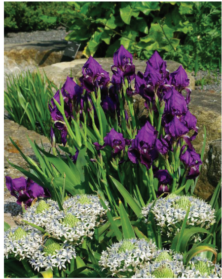
I. sabina (Richard Wilford)

Iris tuberosa is just a divergent member of the ‘ reticulatas ’, its placement strongly supported by bulb and leaf anatomy, morphology and DNA results. Its closest relative appears to be Iris pamphylica ; both species carry a pendant seed capsule high up on the stem, although the unilocular ovary of I. tuberosa is unique within genus Iris . This is a species which relishes the restricted root-run of a large pan or crevices between rocks outside. Among the handful of ‘ junos ’ that perform well outside, the variable Iris aucheri is equally at home in a pot. Depending on clone and vigour, specimens may be from 15 to 40 cm in height, with 3 to 9 flowers per stem, ranging in colour from white, greyish, pale yellow, pale blue, lilac, mauve, violet, dark purple or even bicoloured; unfortunately, the scent – especially of the more dark-flowered forms – is a combination of almond-blossom and cats’ pee.