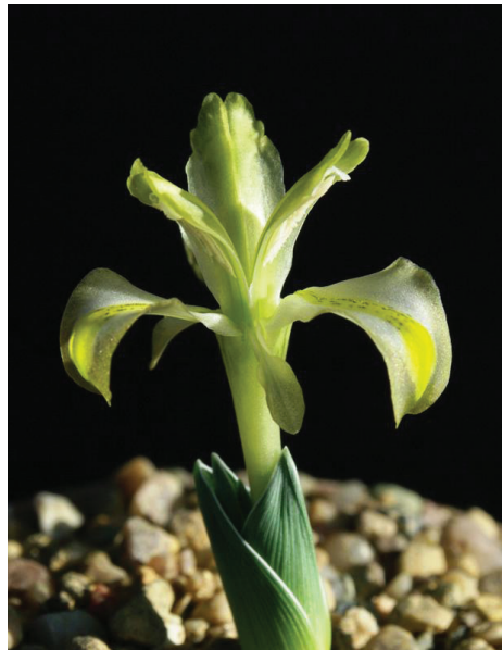
Iris atropatana (Richard Wilford)

Much has been written about the cultivation of species from section Oncocyclus (subgenus Iris ) – single flowered plants with a beard of unicellular hairs on their falls and a conspicuous aril to the seeds. They require overhead protection and, until a couple of years ago, I grew a large collection alongside the ‘junos’ and species of section Regelia , in clay ‘long-toms’; of course, all would produce stronger plants given a free root-run denied by pot culture (one solution to this is the use of up-ended, half-plunged, clay drain-pipes). With the Middle Eastern species, particularly, it is important to try and keep plants as cold and well-ventilated as possible in our damp, dark winter months, to discourage them from producing excessive early top growth. Oncocyclus irises are martyr to all manner of bacterial/fungal diseases, especially prevalent during