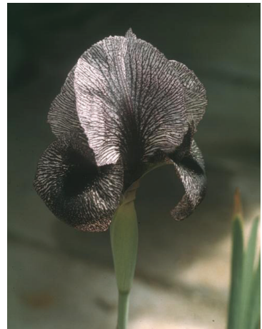
I. susiana (syn. I. sofarana subsp. kasruwana )