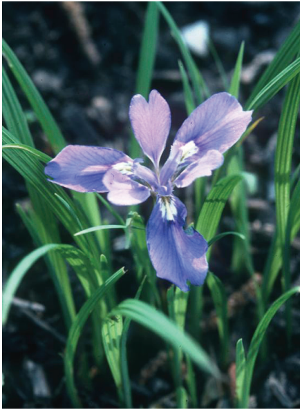
I. rossii

despite having 3 parallel crest-like ridges to its falls. Iris tenuis , on the other hand, has a barely raised ridge, and is indicated in DNA results as sister to series Longipetalae , within the core Limniris subgroup of the beardless, uncrested alliance – which makes sense geographically. Its precise relationship within Iris has always puzzled taxonomists and it is undoubtedly an ancestral species. Both of these problematic taxa survived for a few years in the Woodland Garden at Kew, but fared better on a raised peat bed behind the pyramidal Alpine House (1981-2003) and in pans plunged in a shady frame; Kew's almost pure-white form of Iris tenuis is particularly dwarf – a super pot subject.