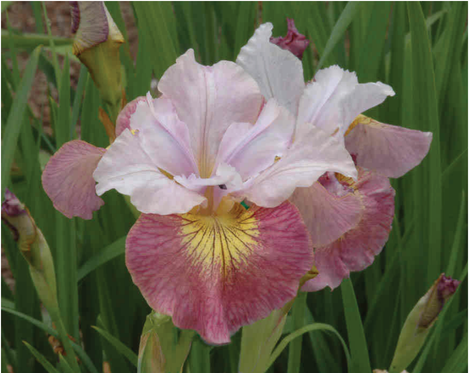
Featured Siberian iris: Sugar Rush