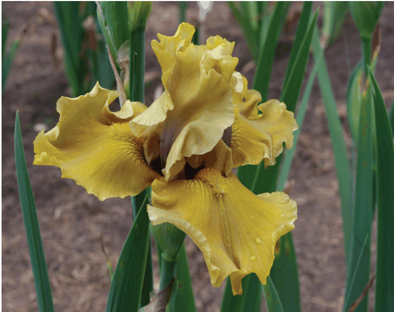
ETERNAL BLESSINGS (seedling 077510) within hours of blooming makes a strong statement with multiple shades of chartreuse and deep-toned velvety tan-yellow. Its form is reminiscent of FOGBOUND as is the deepening to violet in the base of the standards. Veined violet-brown shoulders surround golden beards with mustard tips.