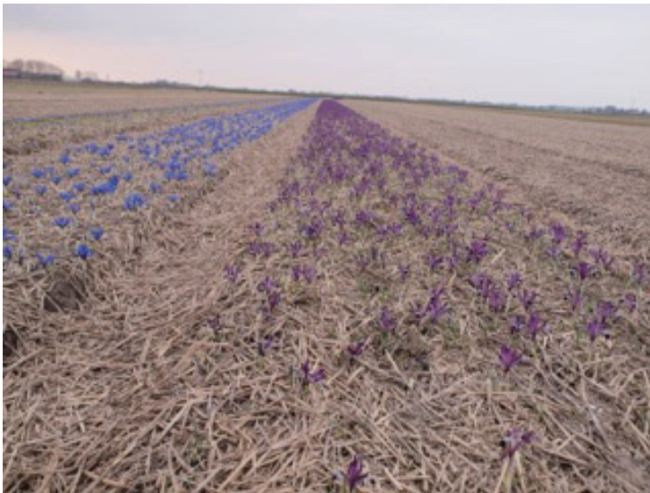
Spot On field

Back in 1985 and 1986 I went plant collecting in Turkey. One of my goals was to collect a diploid form of Iris danfordiae so that I could use it in hybridizing. Danfordiae is lemon yellow in colour, whereas most other Reticulatas are blues and purples. Over the years I made a lot of crosses and in the process, I opened up a whole new world. A world no one would have thought possible. It could easily be that I have only just started to scratch it's surface.