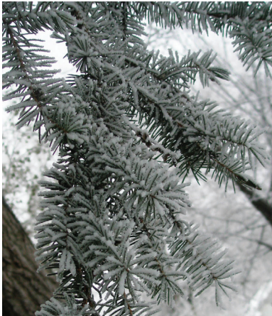
Hoar frost evergreen

So what changed in that time? The first thing I noticed was that the number of IBs and MTBs has increased dramatically. The second is that the number of TBs has decreased just as dramatically. It is easy to denote the reason for the decrease in TBs; several years of wild weather would account for it. But why the increase in IBs and MTBs? Upon reflection, I would have to say the main reason comes from a Median convention I attended in 2006 in Lincoln, Nebraska. At that meeting which coincided with the 50th anniversary of the Median Iris Society, I was exposed to the people and the plants, many I had only a cursory