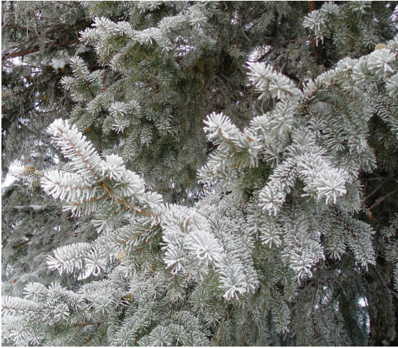
Even more hoar frost

knows what next year might bring, right?