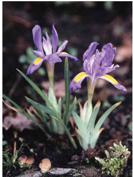
I. verna