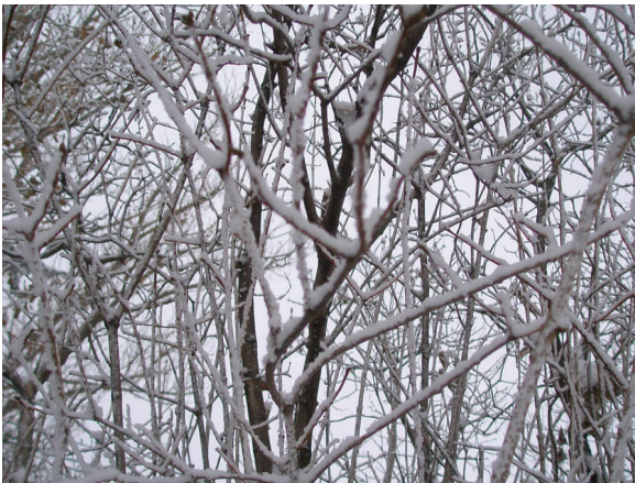
Manitoba's heavy hoar frost

In other Manitoba news, winter so far this year has been much better than last. We actually have a good snow cover at the moment. There would probably be another foot of the white mulch if not for the roller coaster temperatures in November and December. In one 48 hour period the temperature went from -43 to +1. One could almost watch the snow melting. And so it has been cold for a week or so, then warm for a few days, then