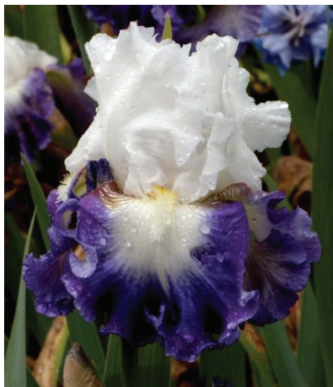
Alsea Falls, TB iris, a Schreiner 2012 introduction

Description: Alsea Falls , Schreiners 2012, 36 inches in height, mid to late season bloom, named after one of Western Oregon's most striking rivers, this iris was the cover iris on their 2012 annual iris catalogue. Alsea Falls has clean, contrasting white flaring standards atop blue-violet falls, splashed with a large, white starburst, echoing the purity of the standards. Alsea Falls , as shown is a real show-stopper with its substantial 4 1/2" x 7" flowers, each producing 6 to 8 buds. ▶