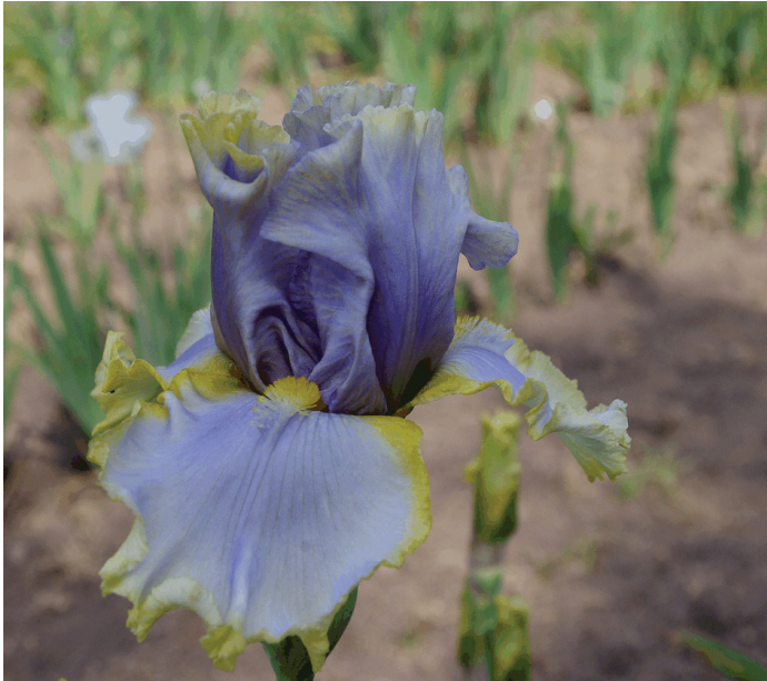
Seedling 088210 of 2008 is definitely different. Its dark lavender-blue standards shift to soft yellow hues along the laced top edges. The paler bluish falls are rimmed in traditional plicata edging of chartreuse yellow. And check the chartreuse-tipped lavender beard ! [Don McQueen digital 12941]