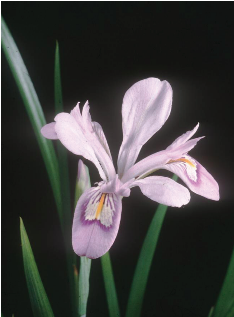
Iris speculatrix

in summer. At Kew it flourished on a peat-bed in the pyramidal Alpine House, even when temperatures occasionally fell well below 0° C, although it is not hardy outside in the U.K. Today this evergreen iris is grown in the new Davies Alpine House, as well as in large pots in a frost-free greenhouse.