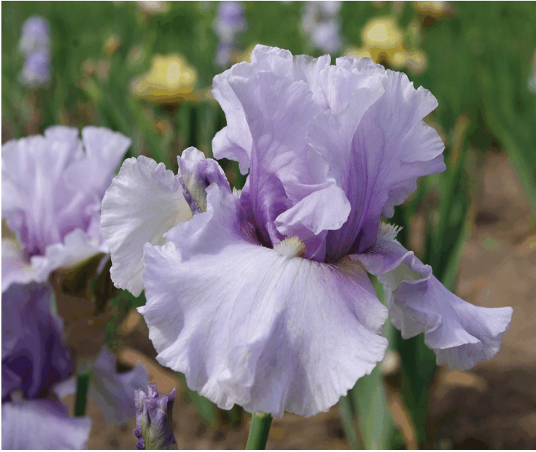
LAVENDER TWIST (seedling 078309) has dark shading in the standards similar to that of parent FOGBOUND, but the twist is in the falls, with its shades of rosy lavender paling to a milky mauve and a hint of yellow. Soft amber veining surrounds a white-tipped light yellow beard. [Don McQueen digital 12911]