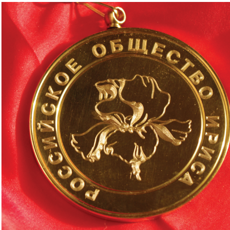
Front of Chuck's medal