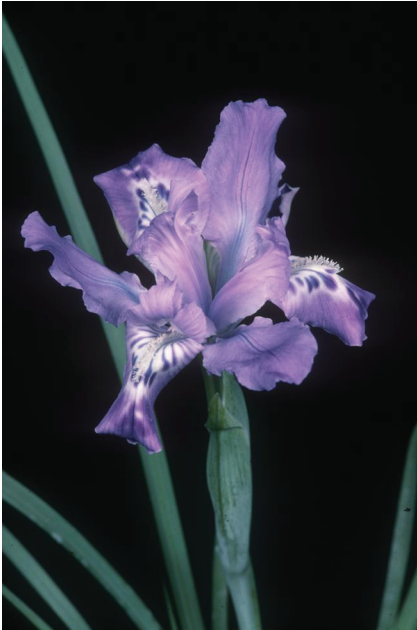
I. leptophylla

Although the species of rhizomatous section Pseudoregelia are repotted in autumn and given an initial watering, generally their pots are then best kept dry during the winter months or until the new season's leaves have developed. Molecular work has shown that the Chinese Iris narcissiflora is a member of this group, but we have been spectacularly unsuccessful in attempting to grow that rare species beyond the seedling stage. The most commonly encountered member of the section and the easiest to grow is Iris kemaonensis , widely distributed in the Himalaya. It is happy outside in a free-draining peat bed, as well as in pots plunged in a cool frame, lightly shaded in summer – rather different treatment to that afforded Iris tigridia . We grew Iris hookeriana , from the W. Himalaya, in containers plunged in a cool bulb frame with protection from winter wet, but it did not survive more than a few years. The same applied to Iris goniocarpa , almost as widespread as I. kemaonensis , and the more restricted I. leptophylla , from Sichuan and Gansu in W. China. We used a peaty/leafy, free-draining compost for these three Himalayan/Chinese species. There is