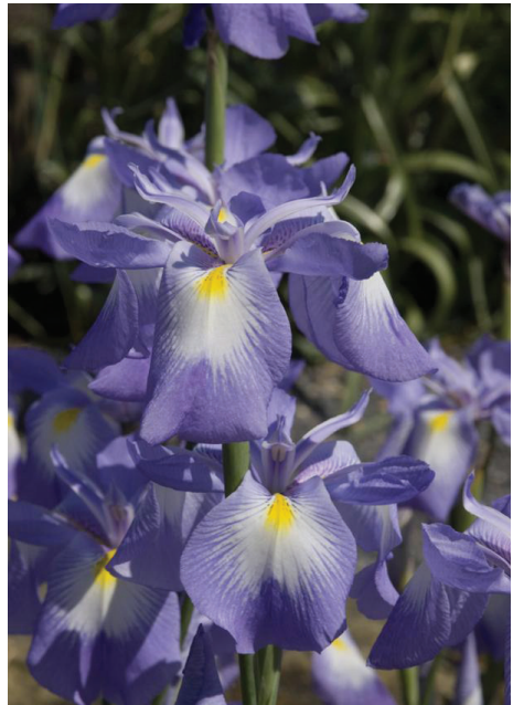
Iris cycloglossa

Iris cycloglossa , described by the late Per Wendelbo in 1959, and firmly established in specialist collections from a gathering made by Wendelbo, Hedge & Eckberg a decade later, is considered a primitive and divergent member of subgenus Scorpiris . It is an outstanding species outside, increasing well from offsets and, on Kew’s Rock Garden, about 70 cm tall with up to 9 carnation-scented flowers, 10 cm across; when pot grown it is not so vigorous, producing at most 5 flowers per stem.