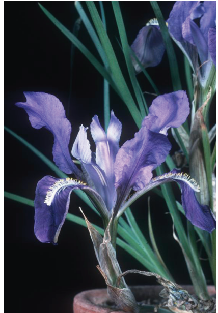
Iris tigridia

Another subject for ‘long-tom’ clays and high potash feeding under the All-weather frame is Iris masia , of series Syriacae , although in sheltered areas this species and its more robust relative I. grant-duffii will survive and flower outside – planted against a south-facing wall on well-drained soil. DNA studies suggests that this small group, with stout, vertical rhizomes and terminal bulb-like buds, has evolved from that other Asian dryland rhizomatous group, series Tenuifoliae . We have just flowered Iris tenuifolia itself here at Kew for the first time and I observed that, as with I. anguifuga of the same series, and also members of the Syriacae , it has stamens with distinctive broad filaments much shorter than