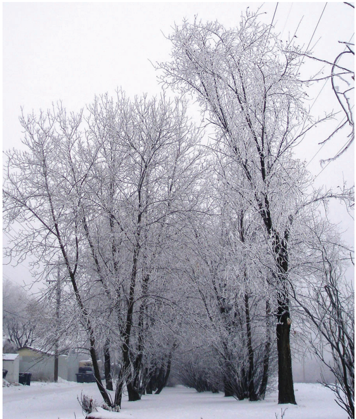
Hoar frost makes a Winter Wonderland