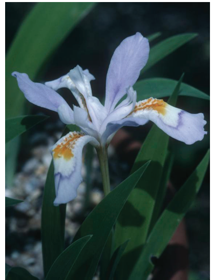
I. cristata

Iris cristata exhibits characters that should place it with the bearded/crested alliance (it is traditionally a member of section Lophiris), yet preliminary DNA results position it, with its close relative I. lacustris , as sister to the whole beardless, uncrested alliance, ▶