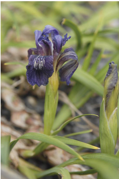
Iris aff. clarkei (species nova)

Although one does not generally consider bulbous irises as being suitable for shade and moisture, Iris latifolia produces its foliage in spring and hails from damp grassy montane places, so makes an attractive woodlander, but it is equally at home in a moist sunny spot. Subgenus Xiphium , to which it belongs, has probably evolved from the rhizomatous series Spuriae , a theory strongly supported by flower morphology and molecular studies.