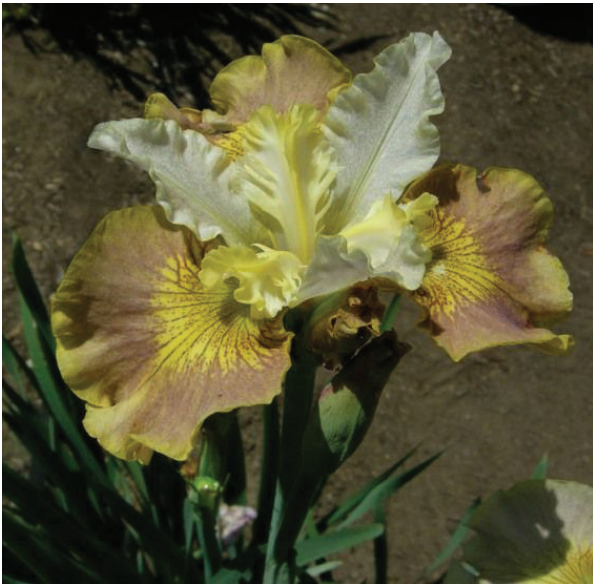
Earthstar, a Siberian iris, 2012 Schafer/Sacks introduction

flowers have great form with ruffles in all parts. Falls open a hard-to-describe but lovely blend of red-violet and soft yellow. At the signals and edges the yellow stands alone. Standards are cream, and pearly styles have yellow midribs and tips. Flowers vary in intensity and composition depending on weather conditions - all variations are beautiful. Many strong upright stalks with four to six buds each. Seedlings going back to Jack's Health and Strawberry Social, Dandy's Hornpipe, a sib to Book of Secrets, Riverdance and a sib to Salamander Crossing.