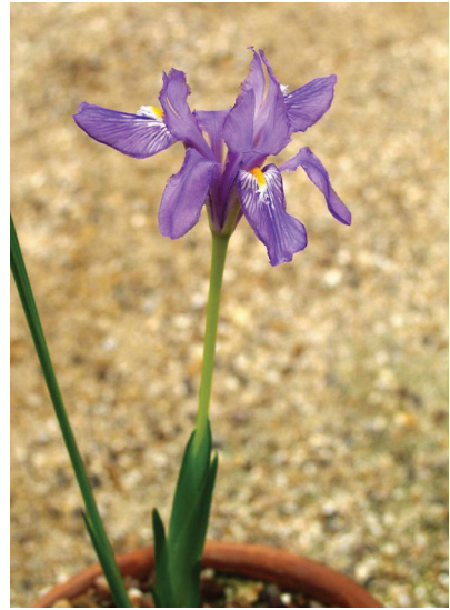
Iris barbatula