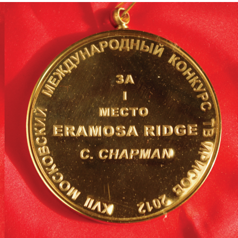
Back of Chuck's medal