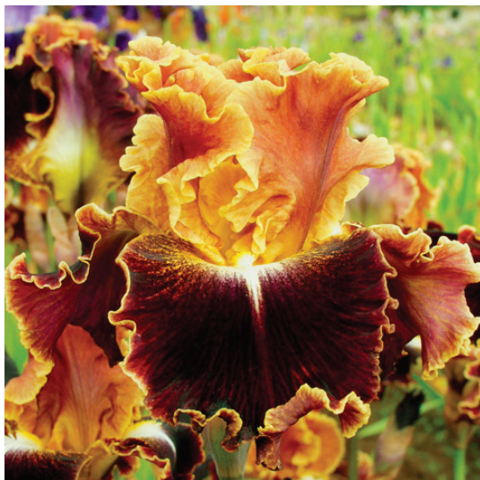
Volcanic Glow; Keppel 2012, a TB iris, again a luminata color pattern

Description: Volcanic Glow , Keith Keppel 2012, 34 inches height, midseason bloom. All that's missing is the smell of brimstone! Smoky, smoldering hot luminata, with aureolin. yellow standards flushed brownish red in the centre portion. Zanzibar red falls, with velvety wash overall, carry a narrow aureolin edge, while the white hot heart is edged bright golden lemon. Beards are also golden lemon. Ruffled, with terminal and three branches up to eight buds. (Montmartre X Lip Service)