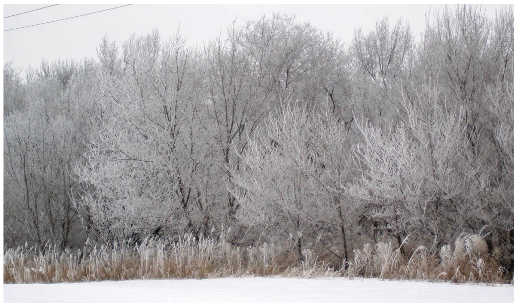
More and more hoar frost