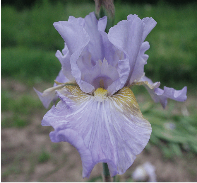
MARE'S TAILS (seedling 074109 STRE) struts its stuff with extensive white streaking radiating over light blue falls and shoulders of tan and yellow. The 'tails', reminiscent of a summer sky before a rain, its distinctive shoulders, and the clear, sky-blue standards with darker bases and ribs, produce a subtle contrast in appearance.