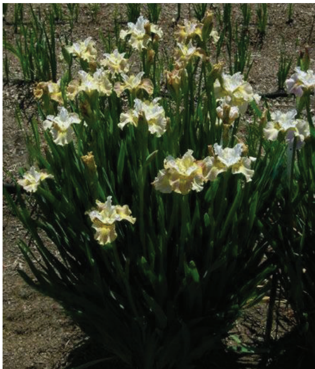
...a beautiful clump of the Siberian iris Earthstar .

The plants I received were decent divisions of the various Siberian varieties that I ordered. Now these are springtime divisions so they were not quite as substantial and mature as those from a fall division with a whole growing season on them. This observation is based on the fact that I have previously received both types of Siberian deliveries, spring and fall. Possibly this is a factor that may have made the plants a little more fragile to transplant/manage. Spring division and transplanting of Siberians is considered normally optimal so the plants can grow and develop the whole growing season. Autumn delivery and planting is another option, the downside of Autumn planting is that the plants may not have enough time to become established properly to survive the winter and that subsequent springtime heaving of the plants from the ground is very likely.