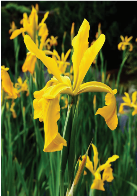
Iris xanthospuria