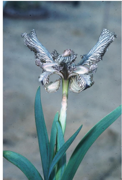
Iris nectarifera (Media Resources, Kew)

My best attempt at growing Regelia irises (subgenus Iris ) – arillate species with usually 2, rarely 3, flowers per stem and a beard on both falls and standards – was in a deep railway-sleeper bed, abutting a warm south-facing wall in the Alpine Nursery area; a hinged rigid-plastic roof came into play only in heavy rain, rhizomes were planted in an exceptionally sandy mix and the collection was fed/watered from below via a 'leaky-hose' system. Vigorous and spreading species, such as Iris hoogiana and the aptly named I. stolonifera , along with Regelio-cyclus hybrids, increased and bloomed particularly well...until parts of the old nursery, including this ad hoc frame, were demolished during redevelopment. We still grow those species, along with Iris korolkowii , I. lineata and I. afghanica , but in deep pots which, although satisfactory for the more compact species, just don't do the stoloniferous ones justice. It is worth trying tall, stately Iris hoogiana in the open, especially near a warm wall, in a sheltered garden on sandy soil.