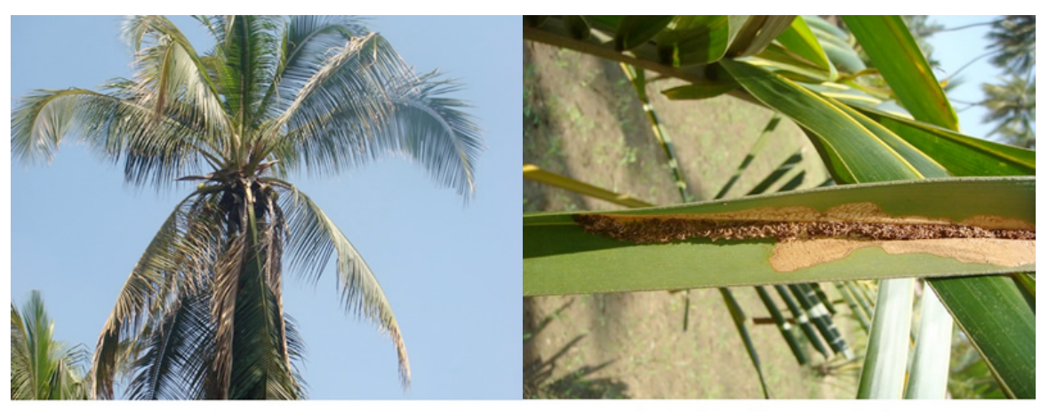
3 to 4 youngest leaves remain green at the centre

Damage symptoms: Dried up patches on leaflets of the lower leaves. Galleries of silk and frass on underside of leaflets.