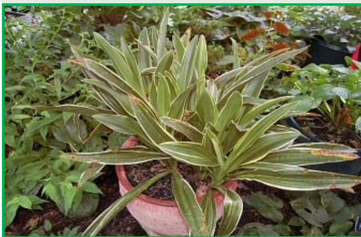
R. Go DaiShu 2010

Rohdea and Hosta are taxonomically, closely related. Rohdea is even more closely related to Aspidistra , Convallaria , Polygonatum and Sansevieria .